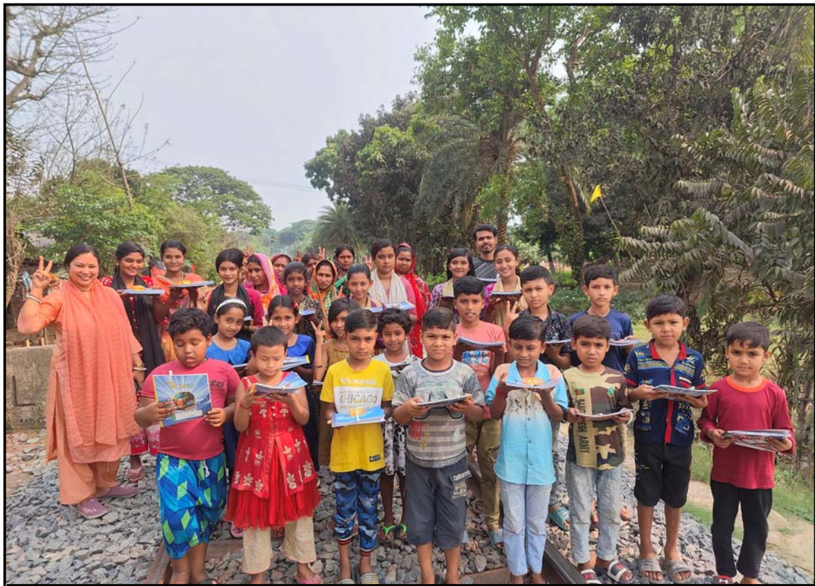
Churmanakati students with the materials...