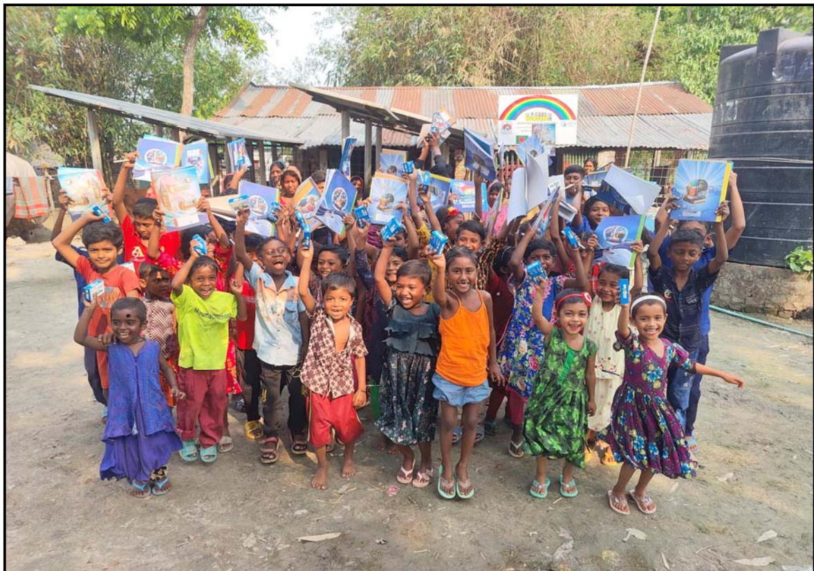
Jogahati students with the materials....