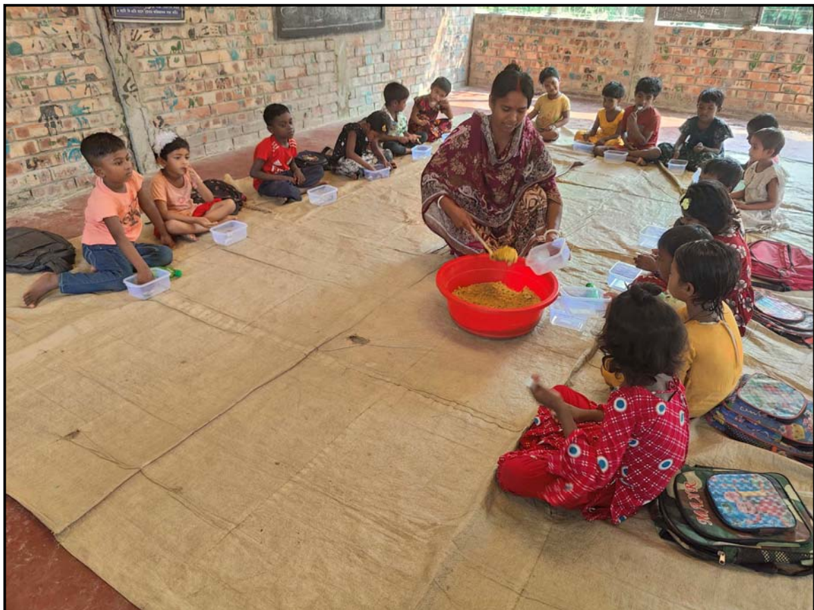
Khichury distribution at pre-school class...