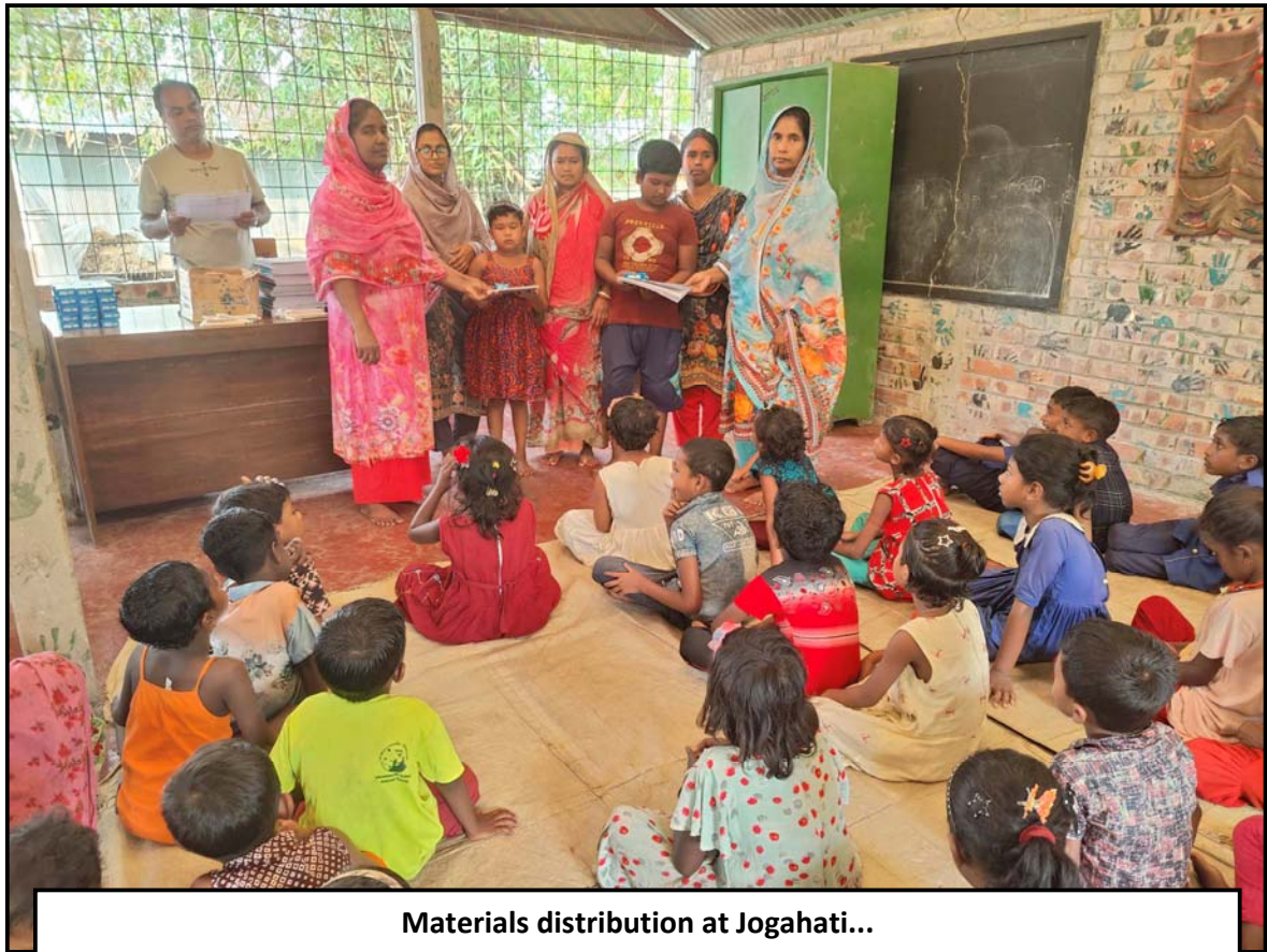
Materials distribution at Jogahati...