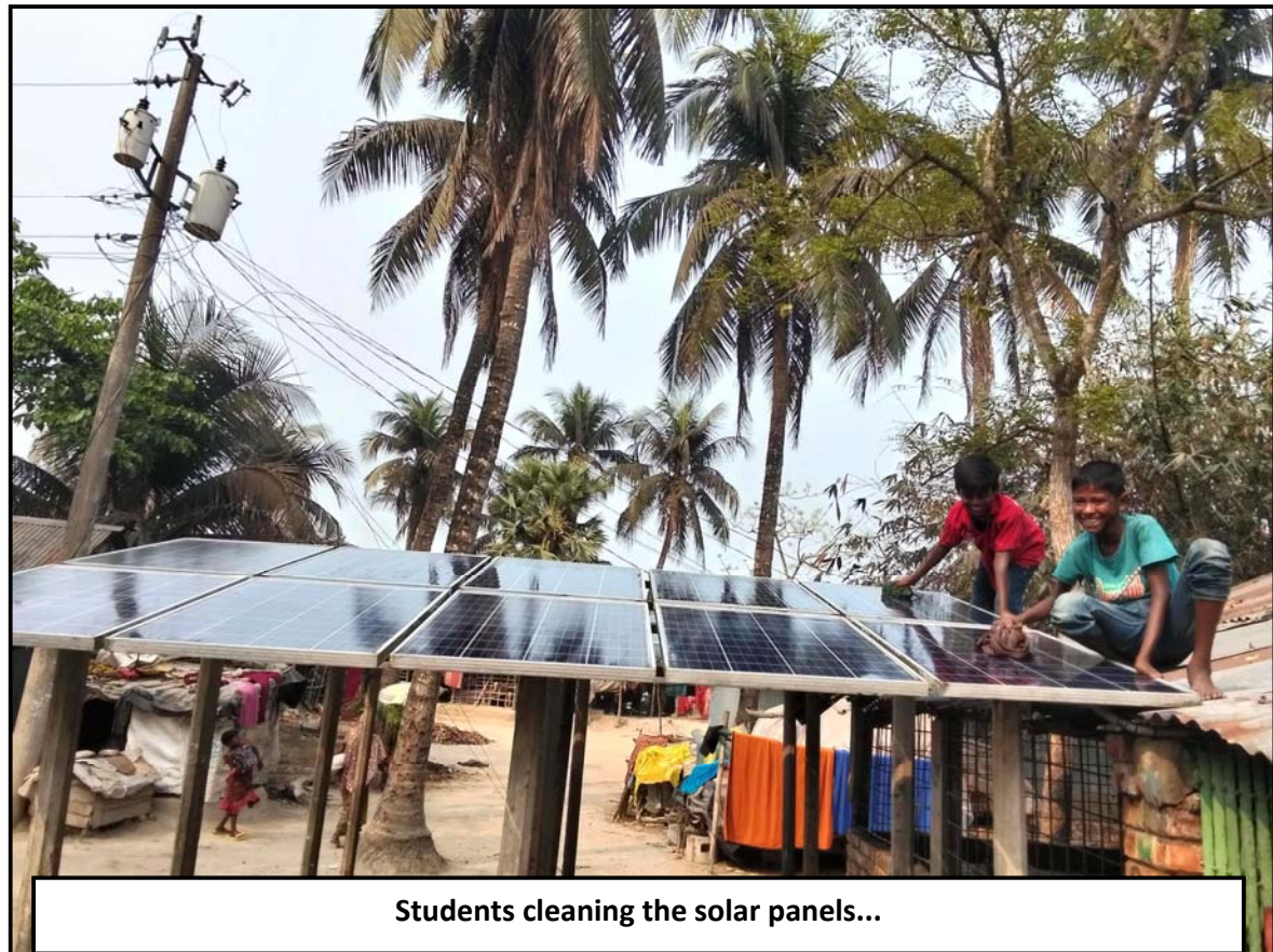
Students cleaning the solar panels...