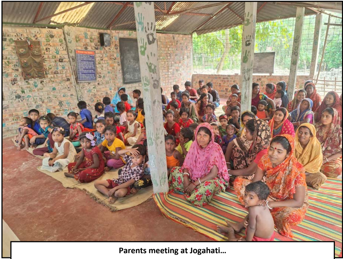
Parents meeting at Jogahati...