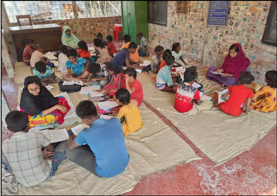
Tuition class at Jogahati...