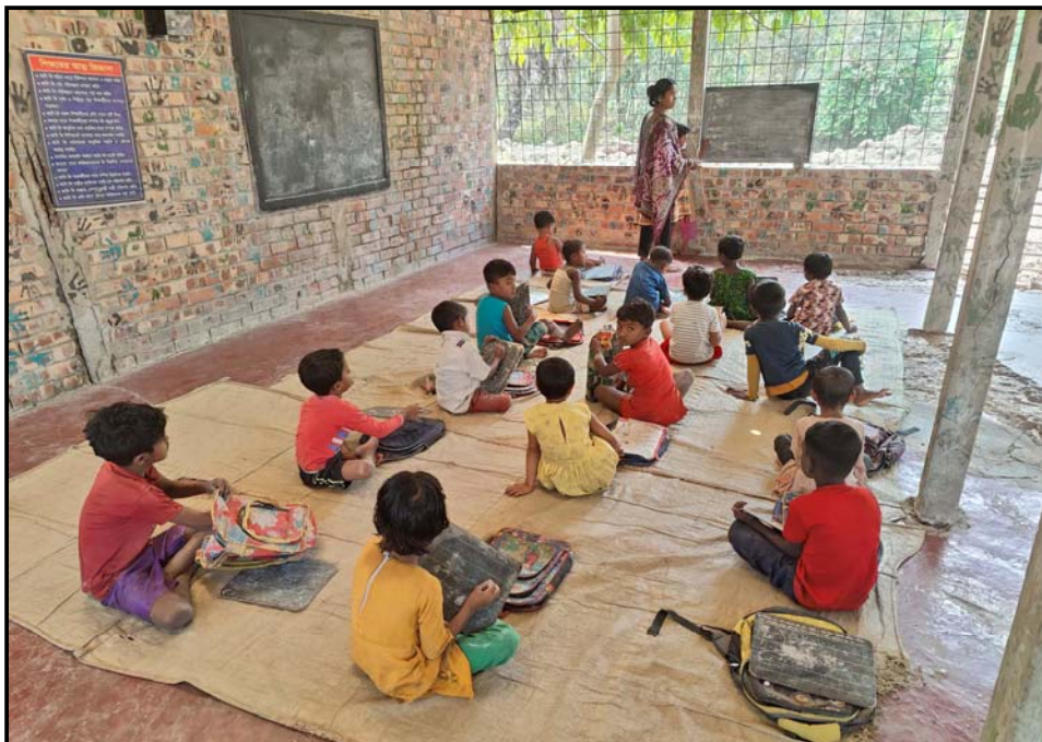
Pre-school class at Jogahati....