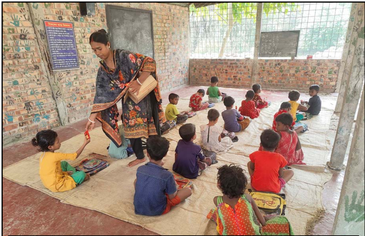
Biscuits distribution at the pre-school...