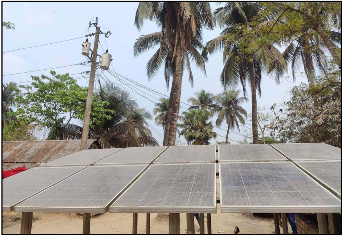
Regularly we clean the dust of the solar panels...