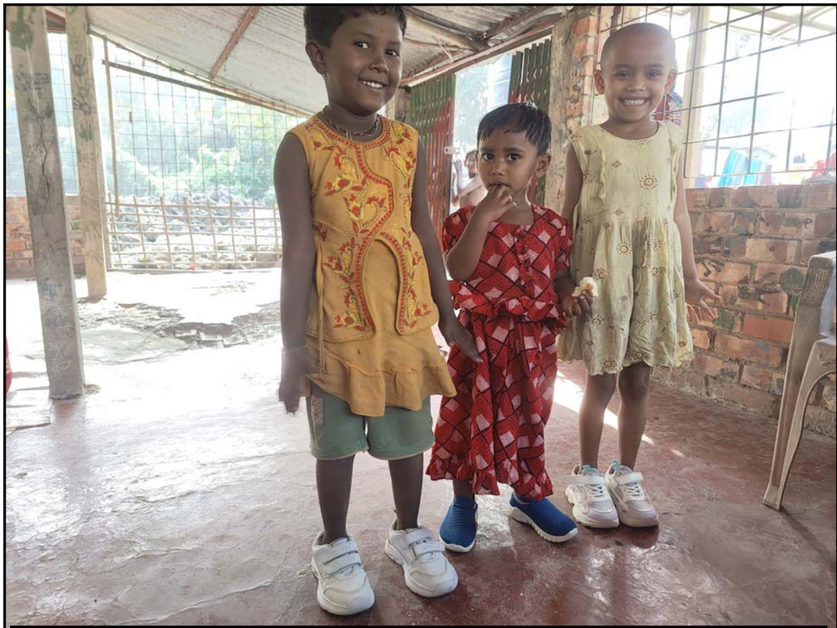
3 students received shoes...