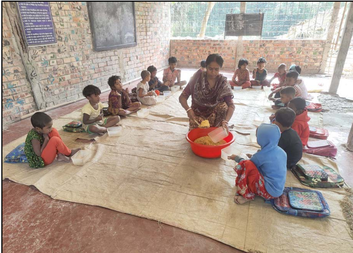
Pre-school students receiving warm meal at class...