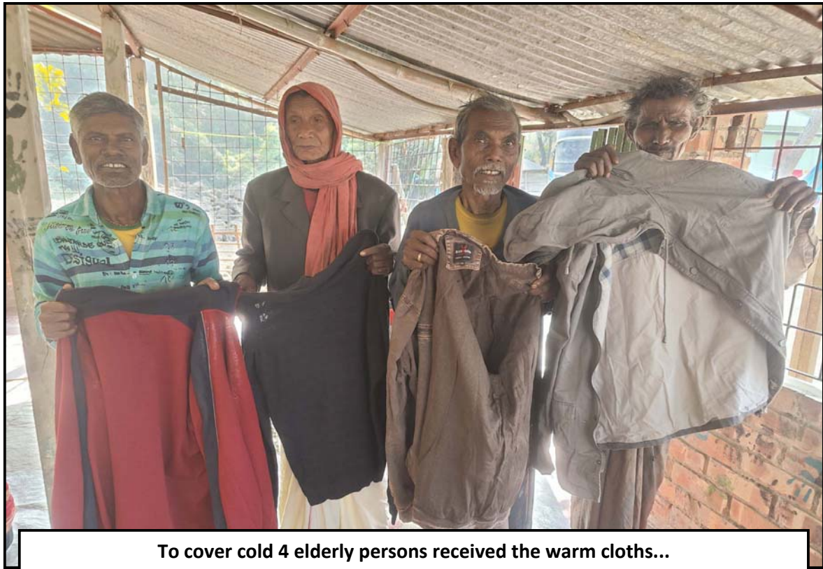
To cover cold 4 elderly persons received the warm cloths...