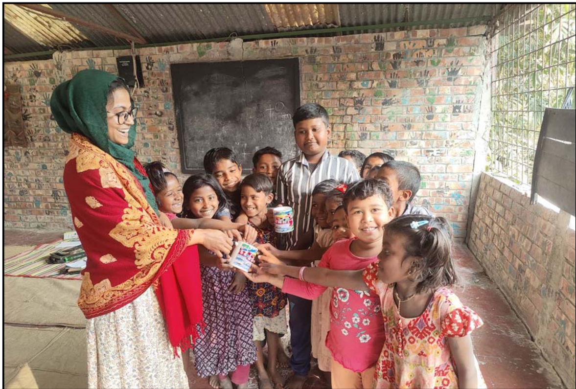
Jogahati teacher and student received mugs. The mugs printed with their Christmas greeting cards drawings as an award for their achievement....