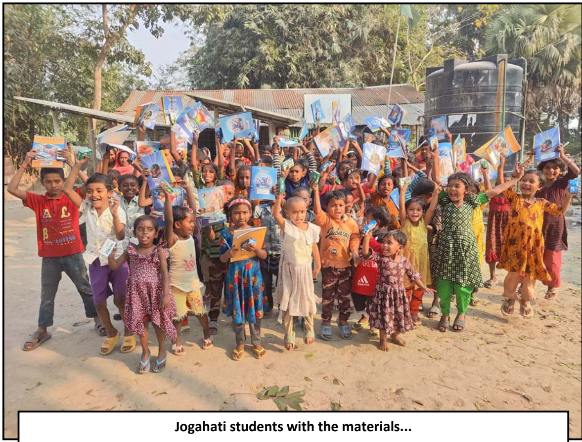
Jogahati students with the materials...