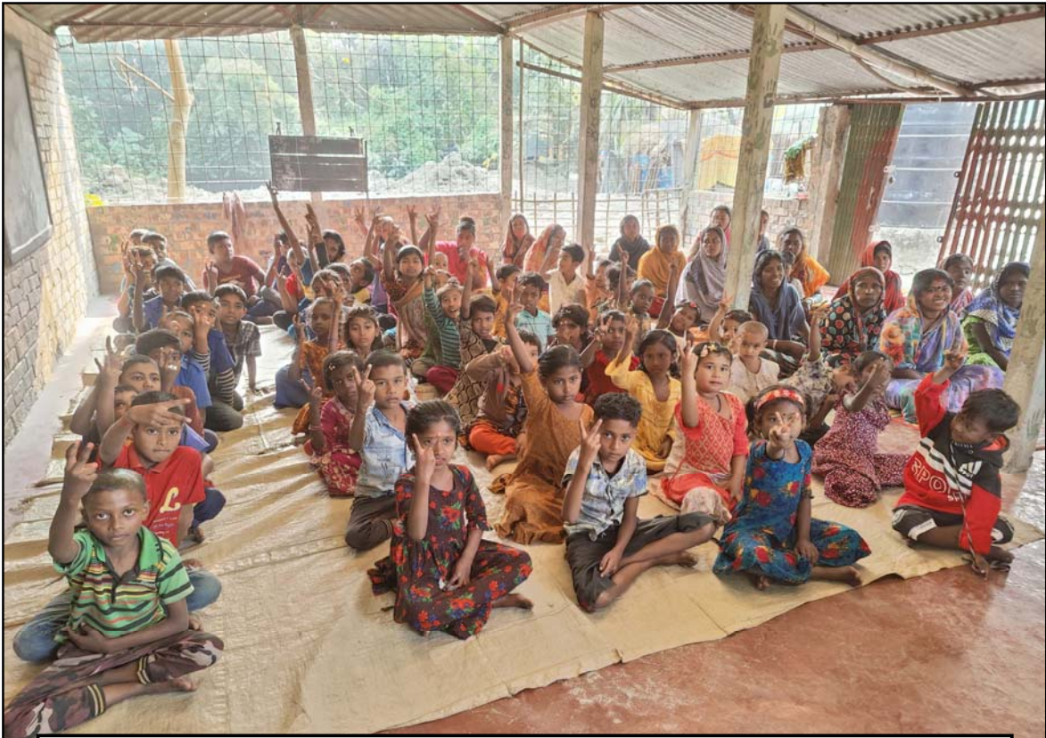
Parents meeting at Jogahati village...