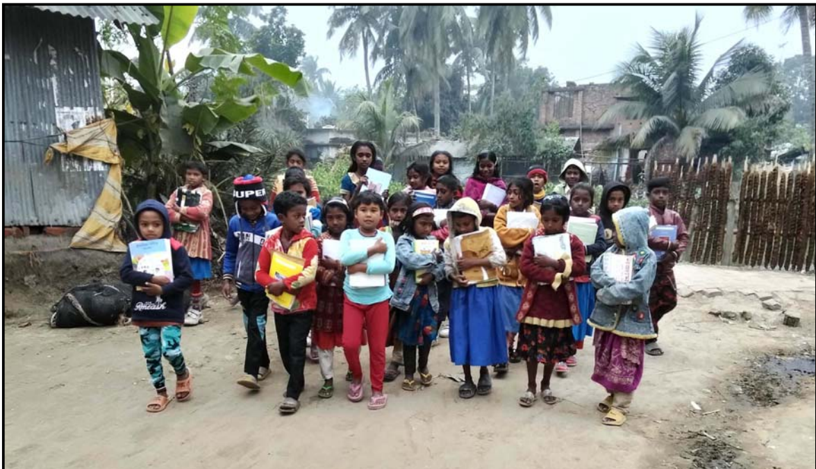
Students going to tuition class...