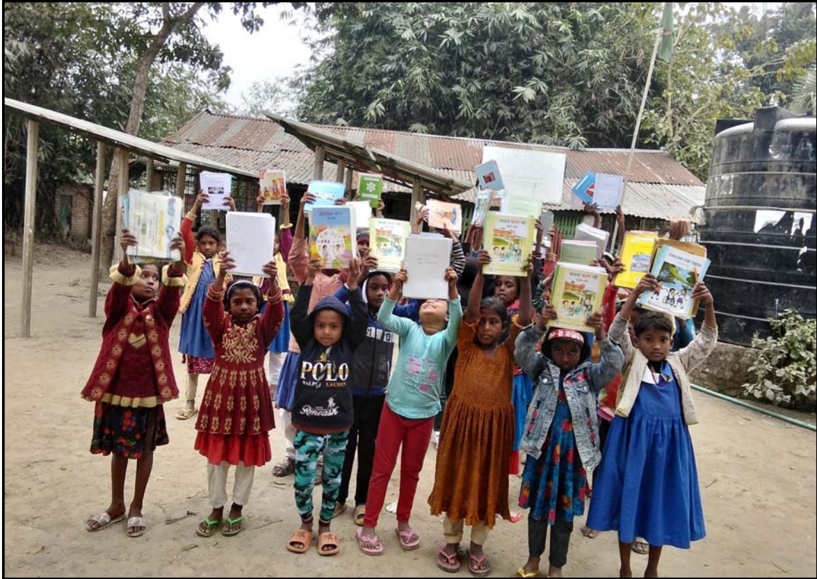
Happy students with new class and new books.