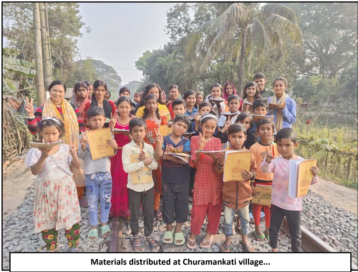
Materials distributed at Churamankati village...