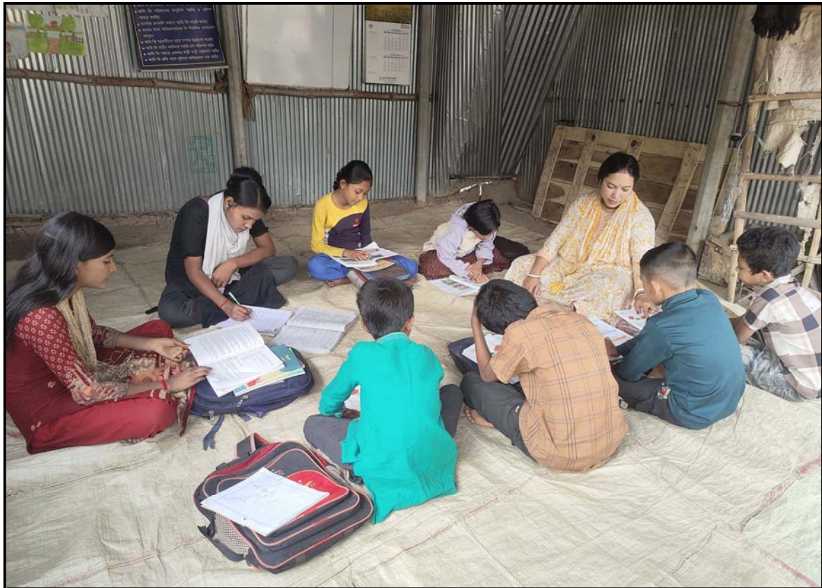
Churamankati students at Tuition Class...