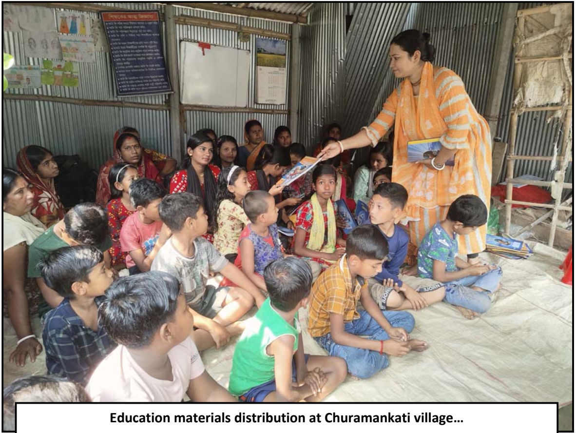
Education materials distribution at Churamankati village...