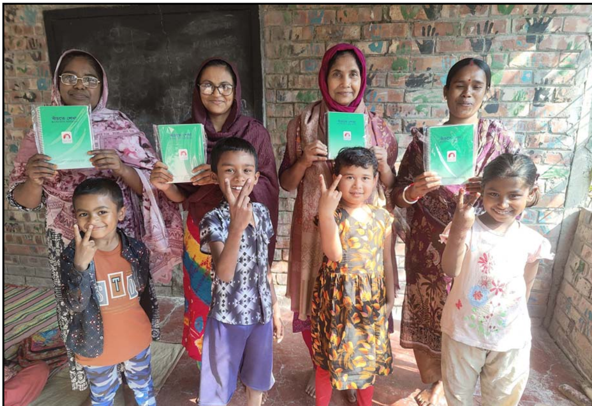
Teachers received notebook for daily tuition notes...