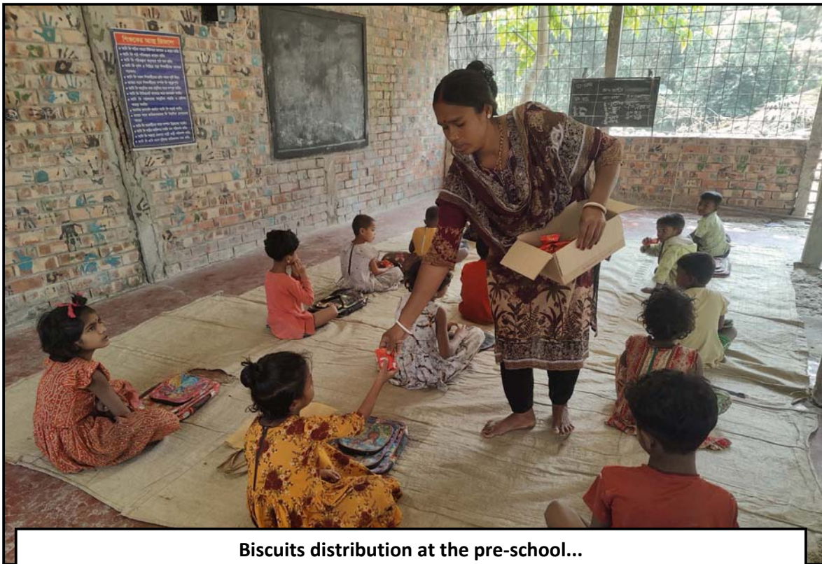
Biscuits distribution at the pre-school...