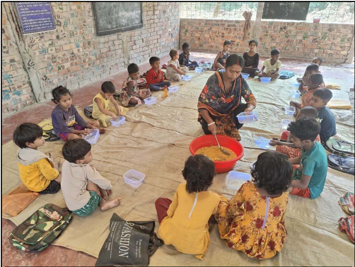
Khitchury distribution at pre-school class...