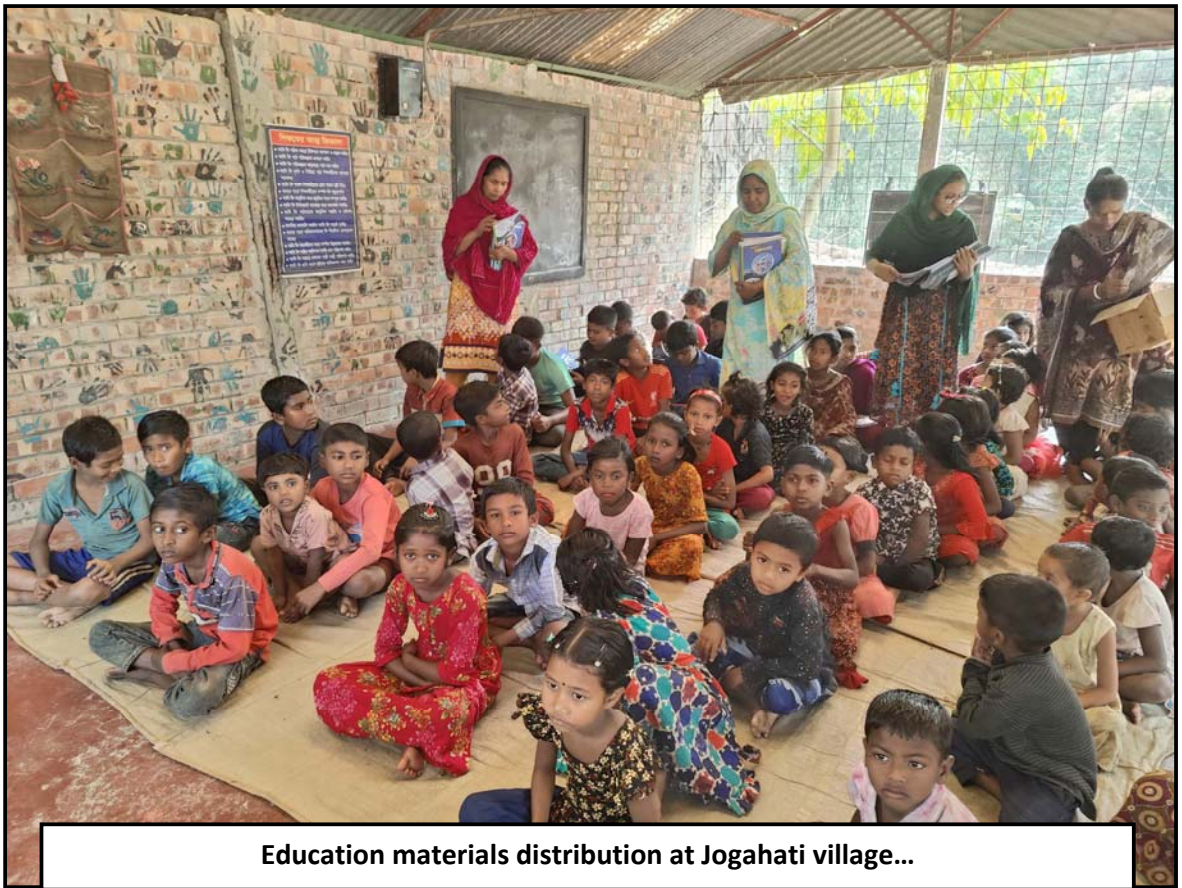
Education materials distribution at Jogahati village...