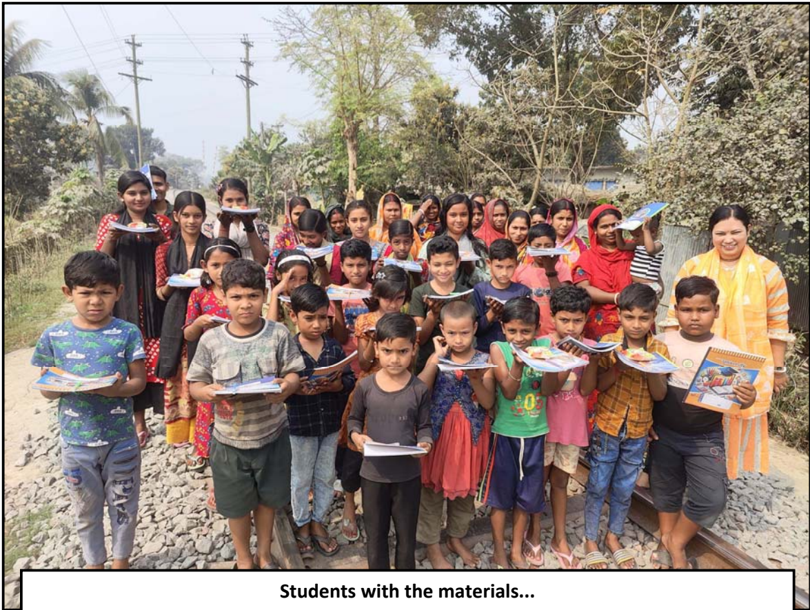
Students with the materials...