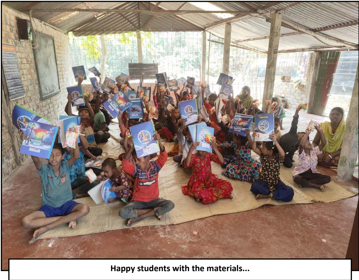
Happy students with the materials...