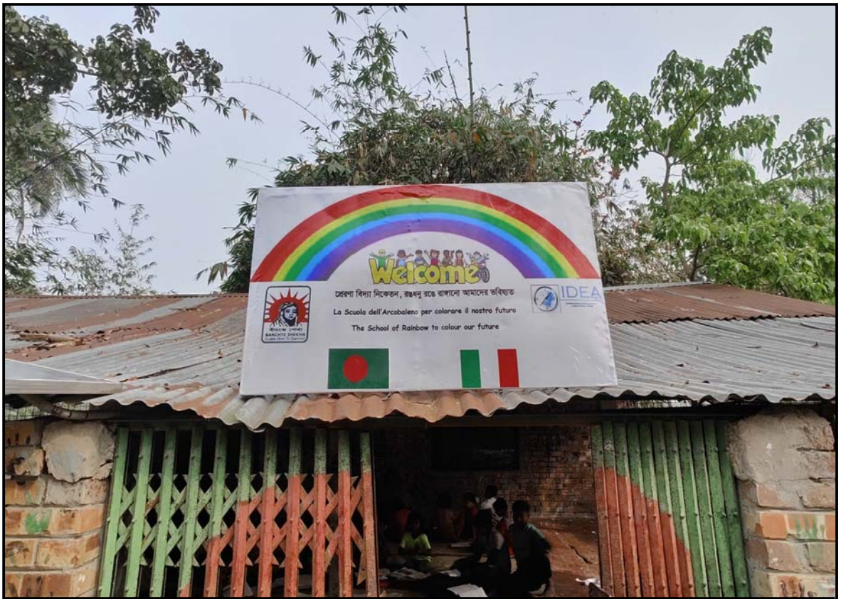
The old signboard was broken; we changed the signboard of the school...