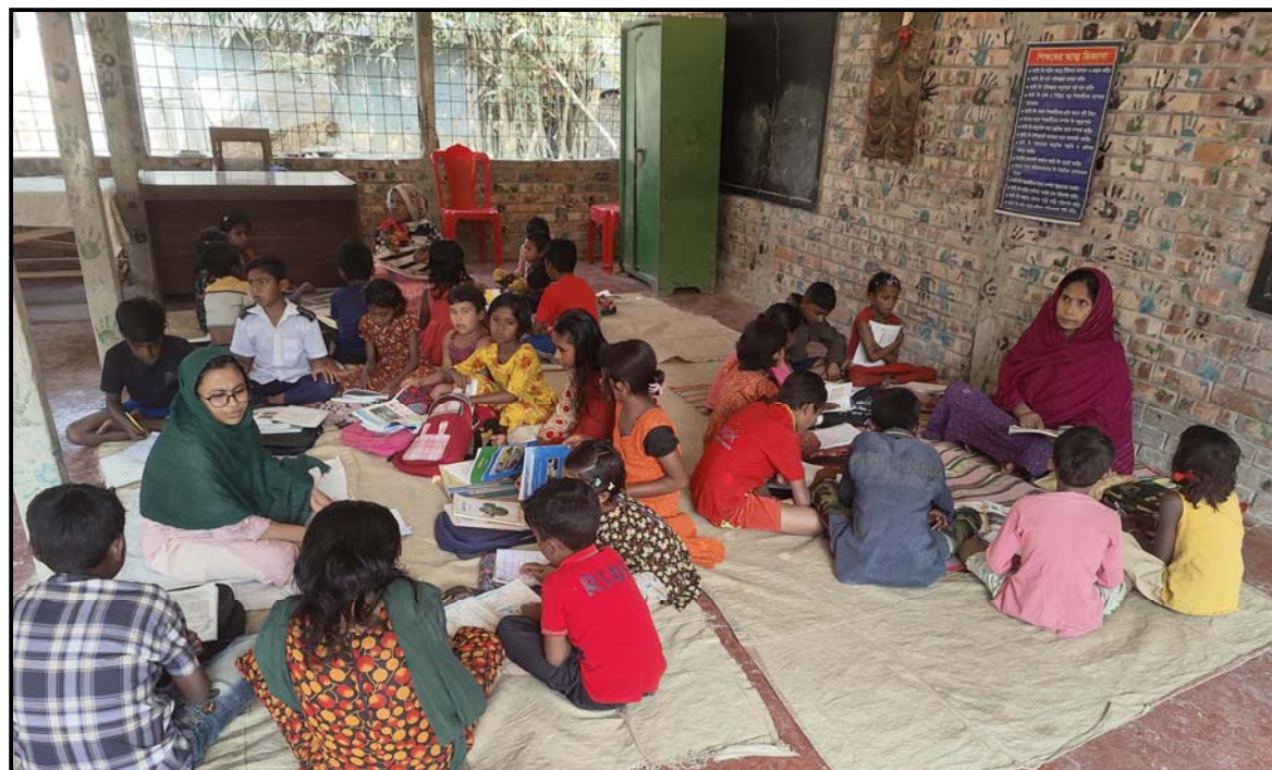
Tuition class at Jogahati....