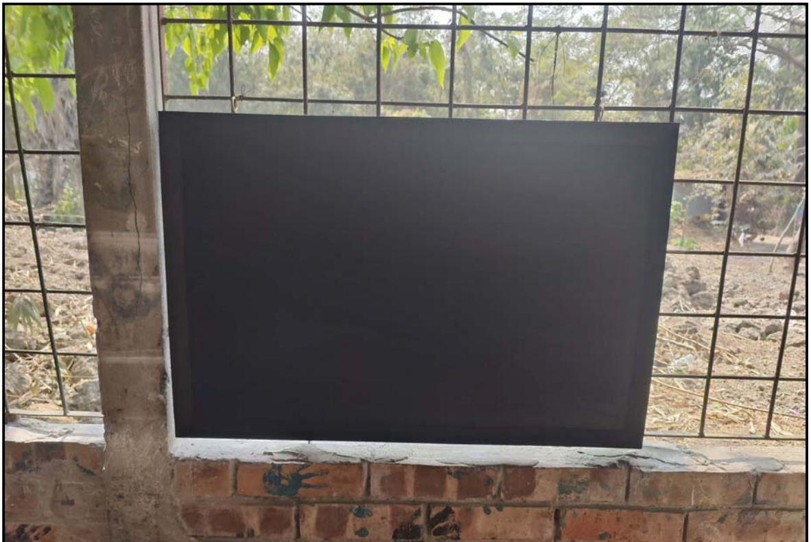
The black board was broken, so we made a new one....