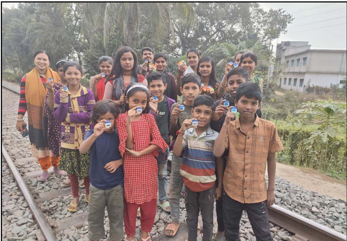
Churamankati students received winter care cream...