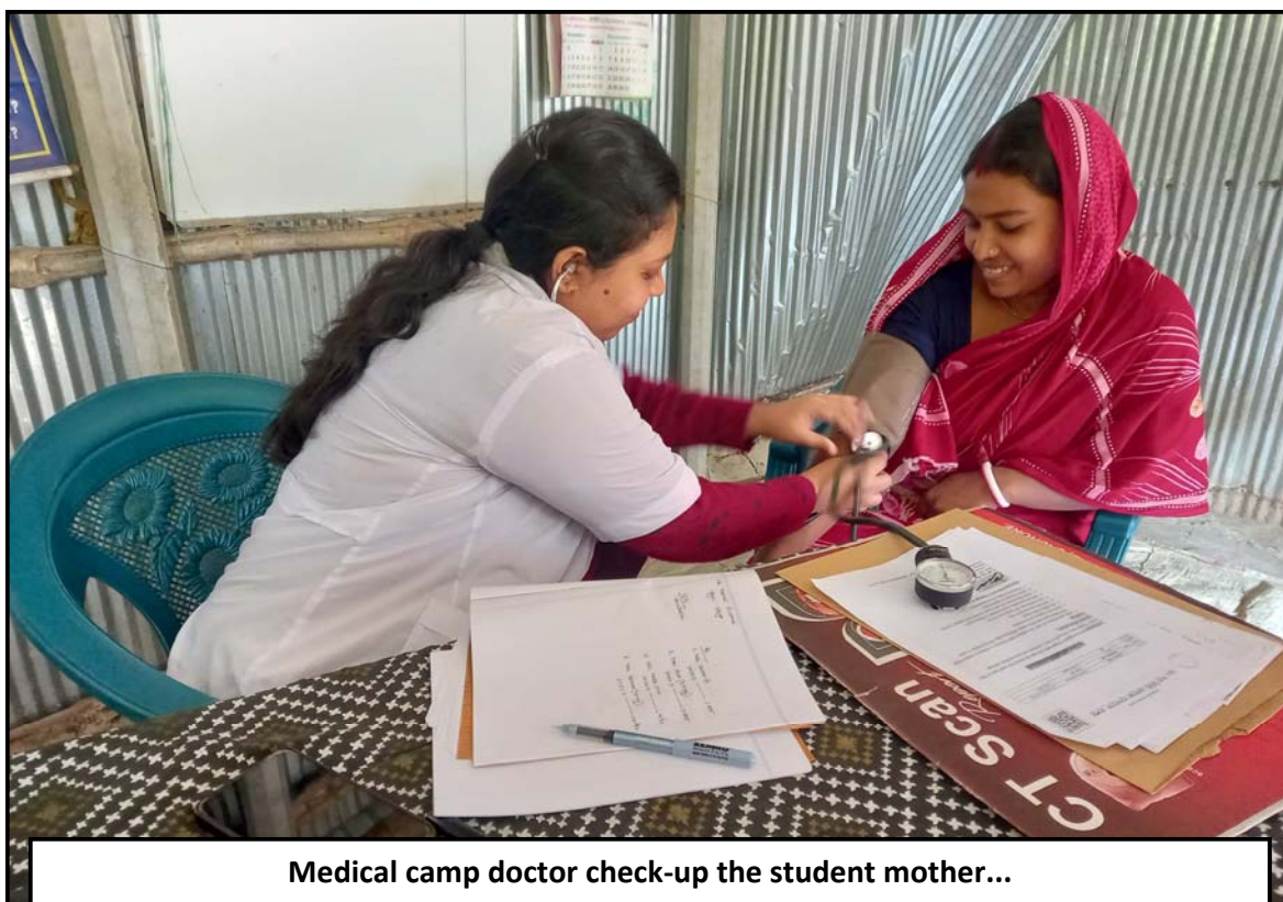
Medical camp doctor check-up the student mother...