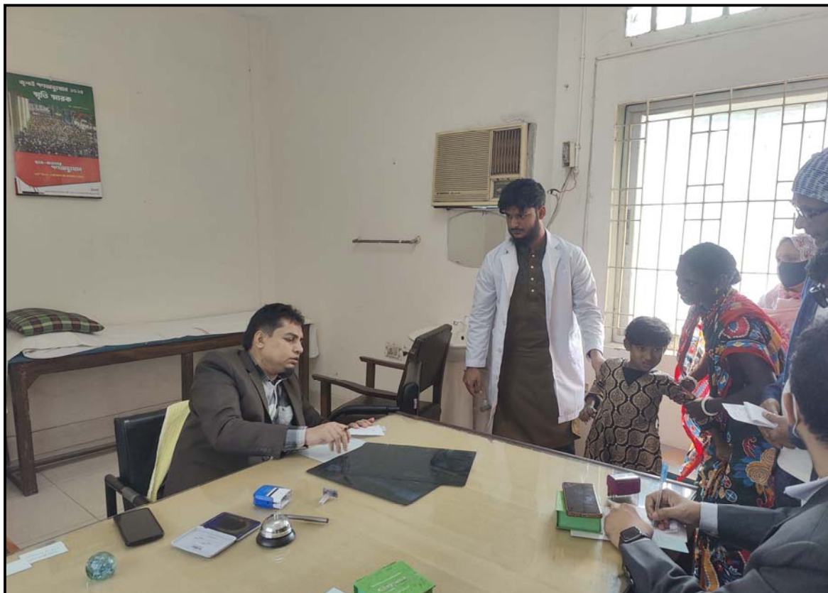
In medical camp, we found a girl with broken leg, immediately sent to hospital for plaster. Jashore Hospital medical officer checking her condition.