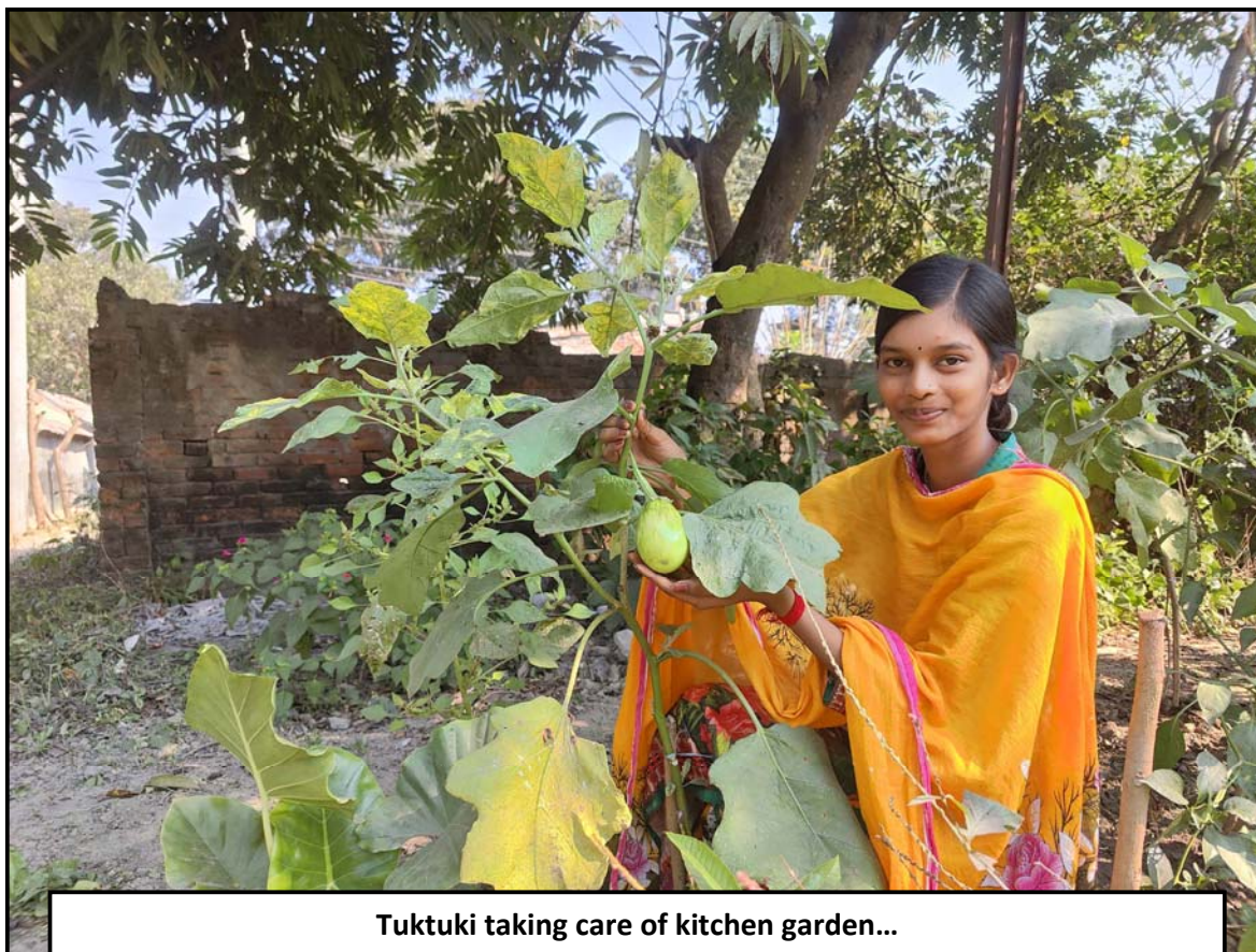
Tuktuki taking care of kitchen garden...