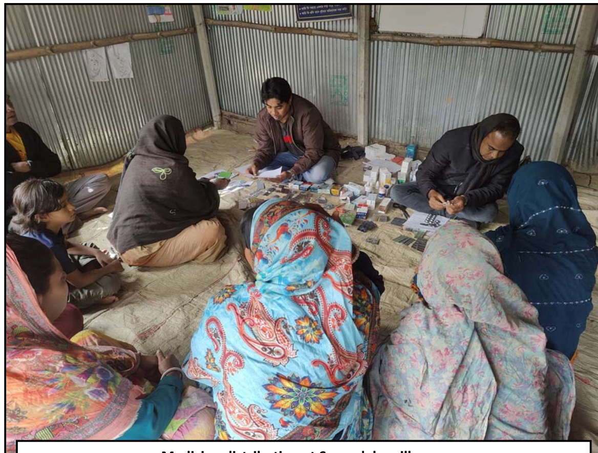
Medicine distribution at Sorupdaho village...