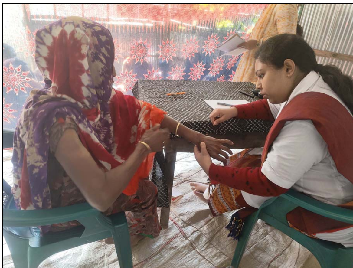
Medical camp at Churamankati village...