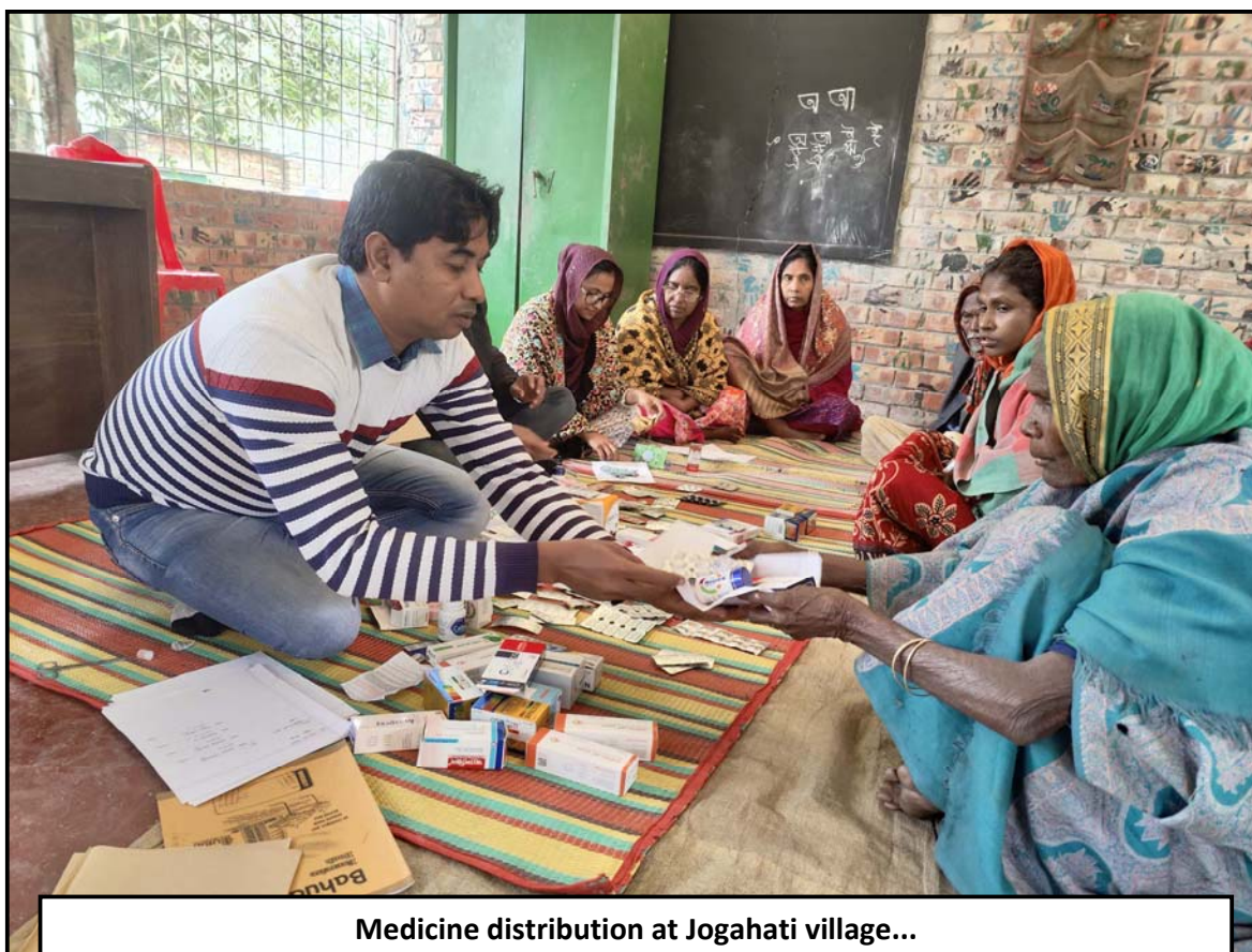
Medicine distribution at Jogahati village...