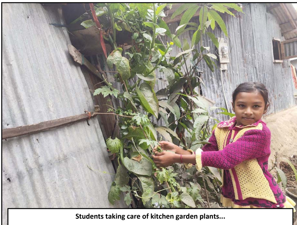
Students taking care of kitchen garden plants...