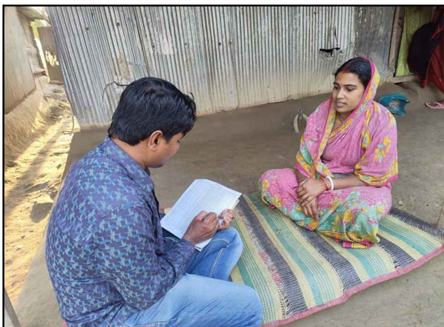
Before medical camp we conducted door to door health screening....