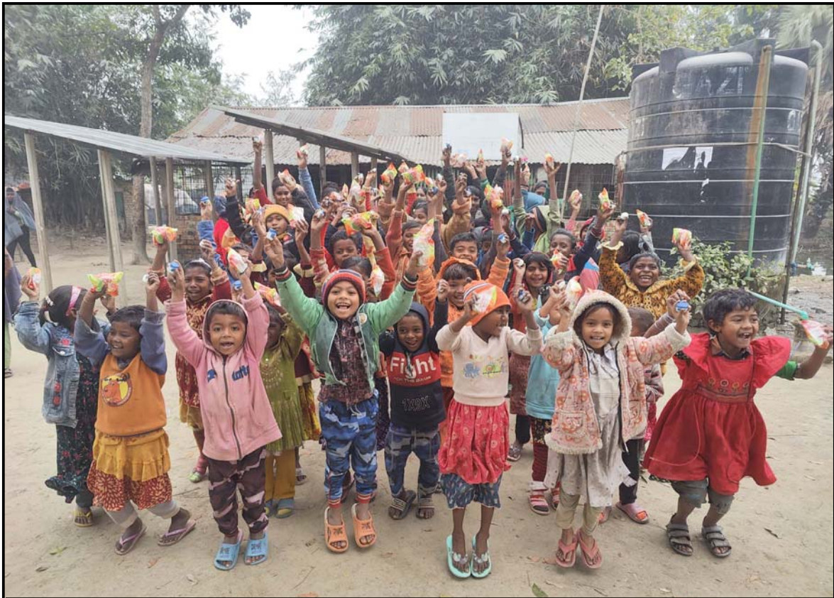
Jogahati students with the materials...