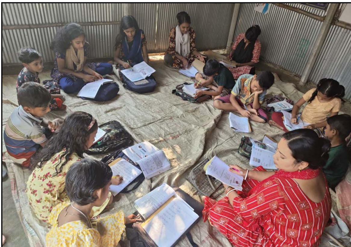
Tuition class at Churamankati village...