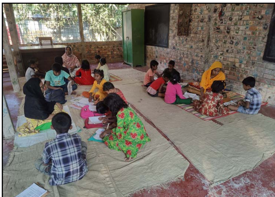
Tuition class at Jogahati village....