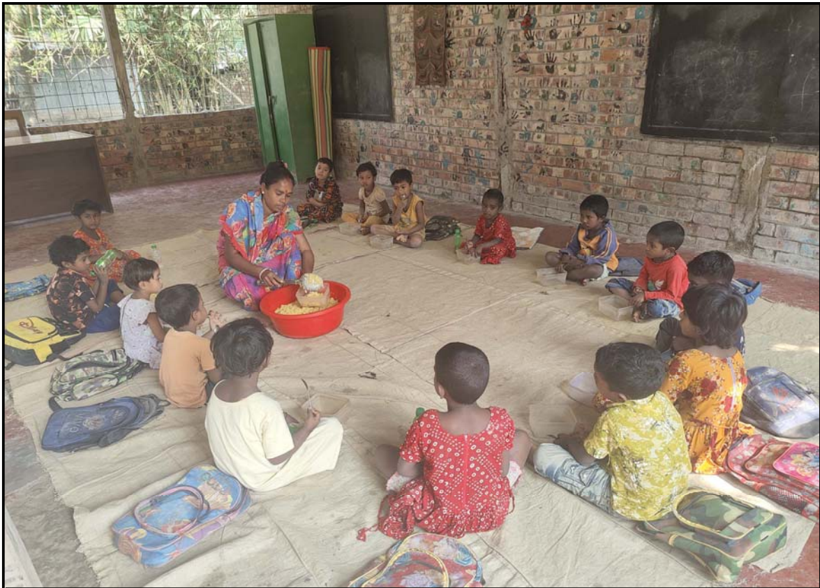
Every class day children get the tiffin...