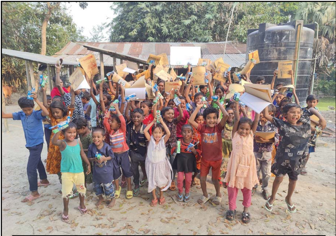
Happy students with education materials...