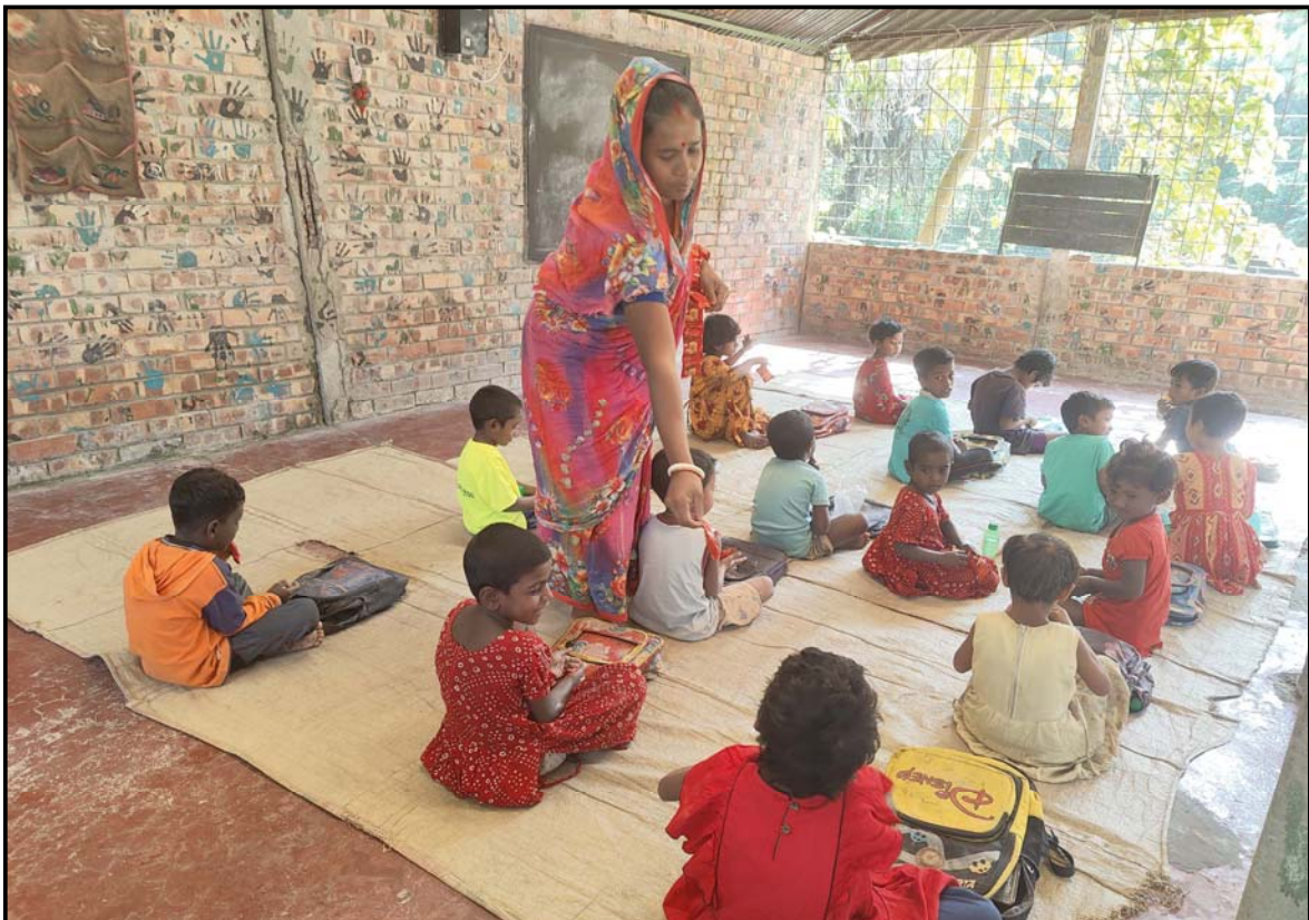
Distribution of the biscuits...