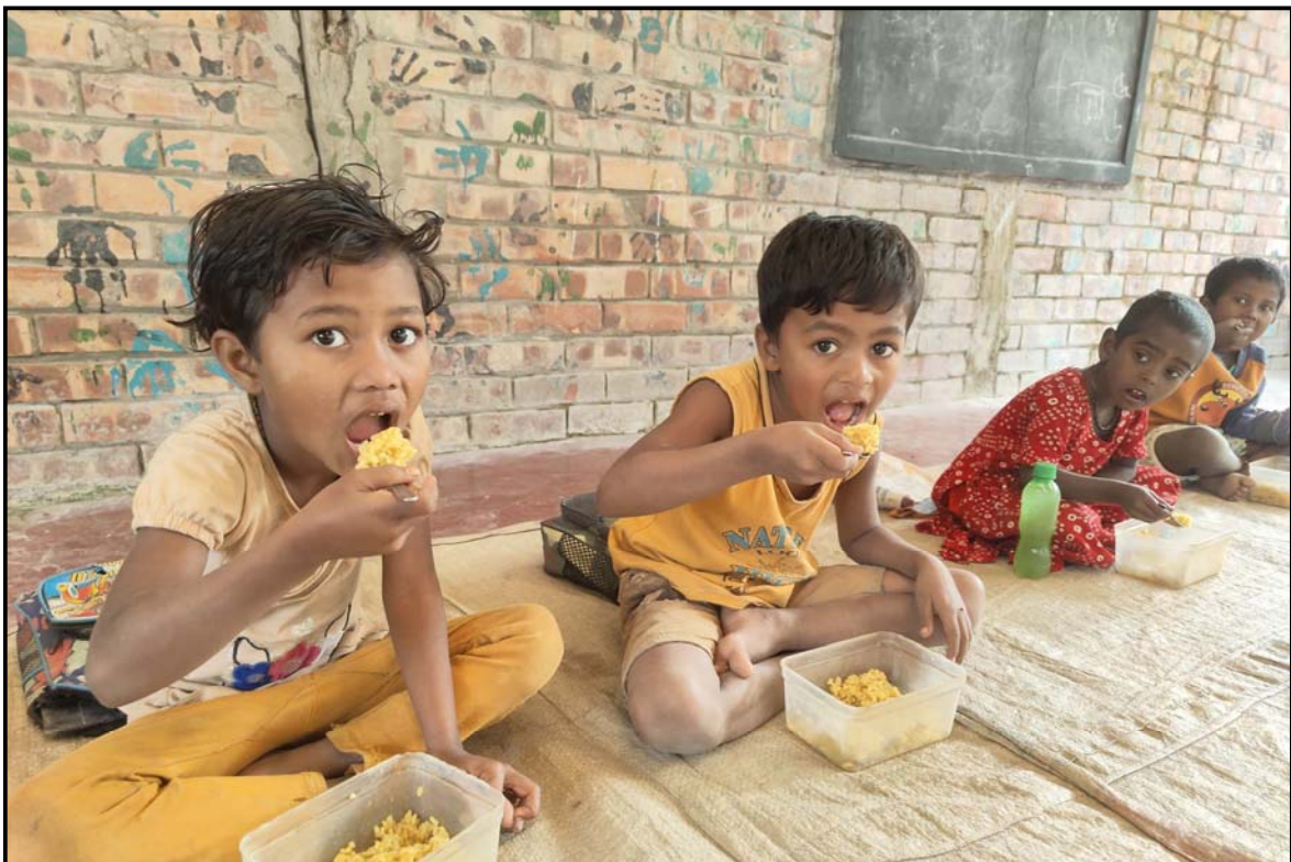
Preschool students enjoying the meal...