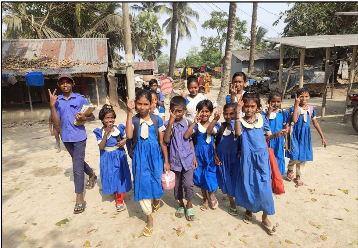
Students going to nearest local school...