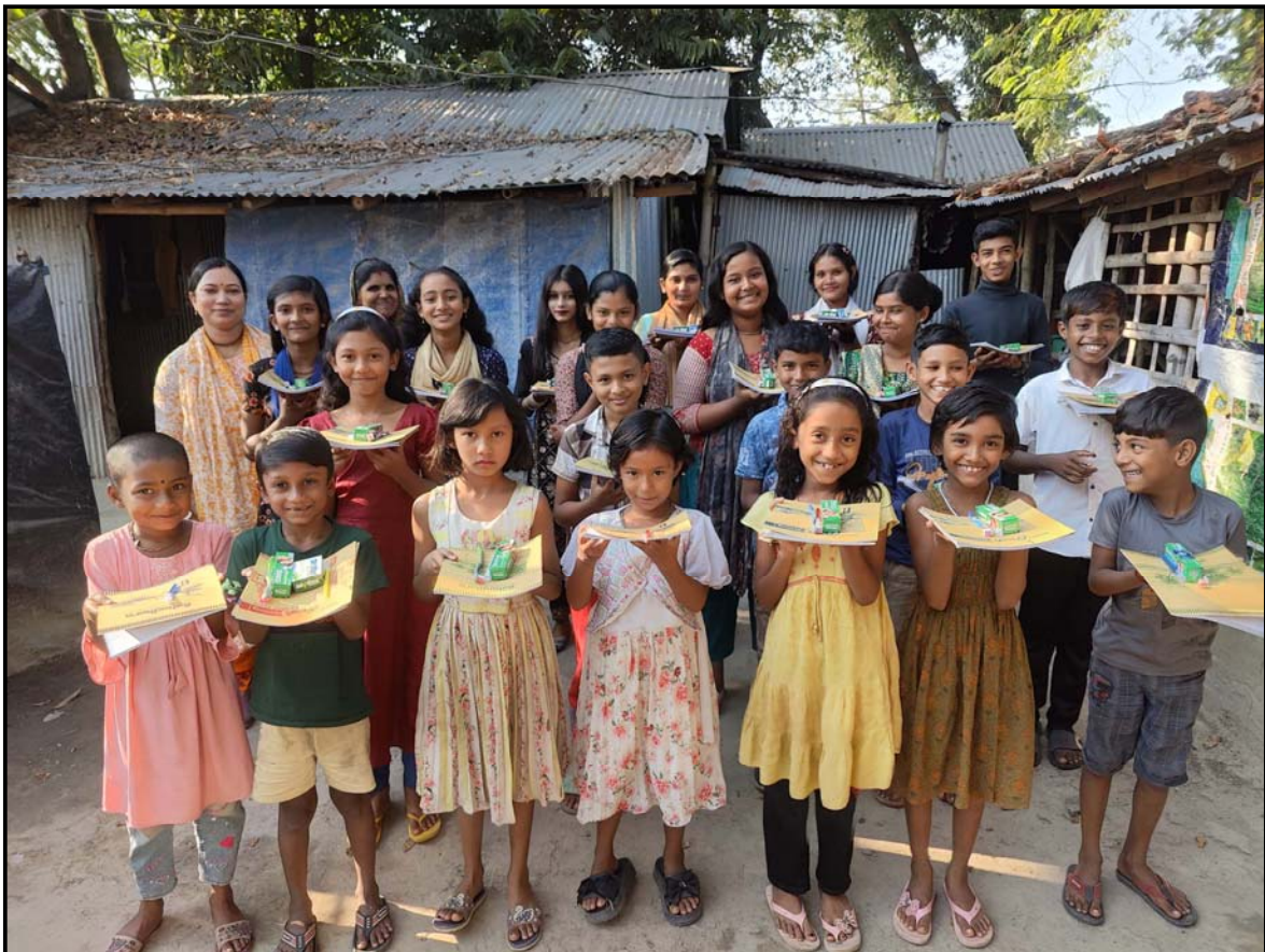
Churamankati students with the materials...