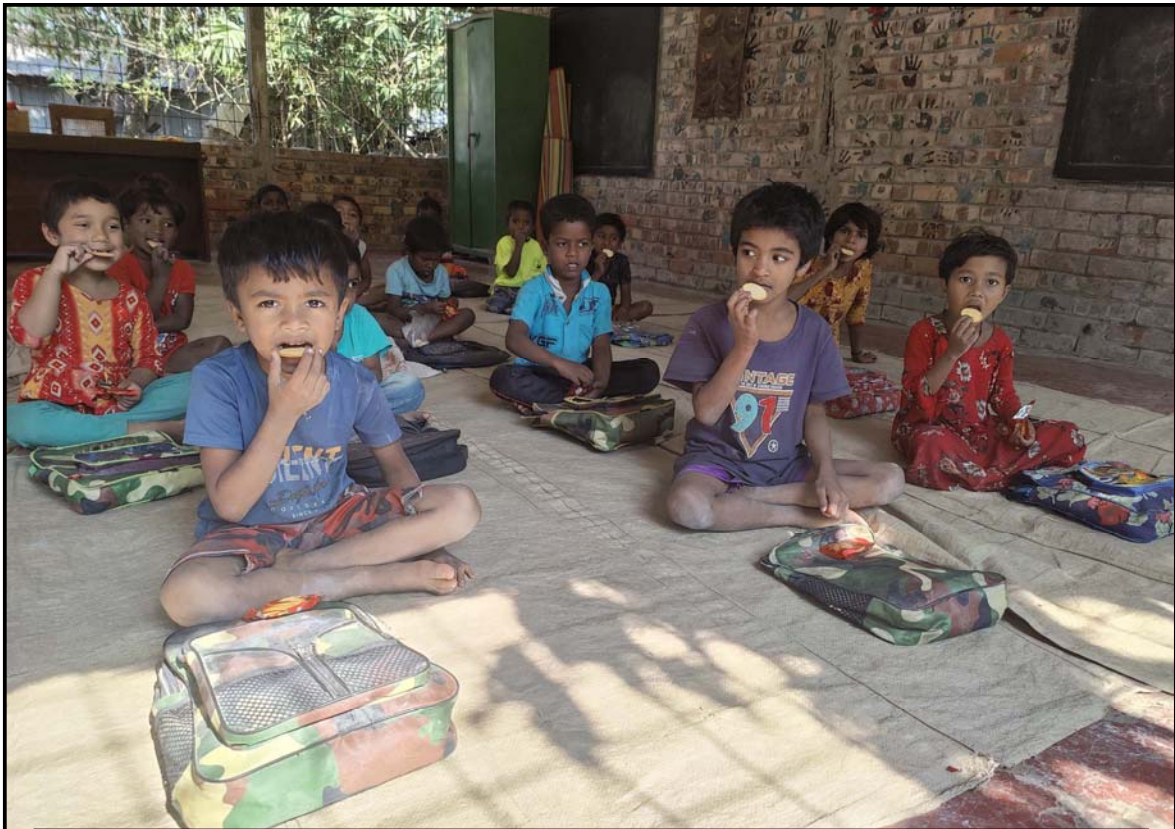
Enjoying the biscuits in tiffin time...