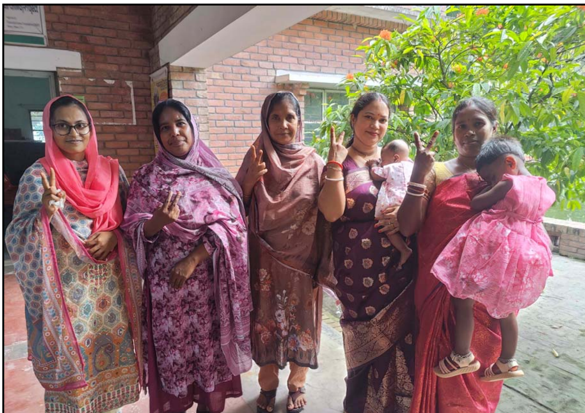
We conducted teachers meeting...