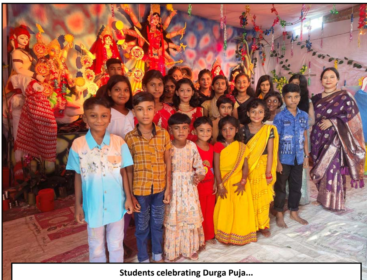
Students celebrating Durga Puja...