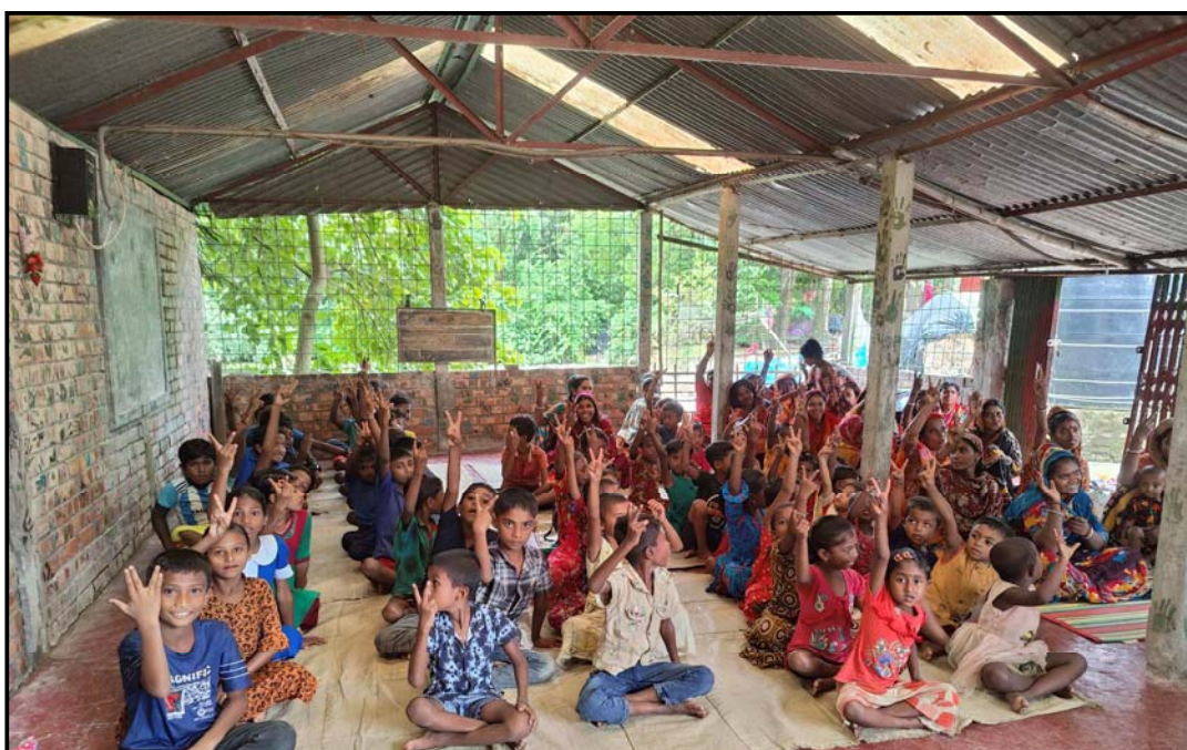
Parents meeting at Jogahati village....