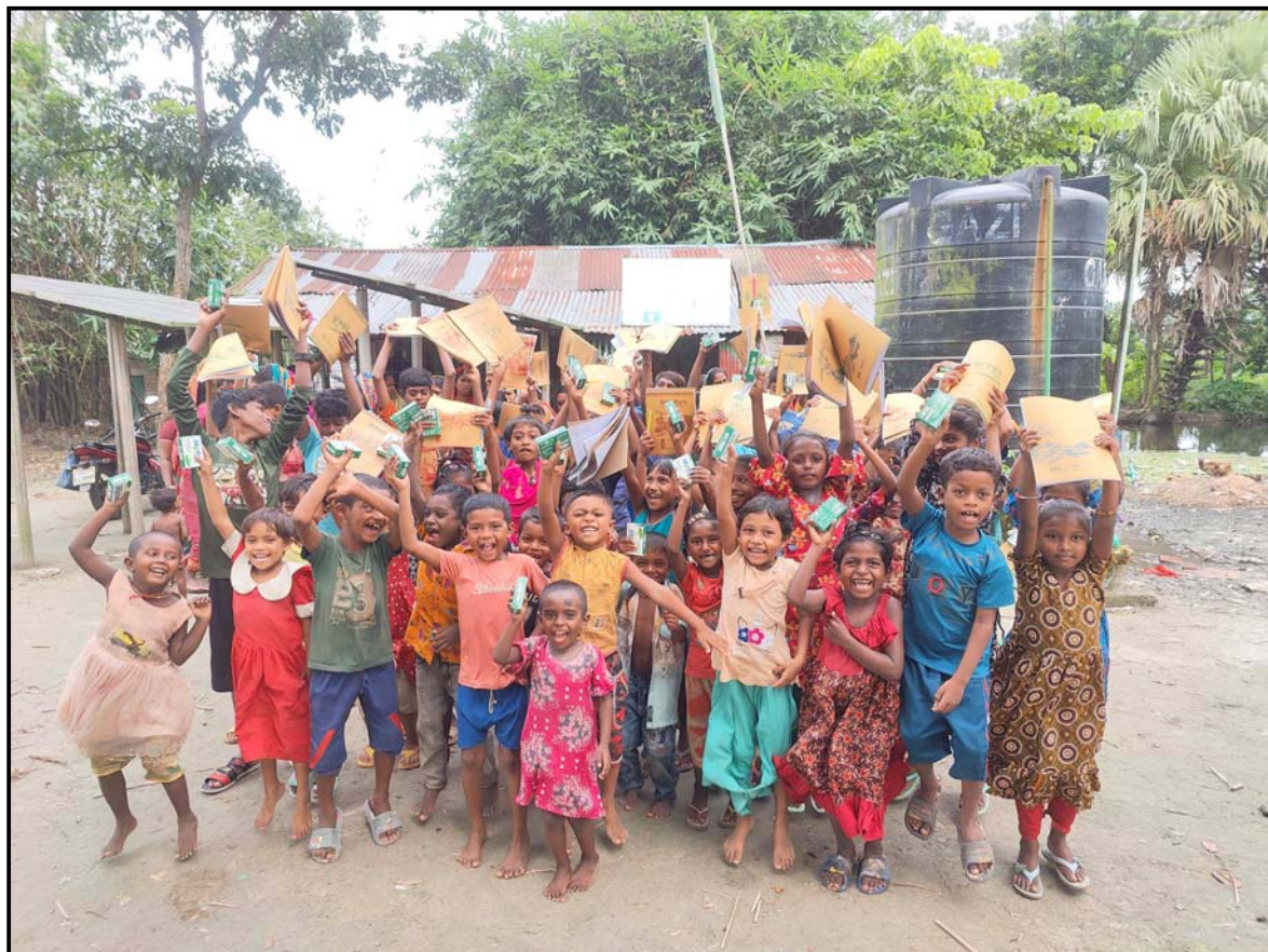
Happy students with the materials at Jogahati village...