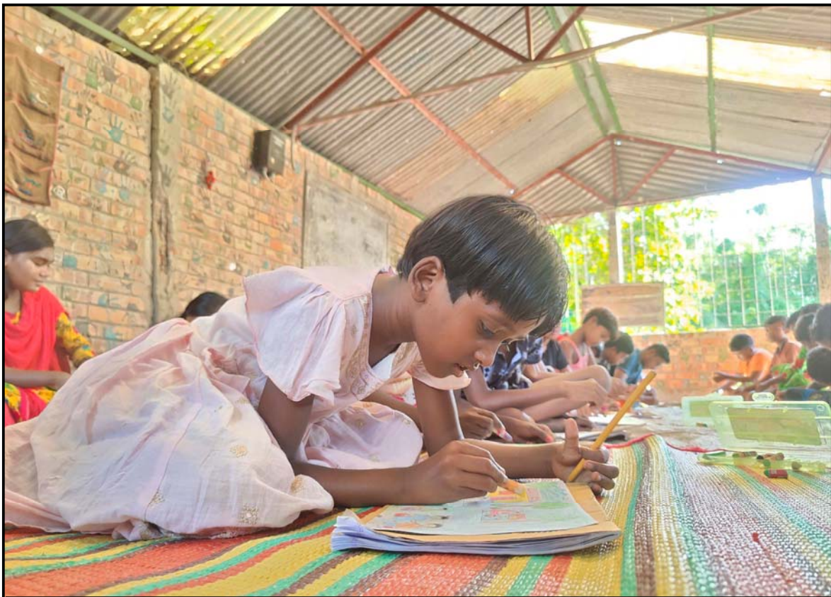
Joghati village preschool students enjoying to do the art...