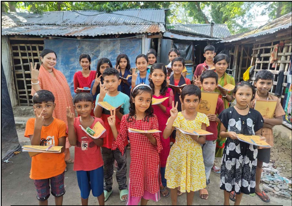
Materials distributed to Churamankati village students...