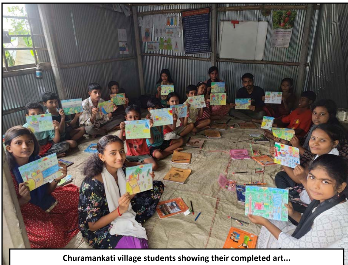
Churamankati village students showing their completed art...