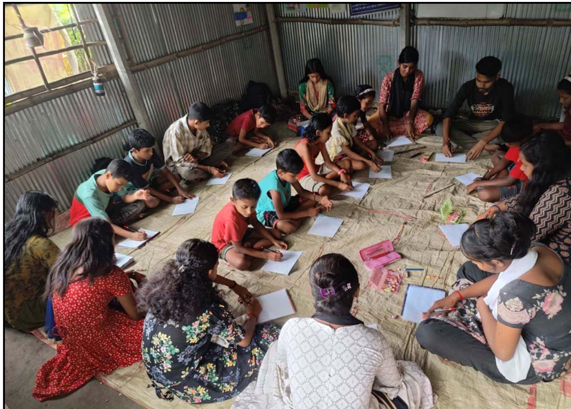
Churamankati students in art competition...