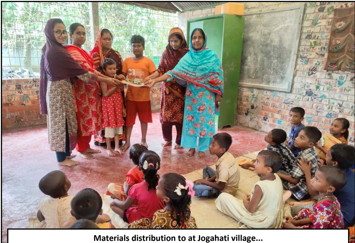
Materials distribution to at Jogahati village...