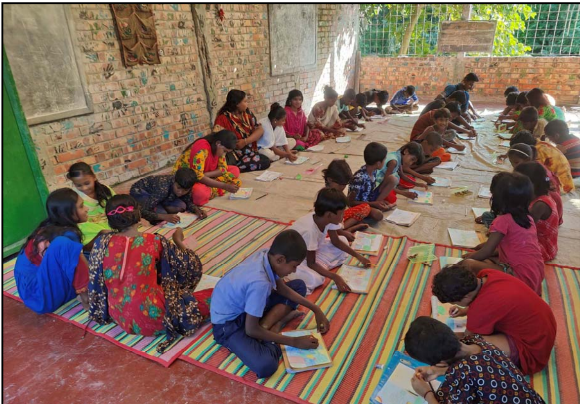
Jogahati students in art competition...