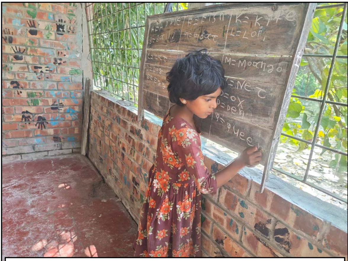
A attentive students at preschool...