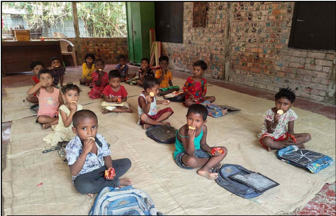
Preschool kids enjoying the biscuit tiffin...