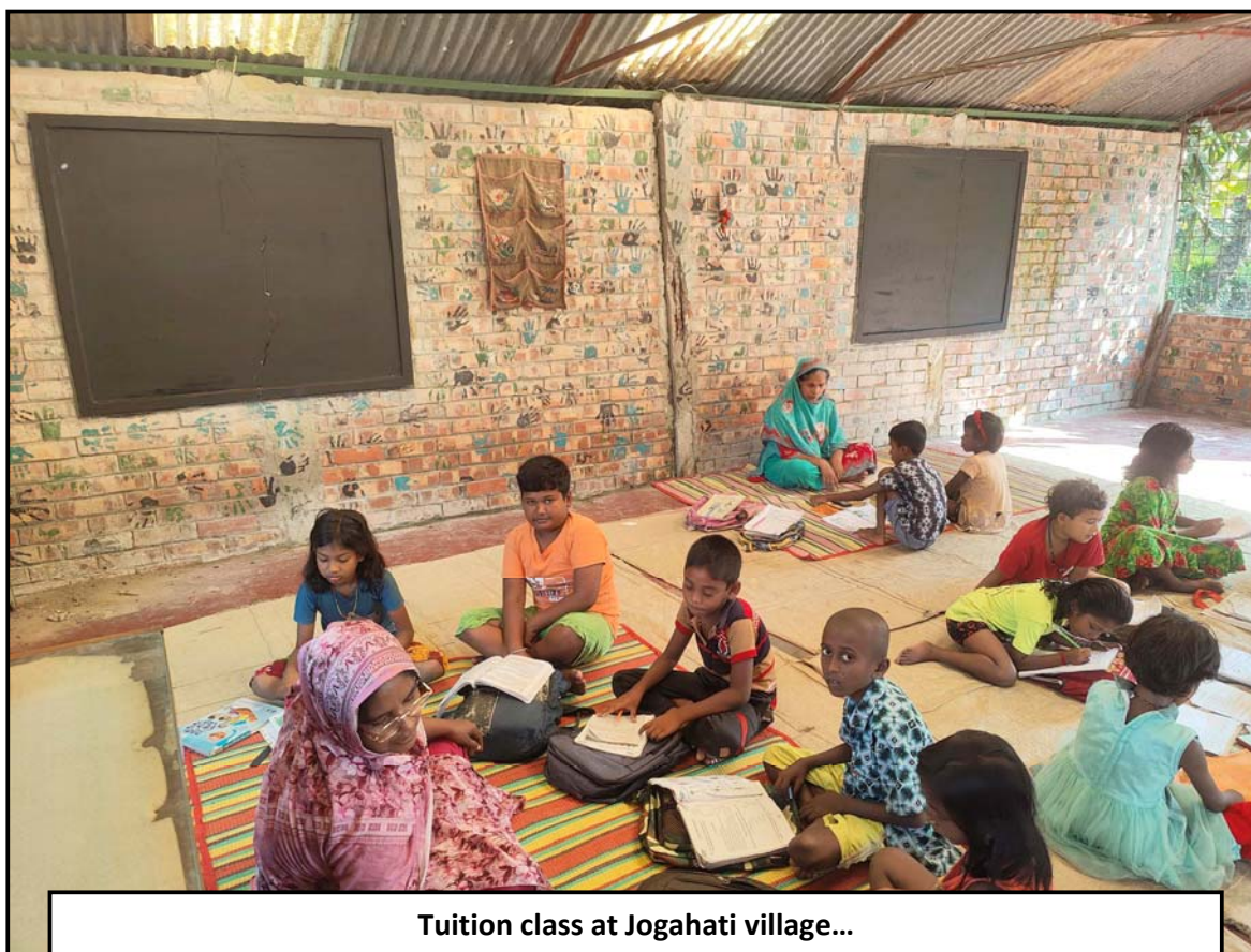
Tuition class at Jogahati village...