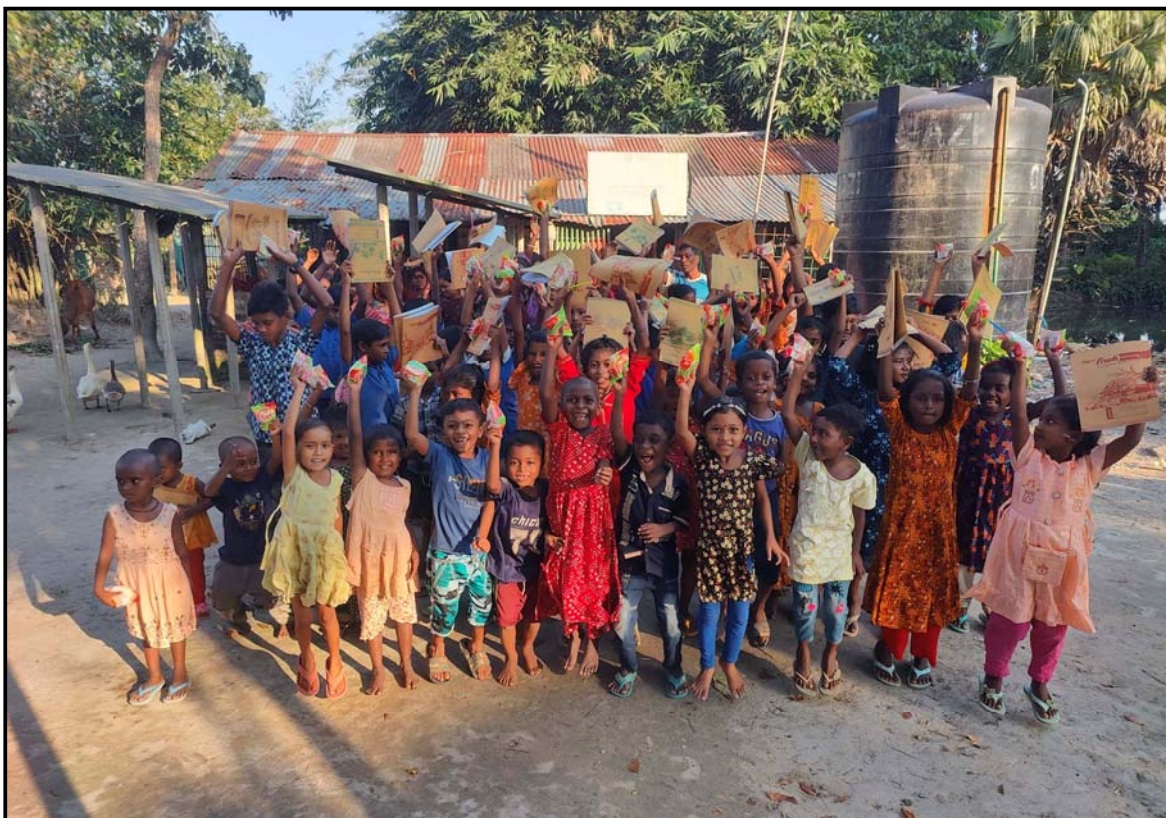
Preschool students with the materials...