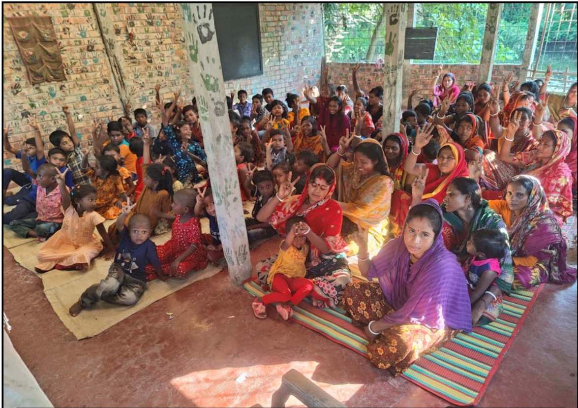
Parents meeting at Jogahati village...