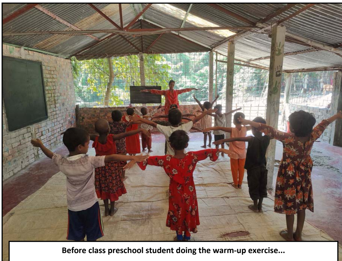
Before class preschool student doing the warm-up exercise...