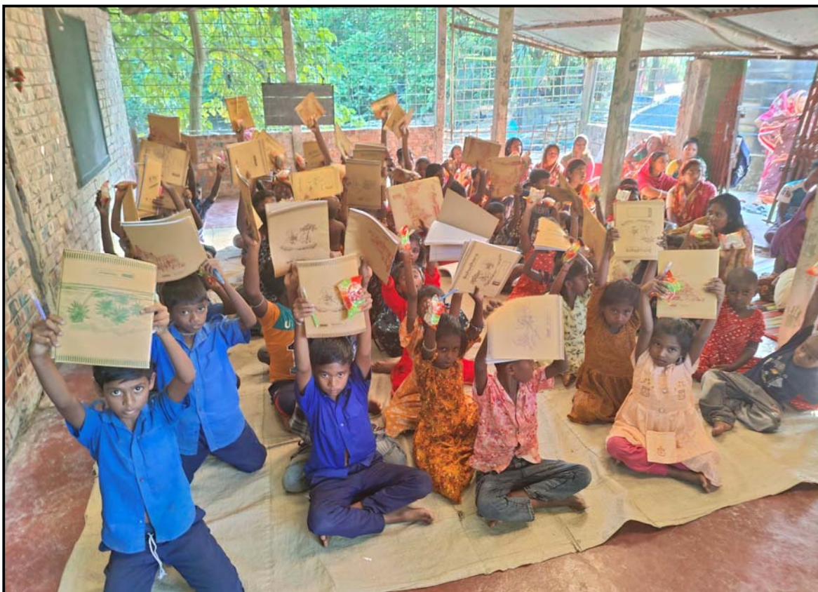
Happy students with the materials...