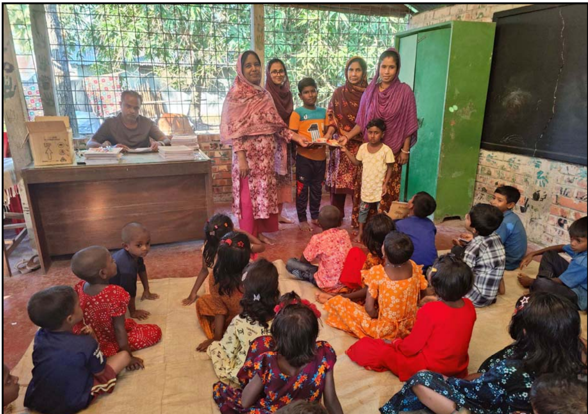
Materials distribution at Jogahati village...