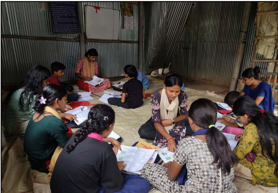
Churmankati tuition class taken by senior students...