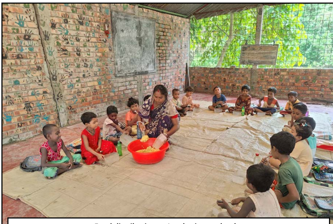
Food distribution at Jogahati pre-school...