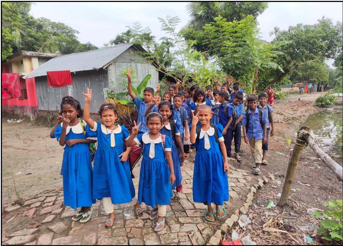
Joghati village students, going to school...