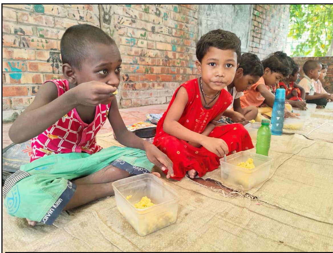
Pre-school students enjoying the warm 'khitchury' as a tiffin...