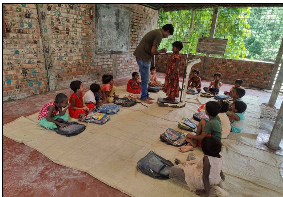
Monthly pre-school students weight and height check....