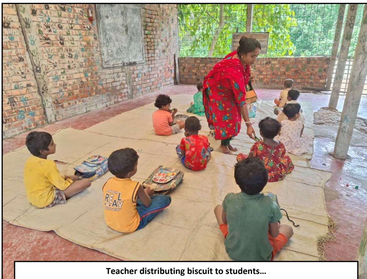
Teacher distributing biscuit to students...