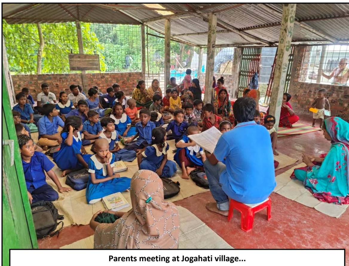
Parents meeting at Jogahati village...