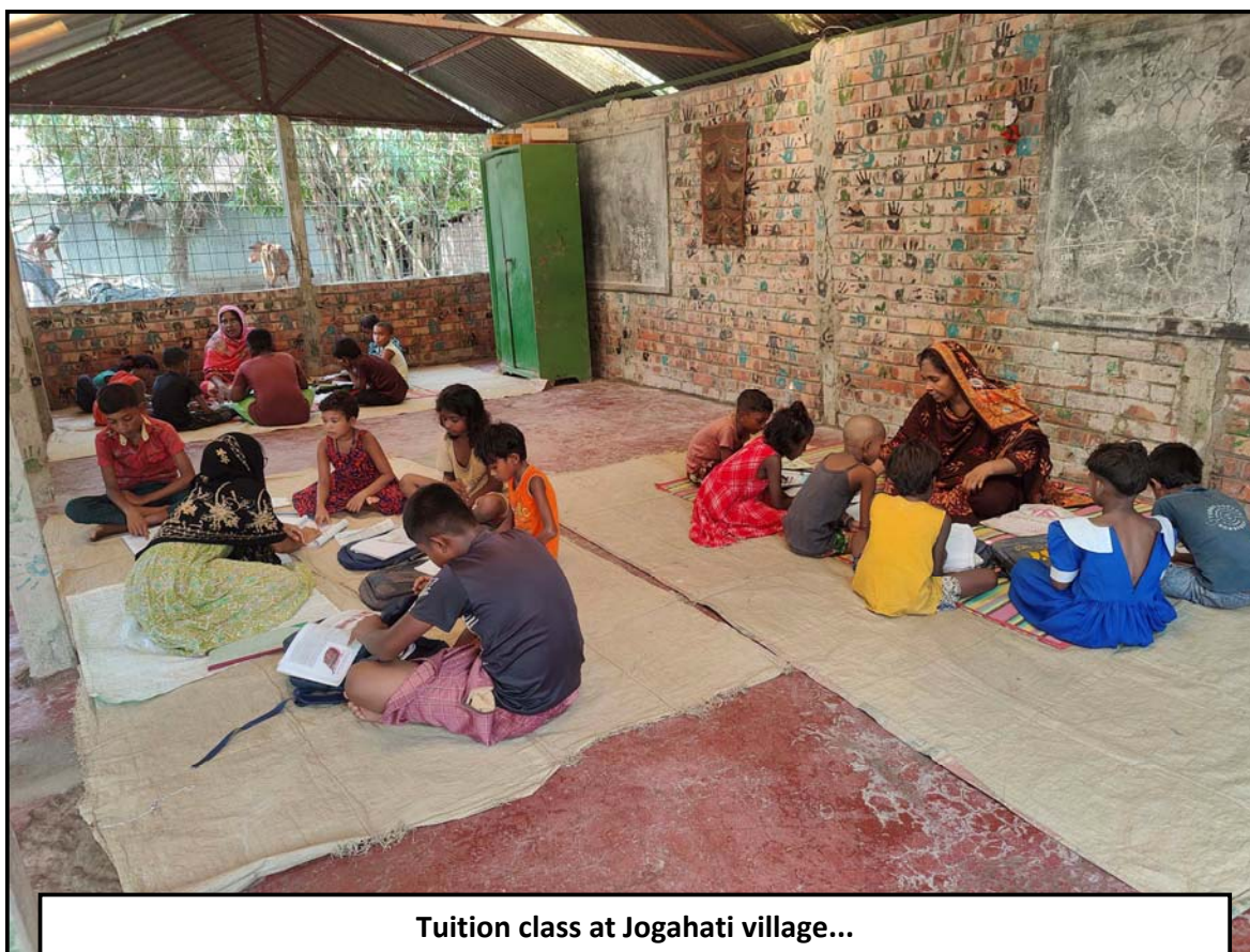
Tuition class at Jogahati village...