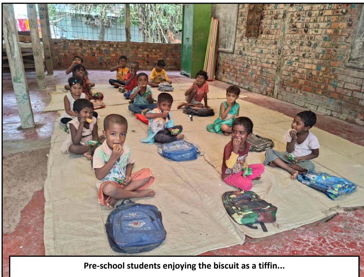
Pre-school students enjoying the biscuit as a tiffin...