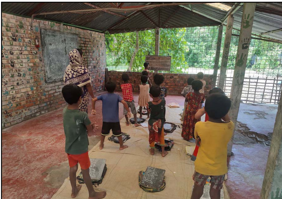
Pre-school class at Jogahati village ...