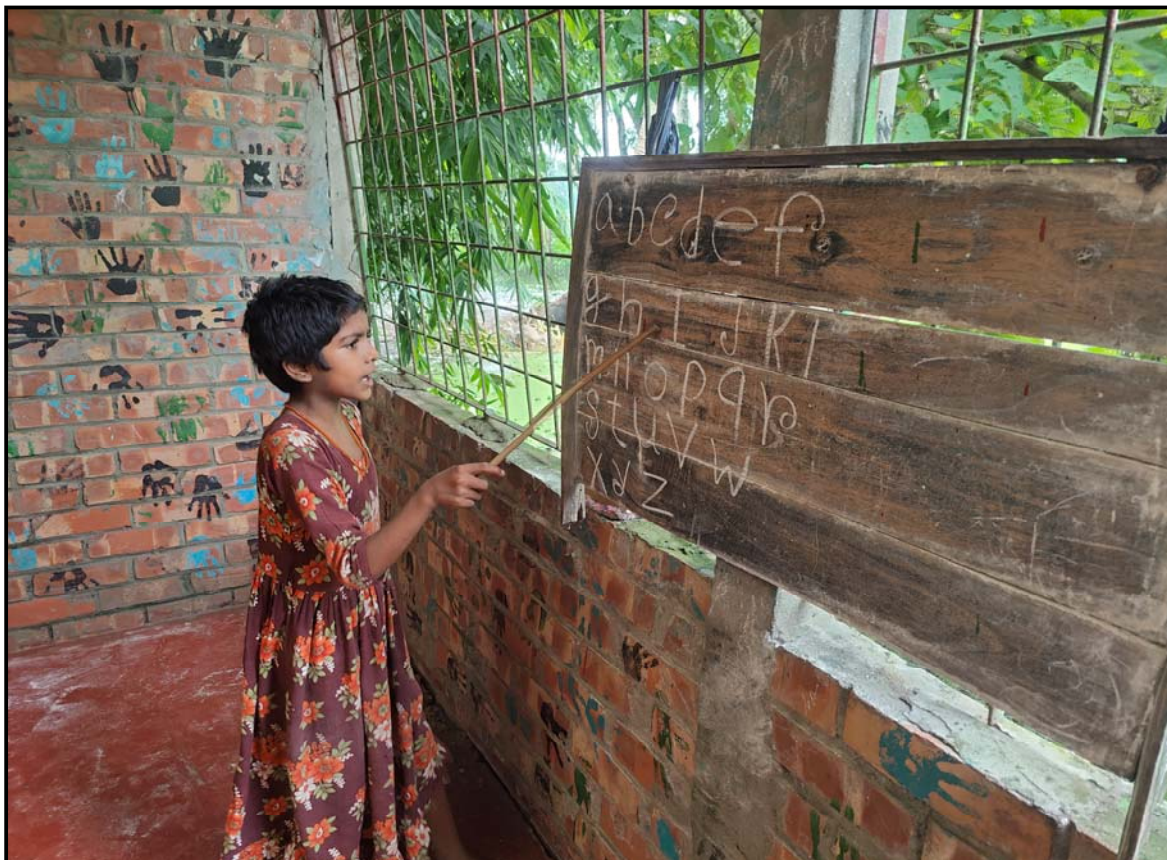
Pre-school student giving oral exam...