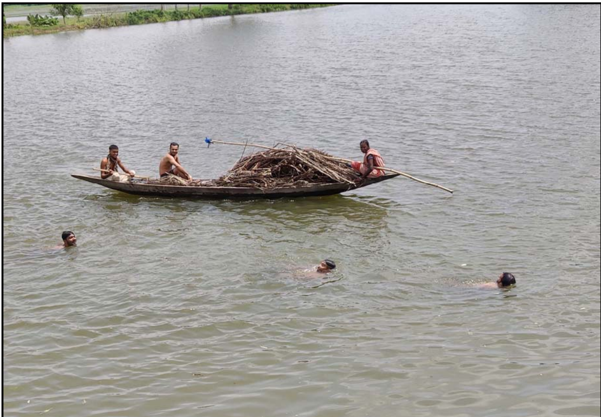
Local boys enjoying the swimming in the nearby pond...