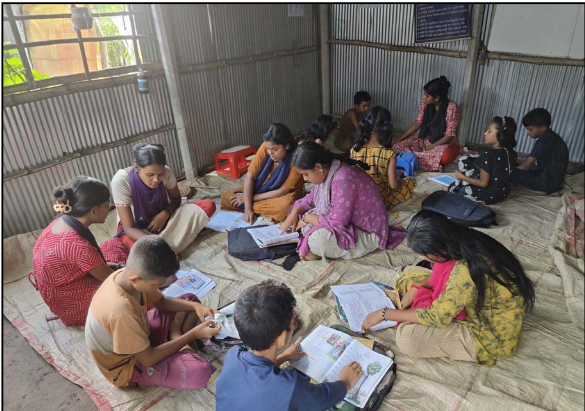
Tuition Class at Churamankati village...