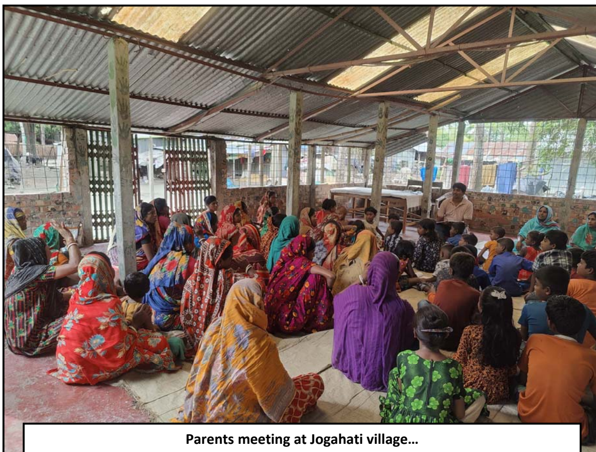
Parents meeting at Jogahati village...