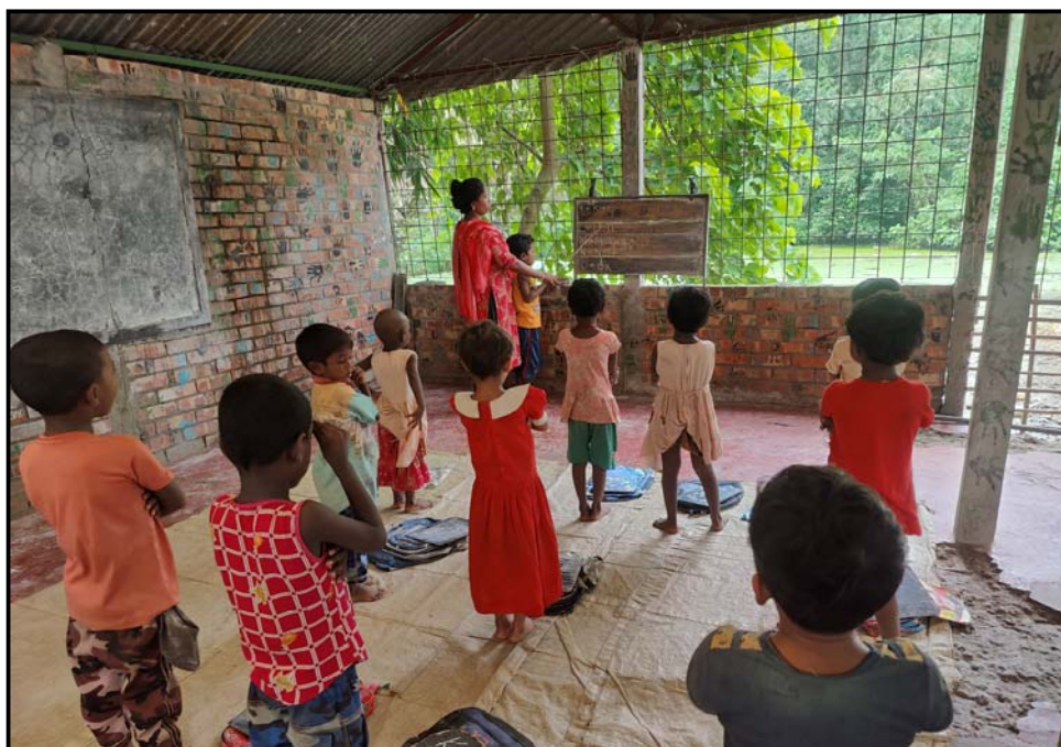
Preschool class at Jogahati village....