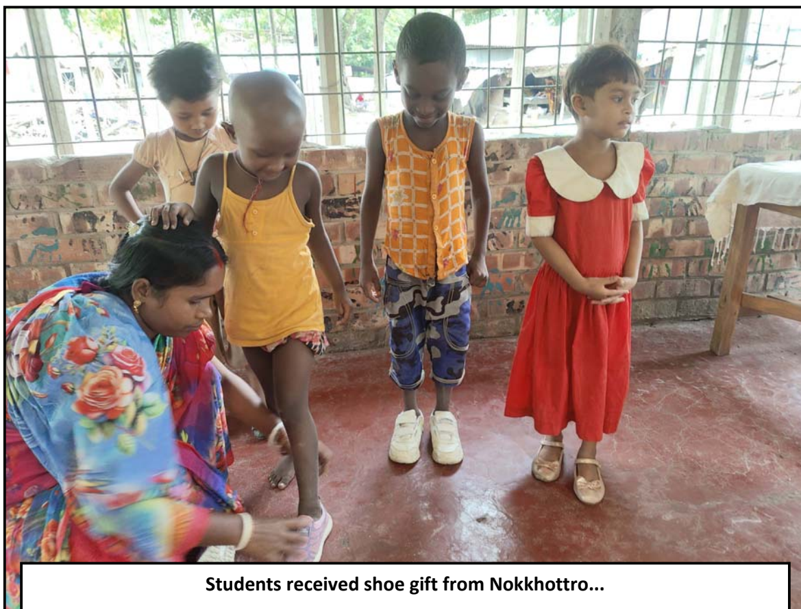
Students received shoe gift from Nokkhottro...