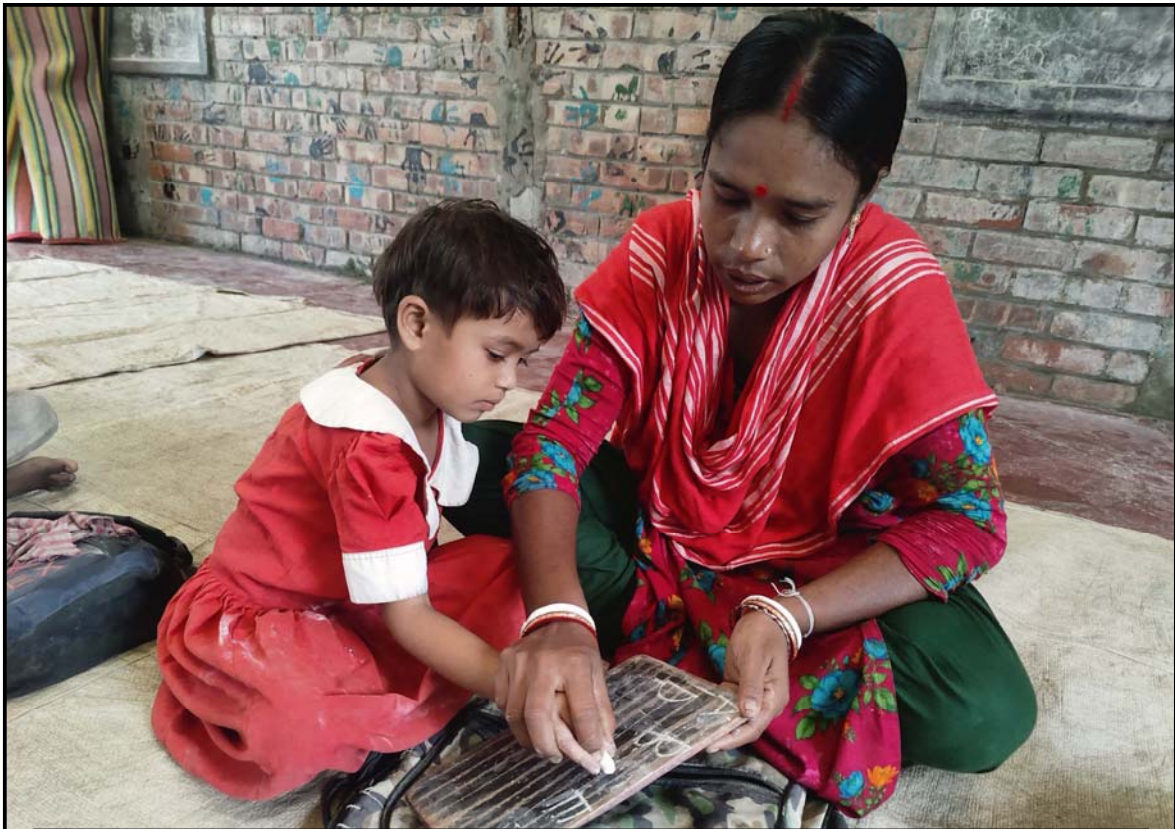
Preschool class at Jogahati village...