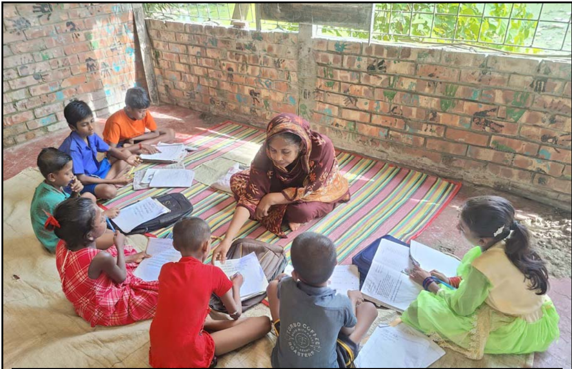
Tuition class at Jogahati village...