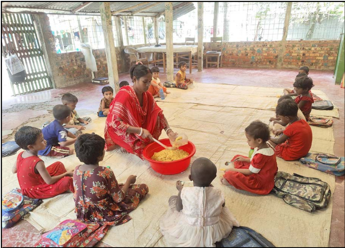
Joghati village preschool students enjoying the tiffin...