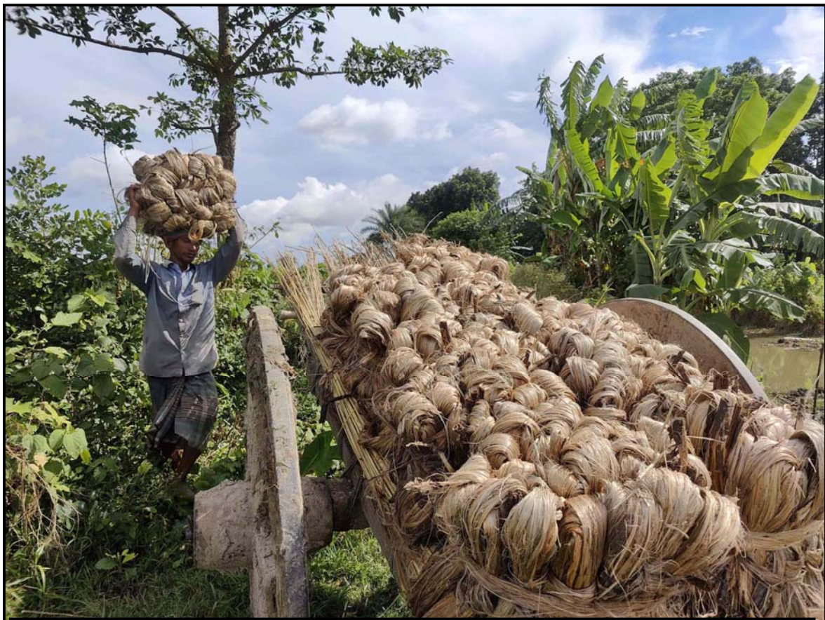
Jute, the golden fiber harvesting...