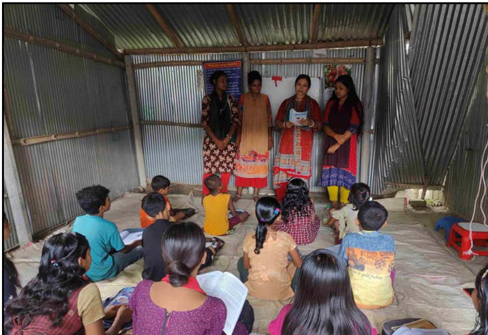
While the teacher is on maternity leave, these three students will take on teaching responsibilities in Churamankati village...