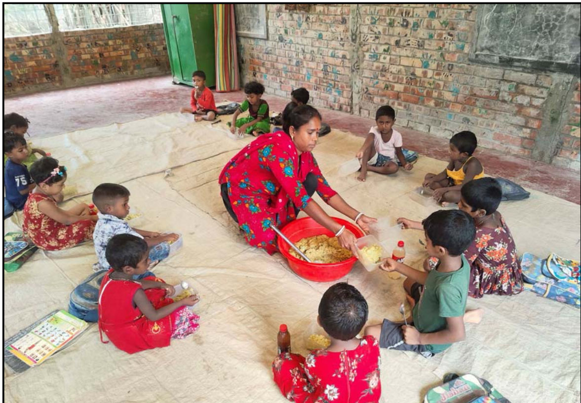
Jogahati pre school students enjoying warm khitchury food...