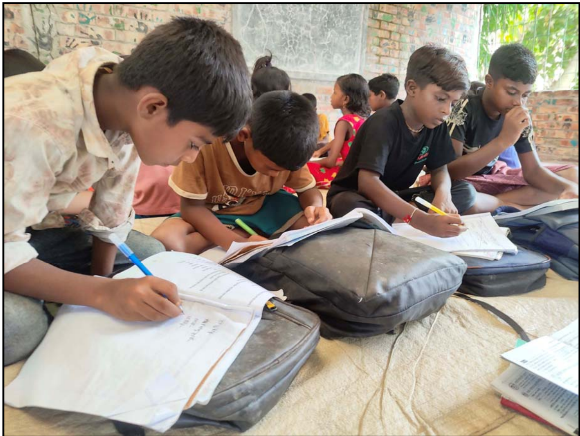
Studying attentively at tuition class...