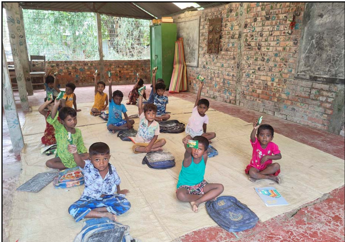
Jogahati pre school students enjoying the biscuit at tiffin...