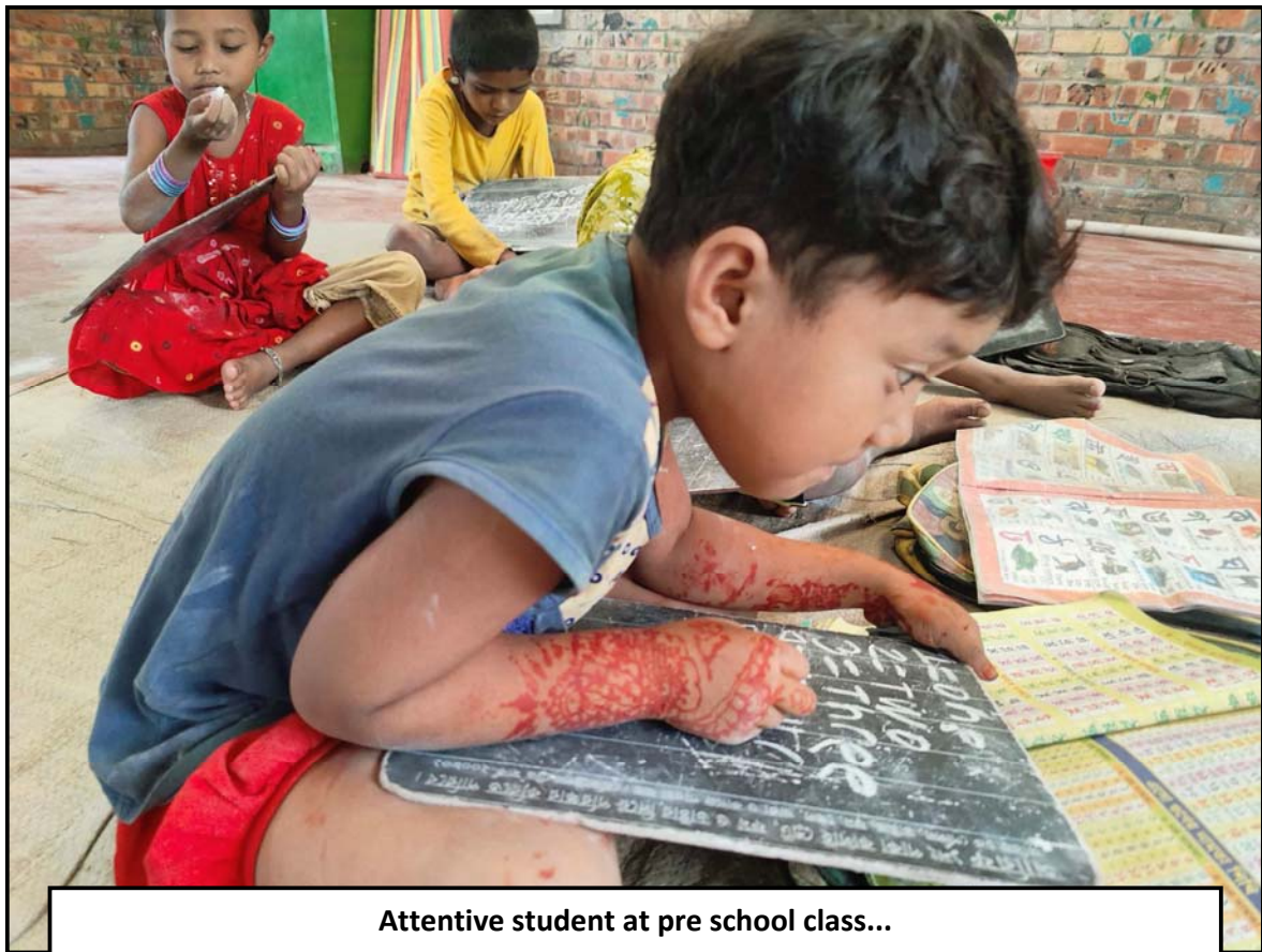
Attentive student at pre school class...