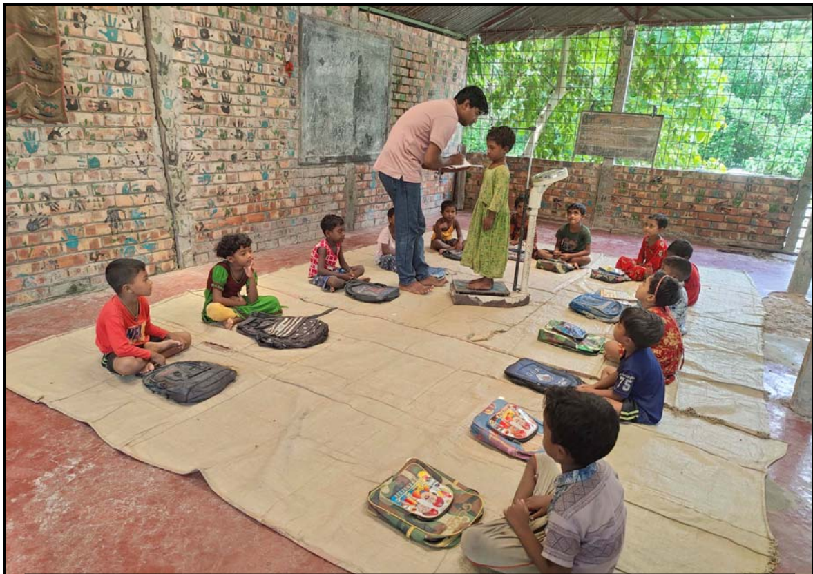
Monthly weight and height check at Jogahati pre school...