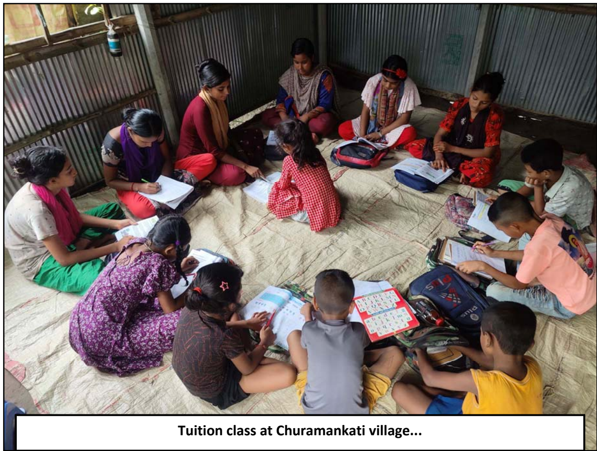
Tuition class at Churamankati village...