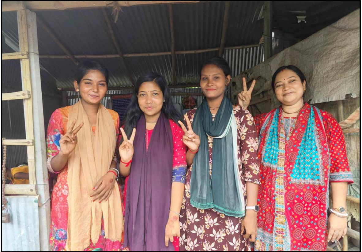
The three students on the left have appeared for the SSC exam and are waiting for their results.