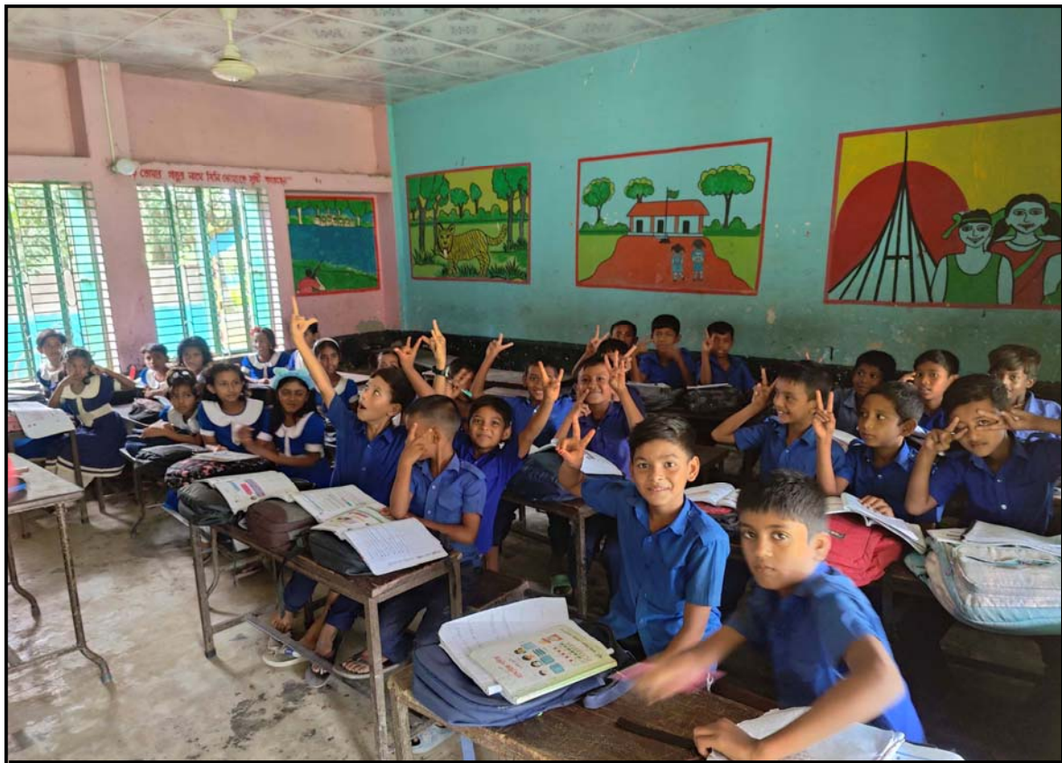
Our students at local government school...