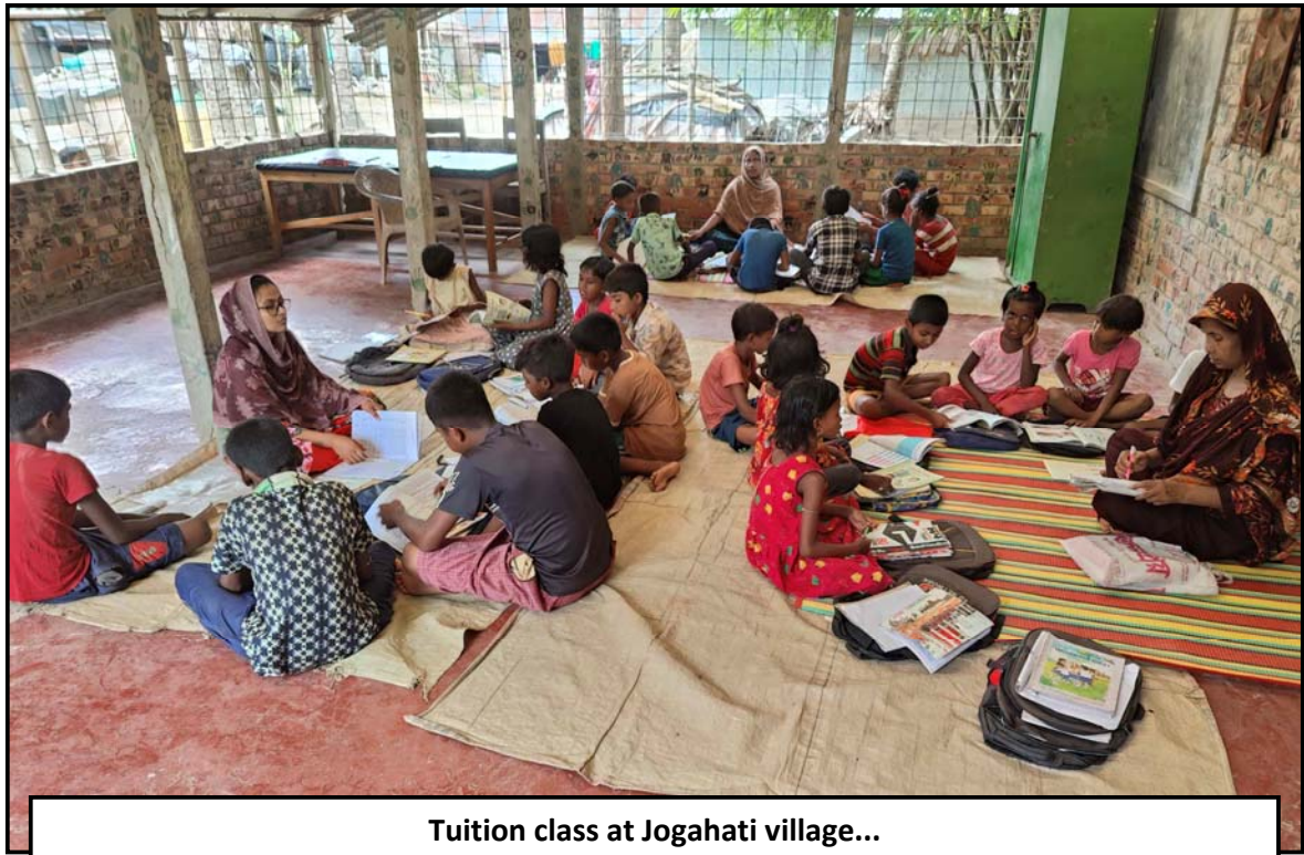
Tuition class at Jogahati village...