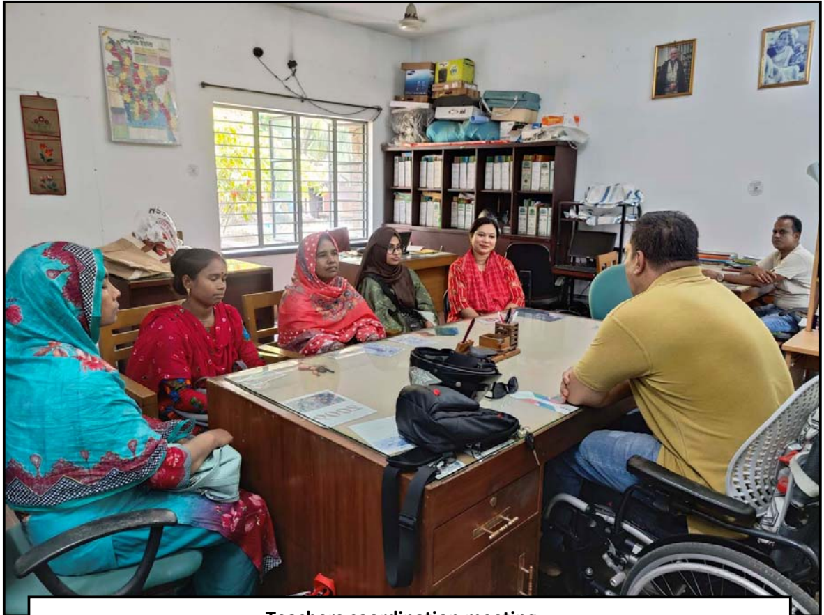
Teachers coordination meeting...