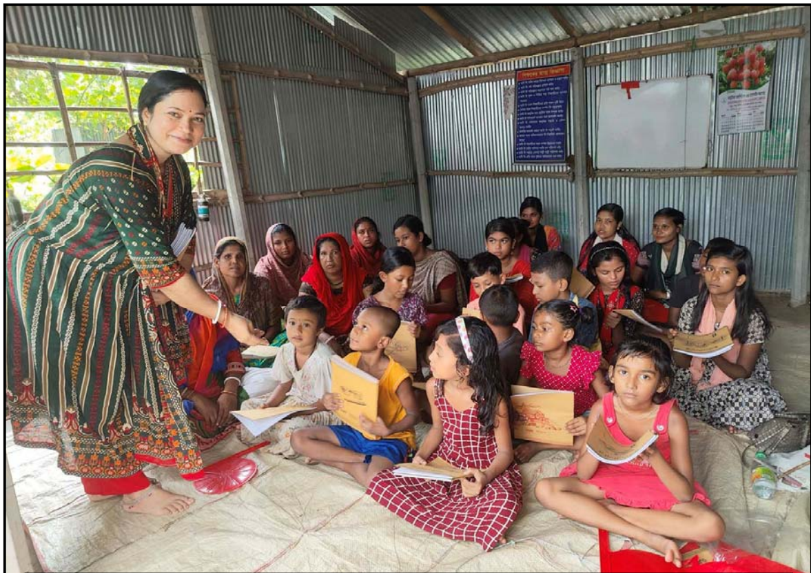
Materials distribution at Churamankati village...