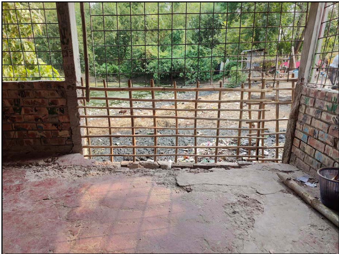
The preschool floor also broken...