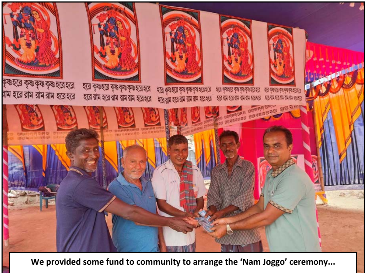
We provided some fund to community to arrange the 'Nam Joggo' ceremony...