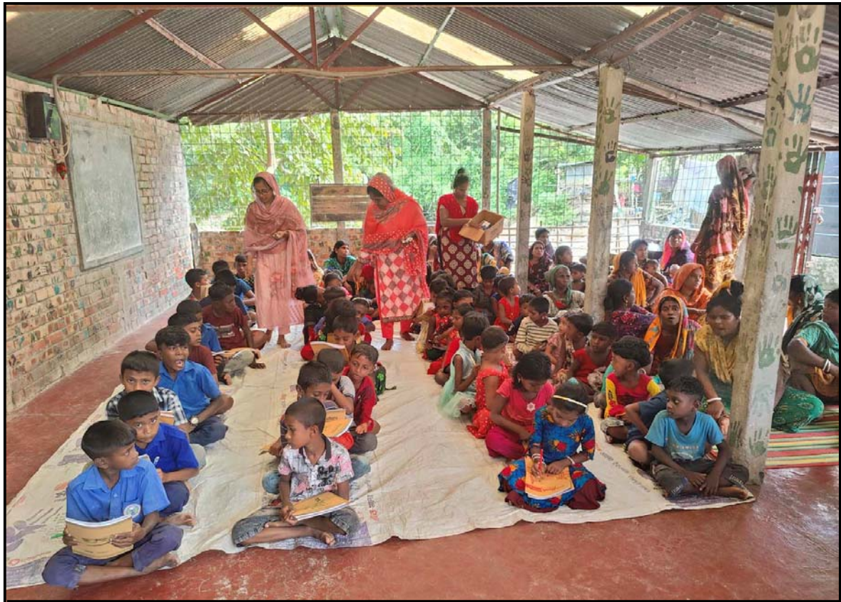
Materials distribution at Jogahati village...