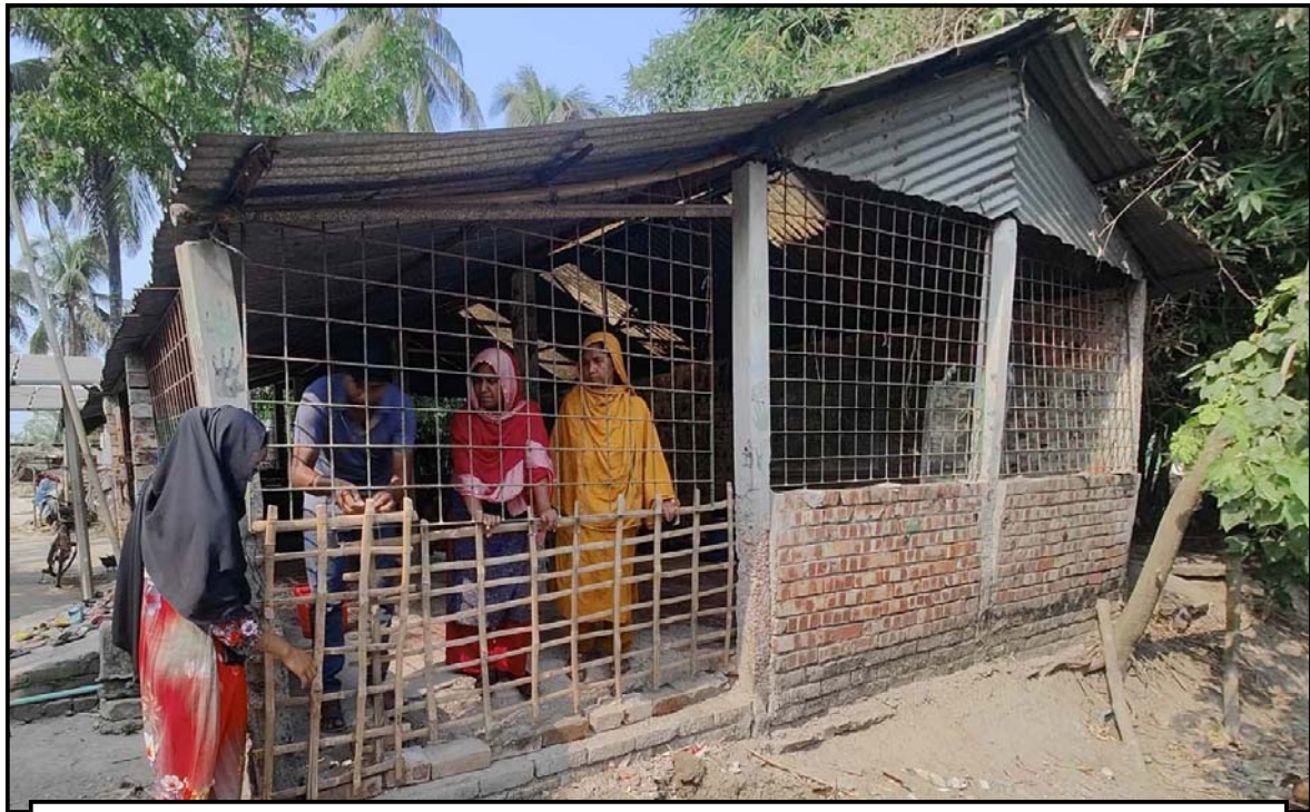
Pre-school wall was broken so, we repair with bamboo fence...