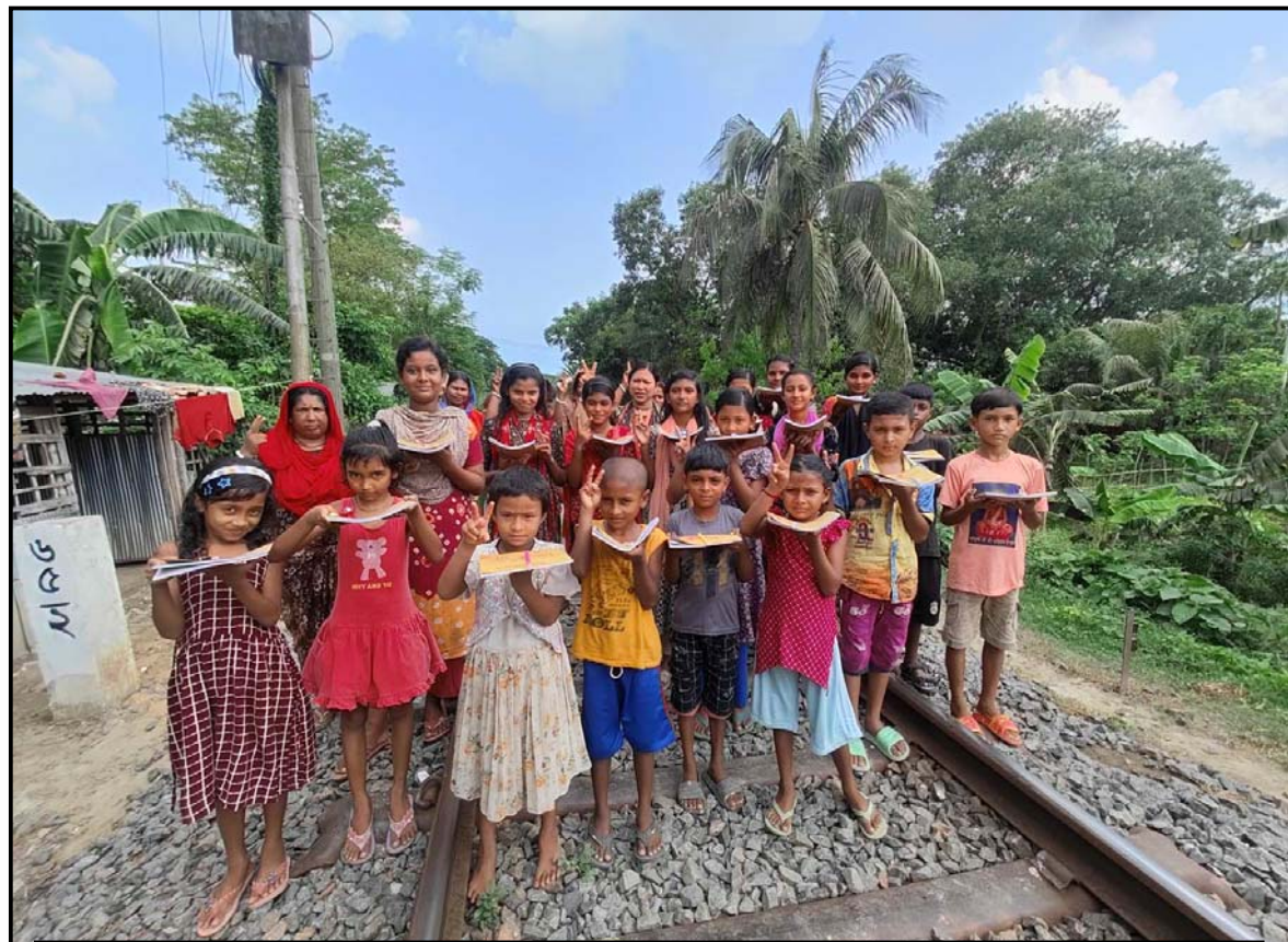
Churamankati students with the materials...