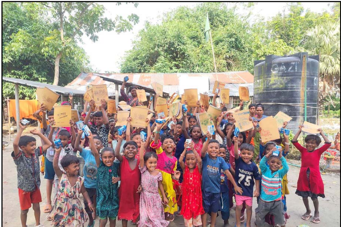
Jogahati students with the materials...