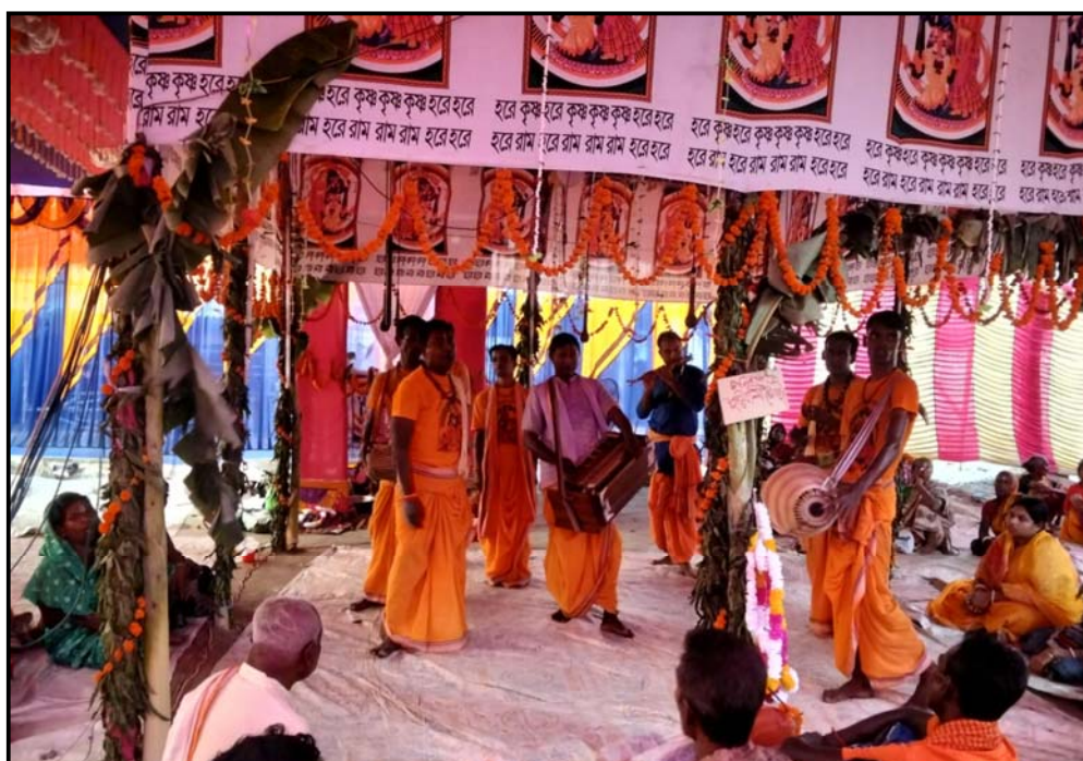
Every year Jogahati community arrange 'Nam Joggo' a Hindu ritual...