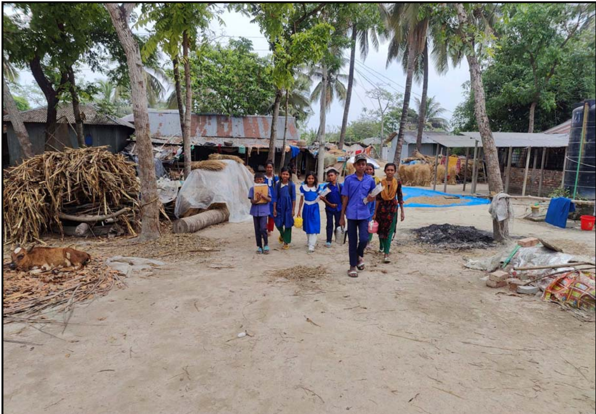
Students going to school...