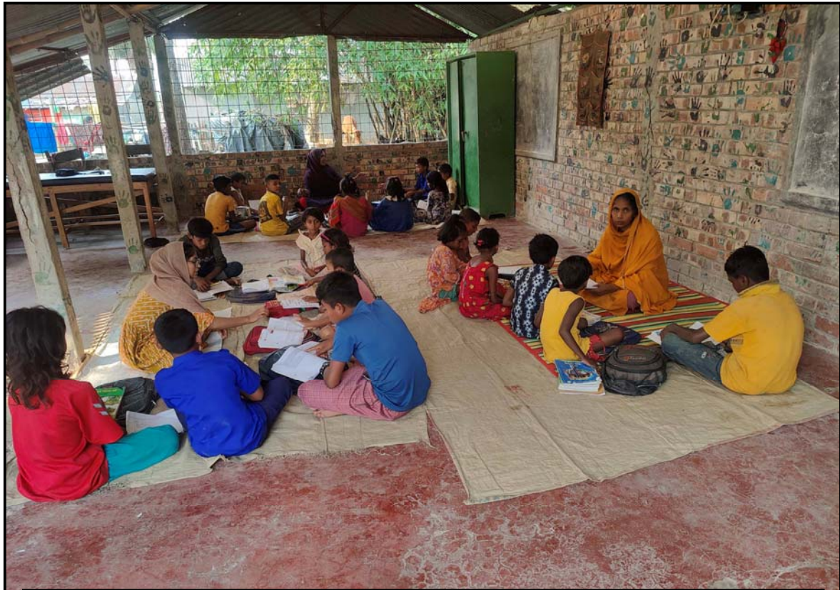
Tuition class at Jogahati village...