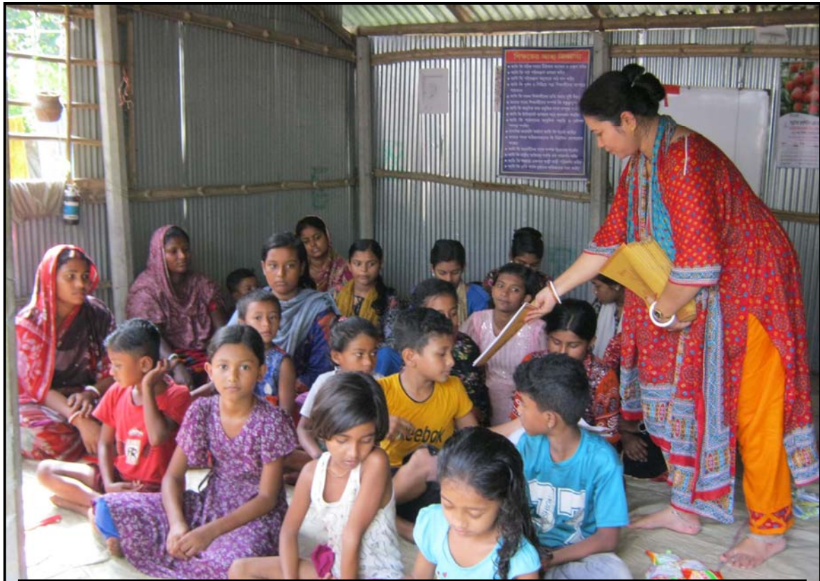
Materials distribution at Churamankati village...