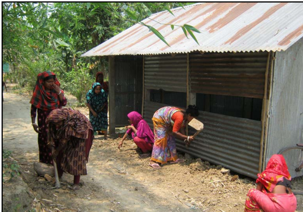
Sorupdaho parents re-constructing the tuition centre...