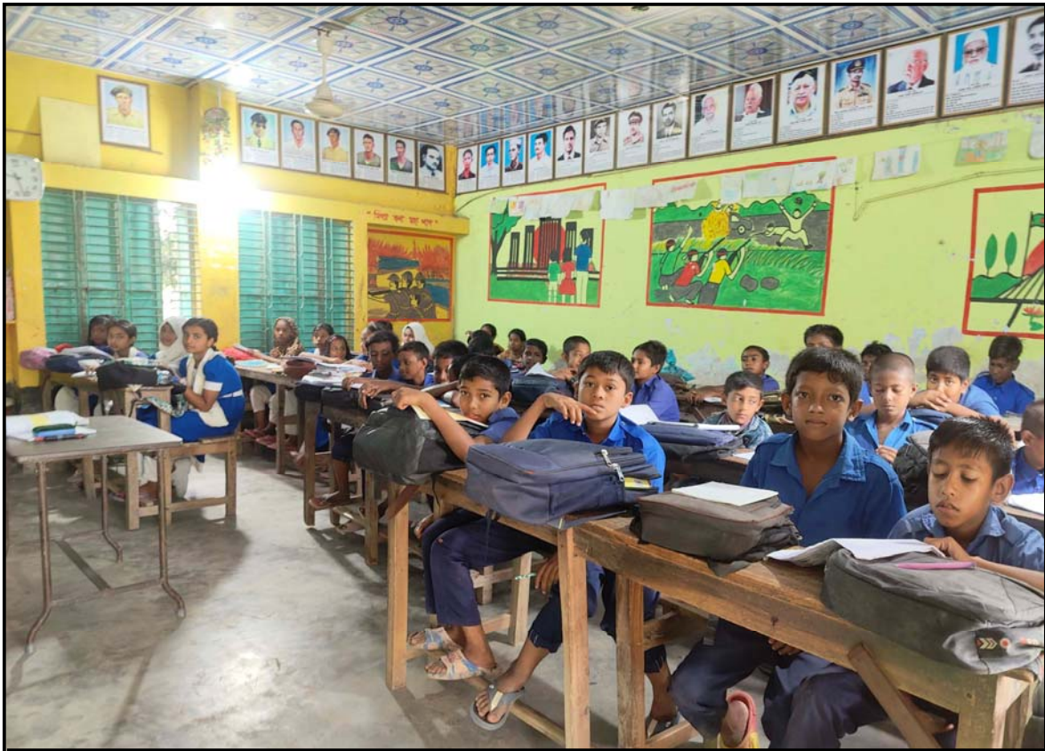
Local primary school class...