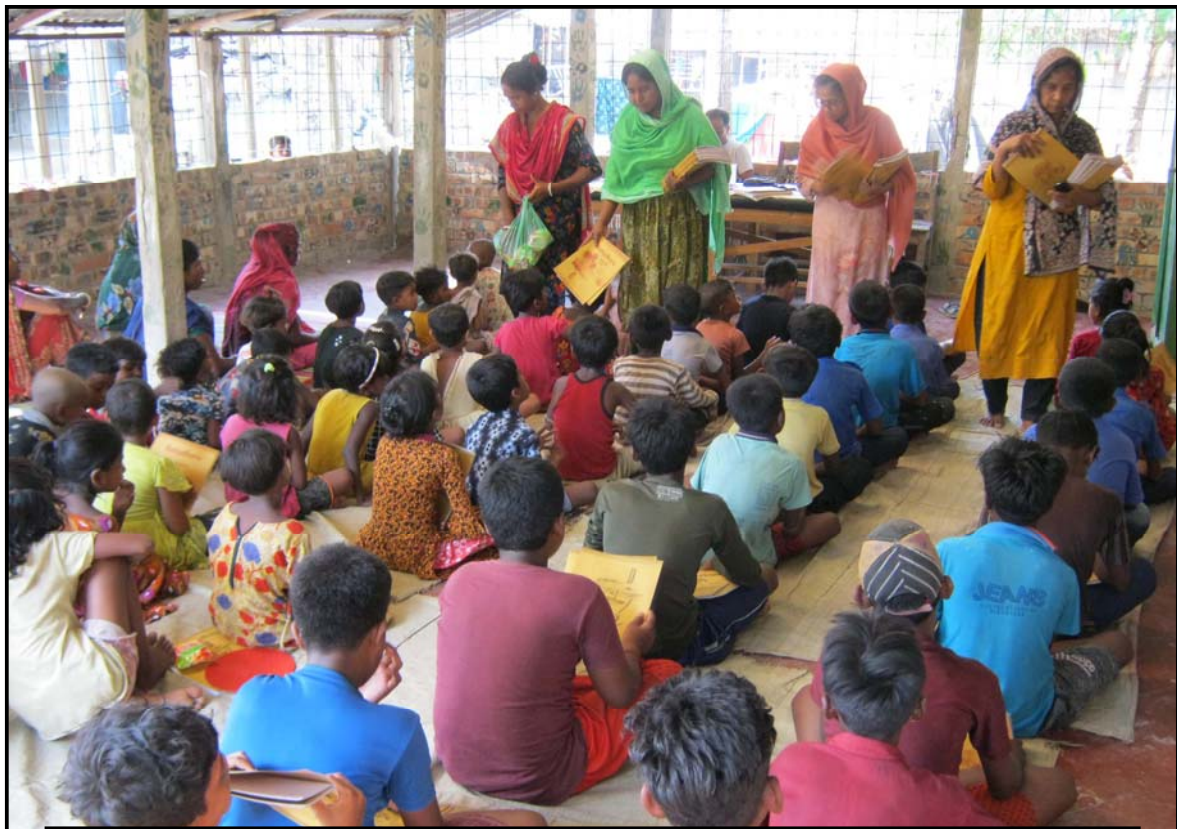
Materials distribution at Jogahati village...