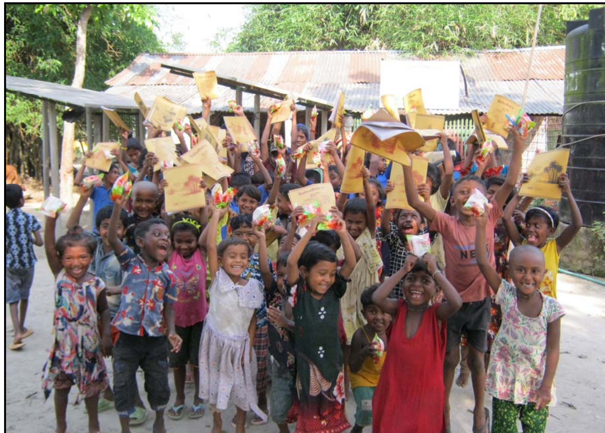
Joghati students with the materials...