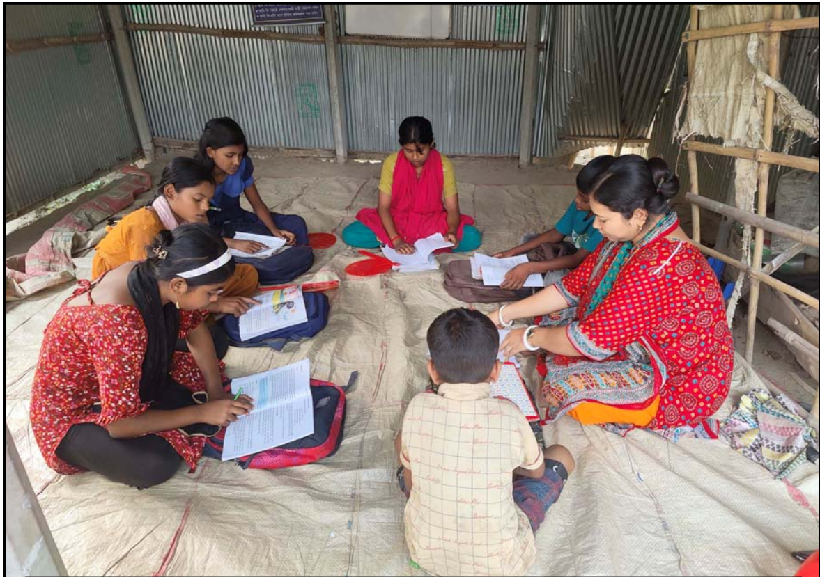
Tuition class at Churamankati village...