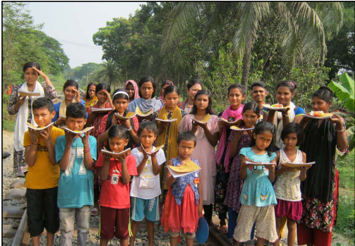
Churamankati students with the materials...