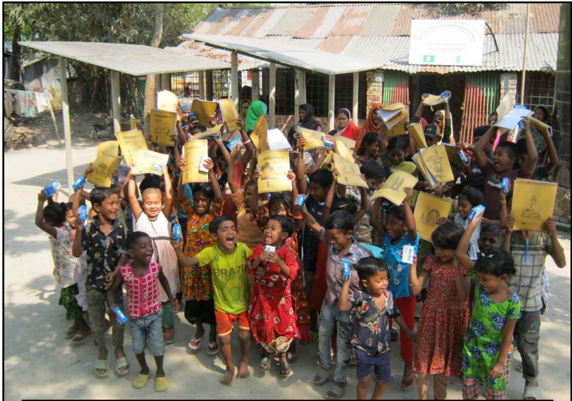
Jogahati village students with the materials...