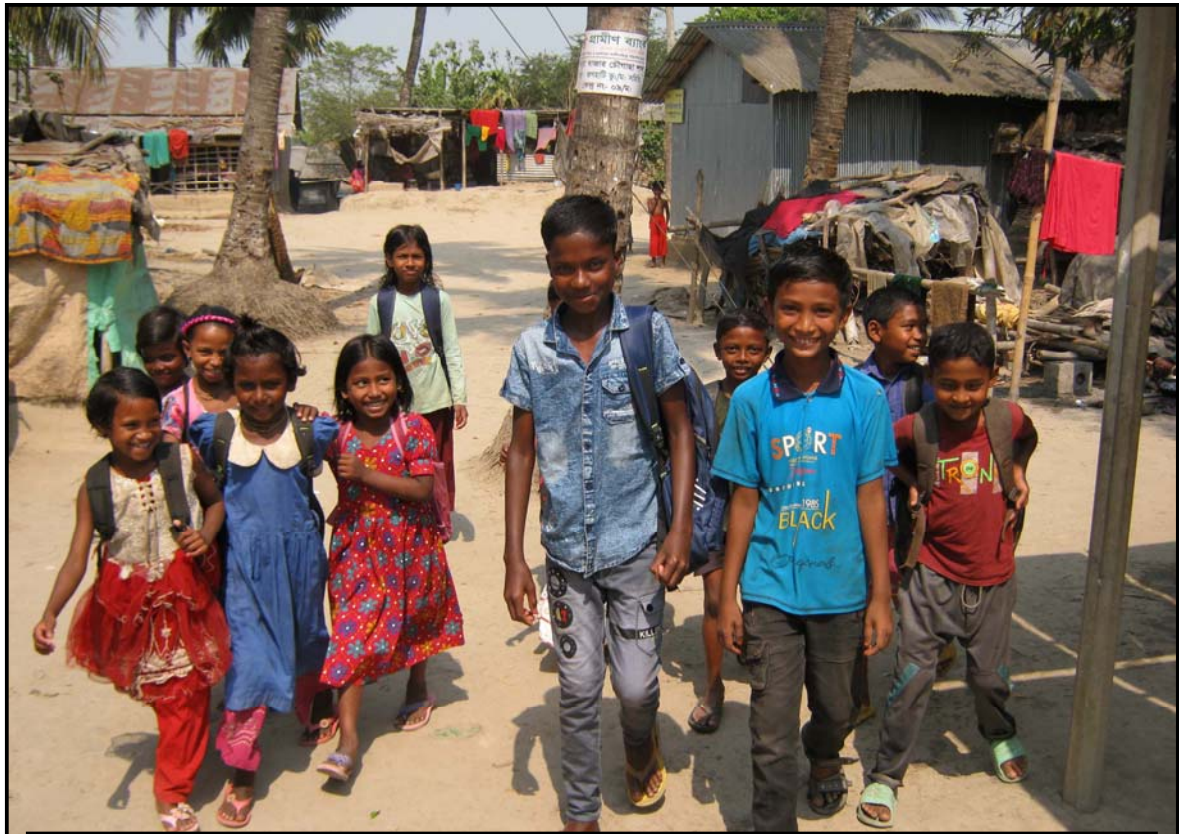
Coming for the tuition class...