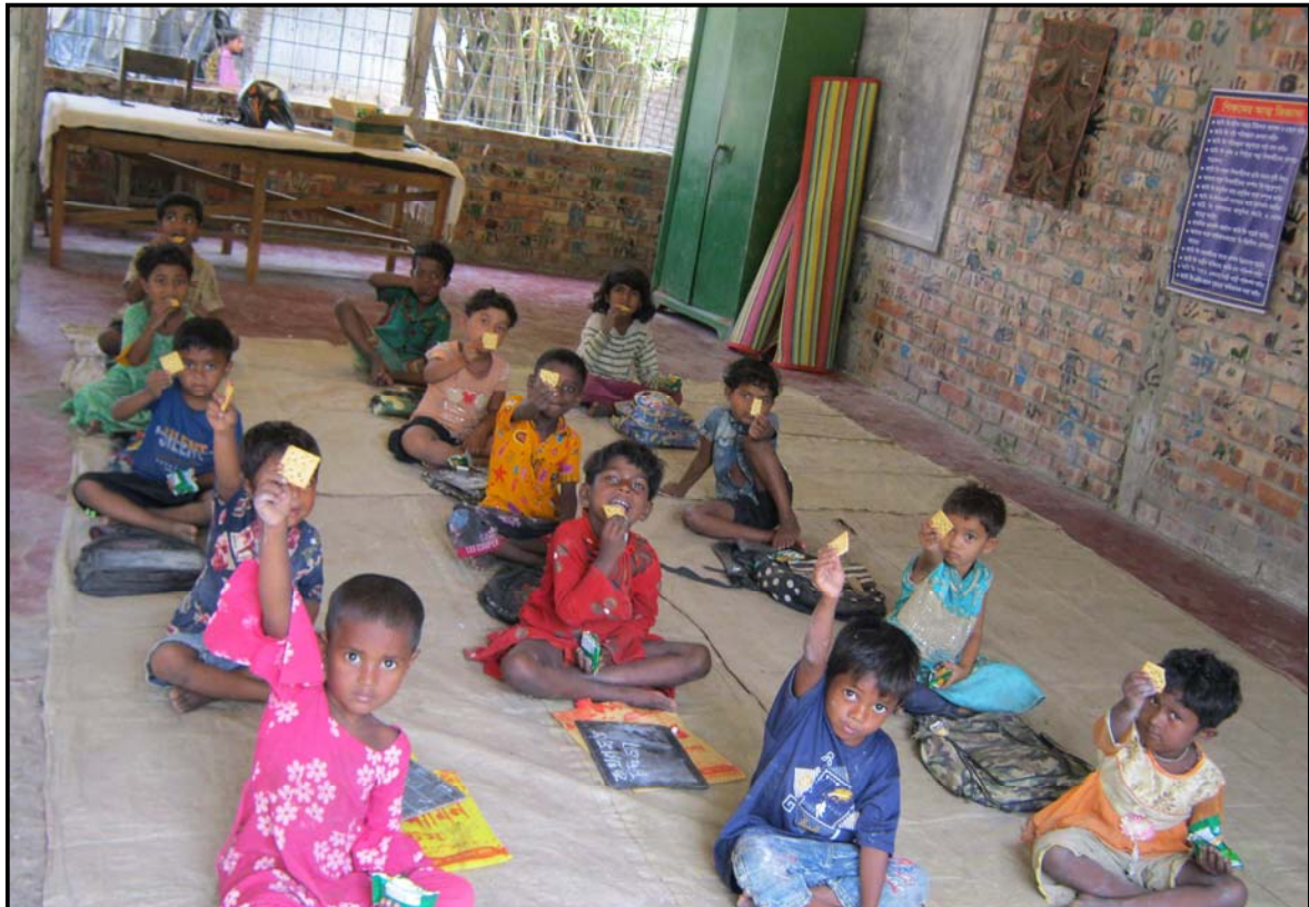
Preschool students enjoying the biscuit during the class...