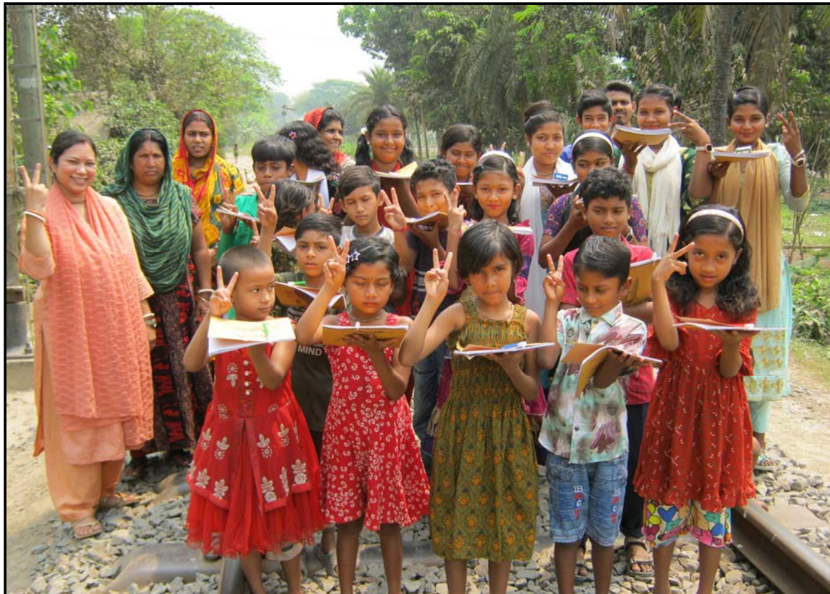
Churamankati preschool happy students with the materials...