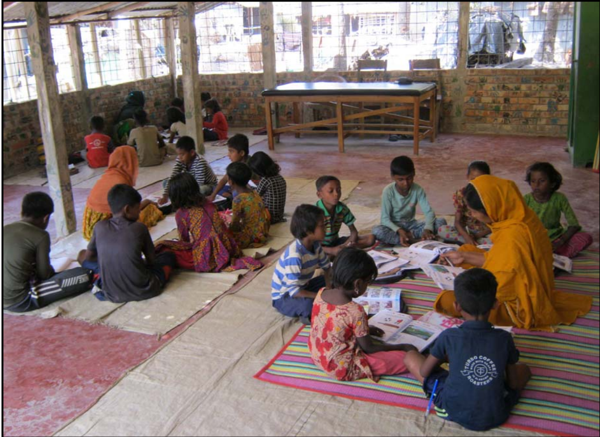
Tuition class at Jogahati village...