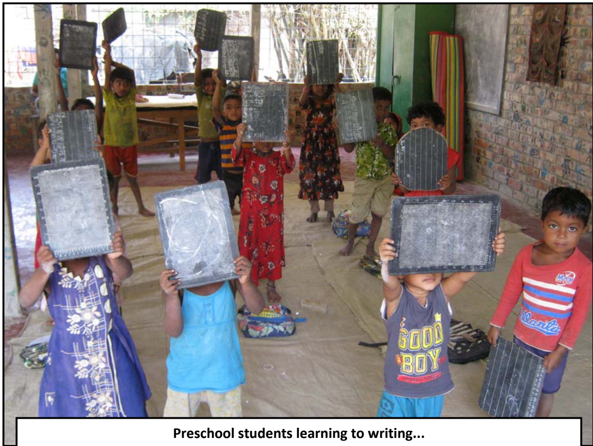
Preschool students learning to writing...