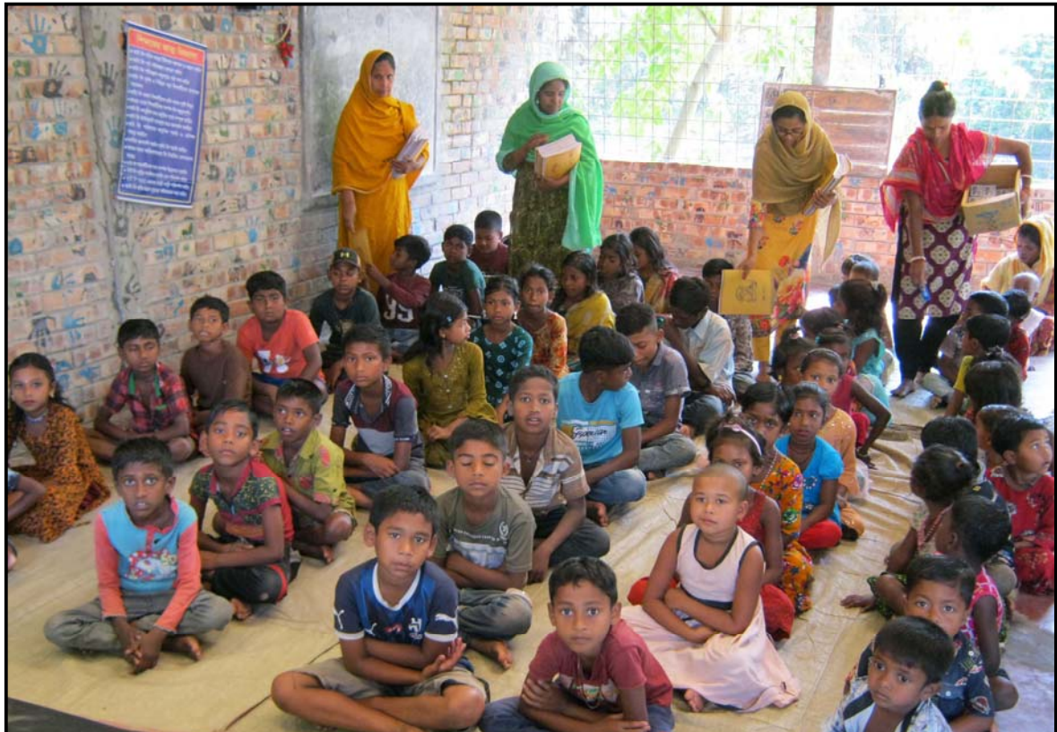
Materials distribution at Jogahati village...