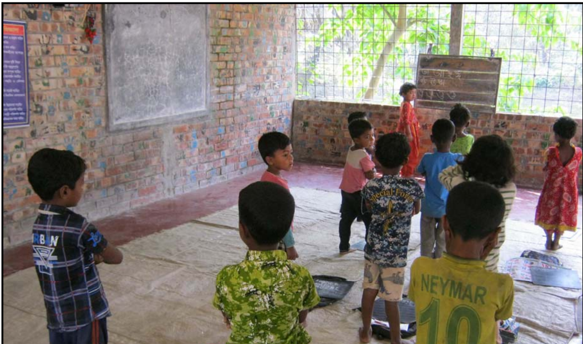
Preschool class at Jogahati village...