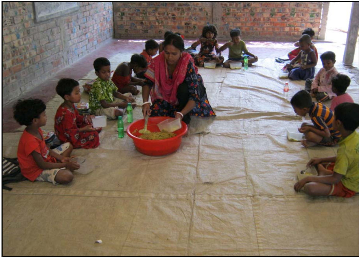
Distributing Khichuri to preschool students...