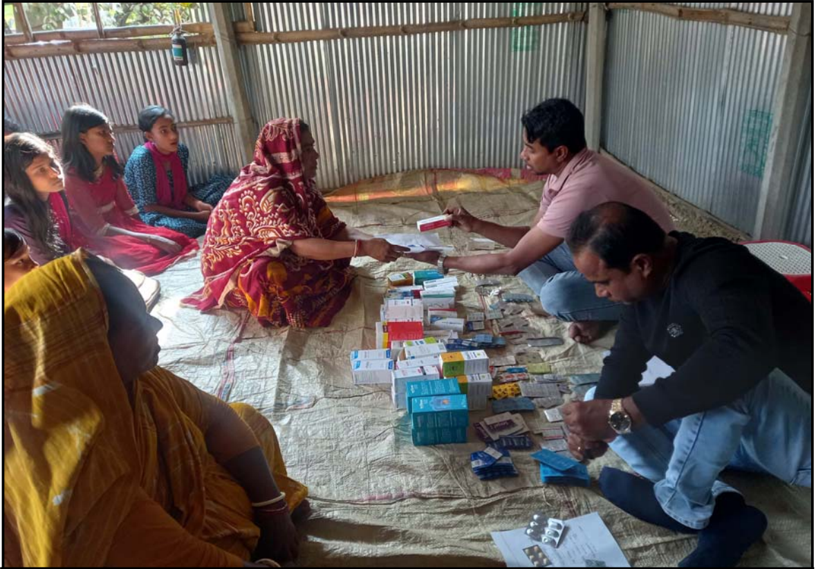
Medicine distribution at Churamankati village...