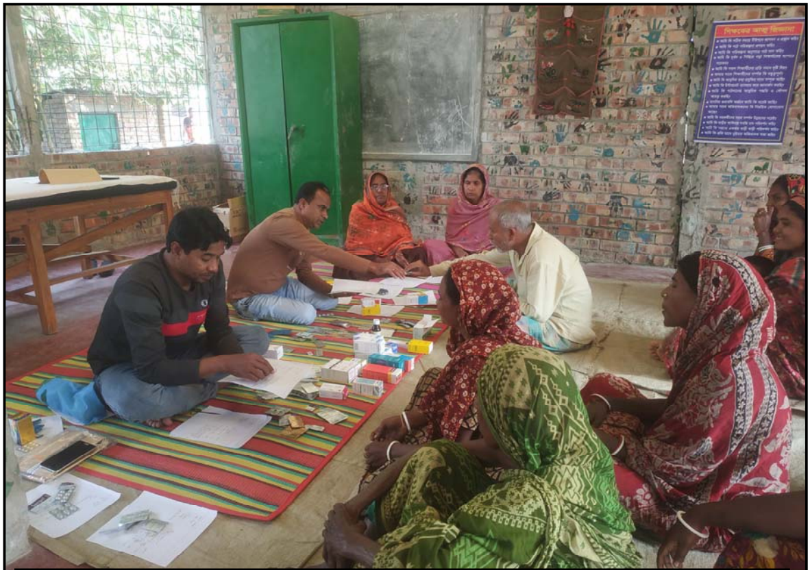
Medicine distribution at Jogahati...