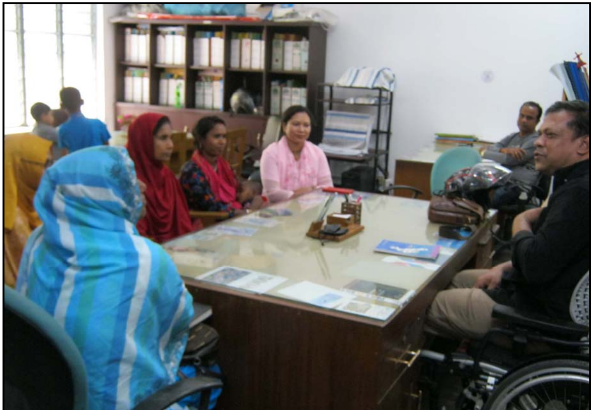
Tuition teacher coordination meeting at BS...