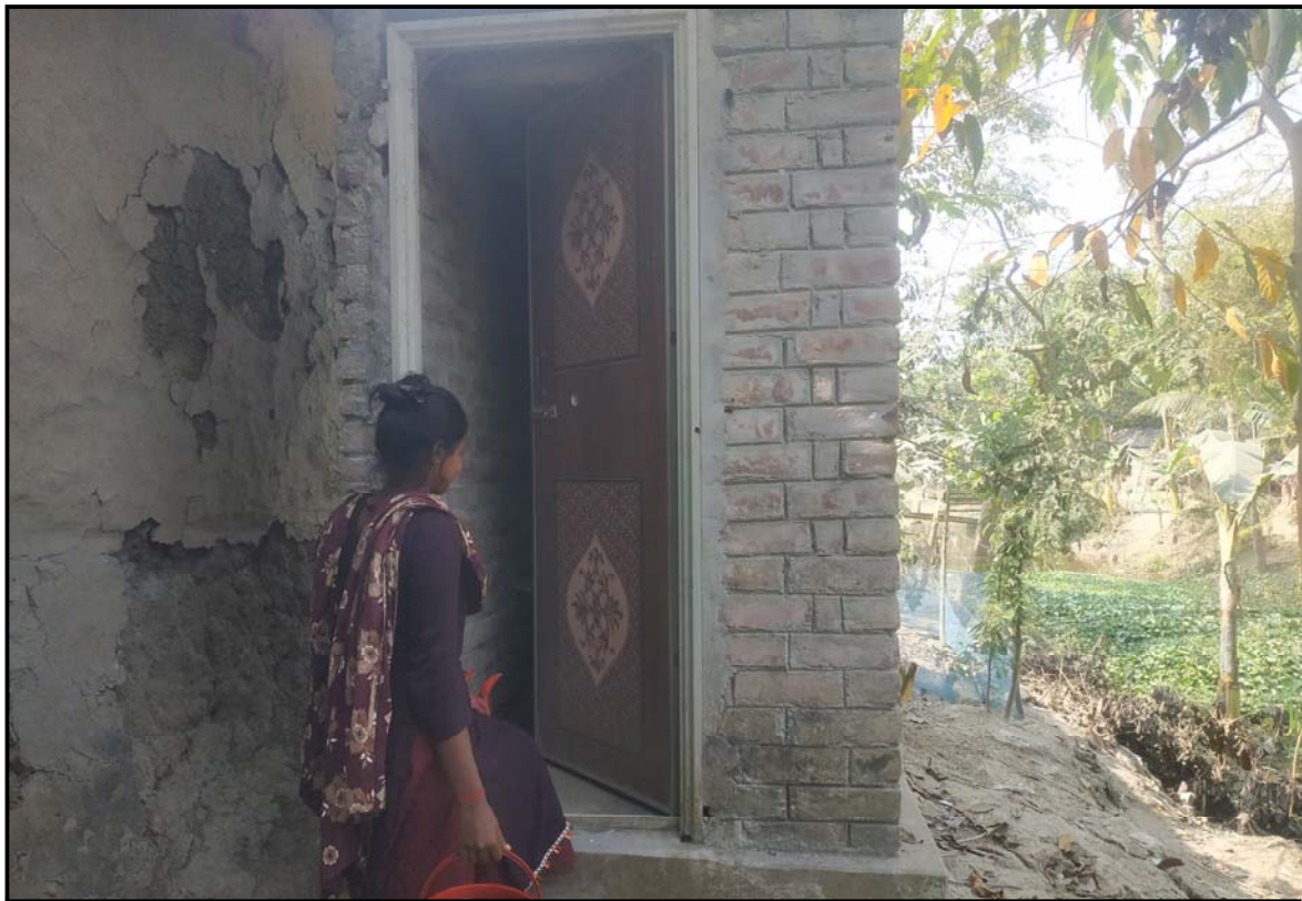
Few years back we built a community latrine in Sorupdaho and its continue using by villagers...