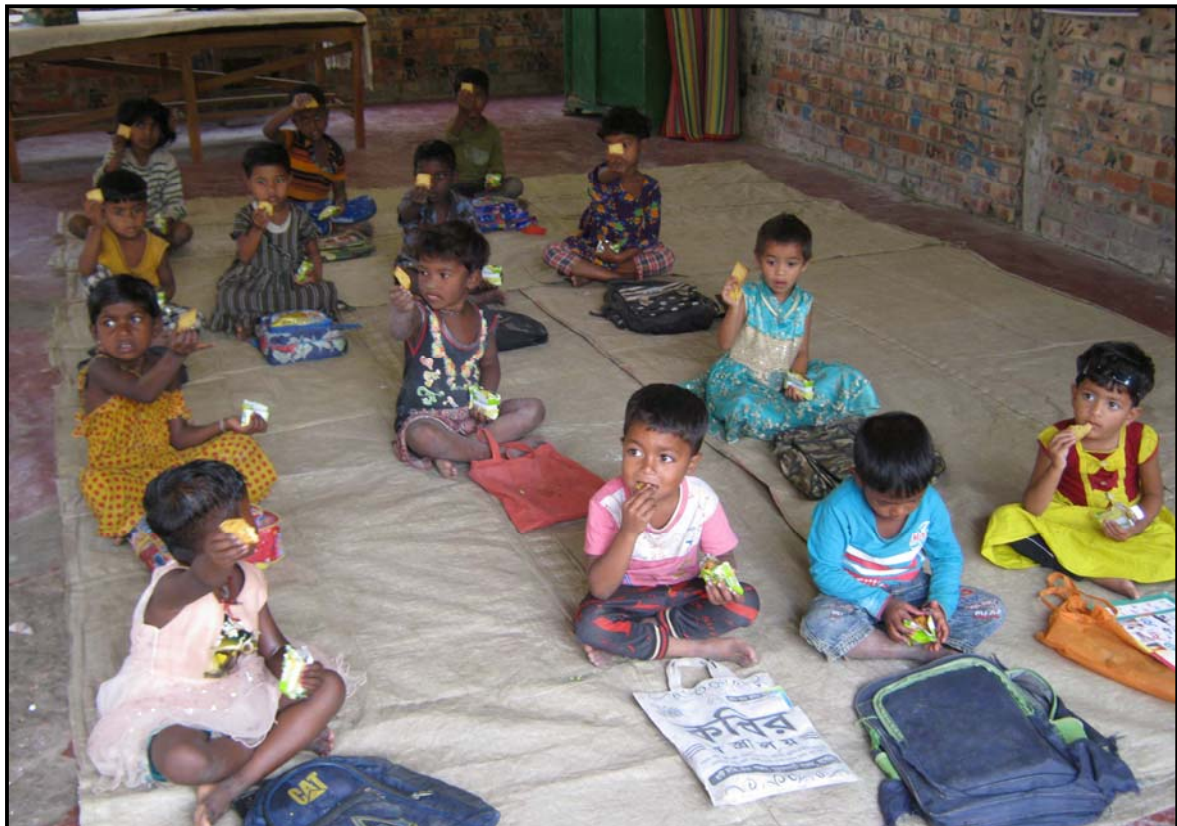
Preschool students enjoying the biscuit in tiffin...