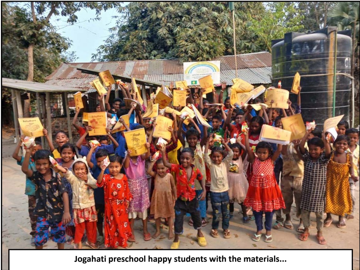
Jogahati preschool happy students with the materials...