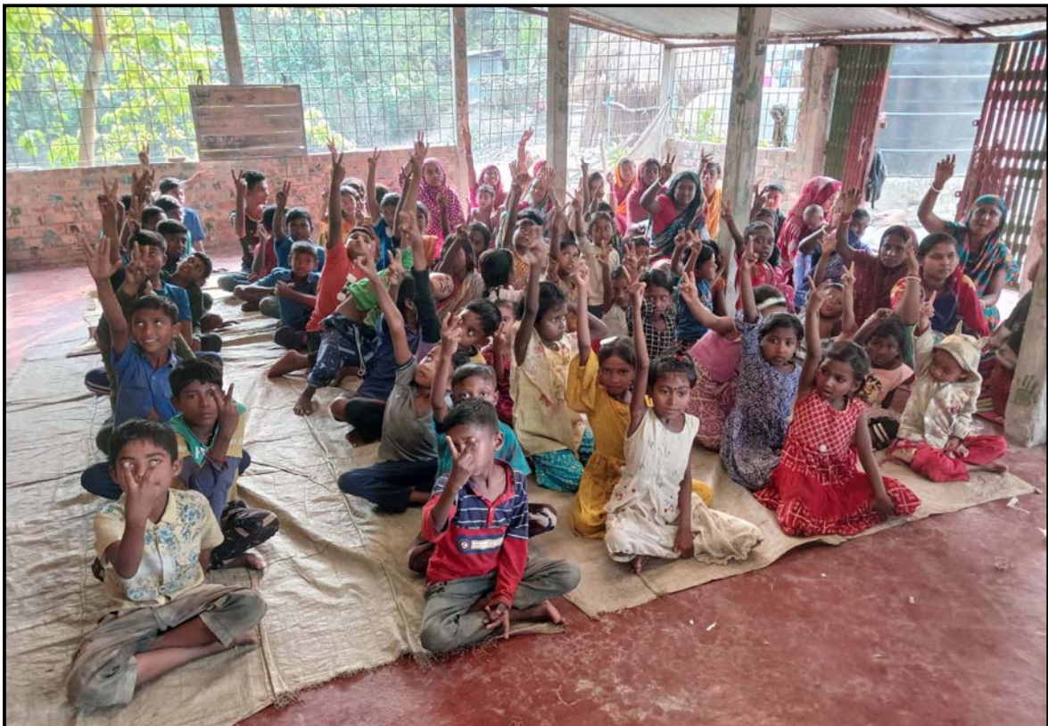
Monthly parents students meeting at Jogahati...