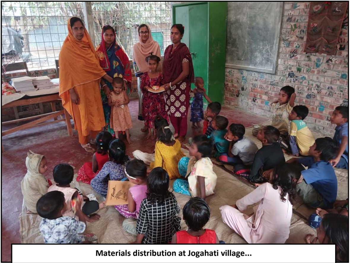
Materials distribution at Jogahati village...