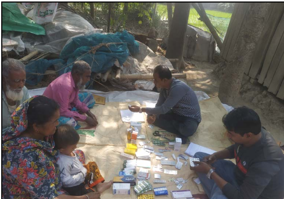
Medicine distribution at Sorupdaho village...