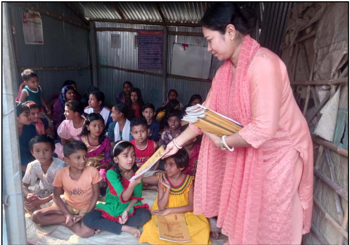
Materials distribution at Churamankati village...