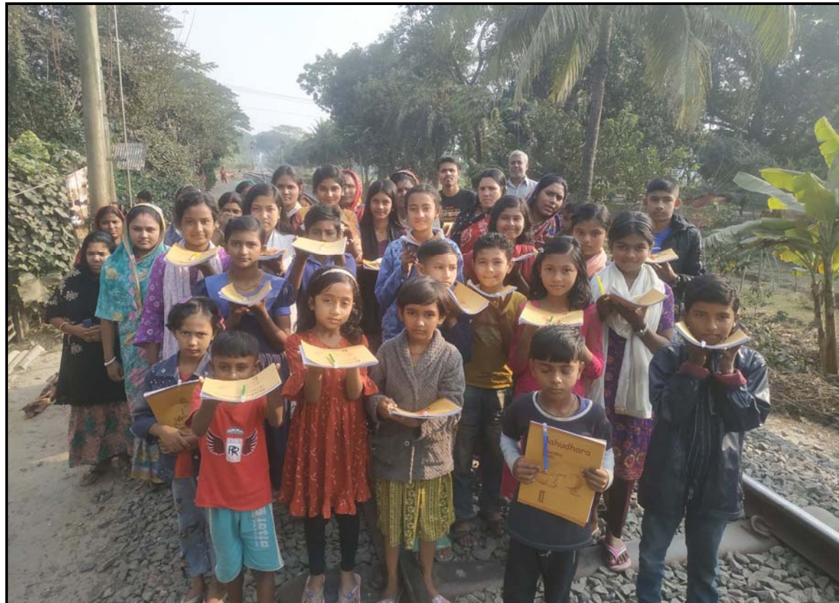
Education materials with the Churamankati students...