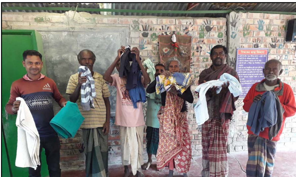
We distributed some cloths to Jogahati village people...