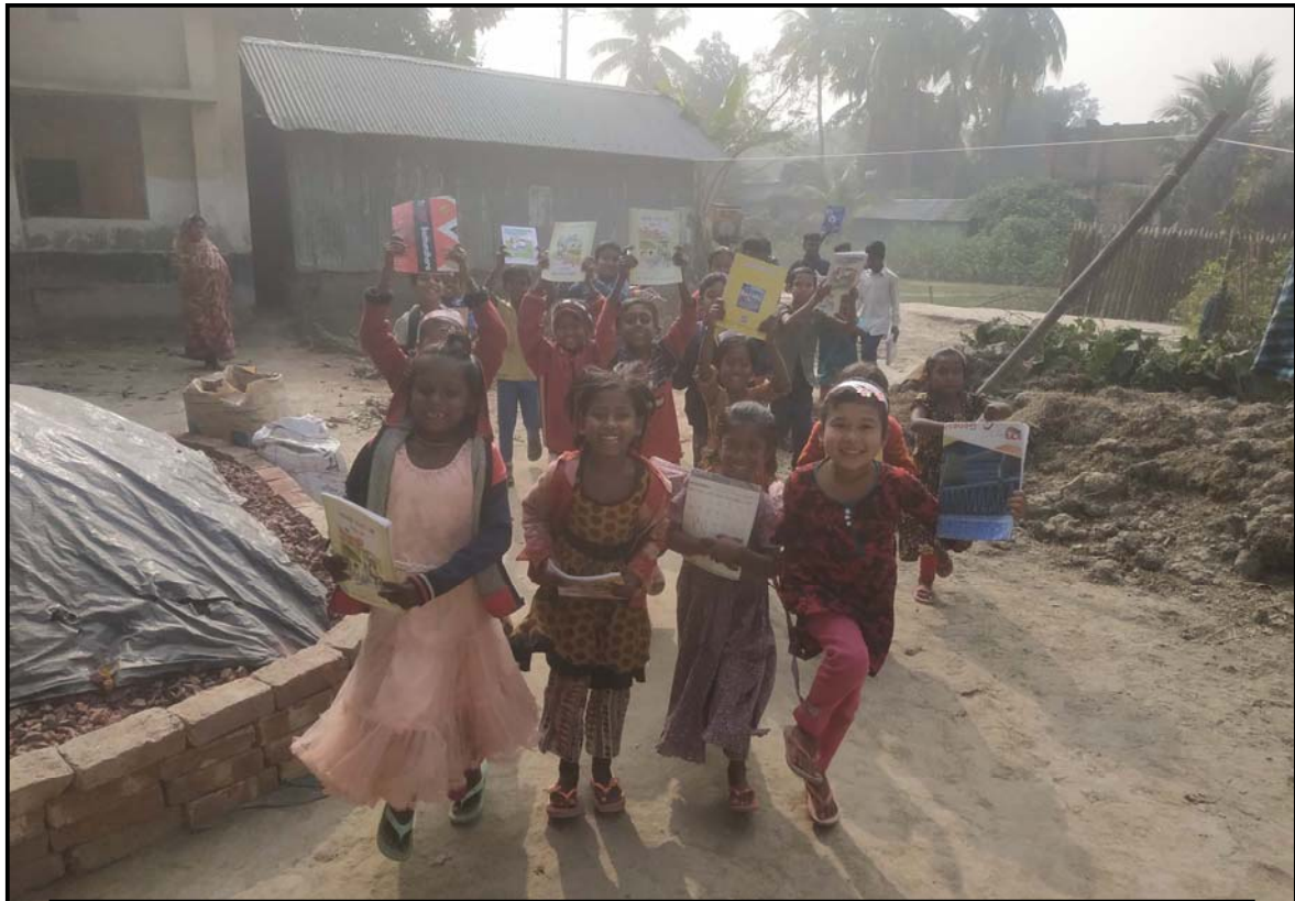
New class new books. Happiness...