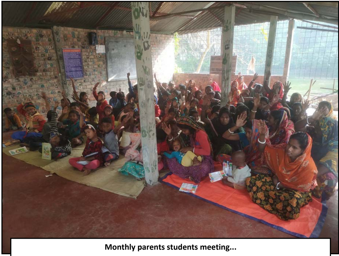
Monthly parents students meeting...