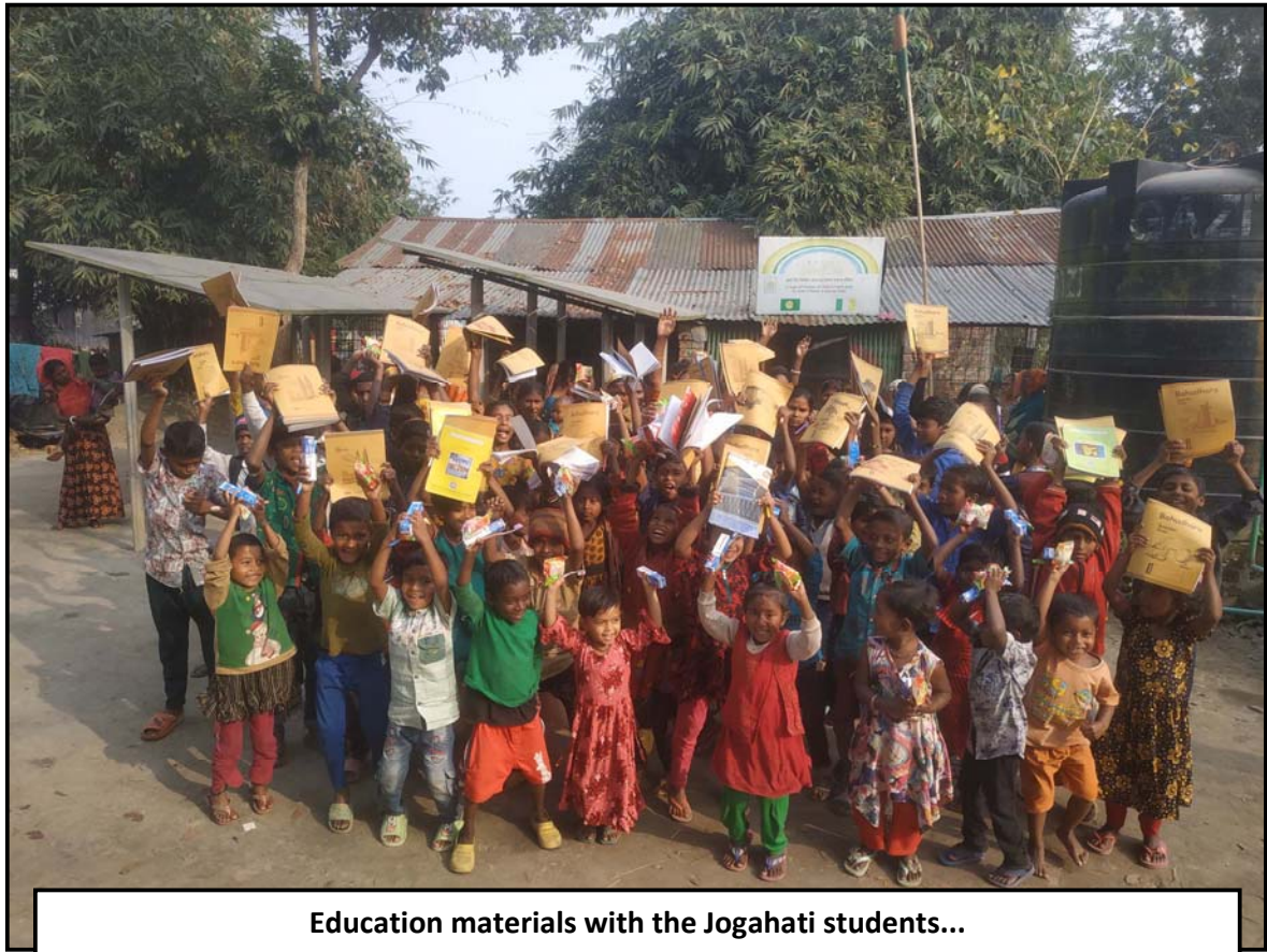
Education materials with the Jogahati students...