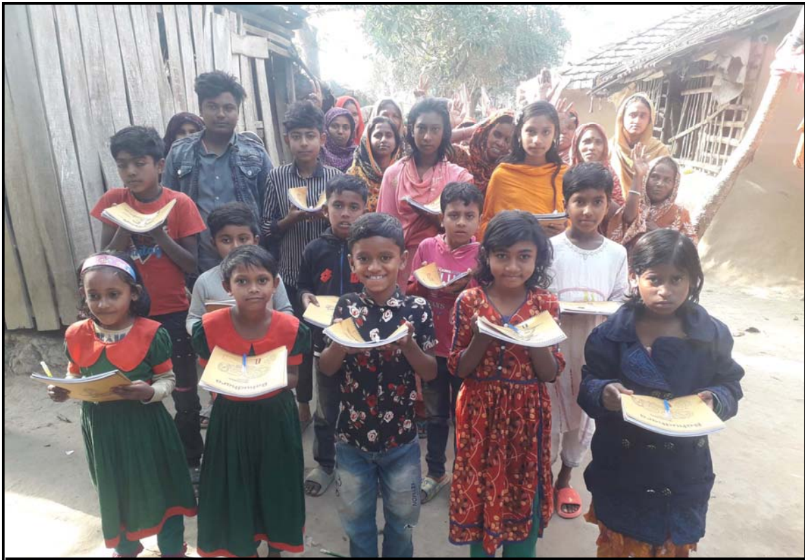
Education materials with the Sorupdaho students...