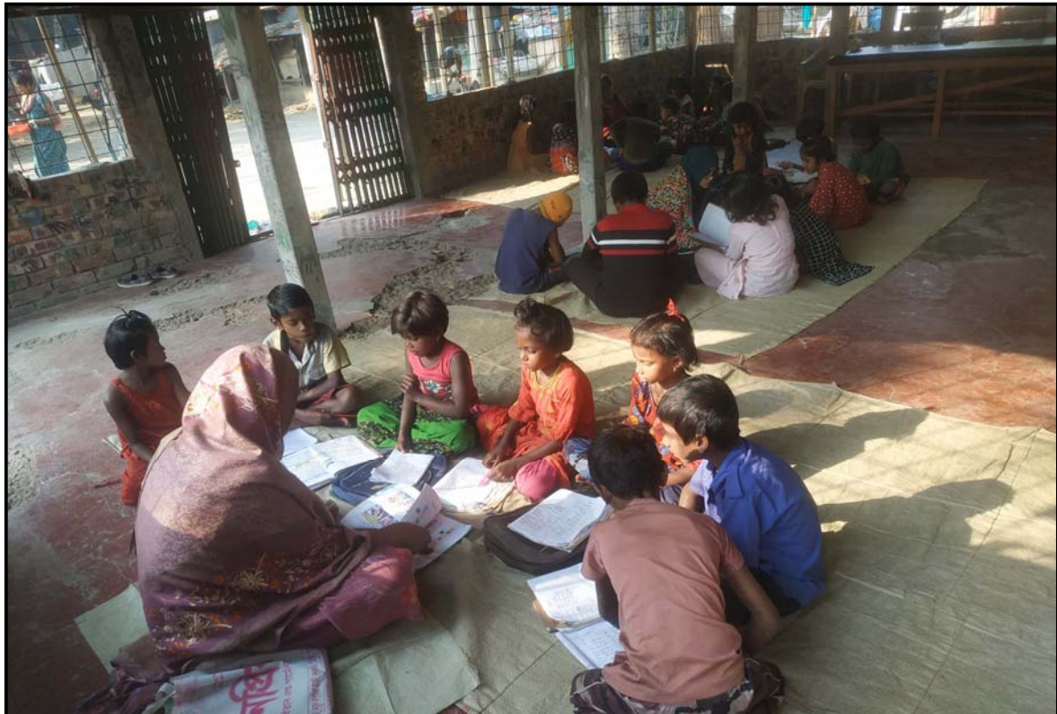
Jogahati tuition classes...