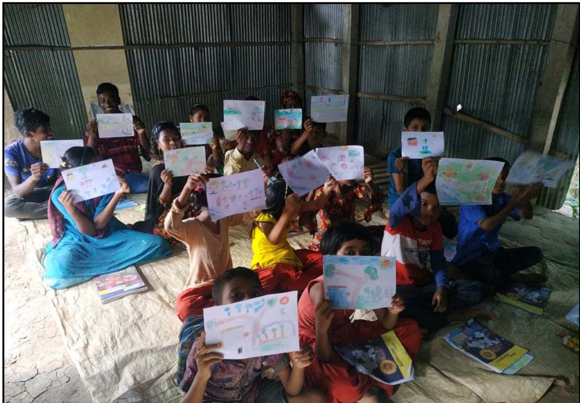
Sorupdaho students after drawing....