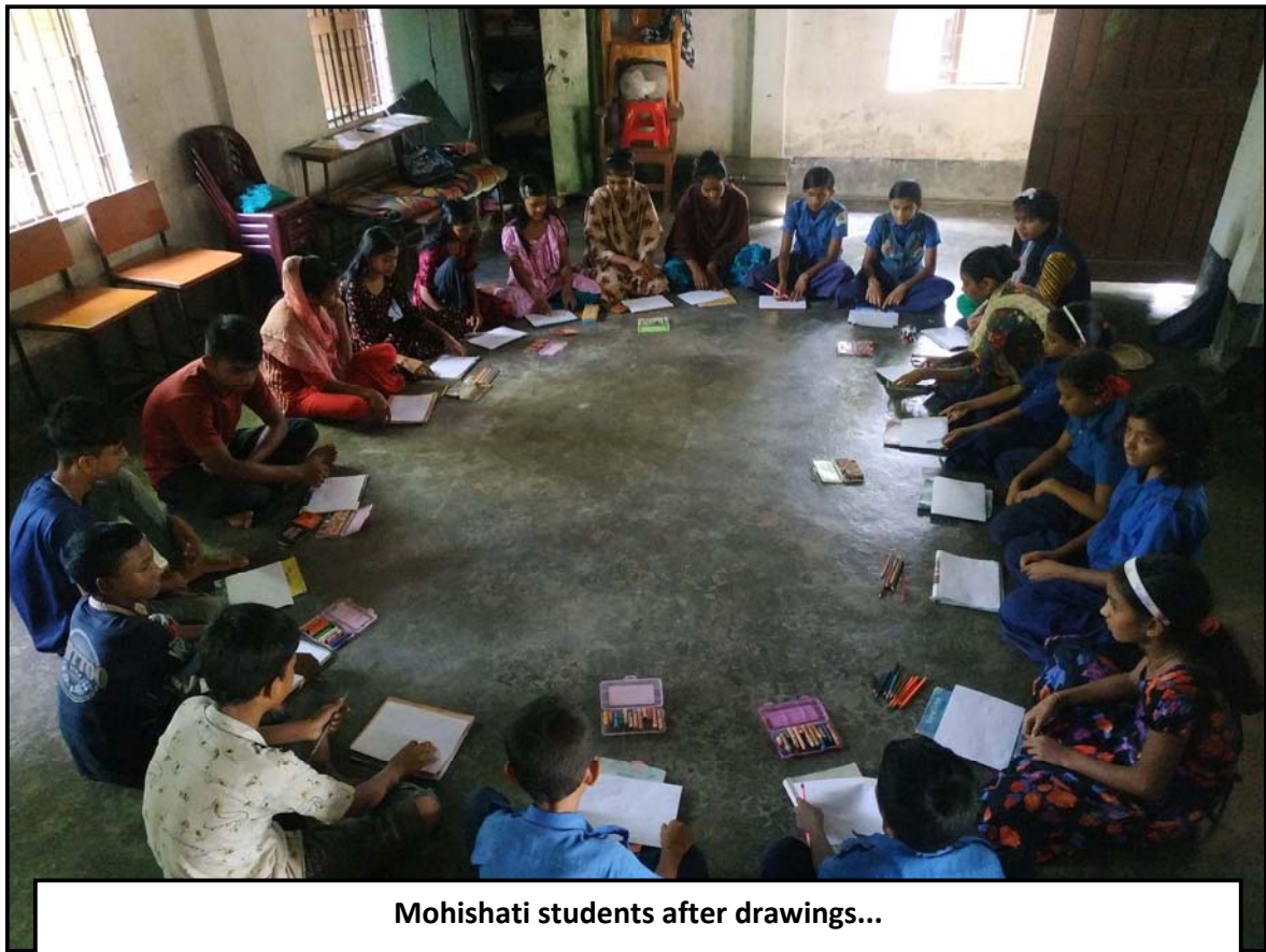
Mohishati students after drawings...