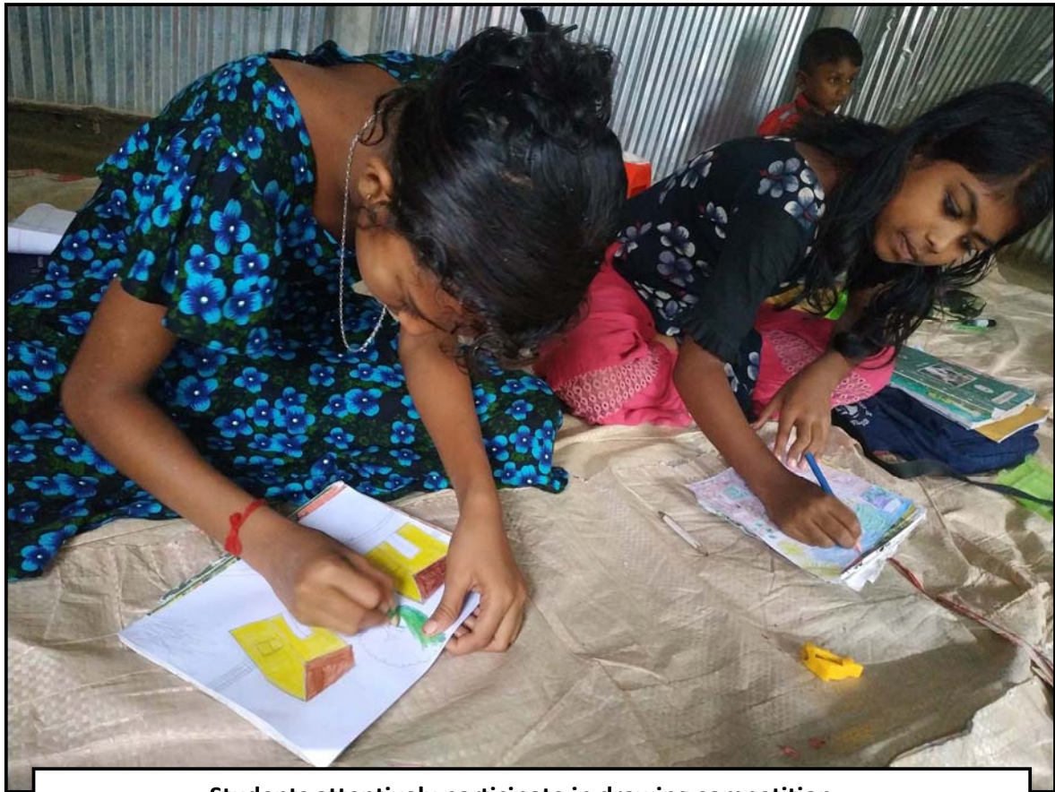
Students attentively participate in drawing competition...