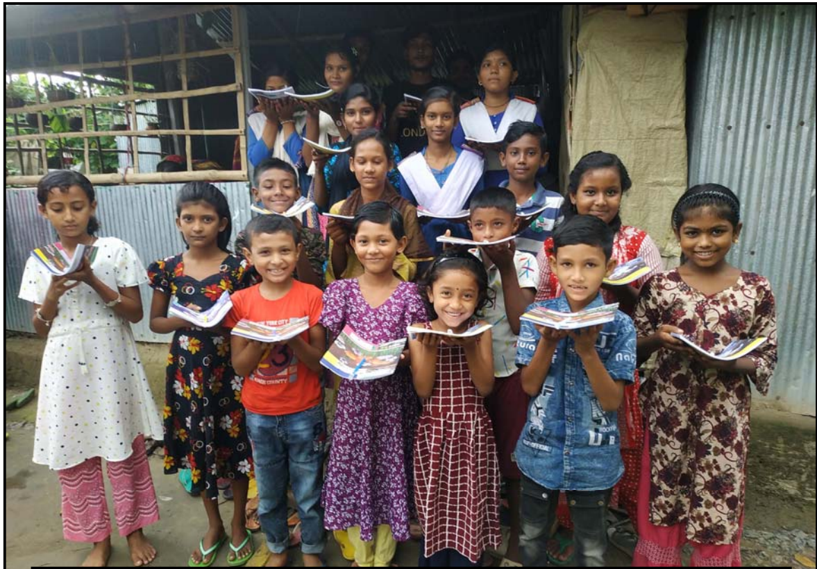
Materials distribution at Churamankati village...