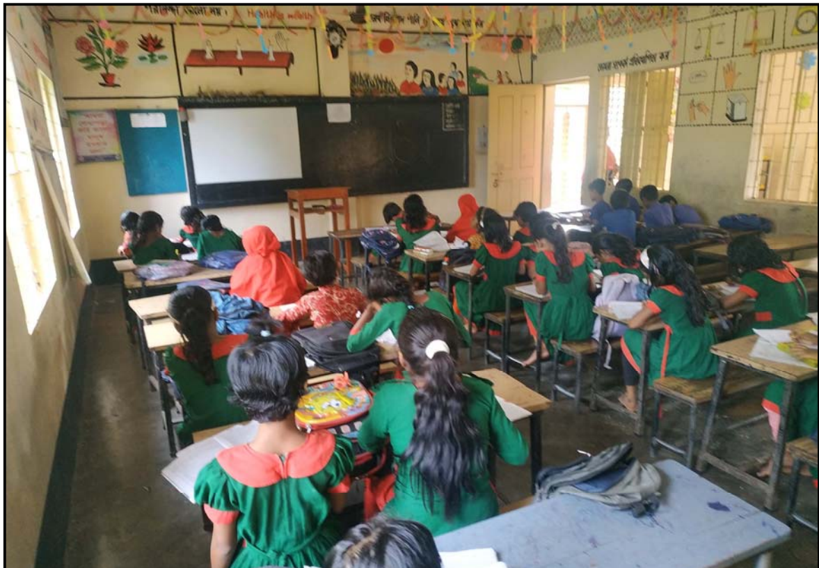
Our student attending class at a local government school...