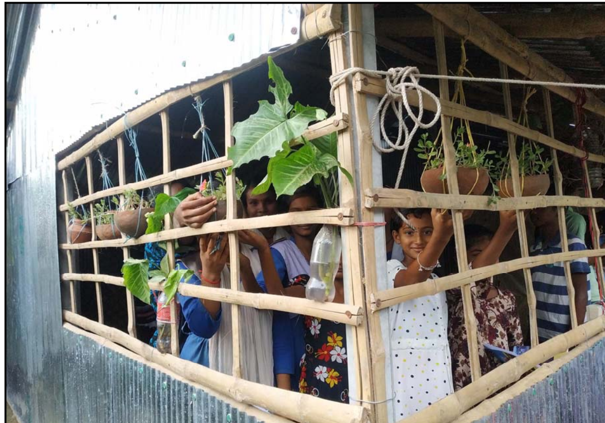
Churamankati students added a touch of nature to their new study center by planting plants...