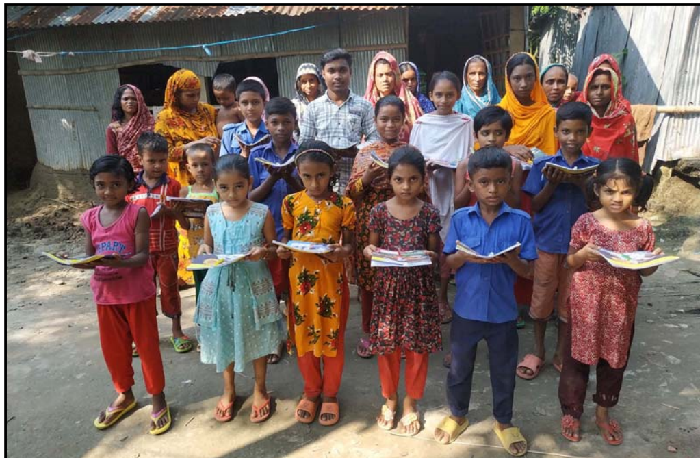
Sorupdaho students with the materials...