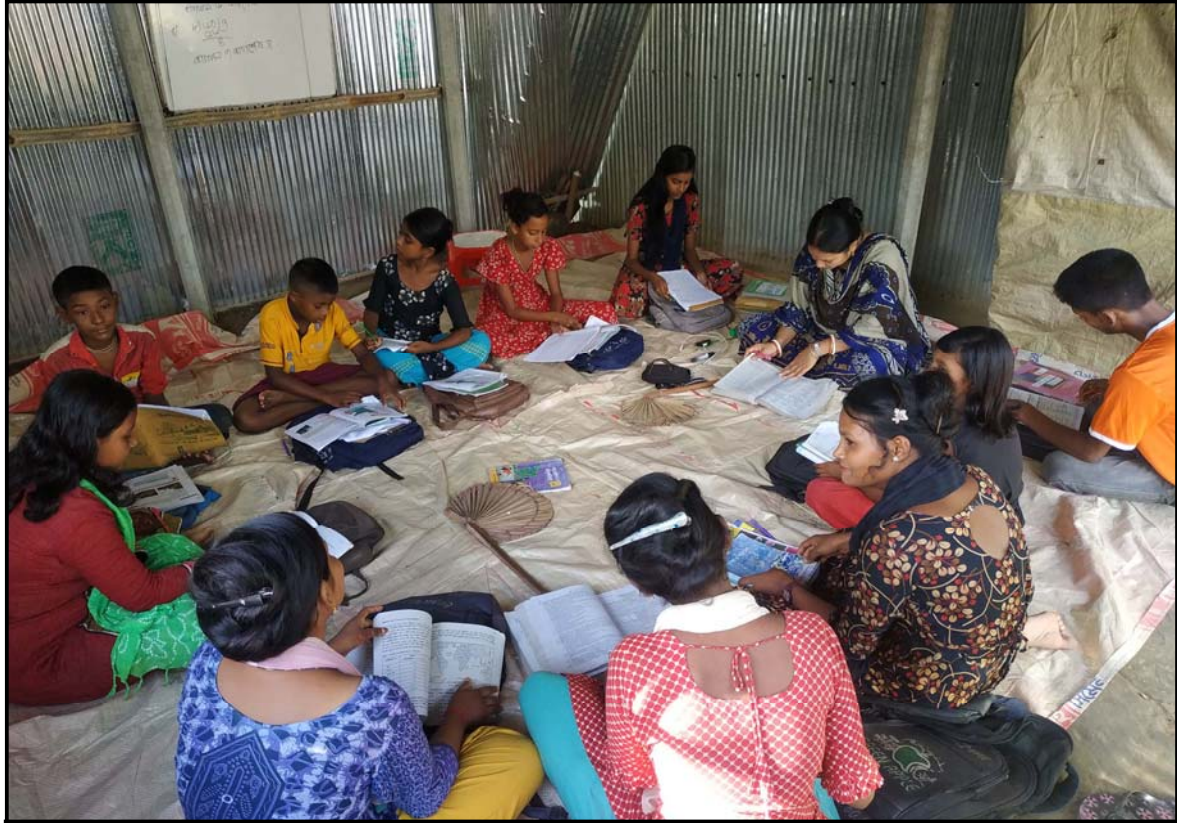
Churamankati tuition class....