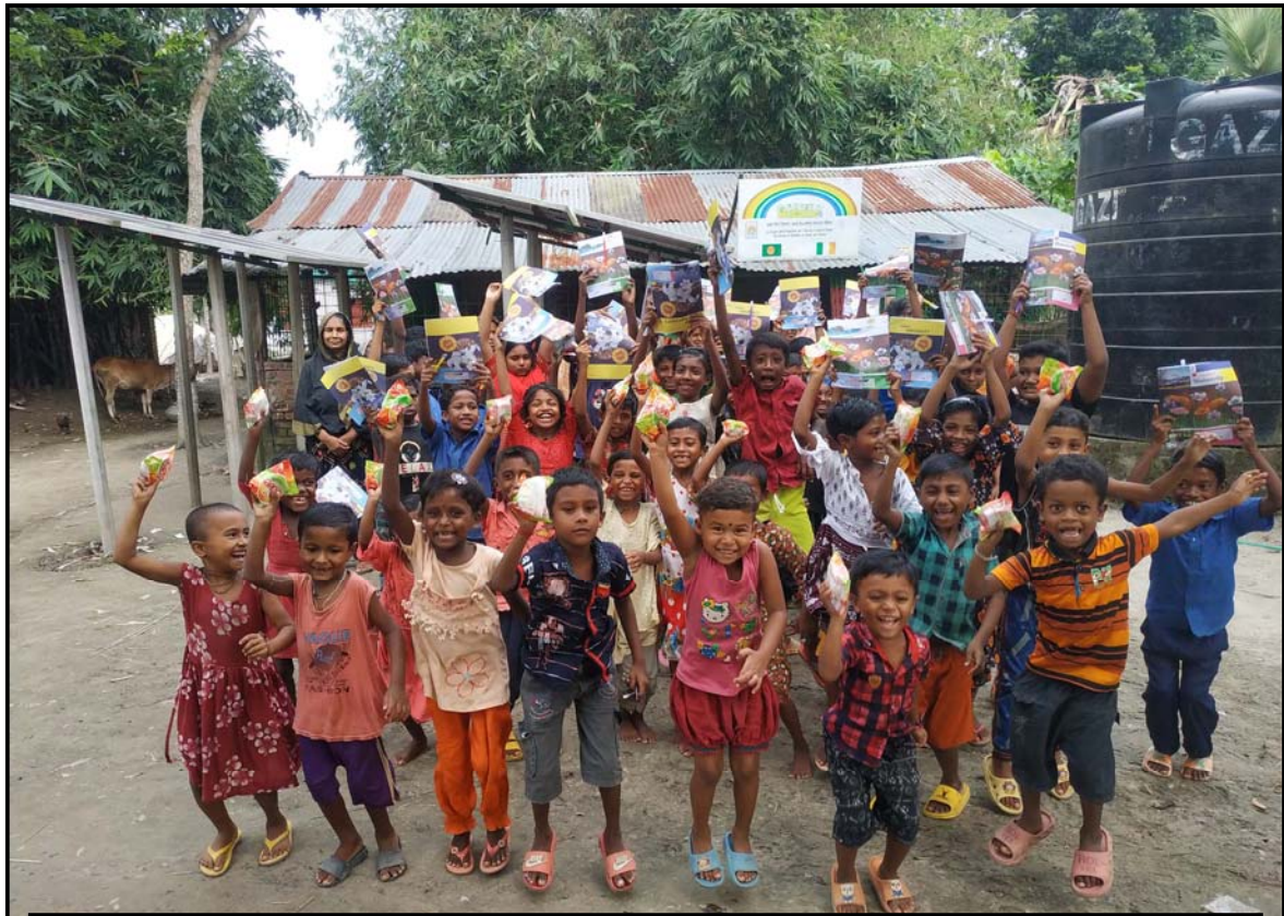
Jogahati village students received the materials...