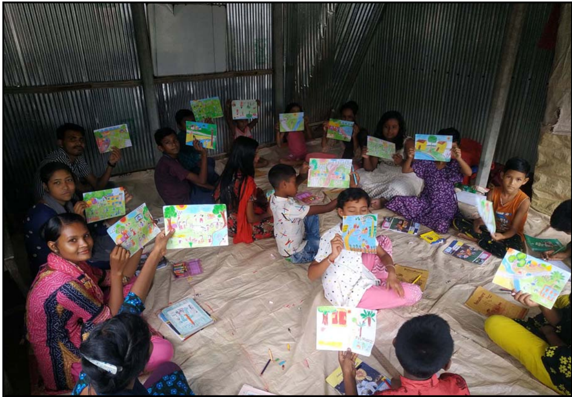
Churamankati students after drawings...