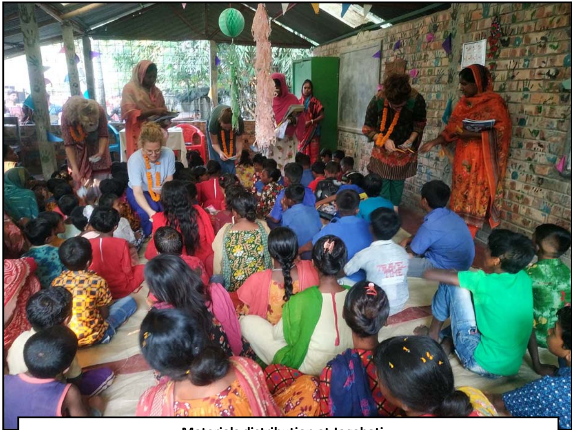
Materials distribution at Jogahati...