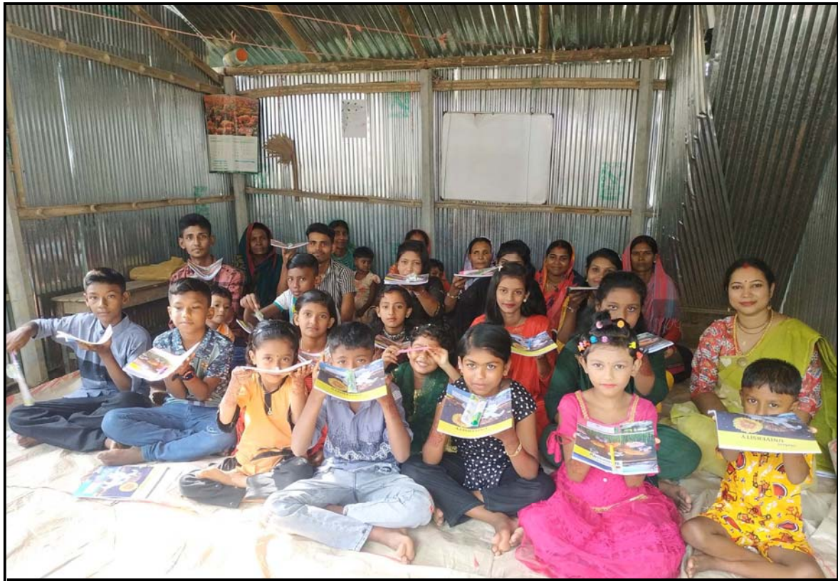
Churamankati students with the materials...