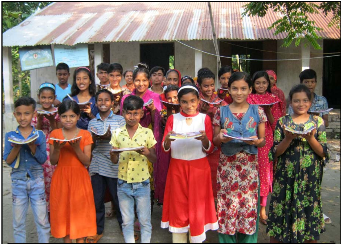
Mohishati village students received the materials...