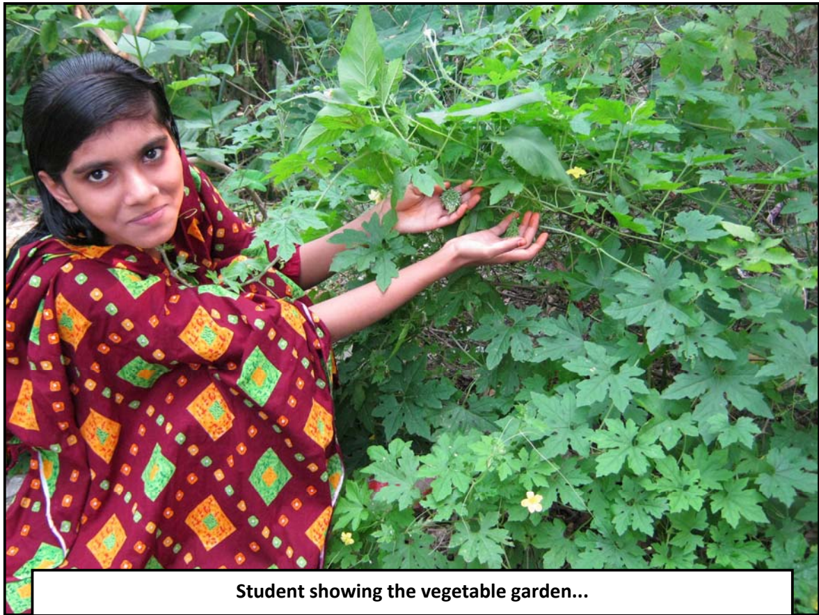
Student showing the vegetable garden...