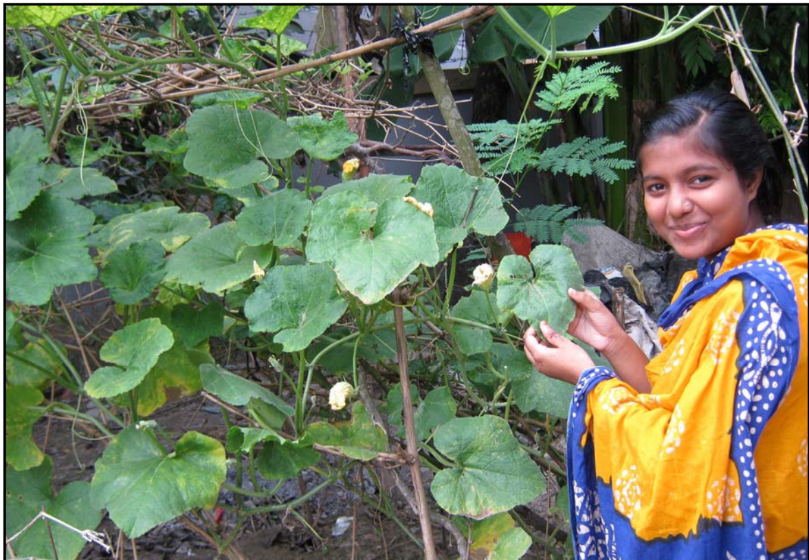
Student showing the vegetable garden...