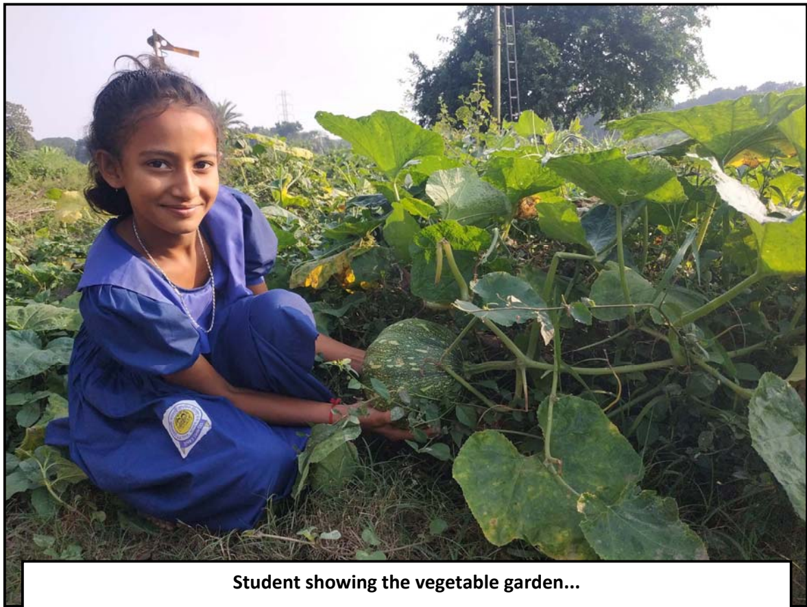
Student showing the vegetable garden...