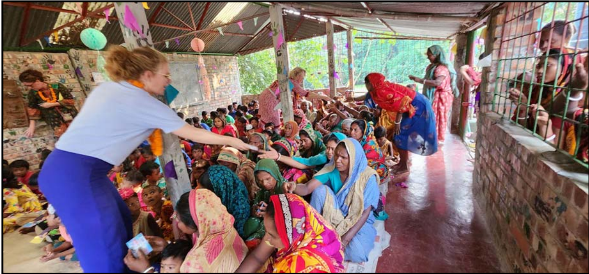
Dutch friends distributed the materials at Jogahati village....