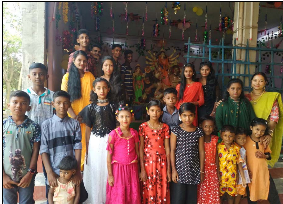
Students & Teachers celebrate the Durga Puja....