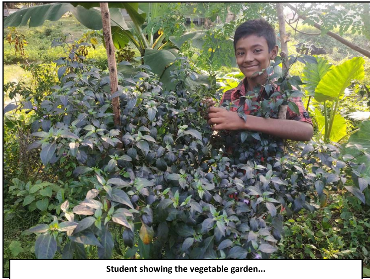
Student showing the vegetable garden...