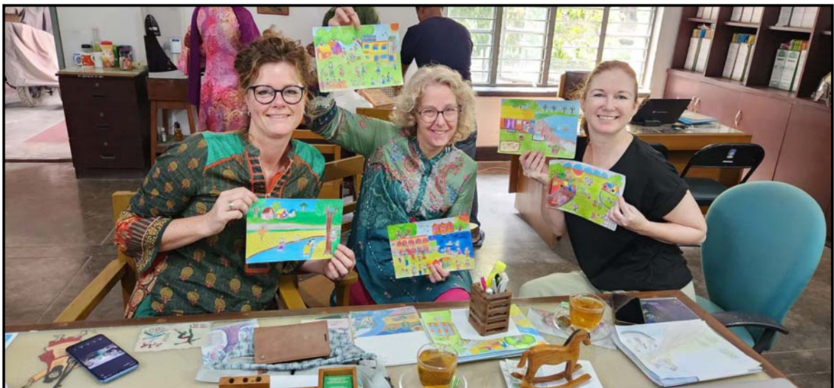
Dutch friends help us to select the drawings for 2023 Christmas Greetings Card...