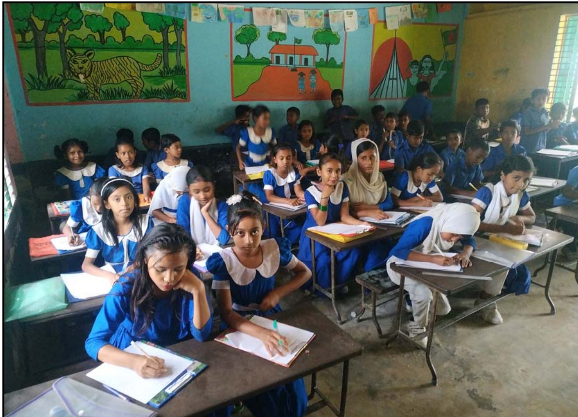
Students at local school....