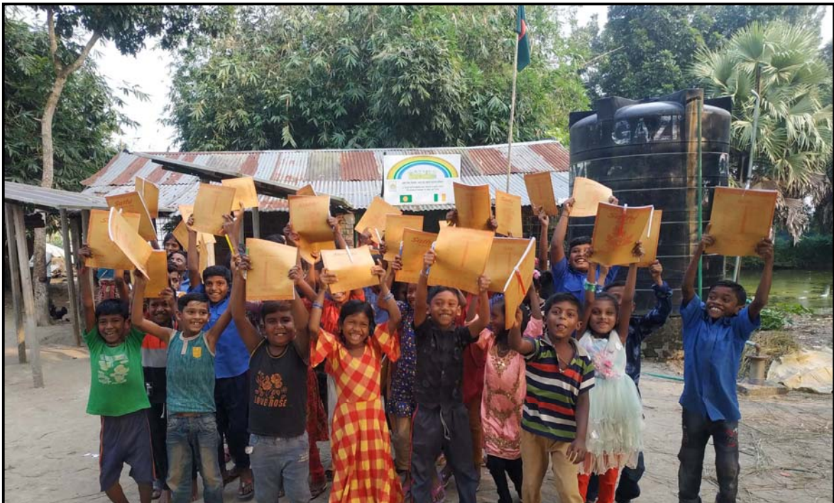
Jogahati village students with materials...