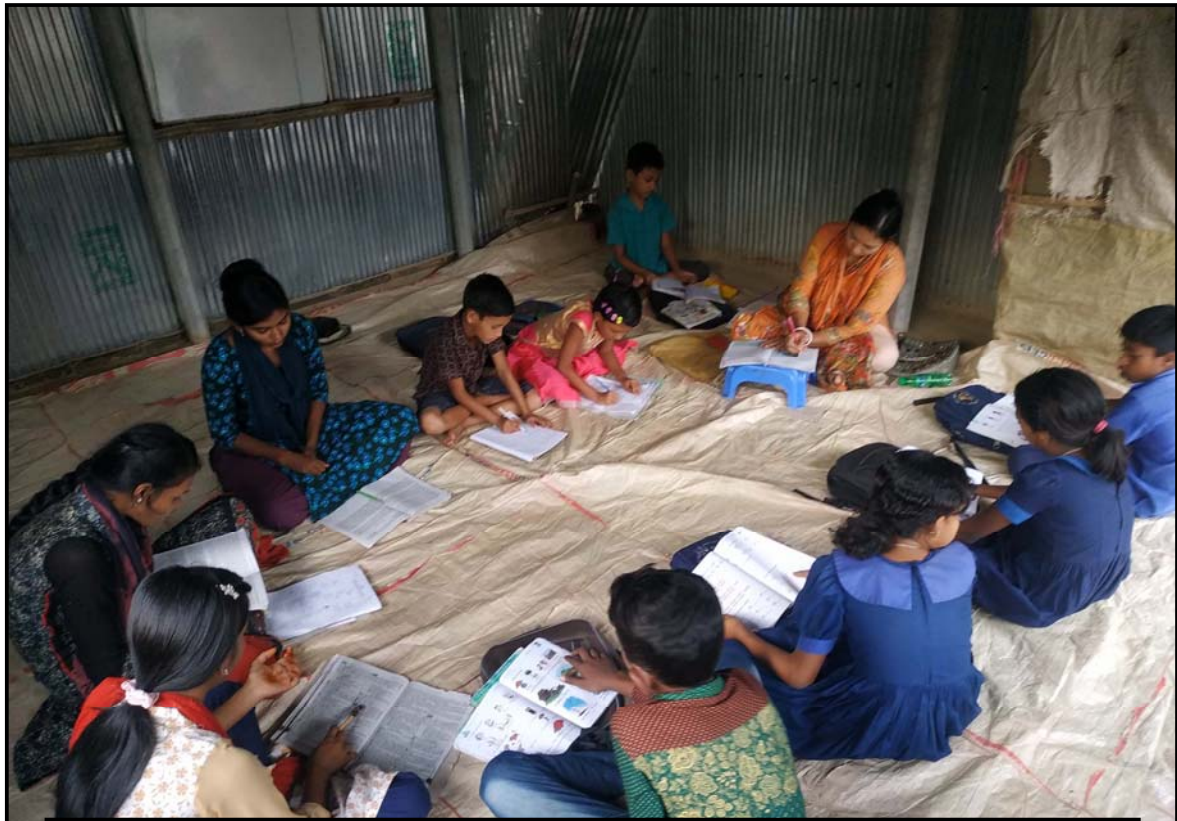
Tuition class at Churamankati village...