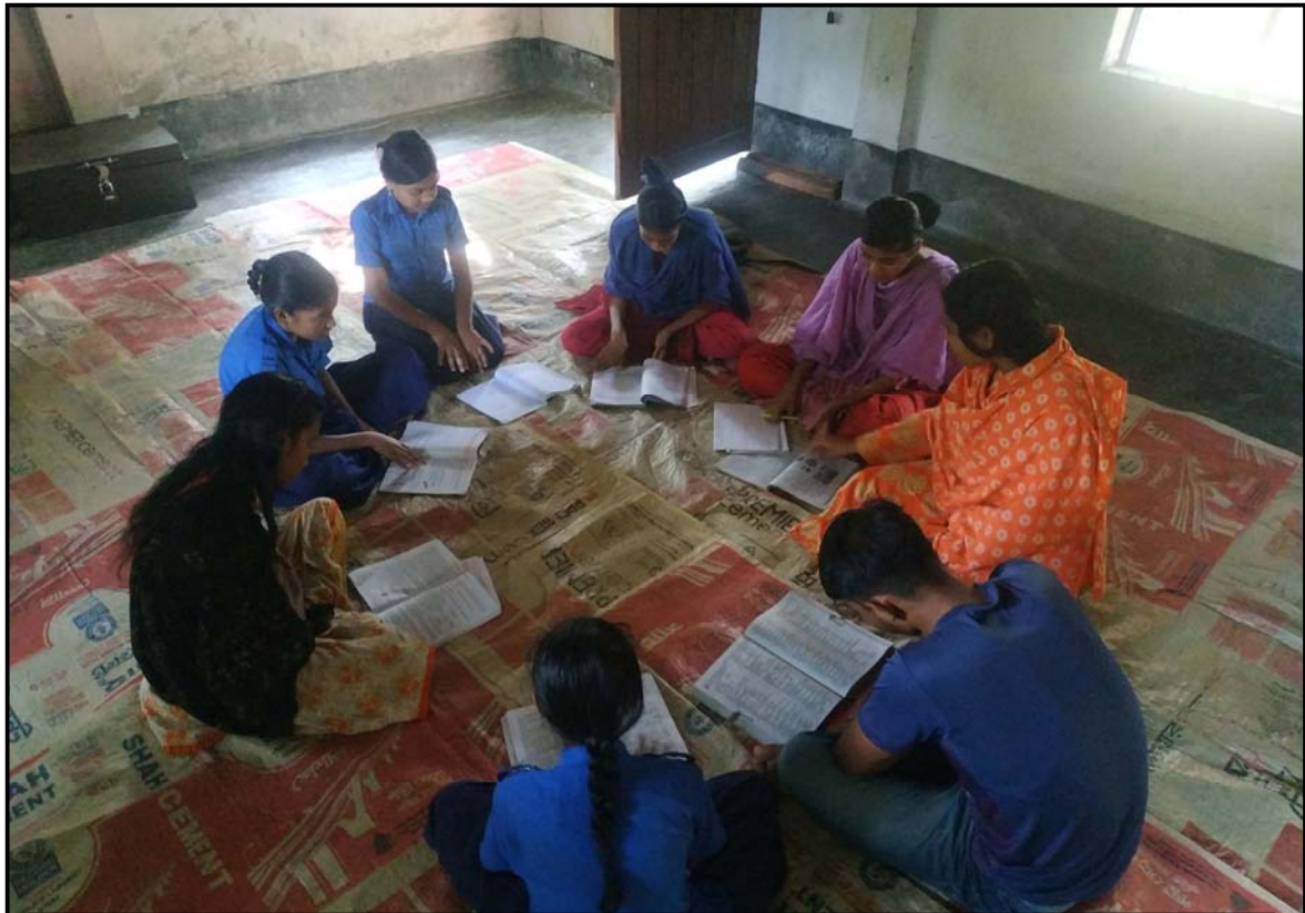
Tuition class at Mohishati village...