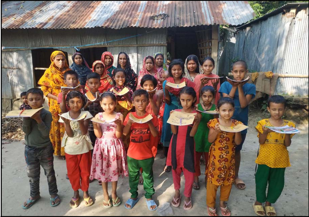
Sorupdaho village students with the materials....