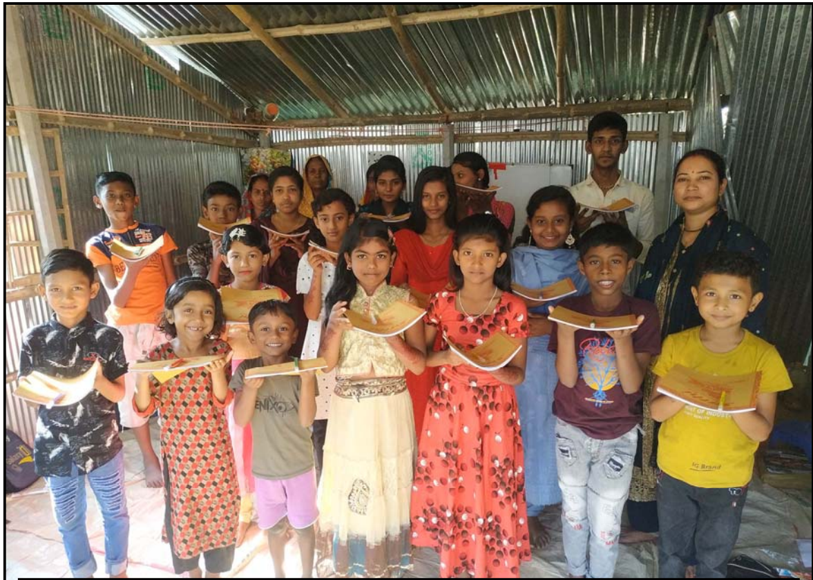
Churamankati village students received the materials...