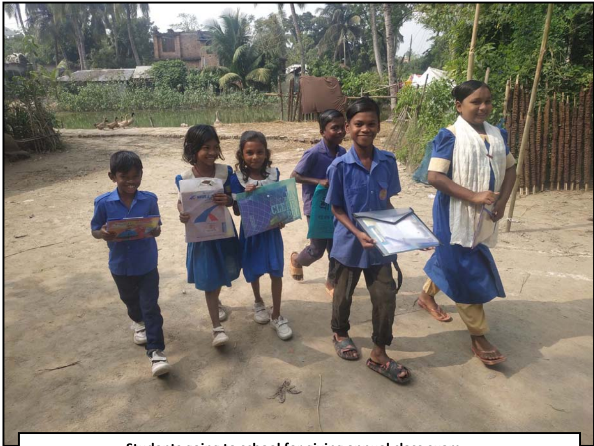
Students going to school for giving annual class exam...