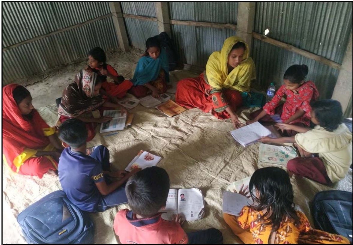
Sorupdaho village tuition class...