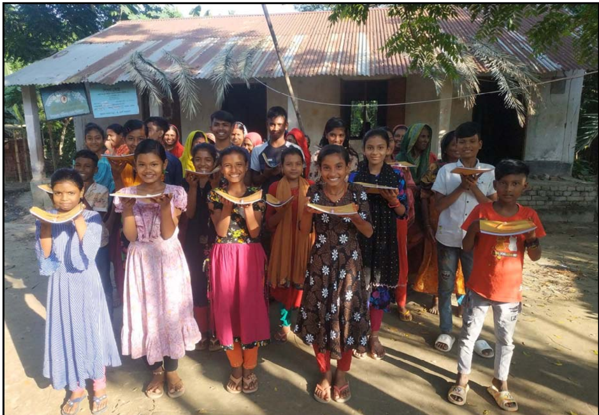
Mohishati student with the education materials...