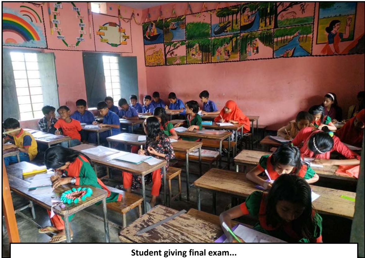
Student giving final exam...