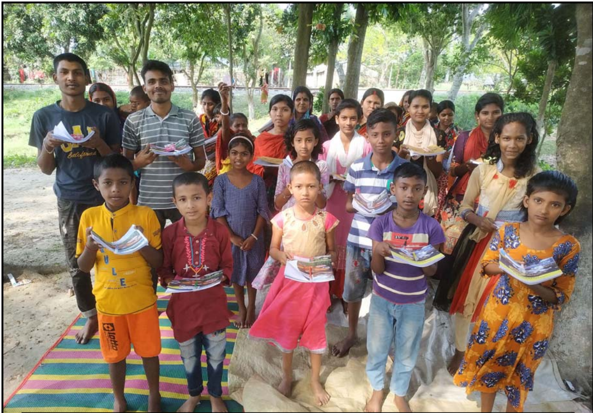
Churamankati village students received the materials...