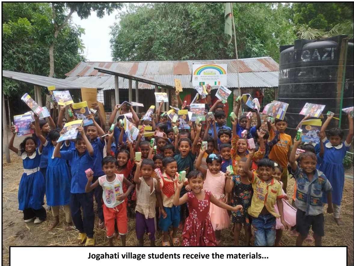
Jogahati village students receive the materials...