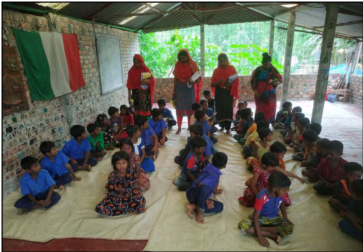
Materials distribution at Jogahati village...