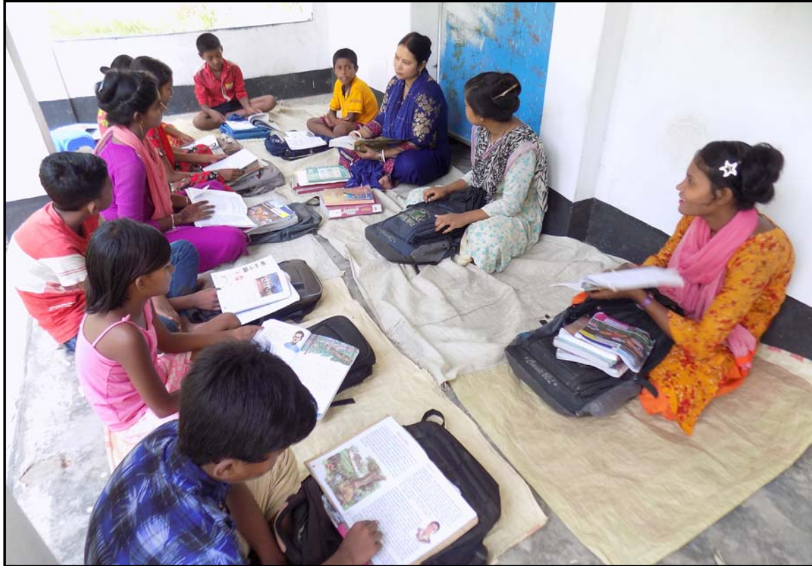
Tuition class at Churamankati village....