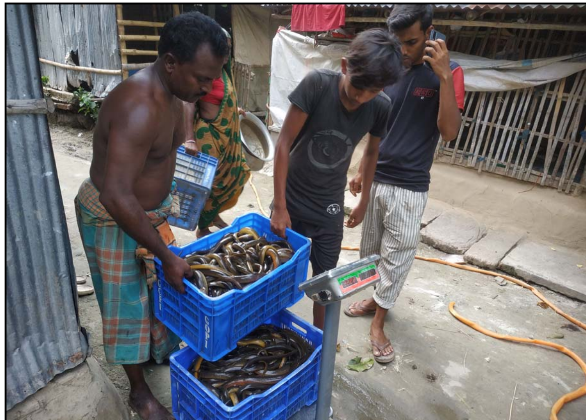
Jogahati families doing the fishing bussiness....