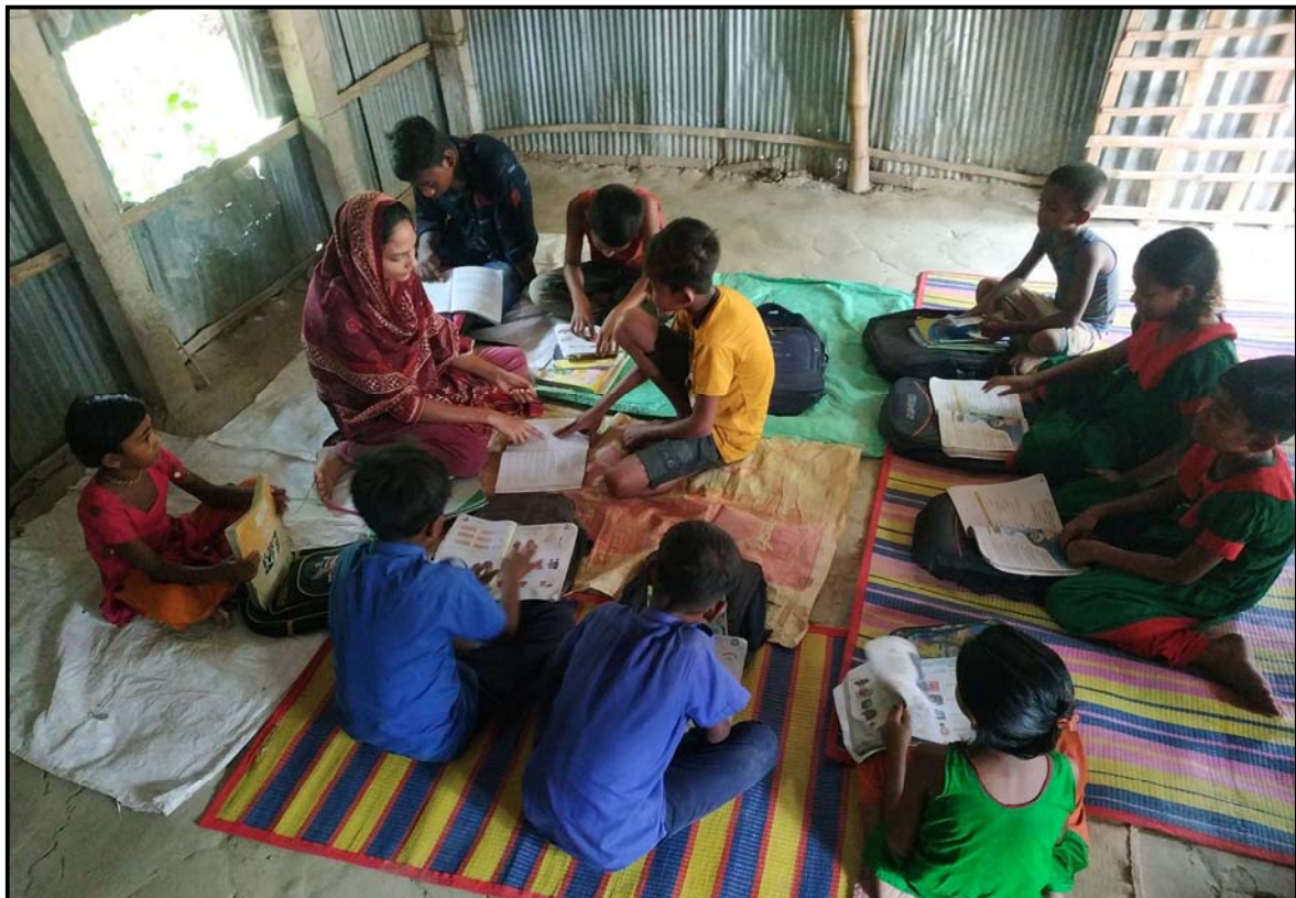
Sorupdaho tuition class...