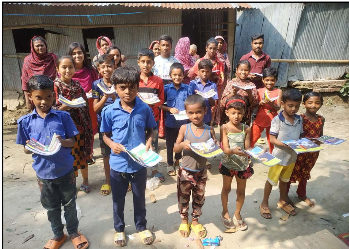
Sorupdaho village children received the materials...