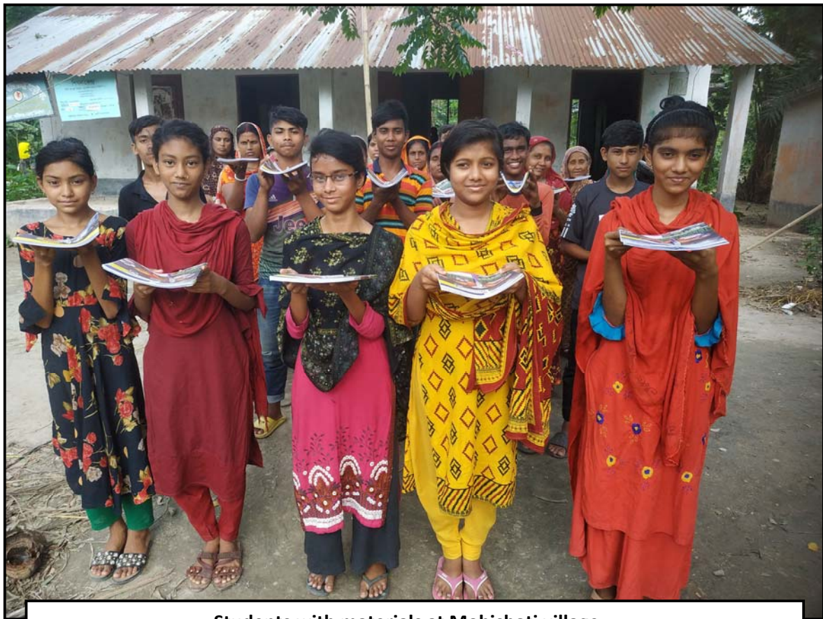
Students with materials at Mohishati village...