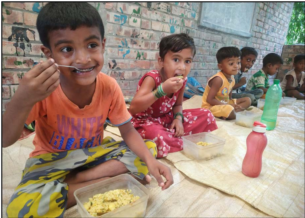
Pre-school Students enjoying the warm meal...