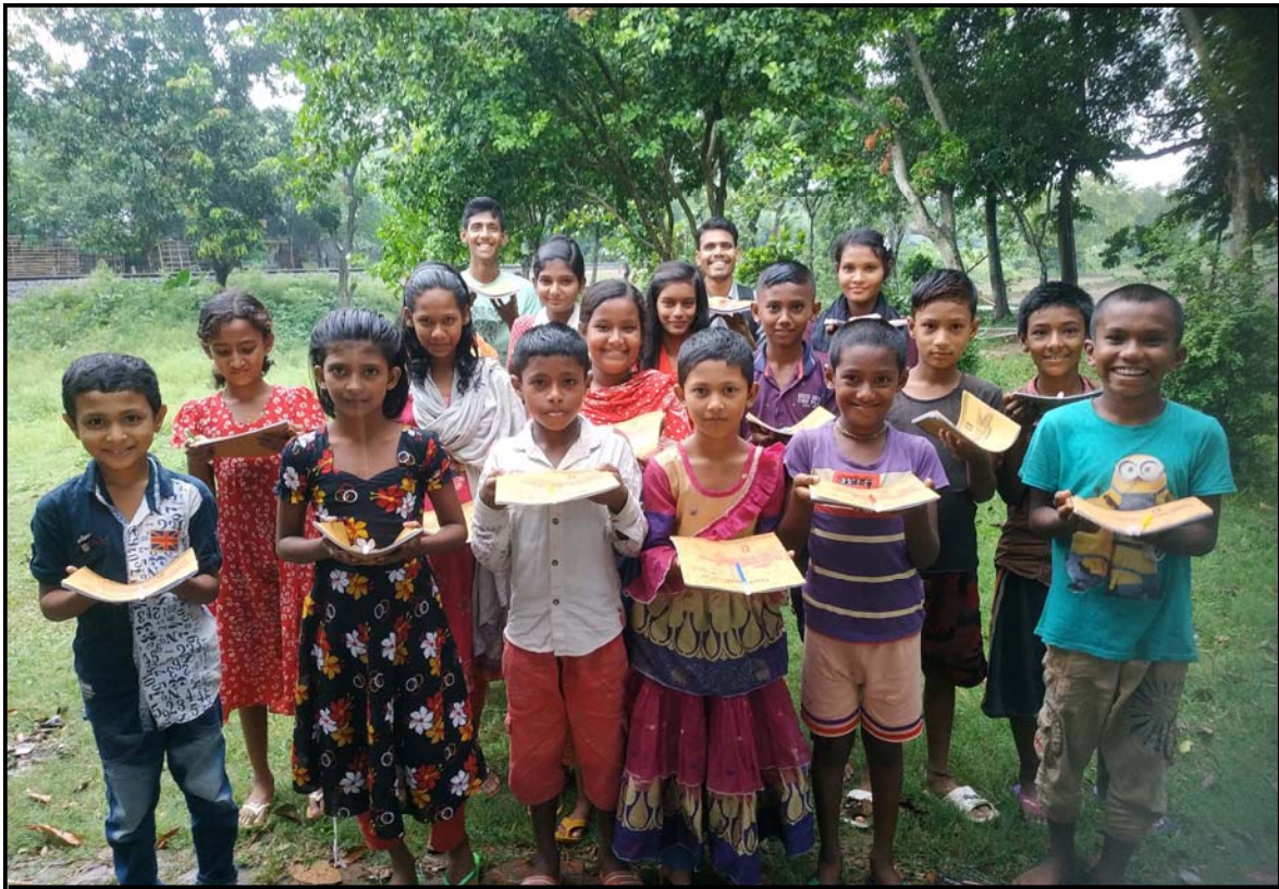
Materials distribution at Churamankati village...