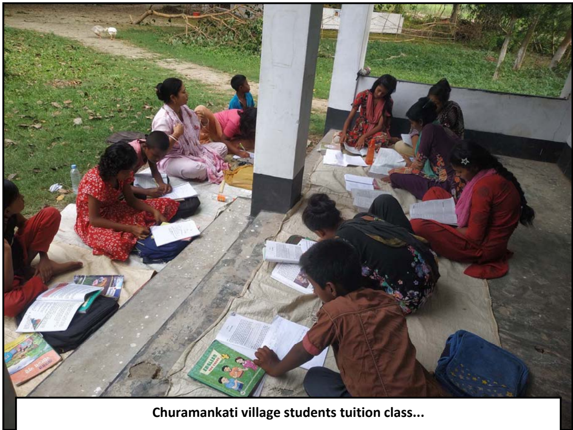
Churamankati village students tuition class...