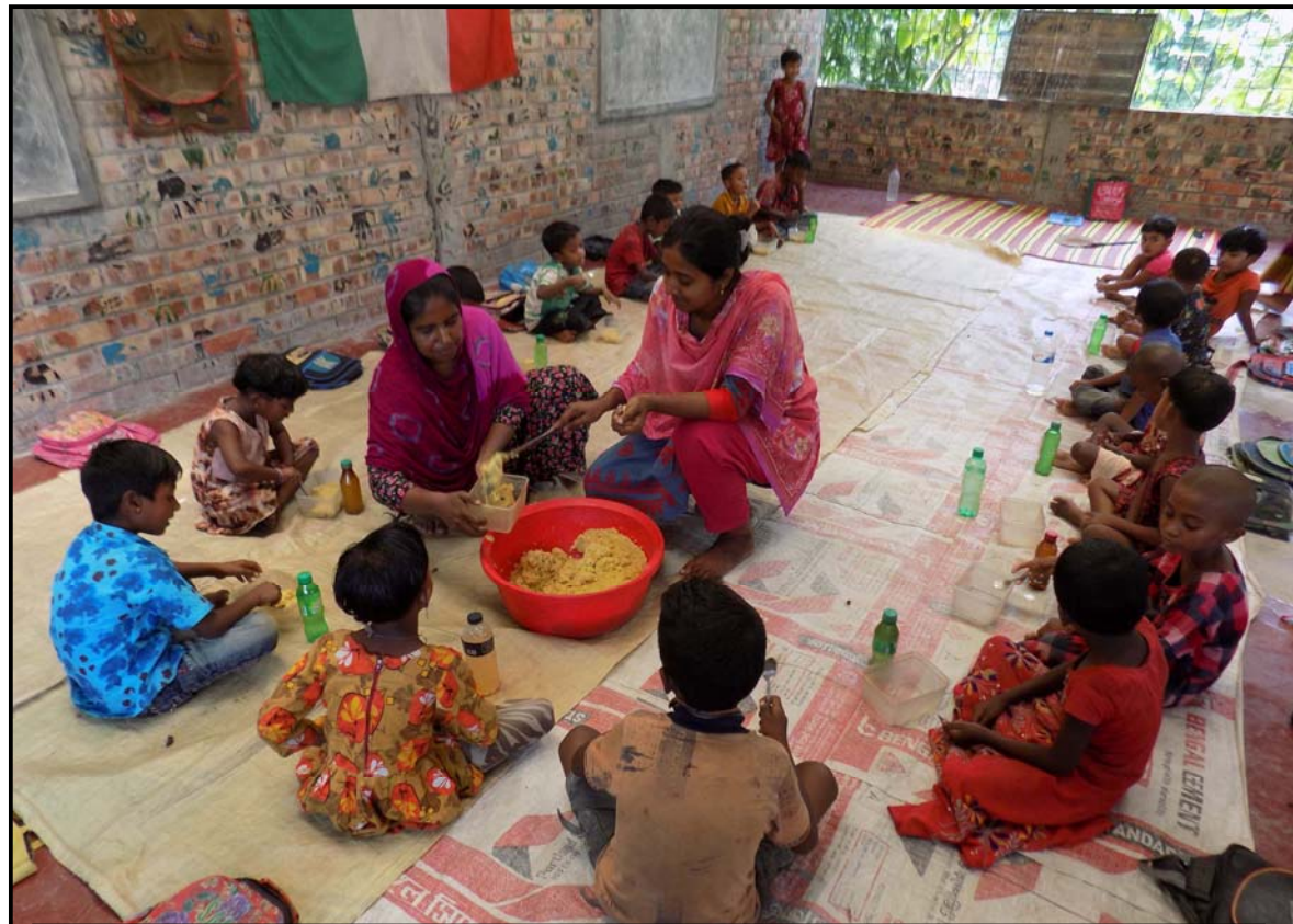
Distribution of warm food...