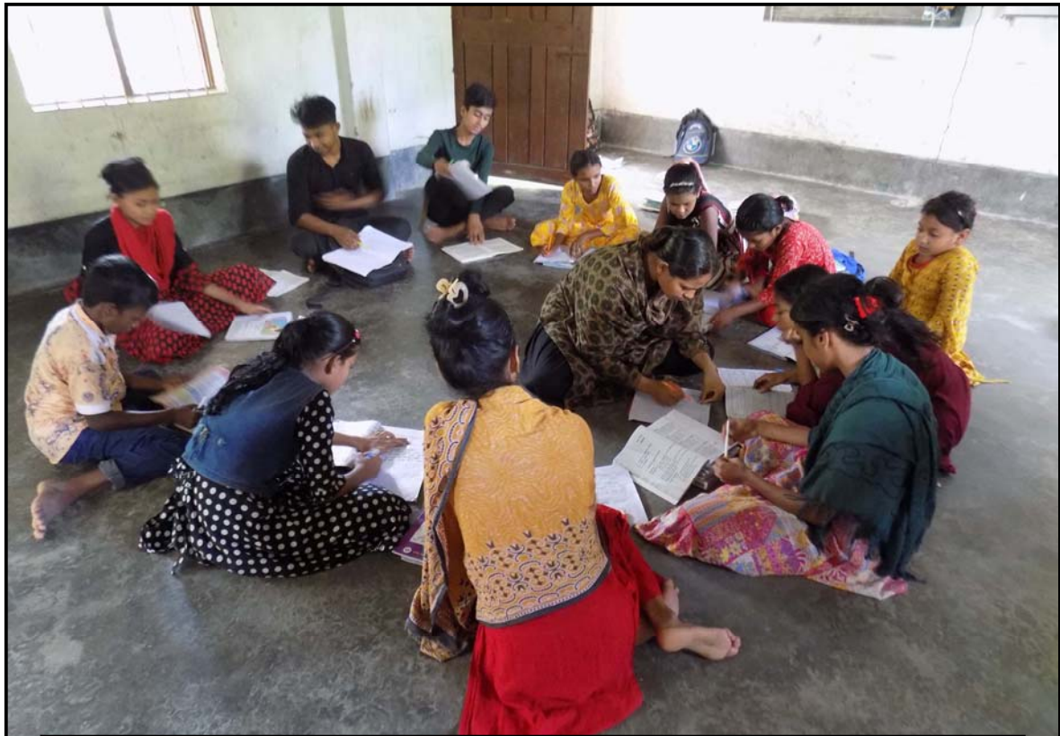
Tuition class at Mohishati village...