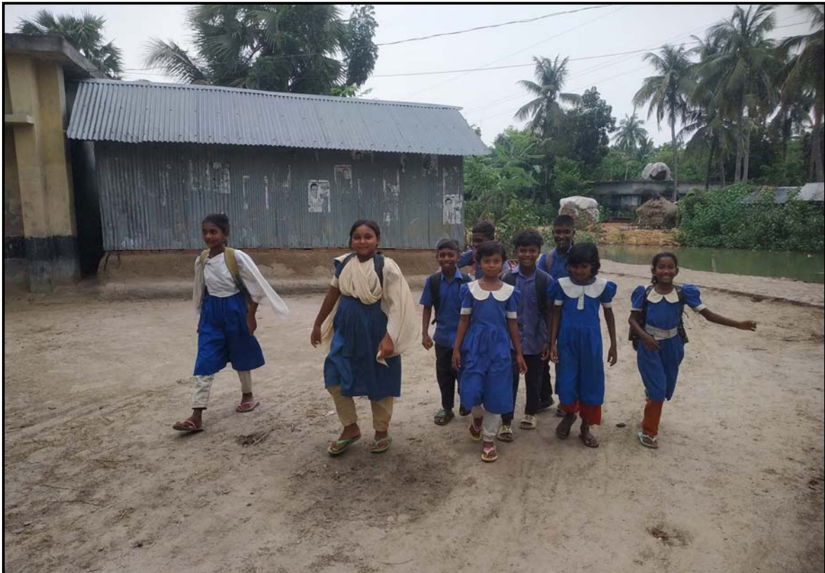
Jogahati students back from school....