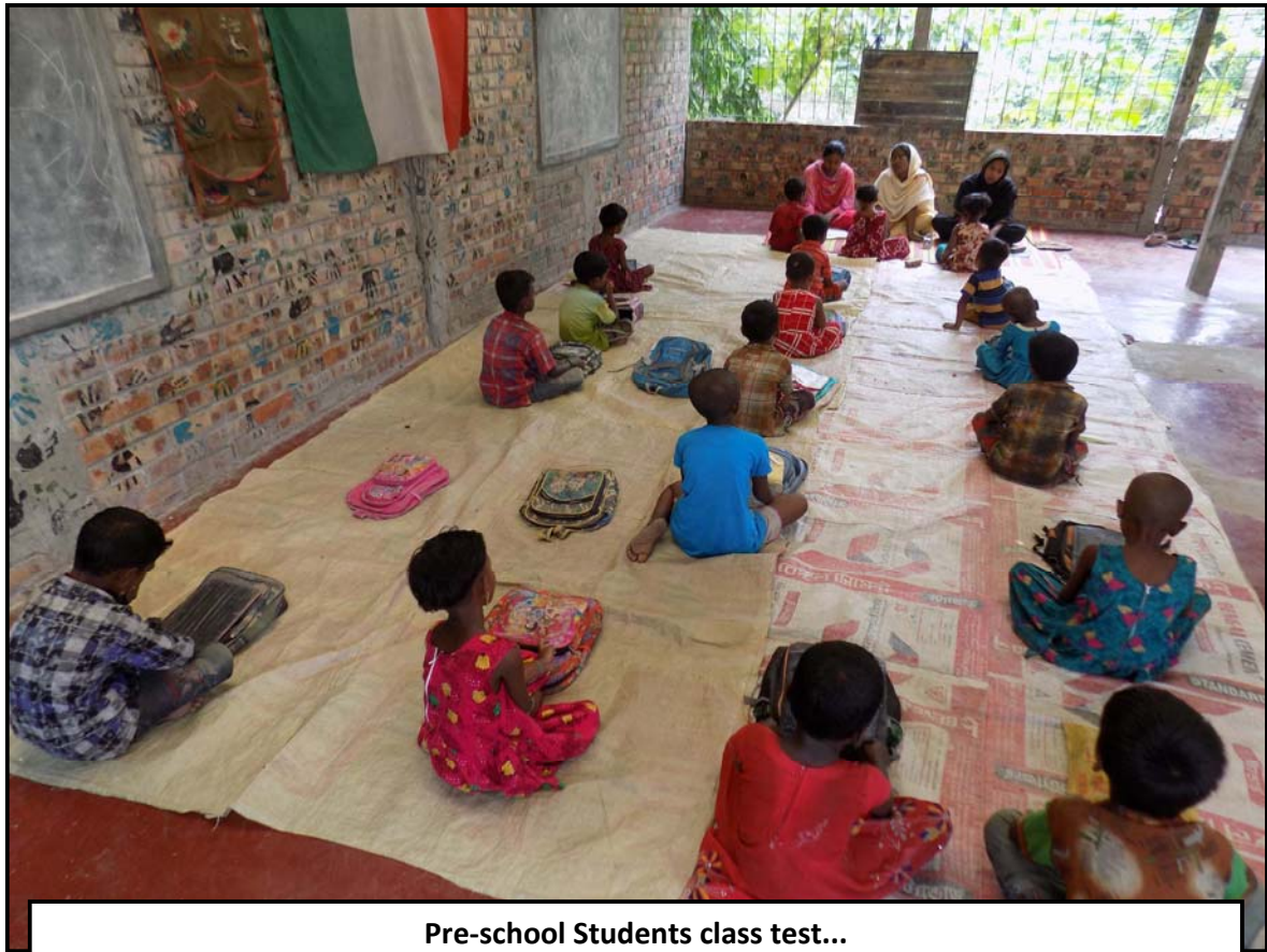
Pre-school Students class test...