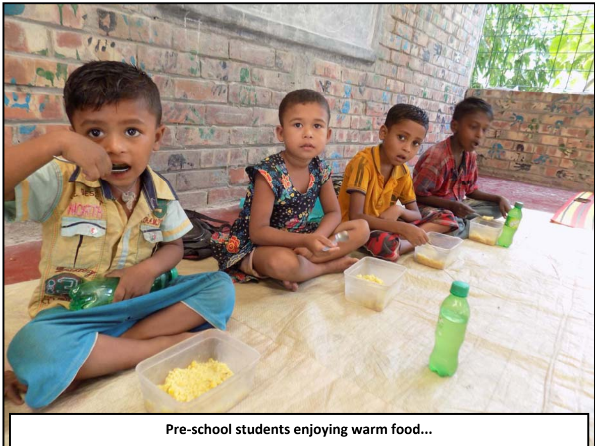
Pre-school students enjoying warm food...