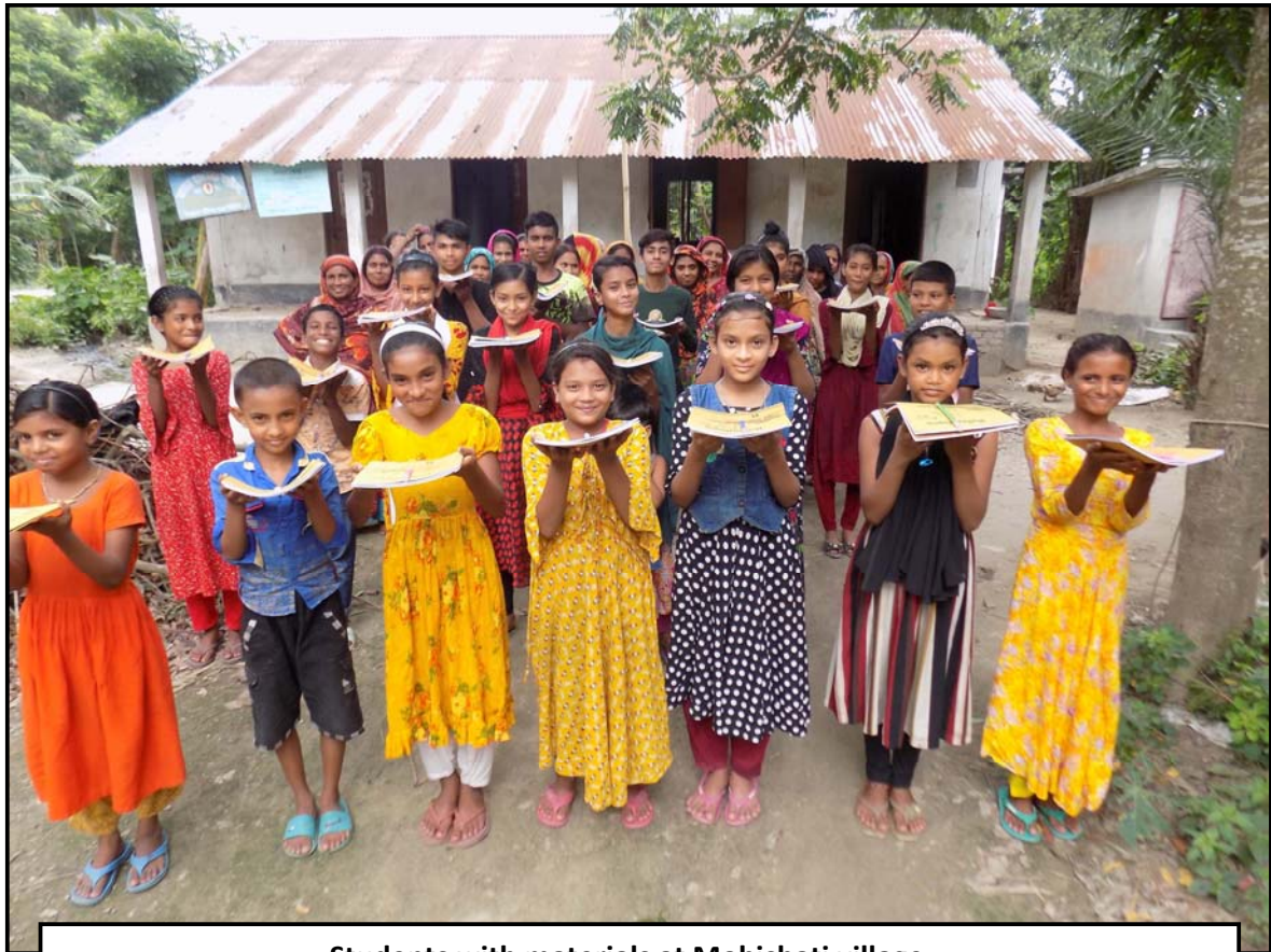
Students with materials at Mohishati village...