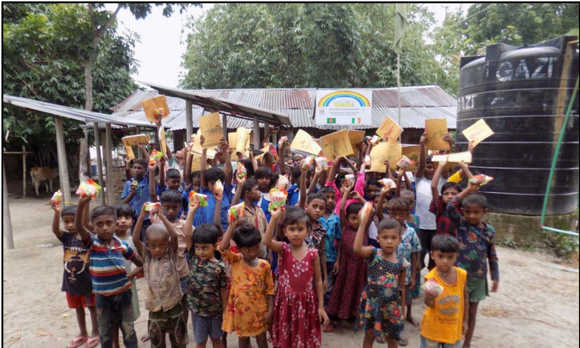
Jogahati students with the materials...