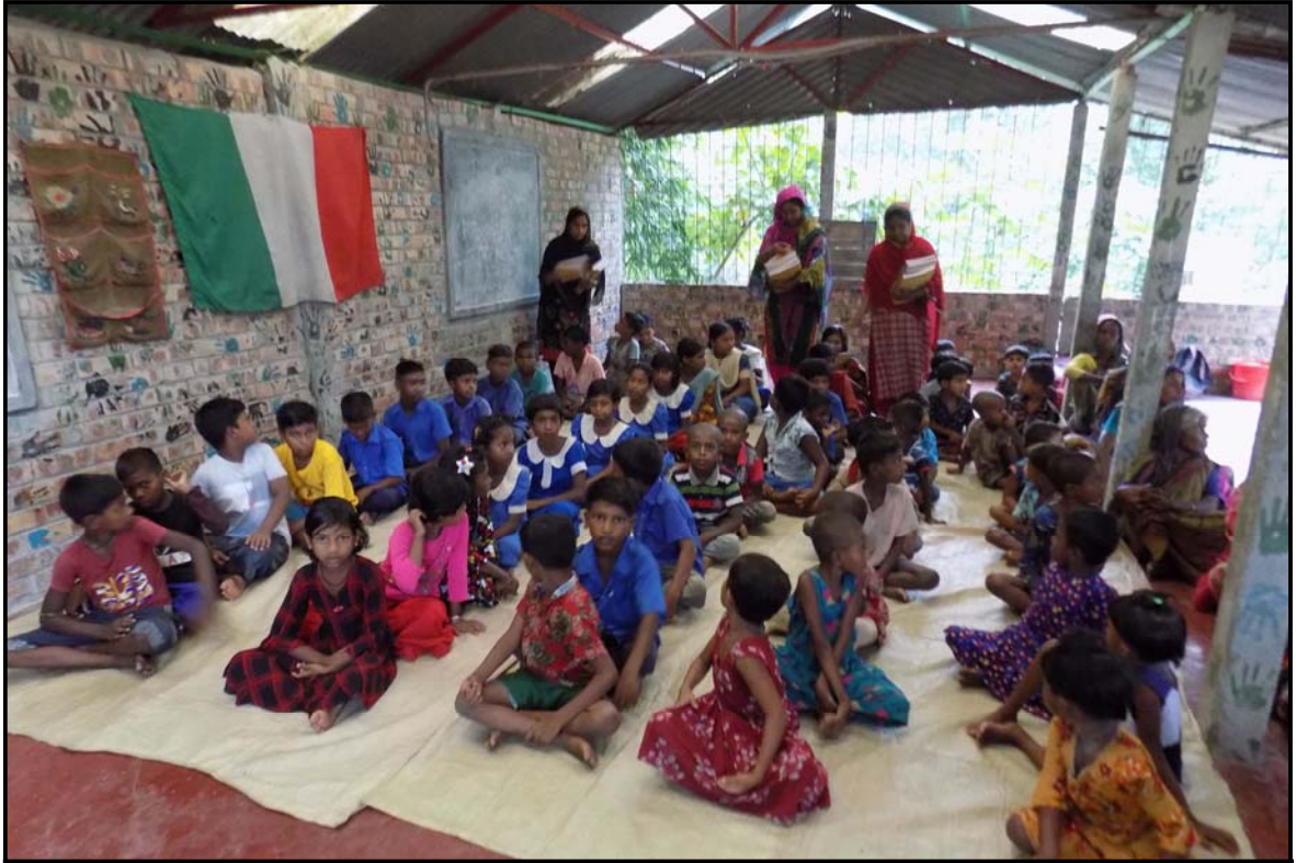
Materials distribution at Jogahati village....