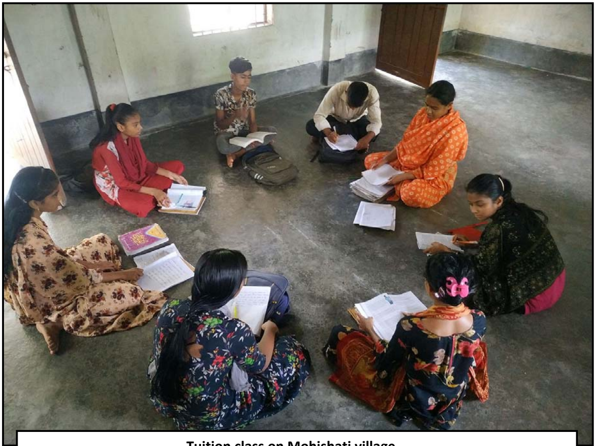
Tuition class on Mohishati village...