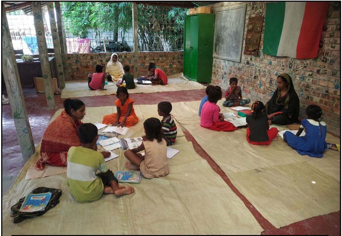
Tuition class at Jogahati village...