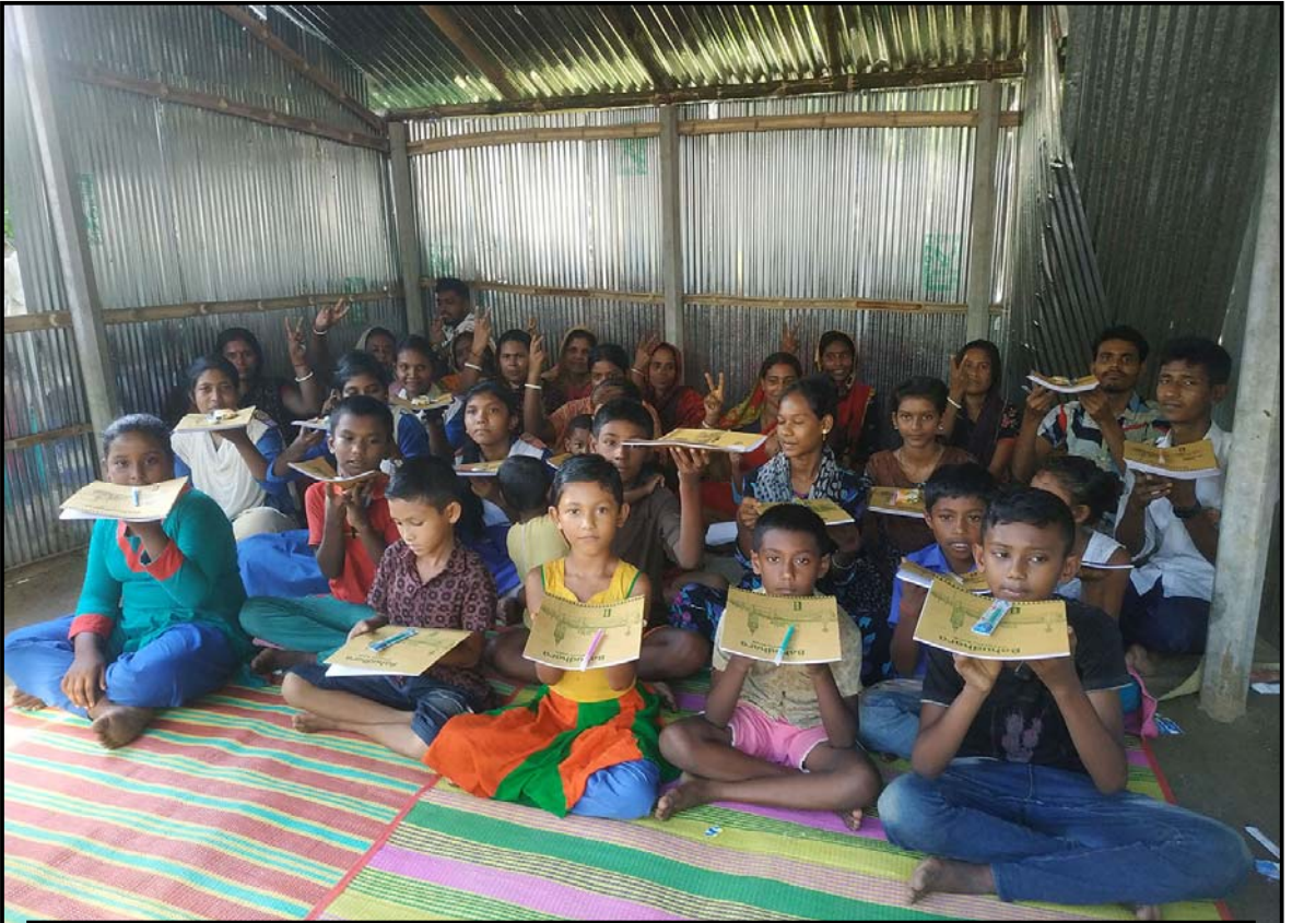
Happy children at Churamankati new study centre with the materials...