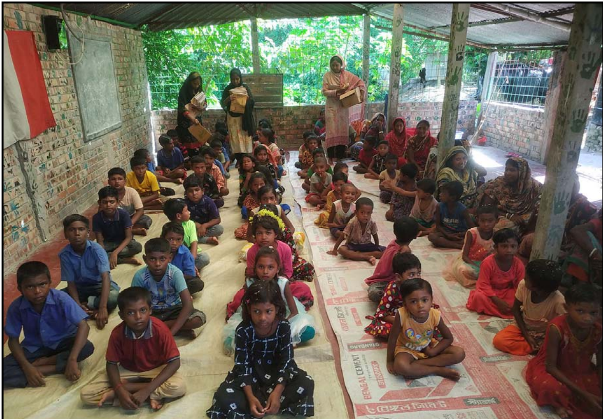
Parents meeting and materials distribution...