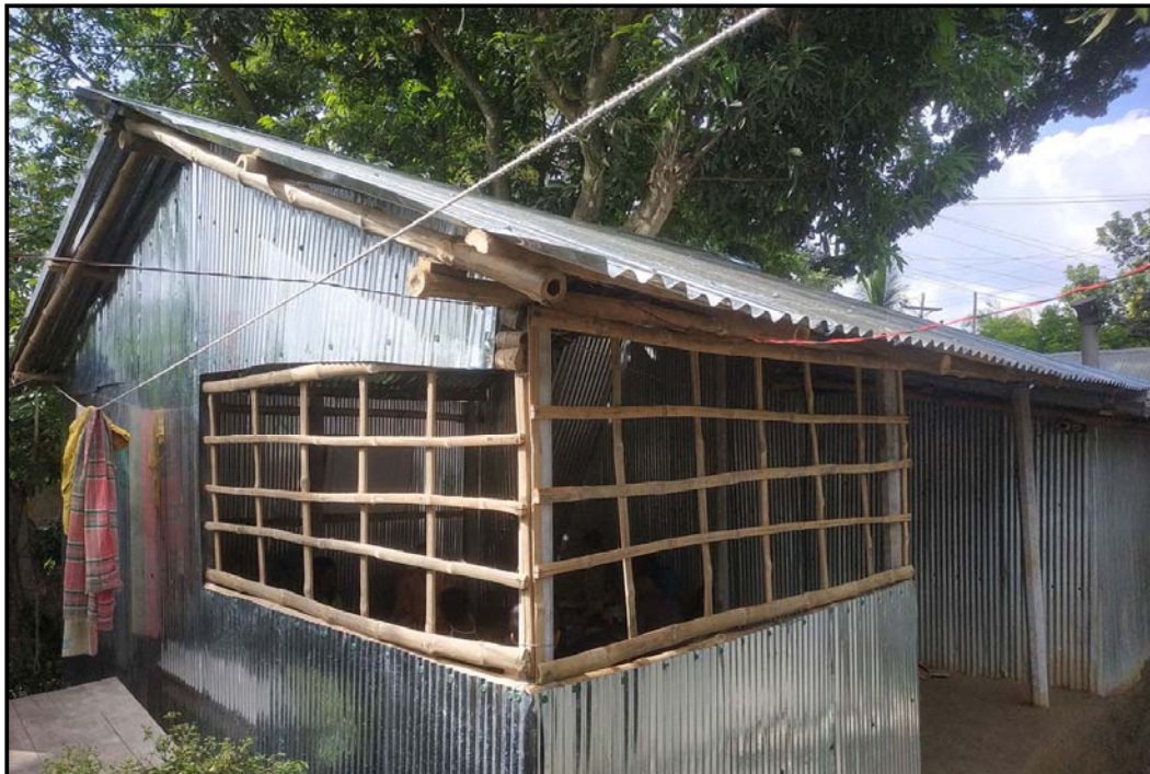
Churamankati relocated new study centre...