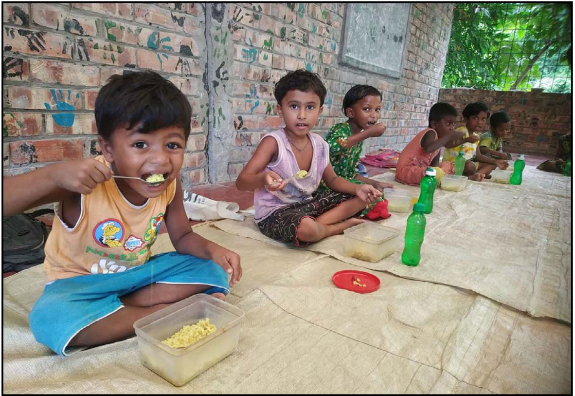
Pre-school students enjoying the meal...