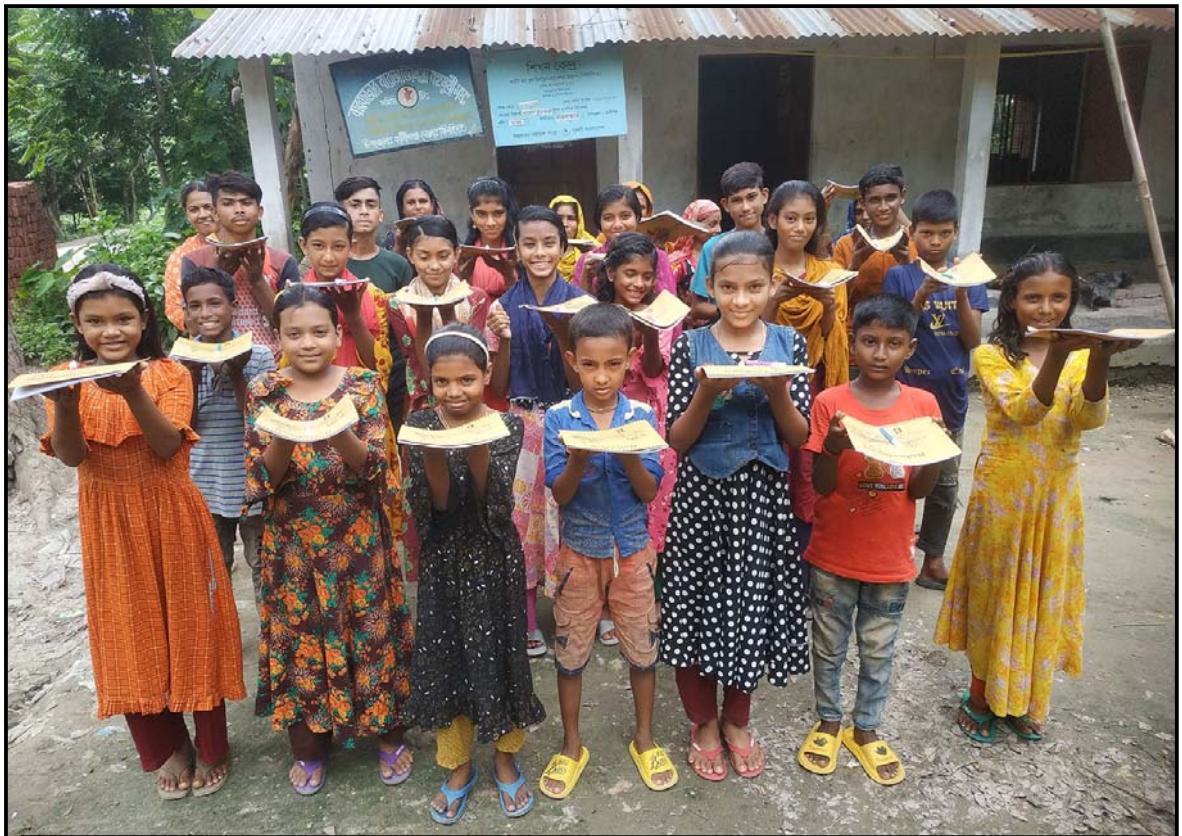
Mohishati village students received the materials...