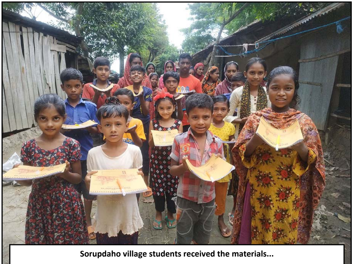
Sorupdaho village students received the materials...