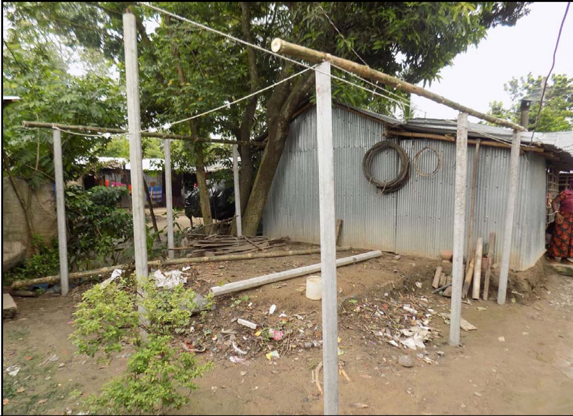
Rebuilding the Churamankati new study centre....