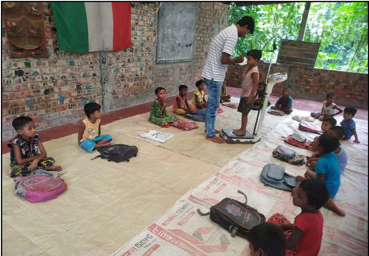
The monthly weight and height check-up....