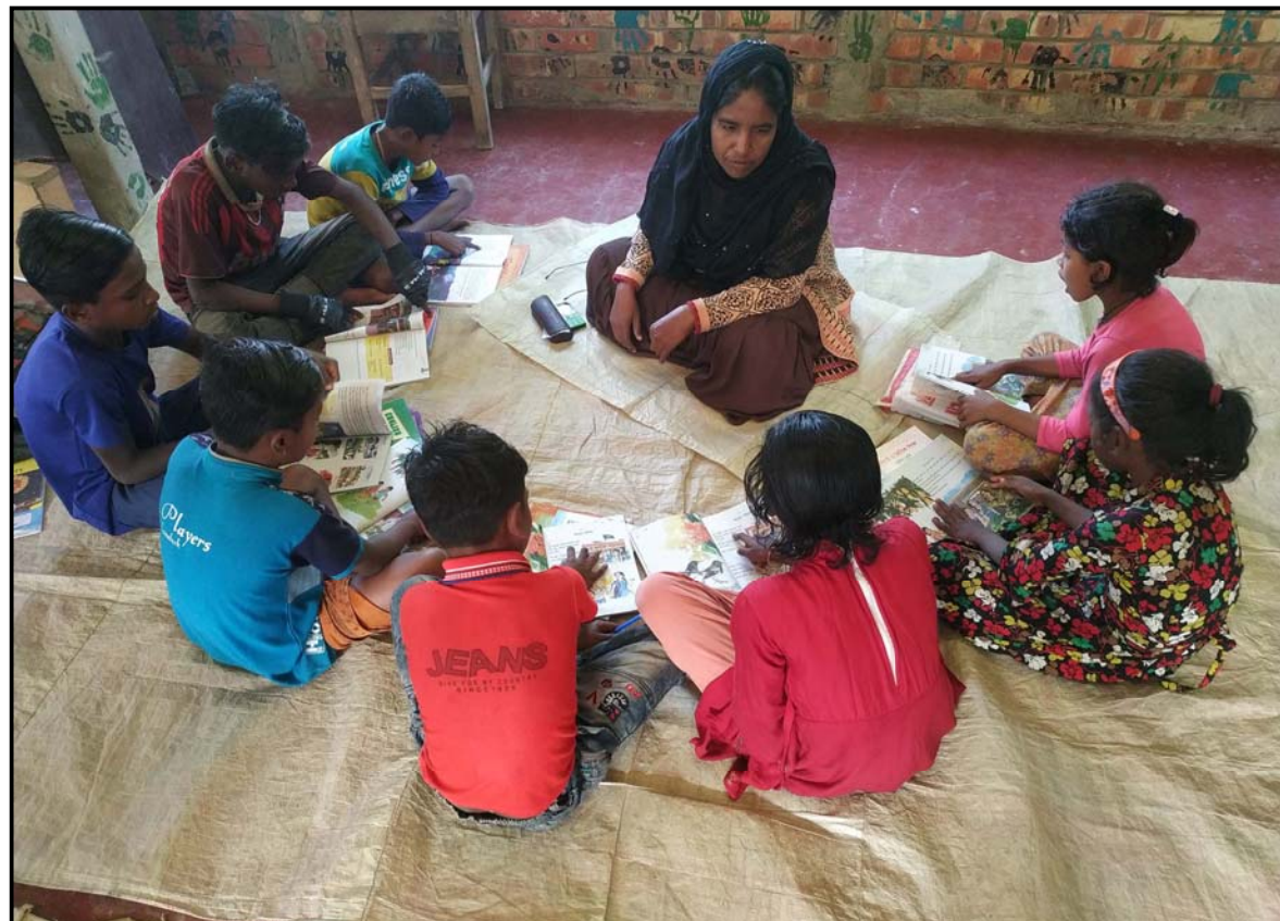
Jogahati tuition class....