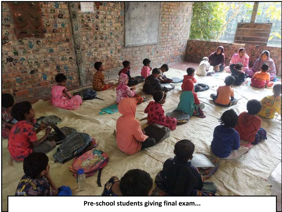
Pre-school students giving final exam...