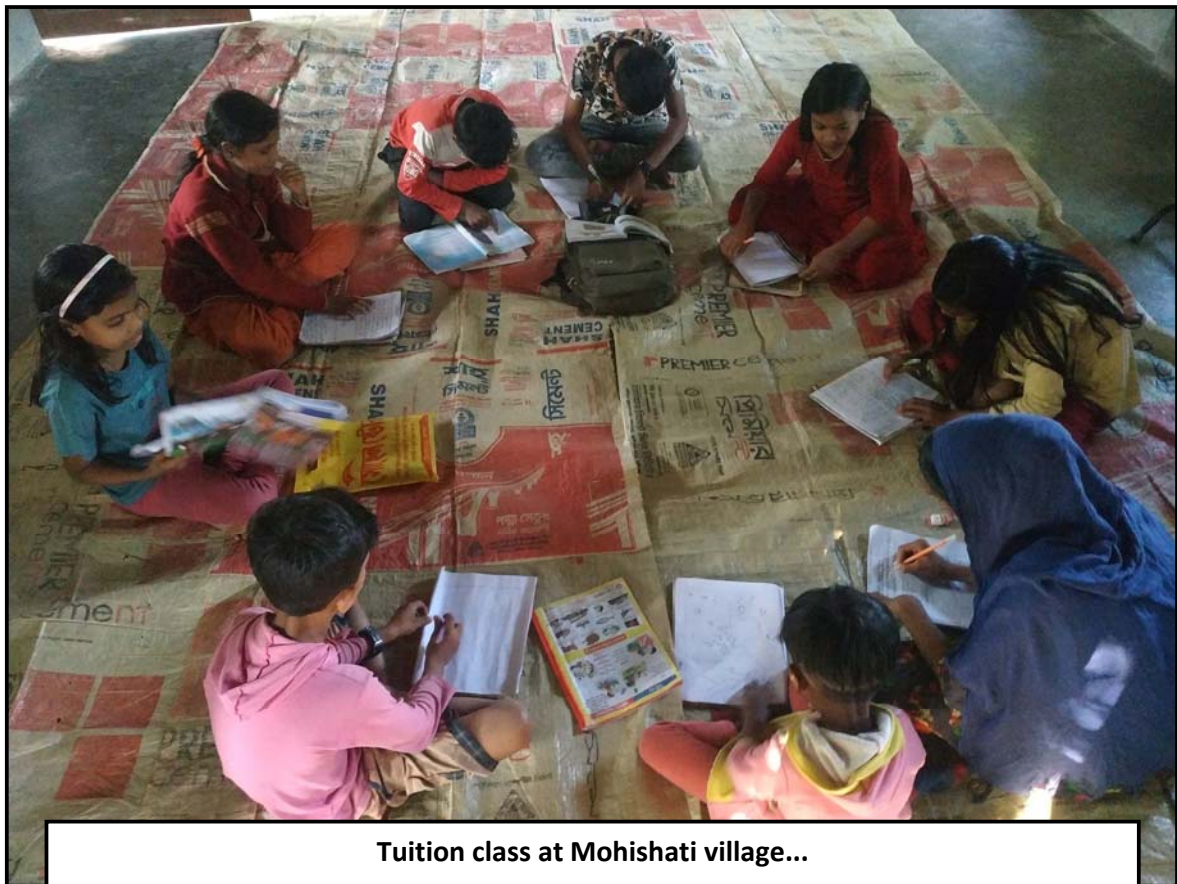
Tuition class at Mohishati village...