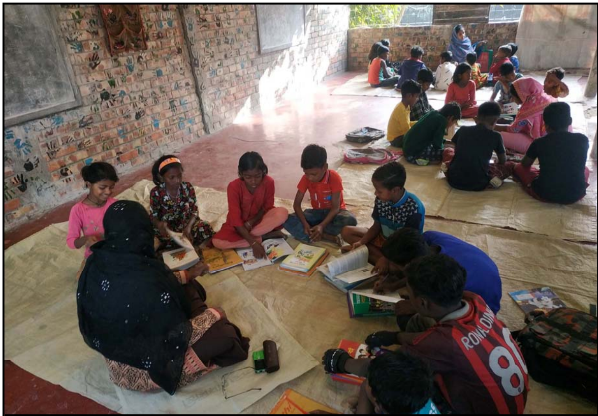
Jogahati tuition class...