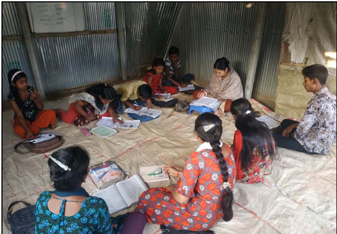
Tuition class at Churamankati village...