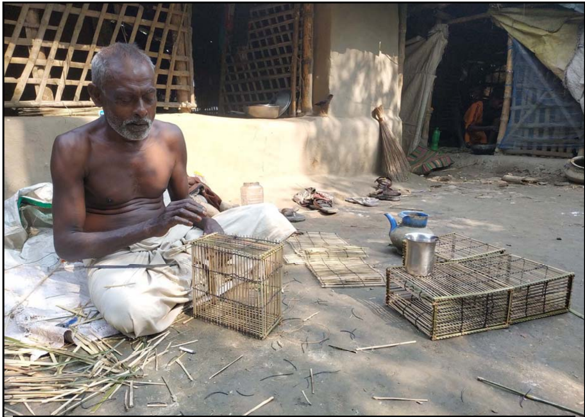
Jogahati village fisherman preparing his fishing trap...