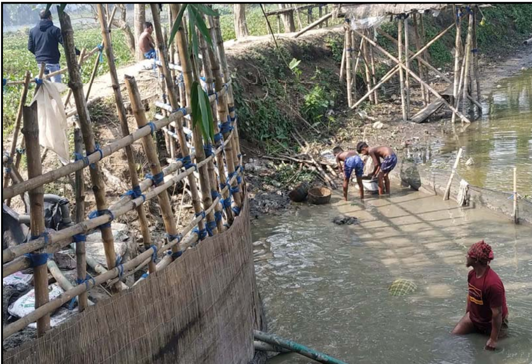
Sorupdaho village students catching fish from local ponds...