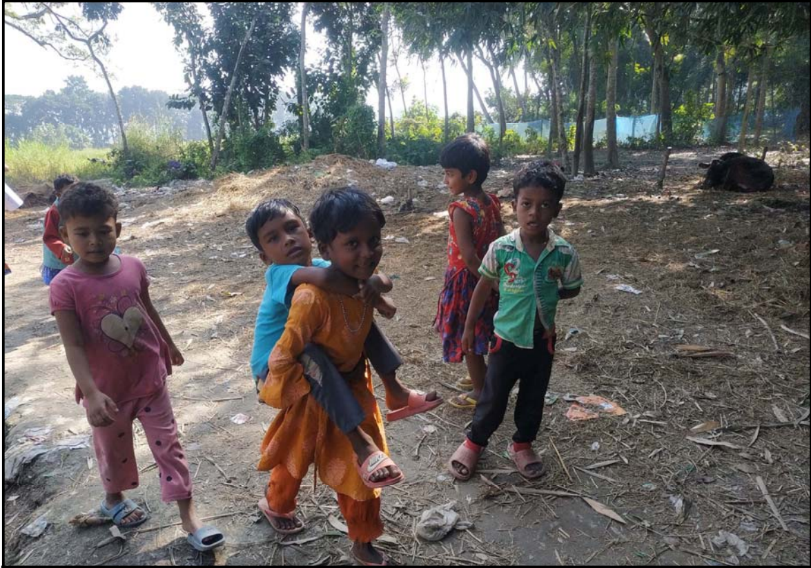
No schools, only playing...