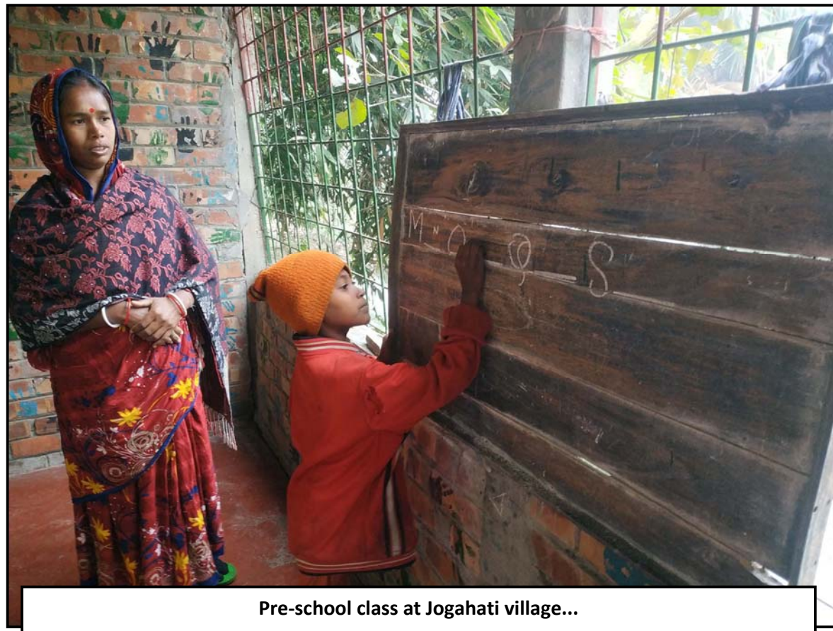
Pre-school class at Jogahati village...