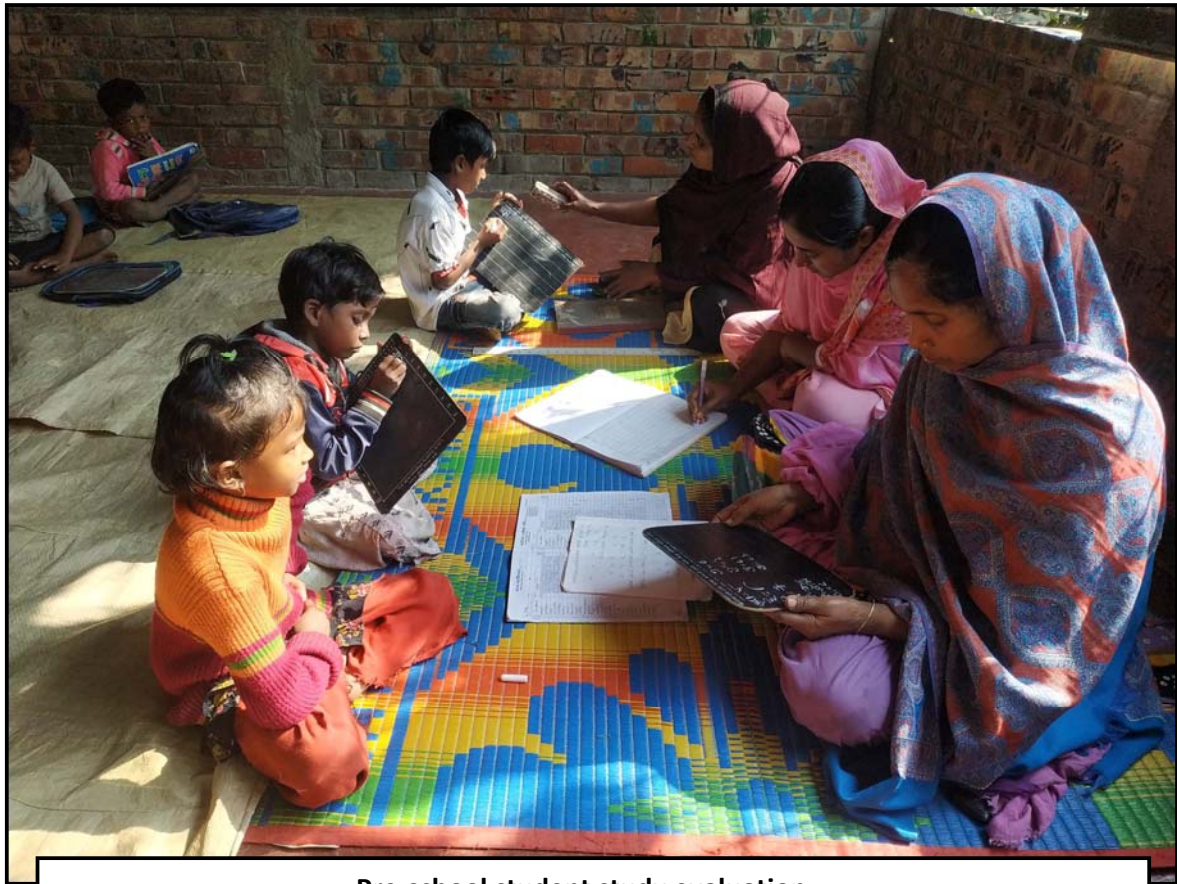
Pre-school student study evaluation...