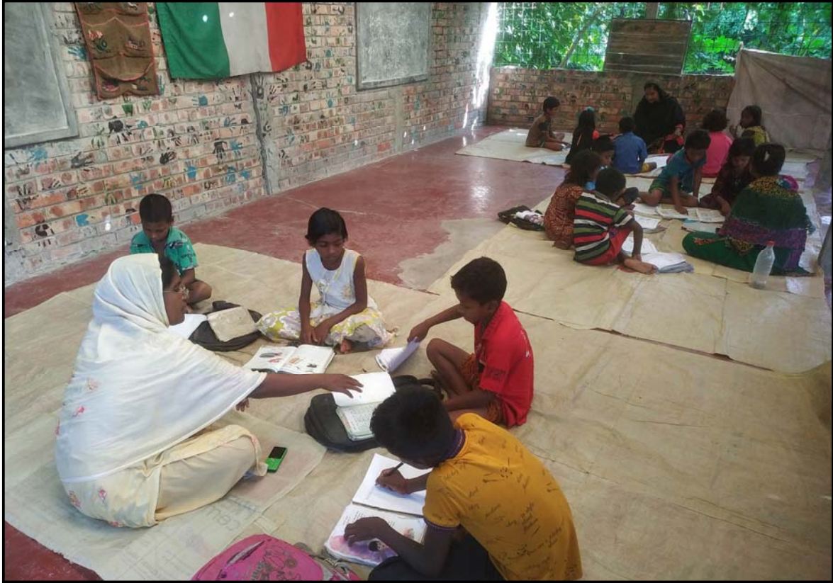
Jogahati tuition class....