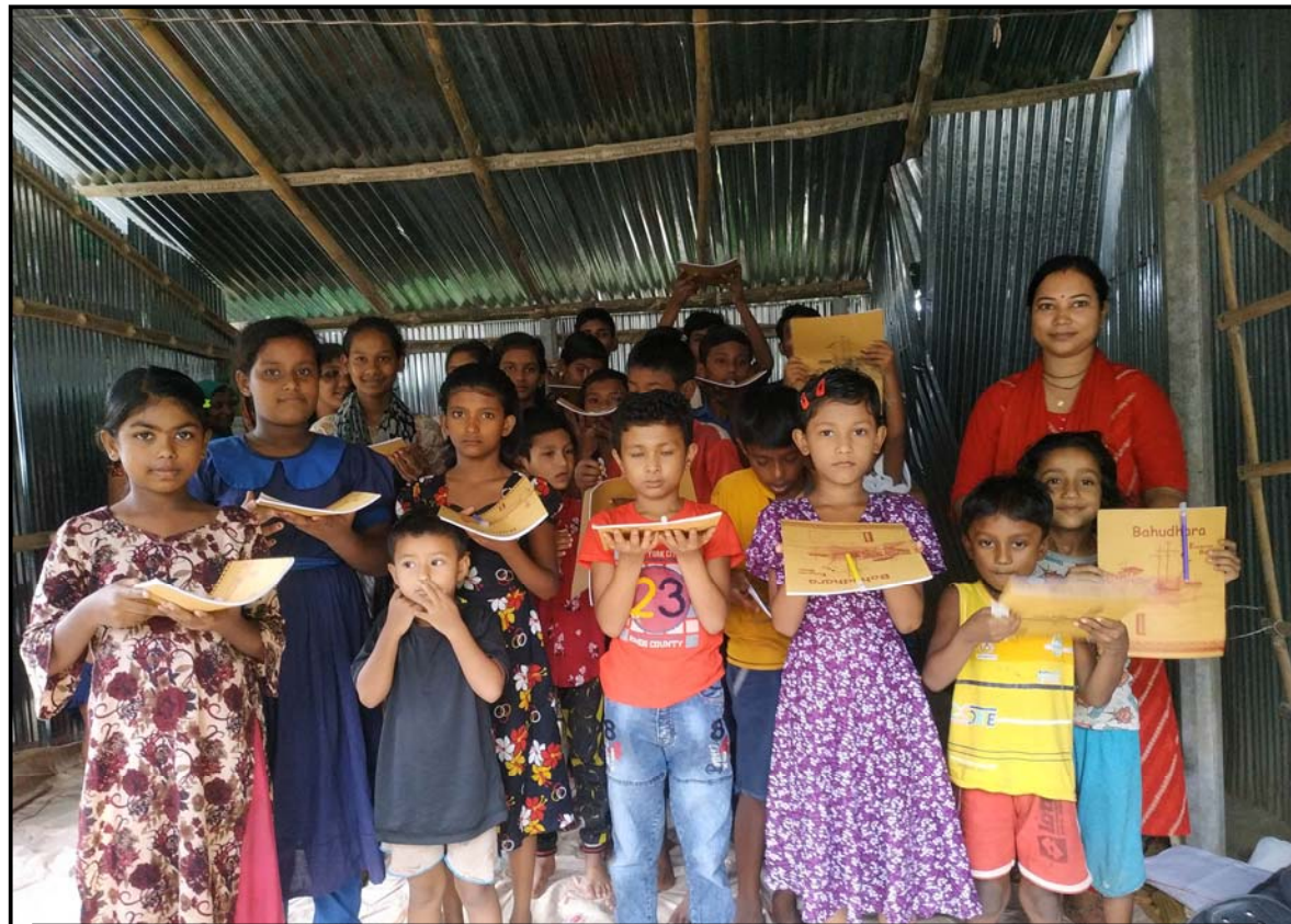
Happy children at Churamankati new study centre with the materials...