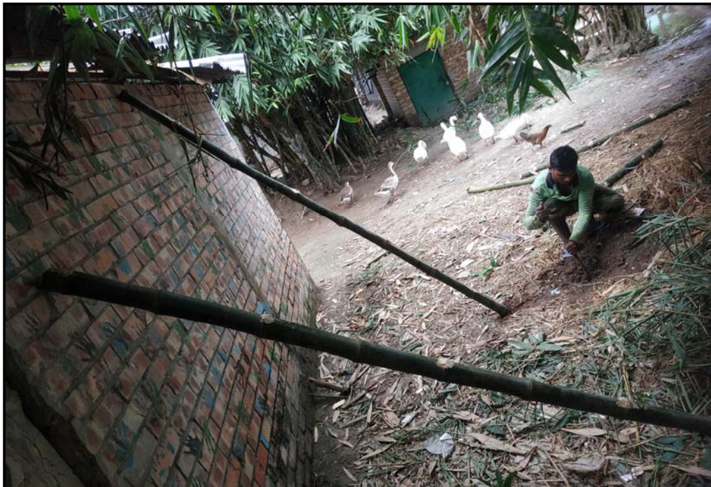
To avoid falling of Jogahati pre-school wall we put bamboo support...