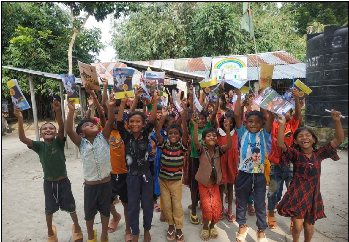
Jogahati students with the education materials...