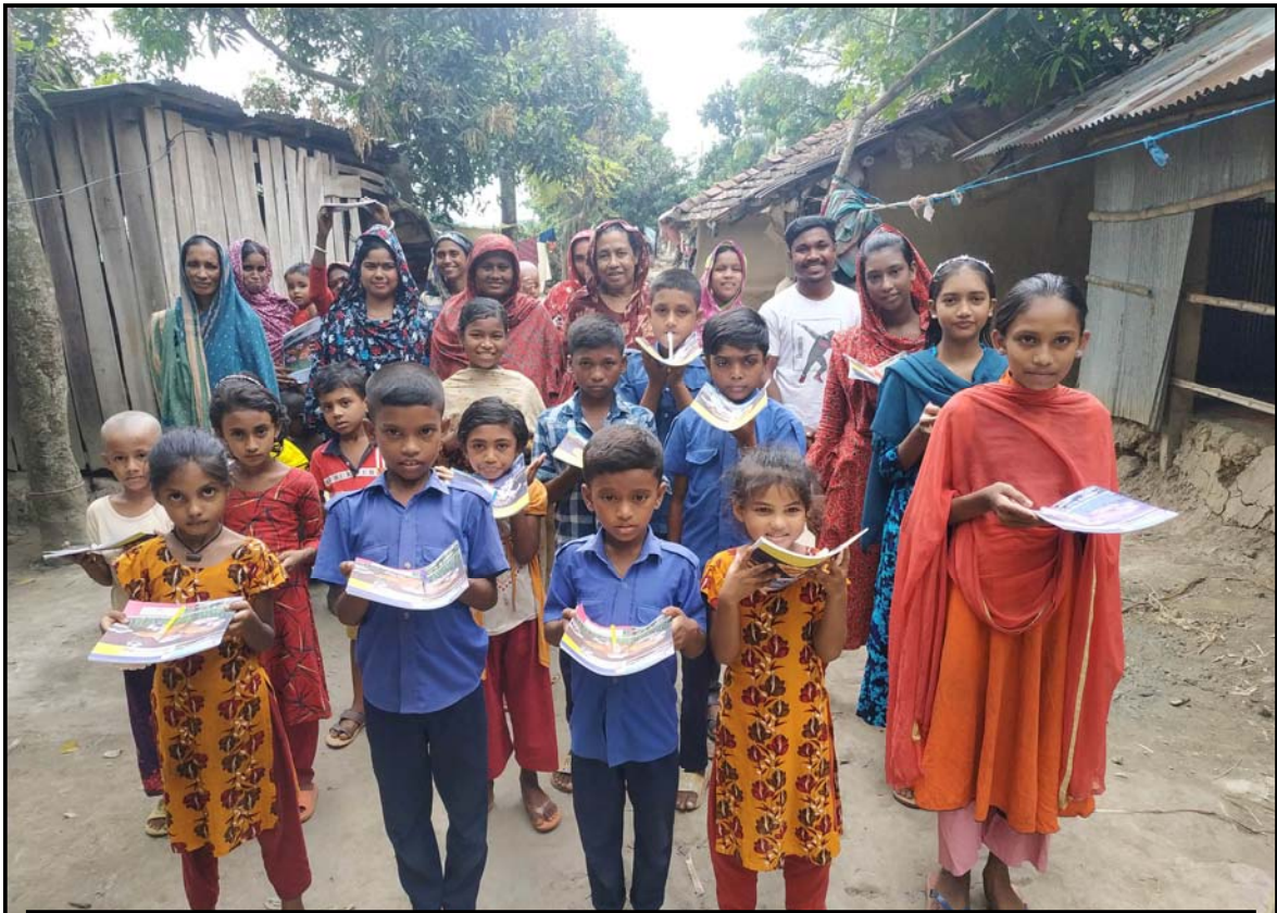
Sorupdaho village students received the materials...