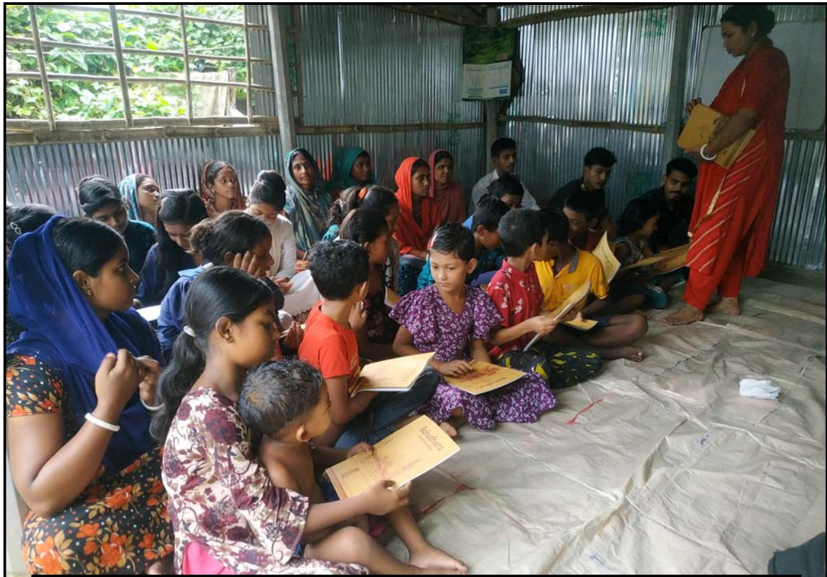
Materials distribution at Churamankati village...