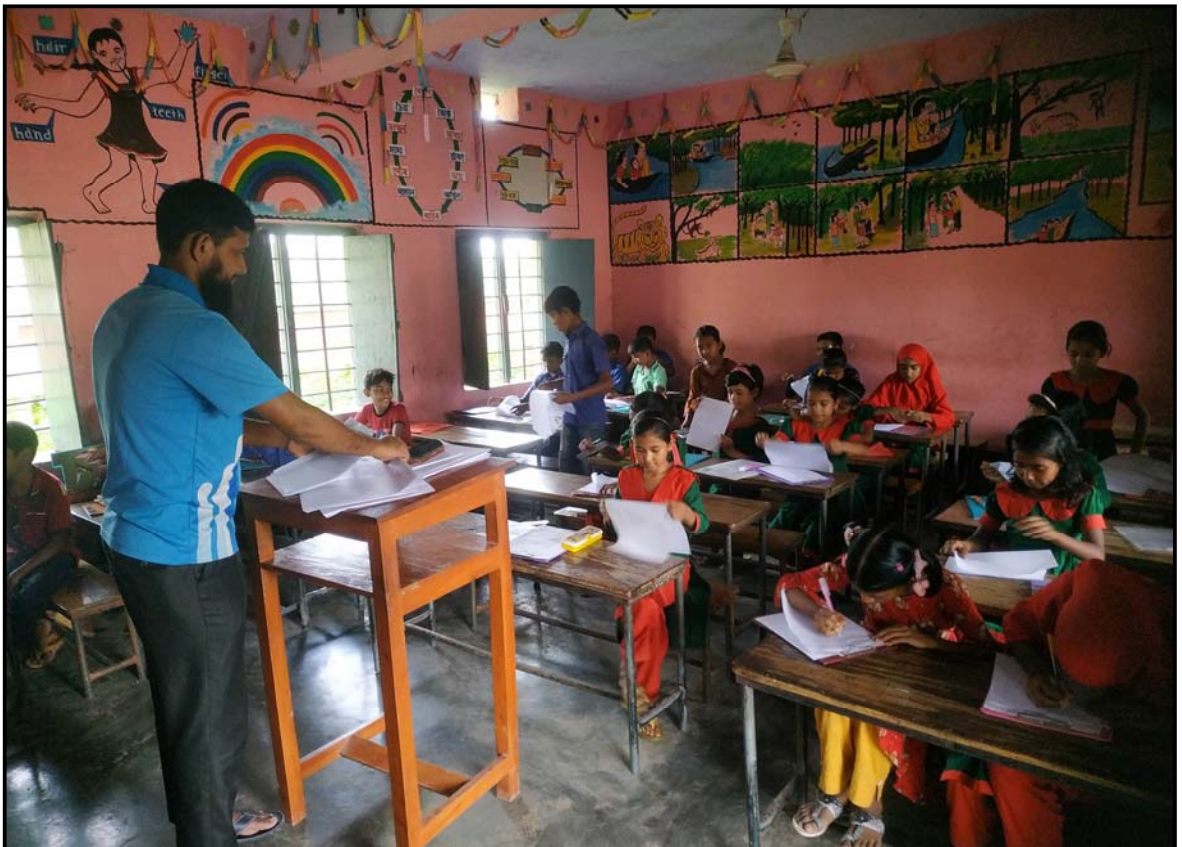
Class exam on in the government school....