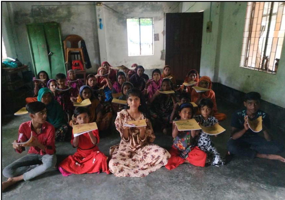
Mohishati village students received the materials...