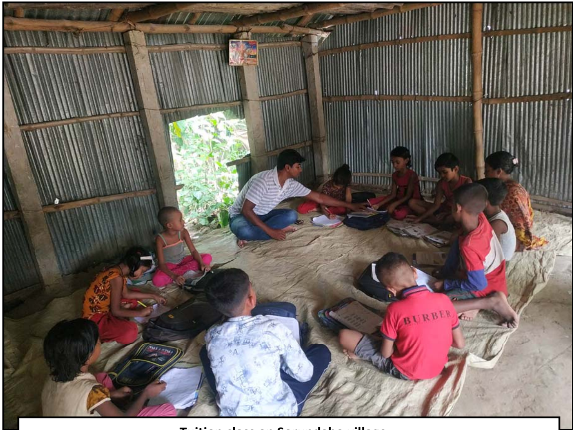
Tuition class on Sorupdaho village...