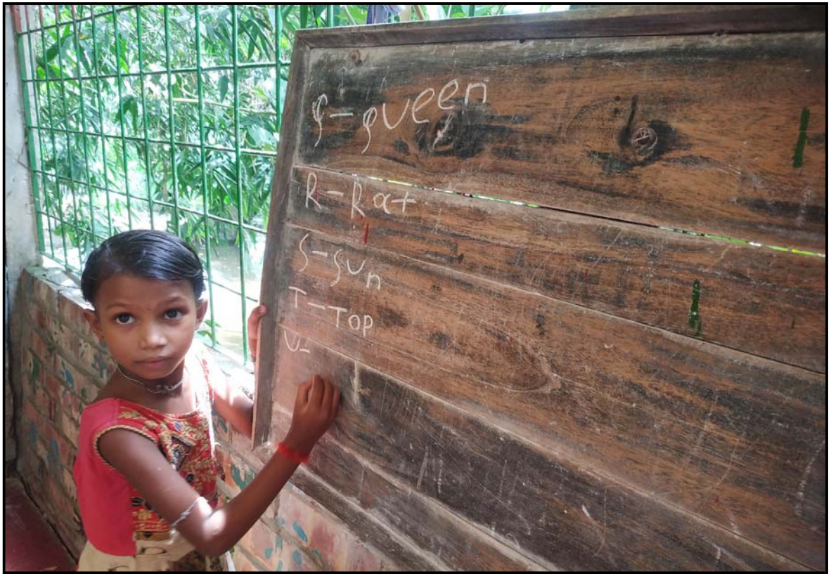
Pre-school students in class...