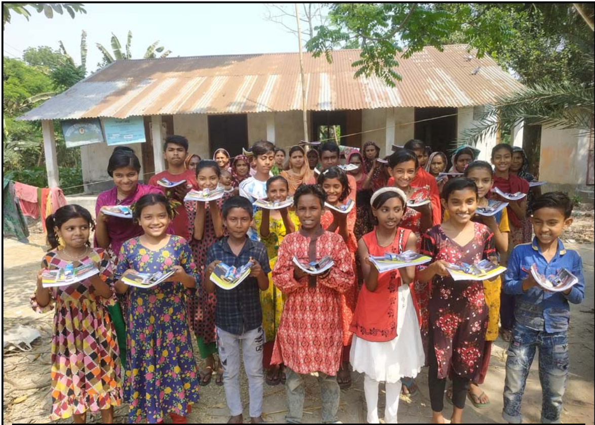
Mohishati students received the materials...