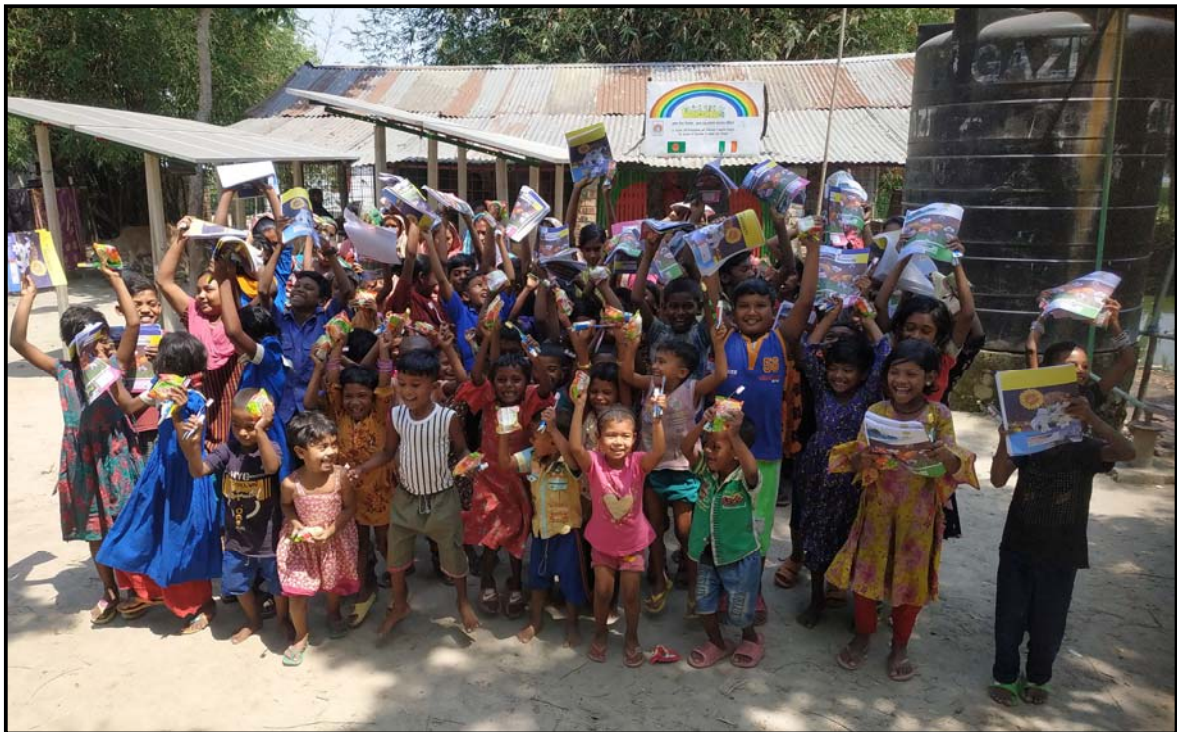
Jogahati village children received the materials...