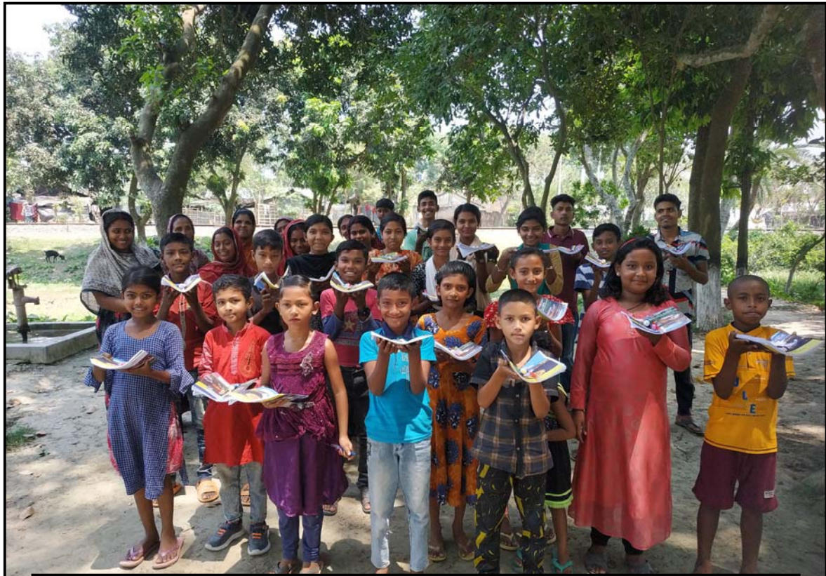
Churamankati village students received the materials...