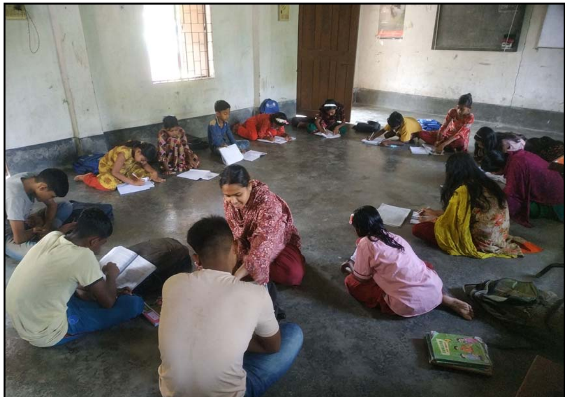
Mohishati tuition class...