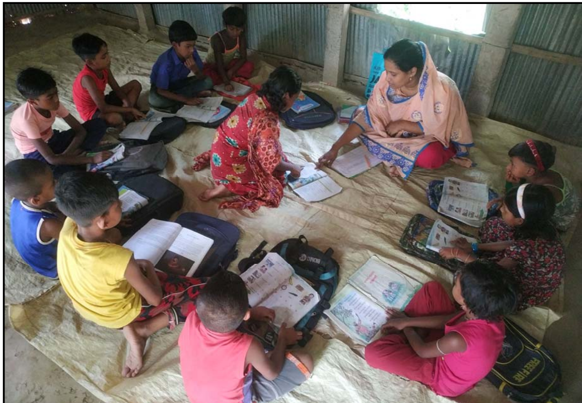
Sorupdaho tuition class going on....