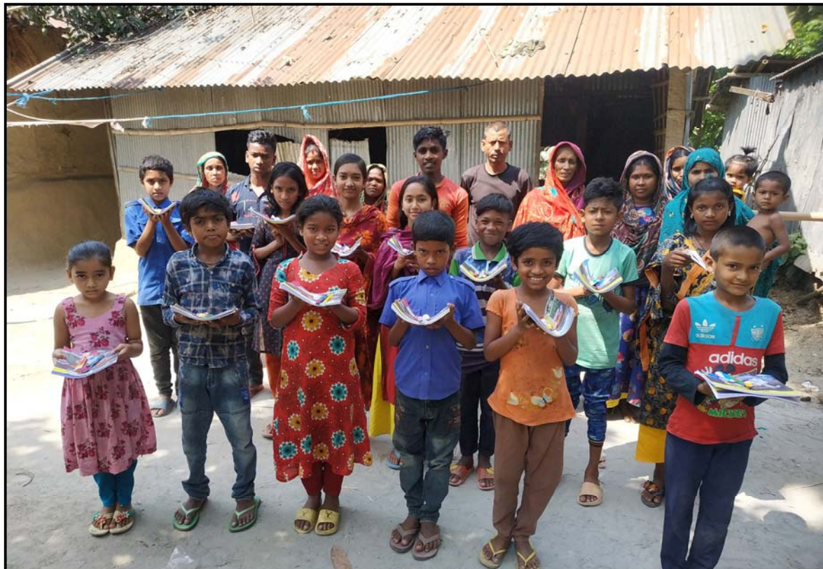
Sorupdaho students with materials...