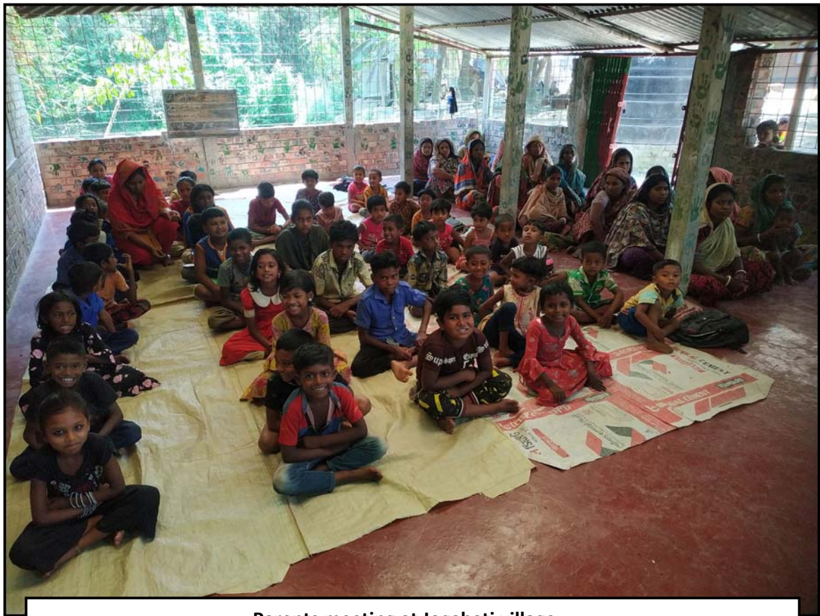
Parents meeting at Jogahati village...