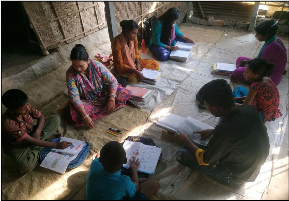
Students of the Churamankati village studying in tuition class...