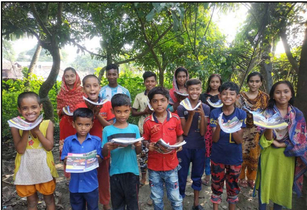
Sorupdah students with the materials...