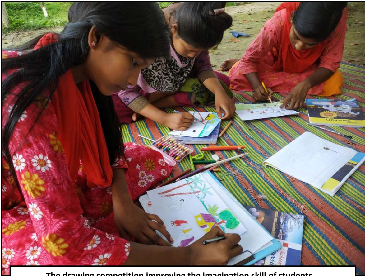
The drawing competition improving the imagination skill of students...