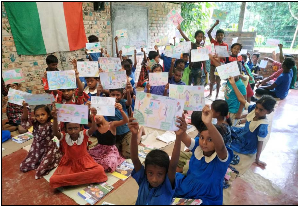
Student showing the drawings...