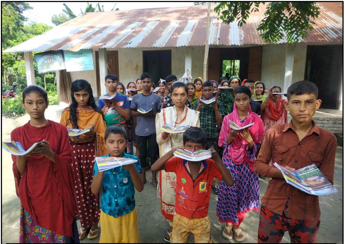
Mohishati students with the materials...