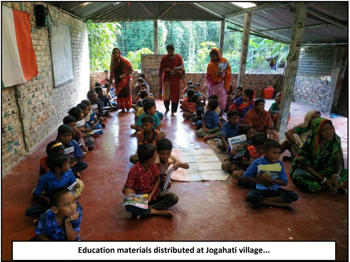
Education materials distributed at Jogahati village...