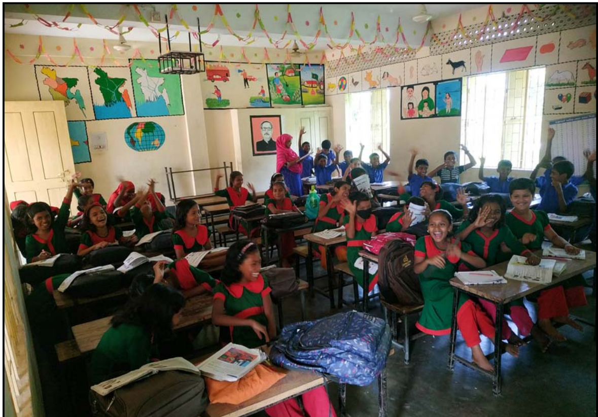
Students in fun in the local school...