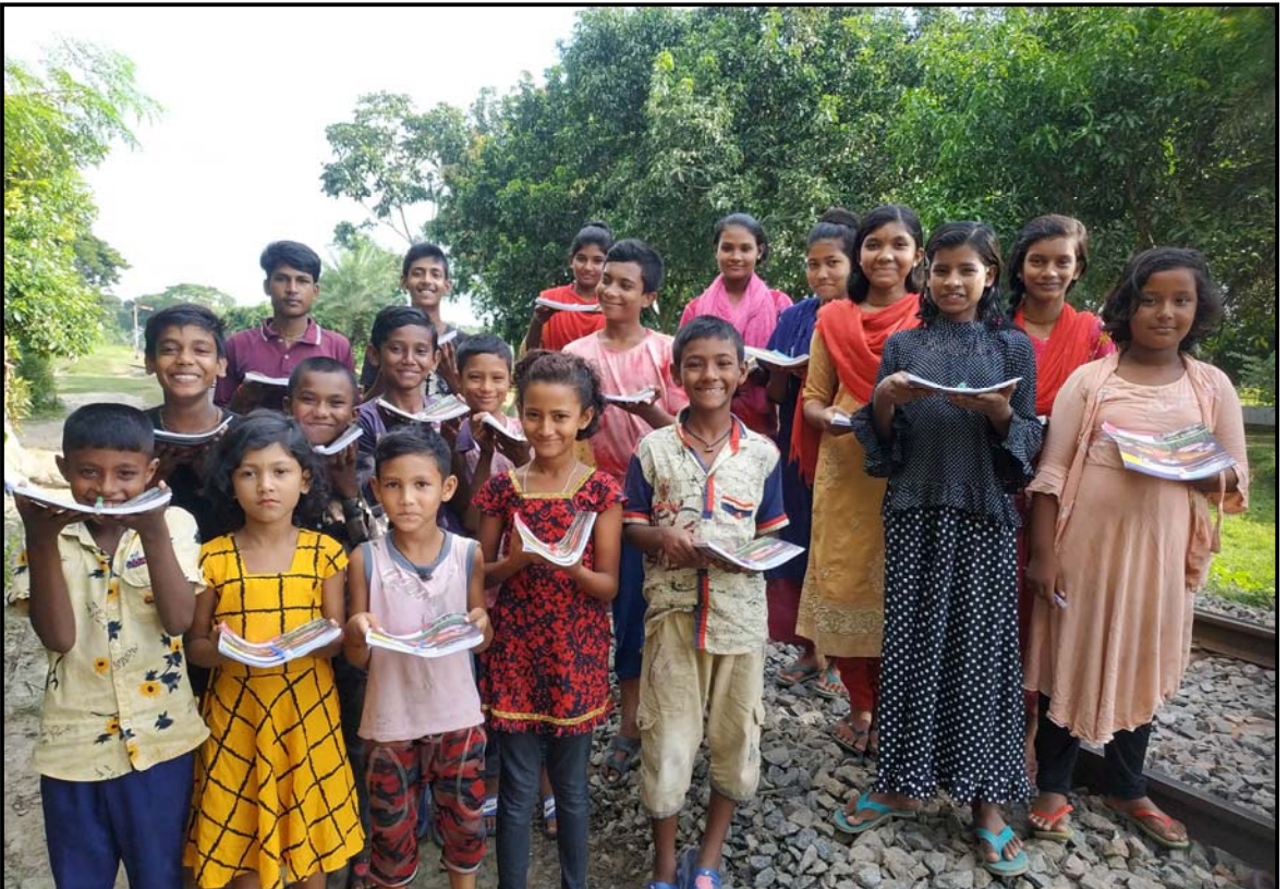
Happy students with materials at Churamankati village...