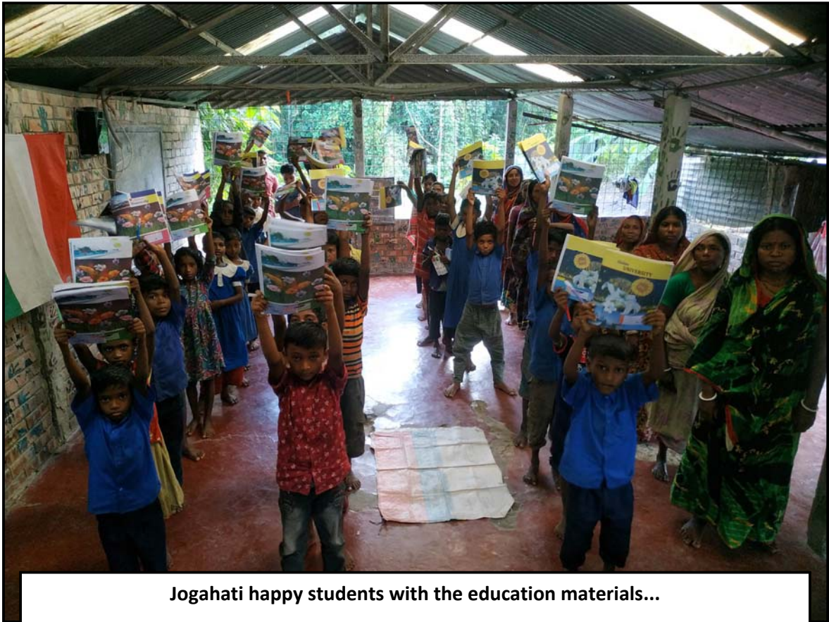
Jogahati happy students with the education materials...