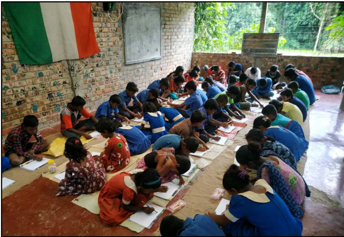
Students doing the art drawings very attentively...