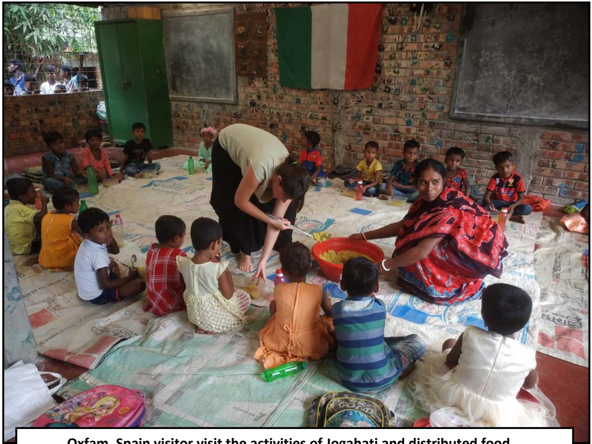
Oxfam, Spain visitor visit the activities of Jogahati and distributed food...