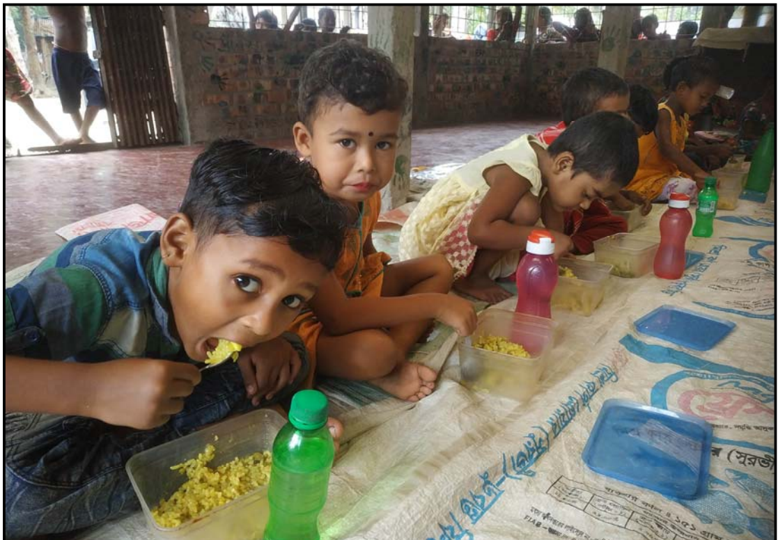
Jogahati preschool students enjoying the warm meal...