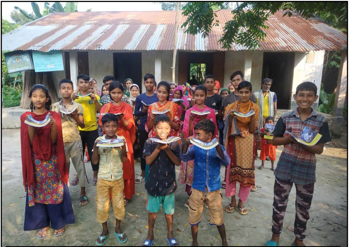
Mohishati students with the materials...