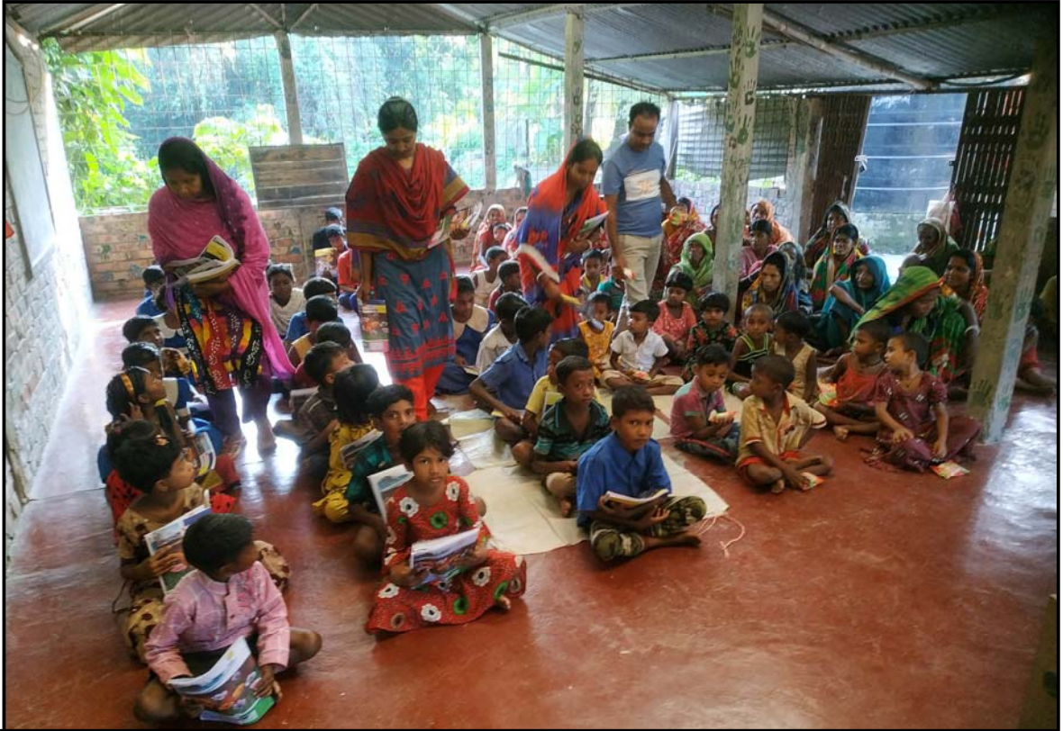
Education materials distribution at Jogahati village...