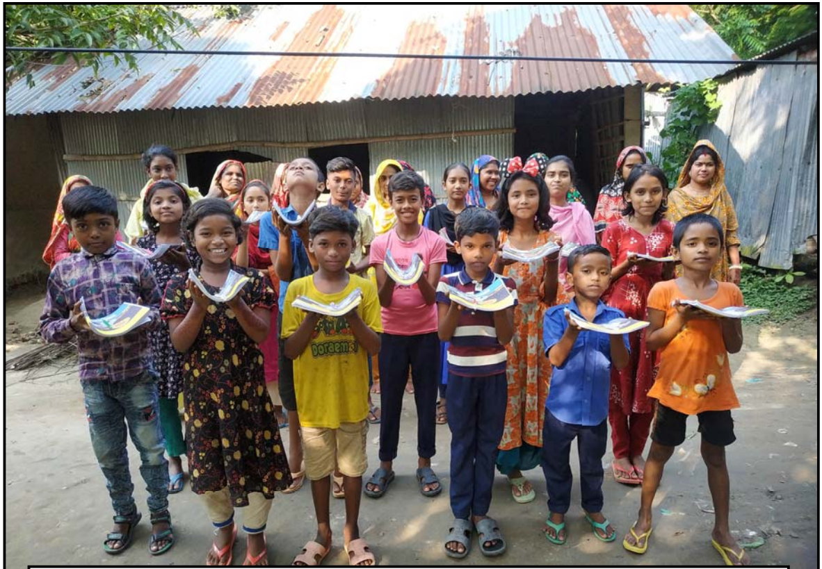
Education materials distributed at Sorupdaho village...