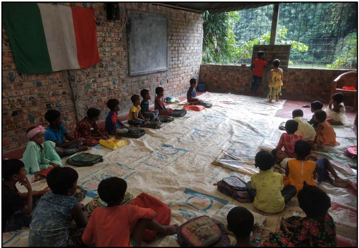
Preschool class going on...