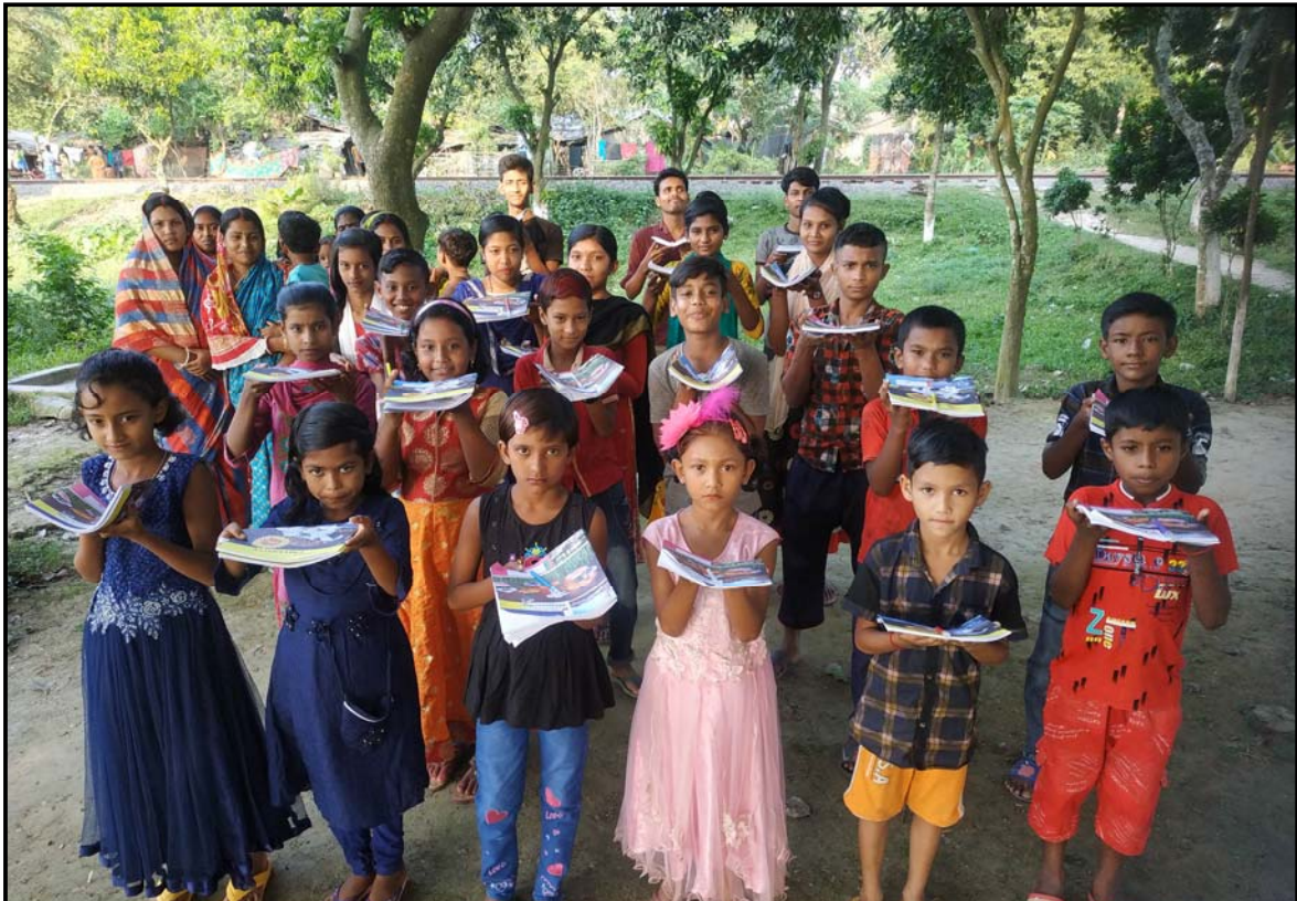
Happy students with materials at Churamankati village...