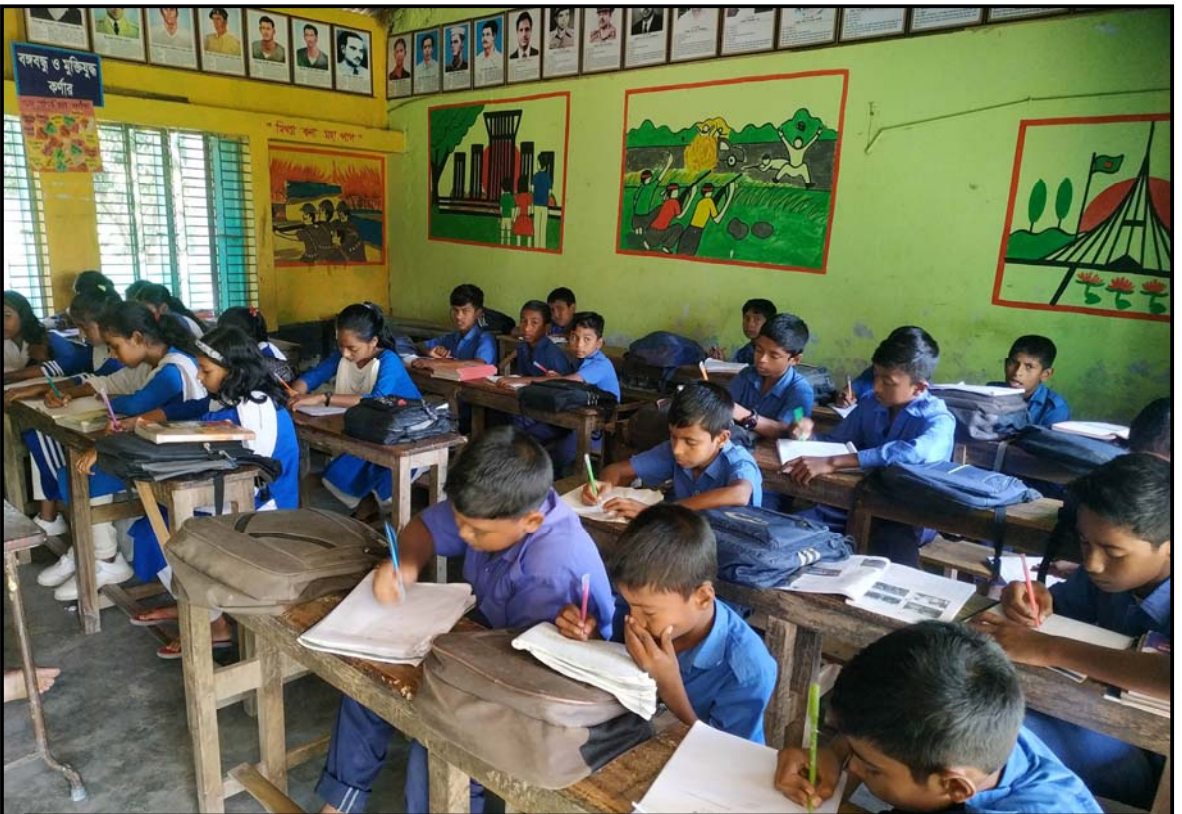
Students at local government school class...