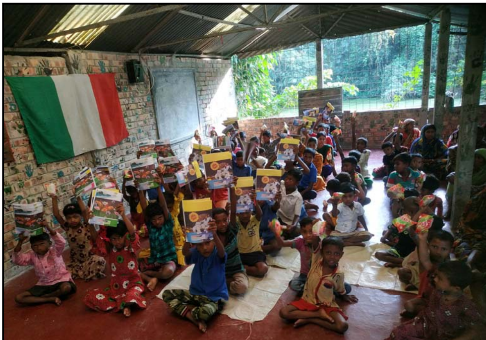
Happy kids with the materials...