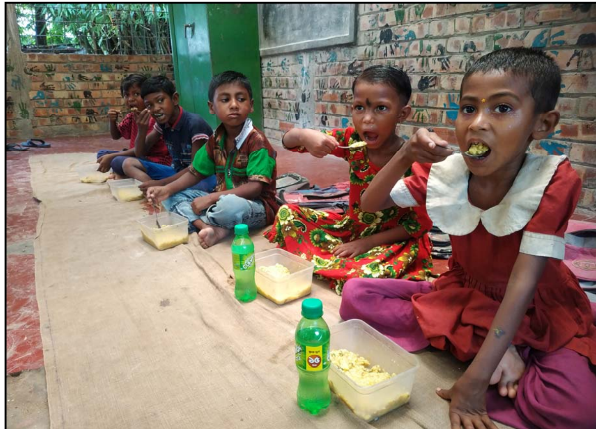
The preschool kids enjoying the lunch after class...