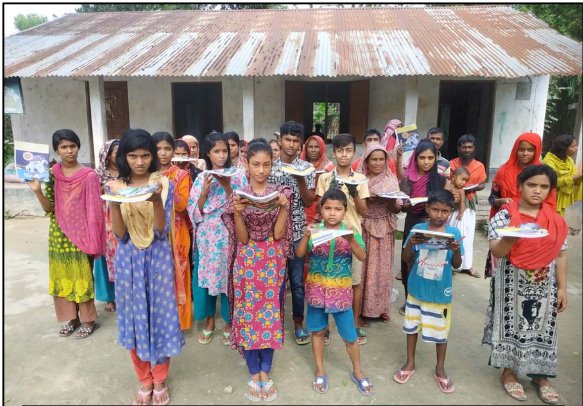
Materials distributed in Mohishati village...