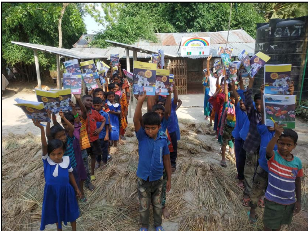
Jogahati students with the materials...