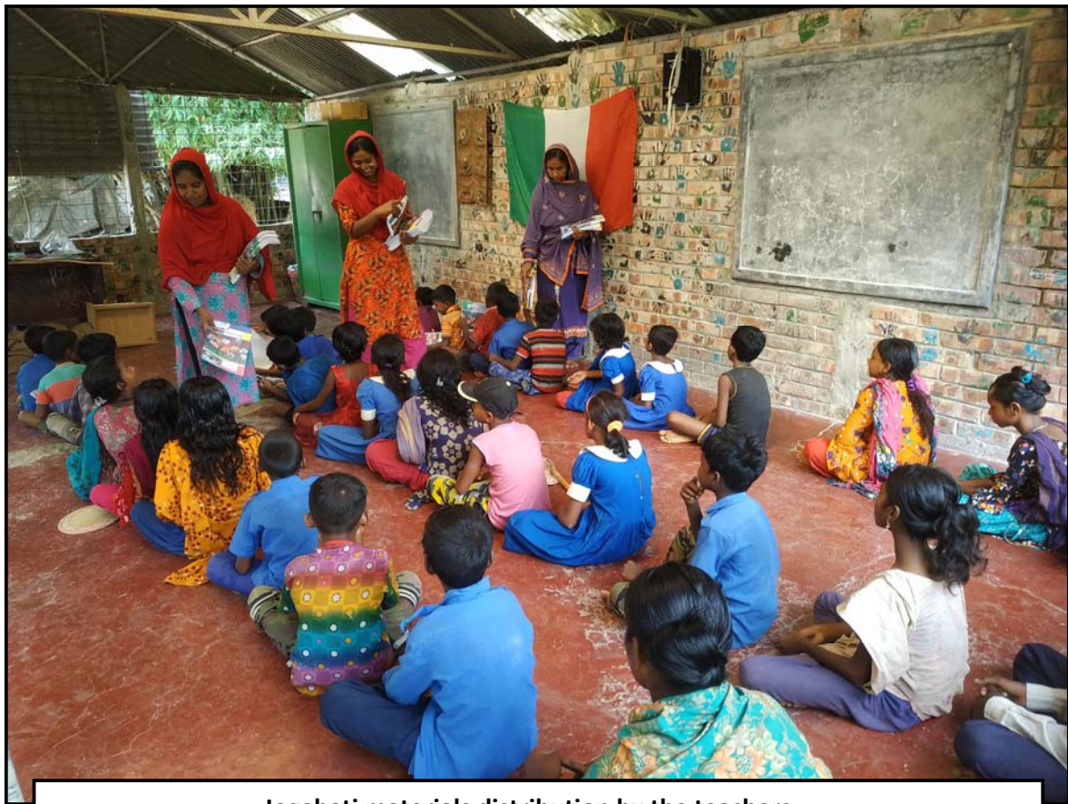
Jogahati materials distribution by the teachers...