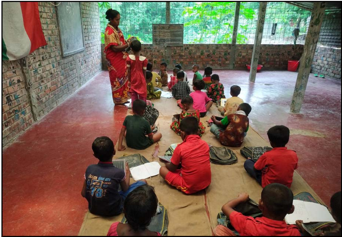
A class ongoing in Jogahati preschool...