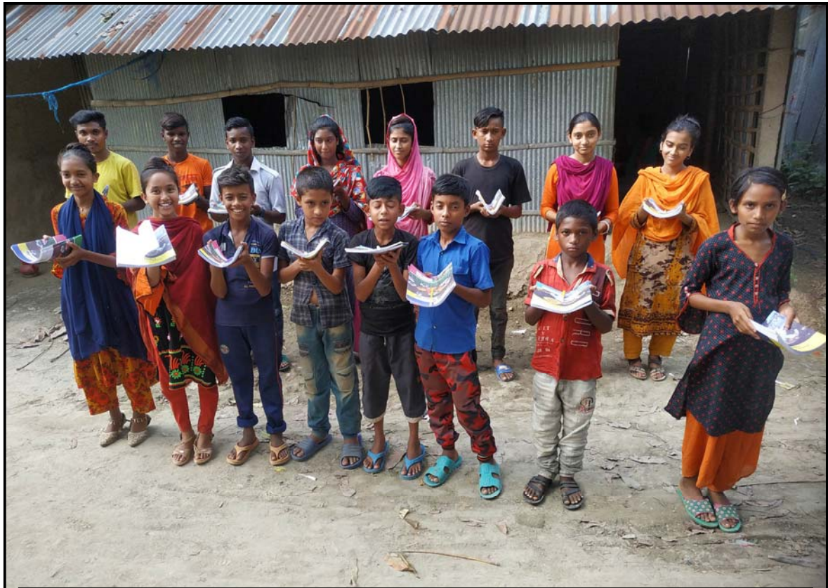
Materials distributed at the Sorupdaho village...