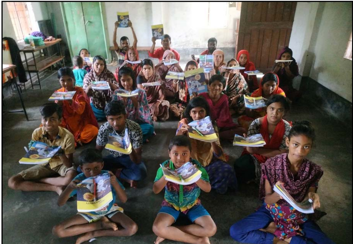
Materials distributed in Mohishati village...