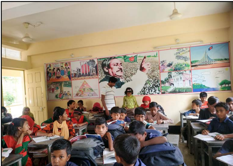
Now regular classes going on in schools and student enjoy in the class!