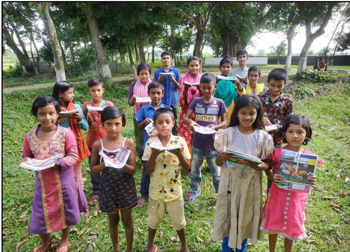
Churamankati students received the materials...