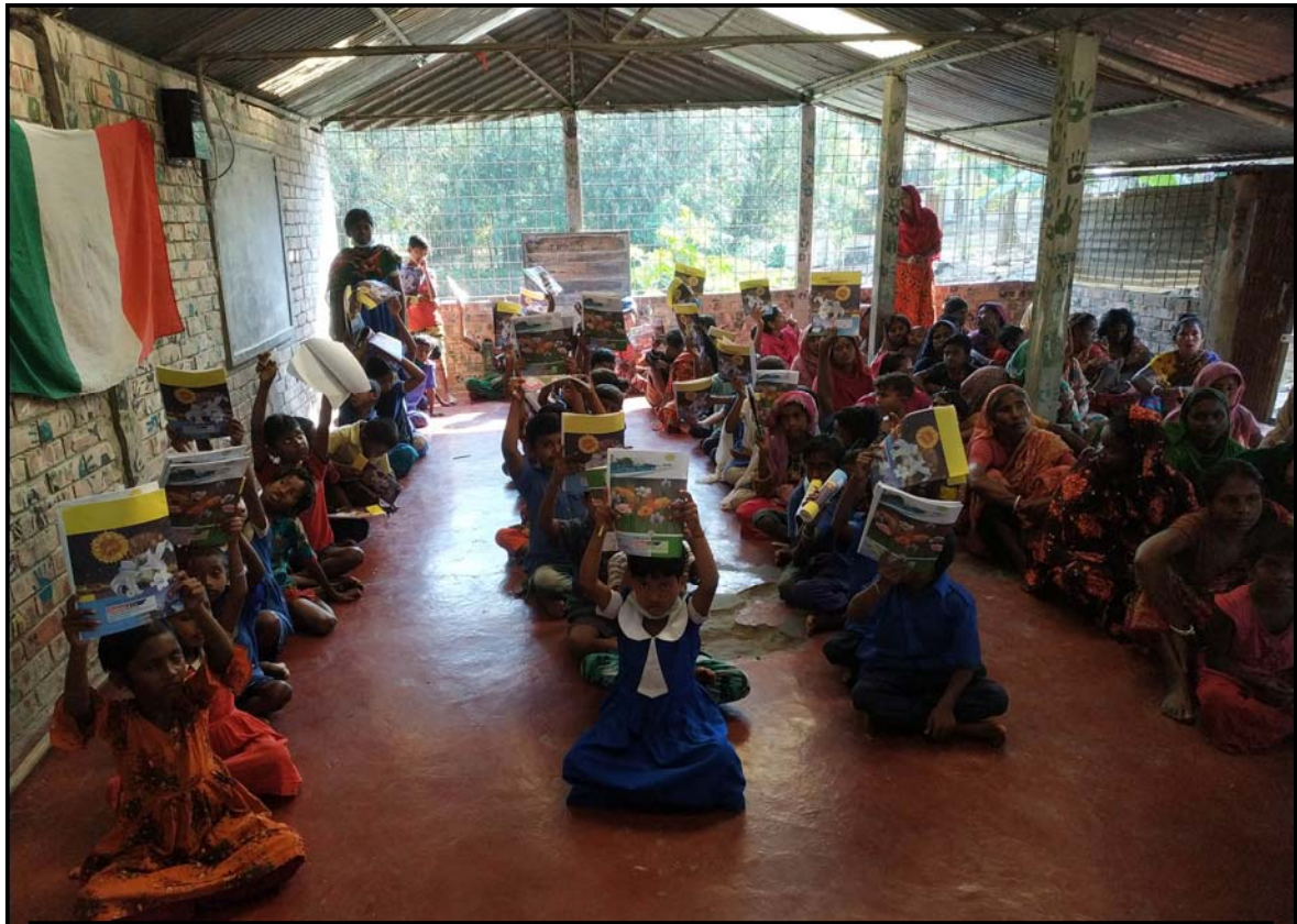
Materials distributed at the Jogahati village...