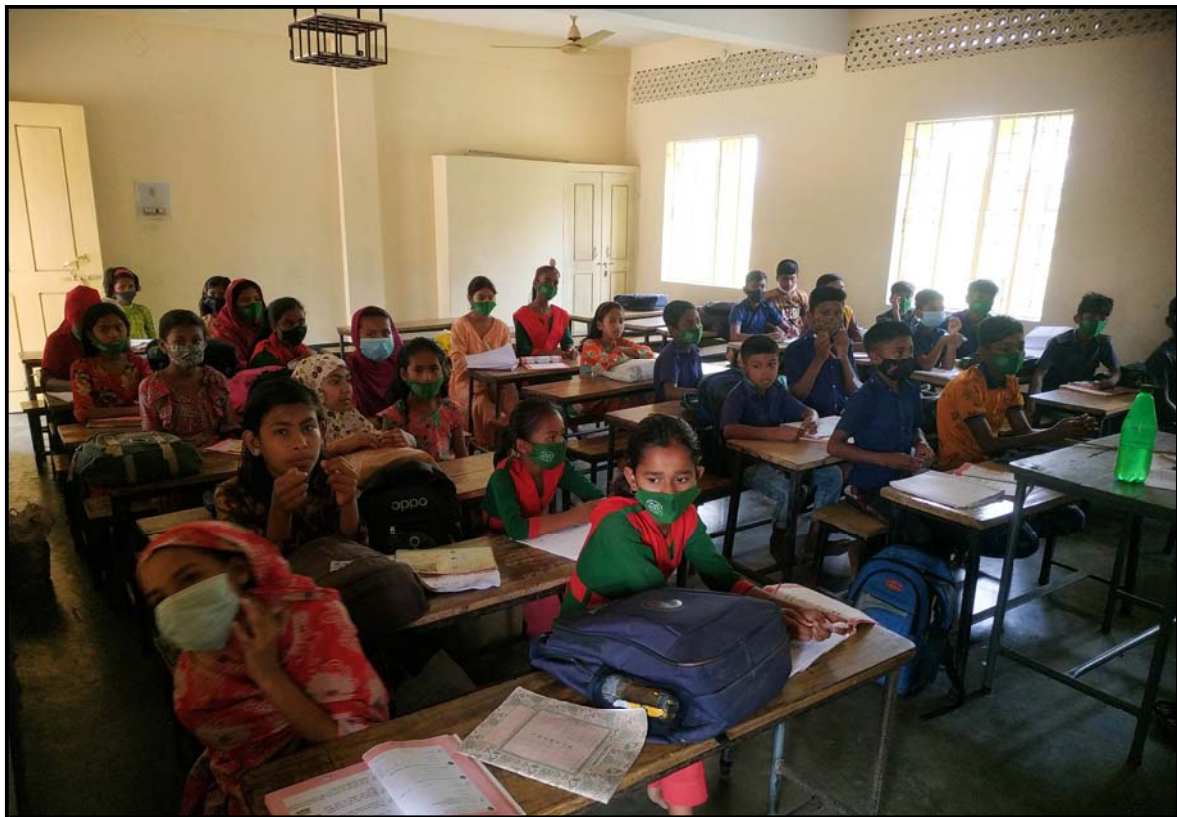
The schools classes and exams are now regular, after long COVID brake...