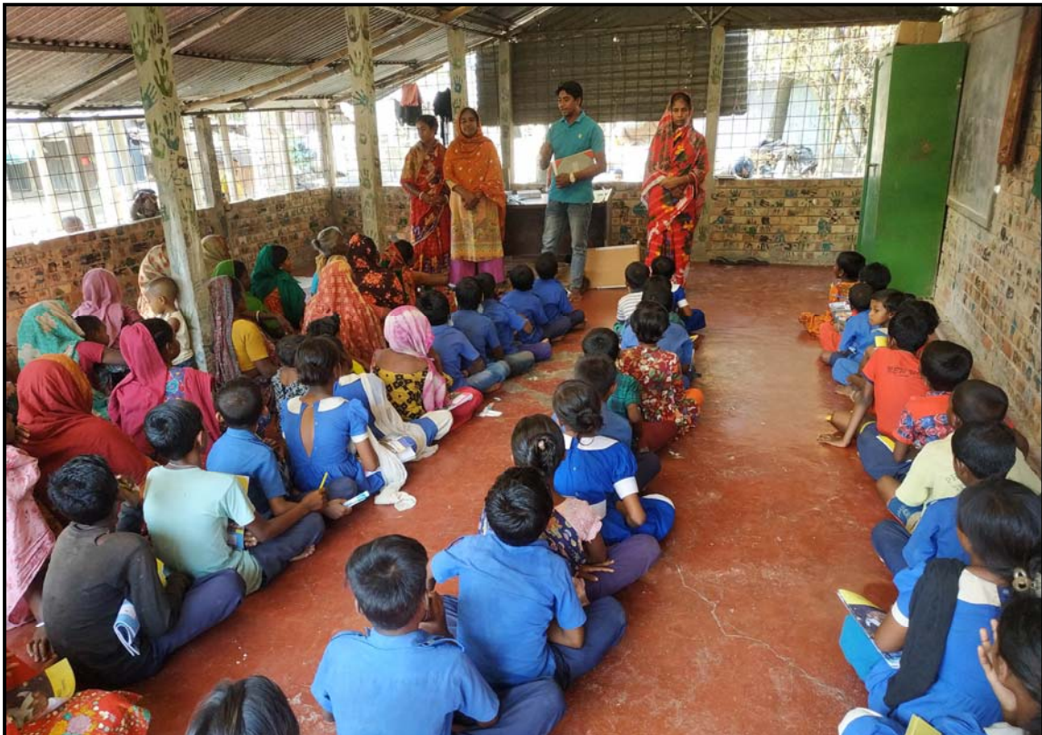
Parents and students meeting at Jogahati village...