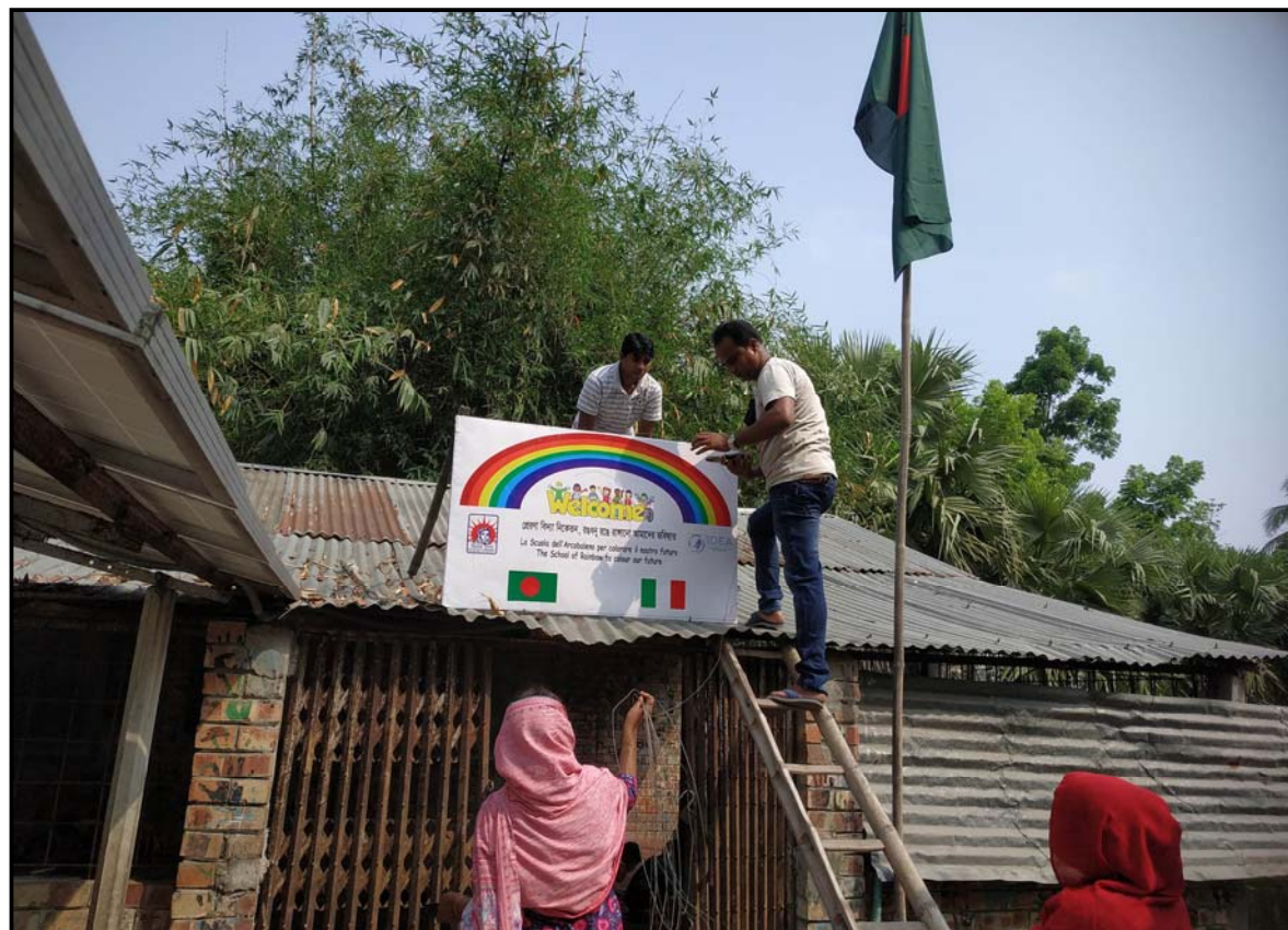
The school signboard was broken so, we replaced it...