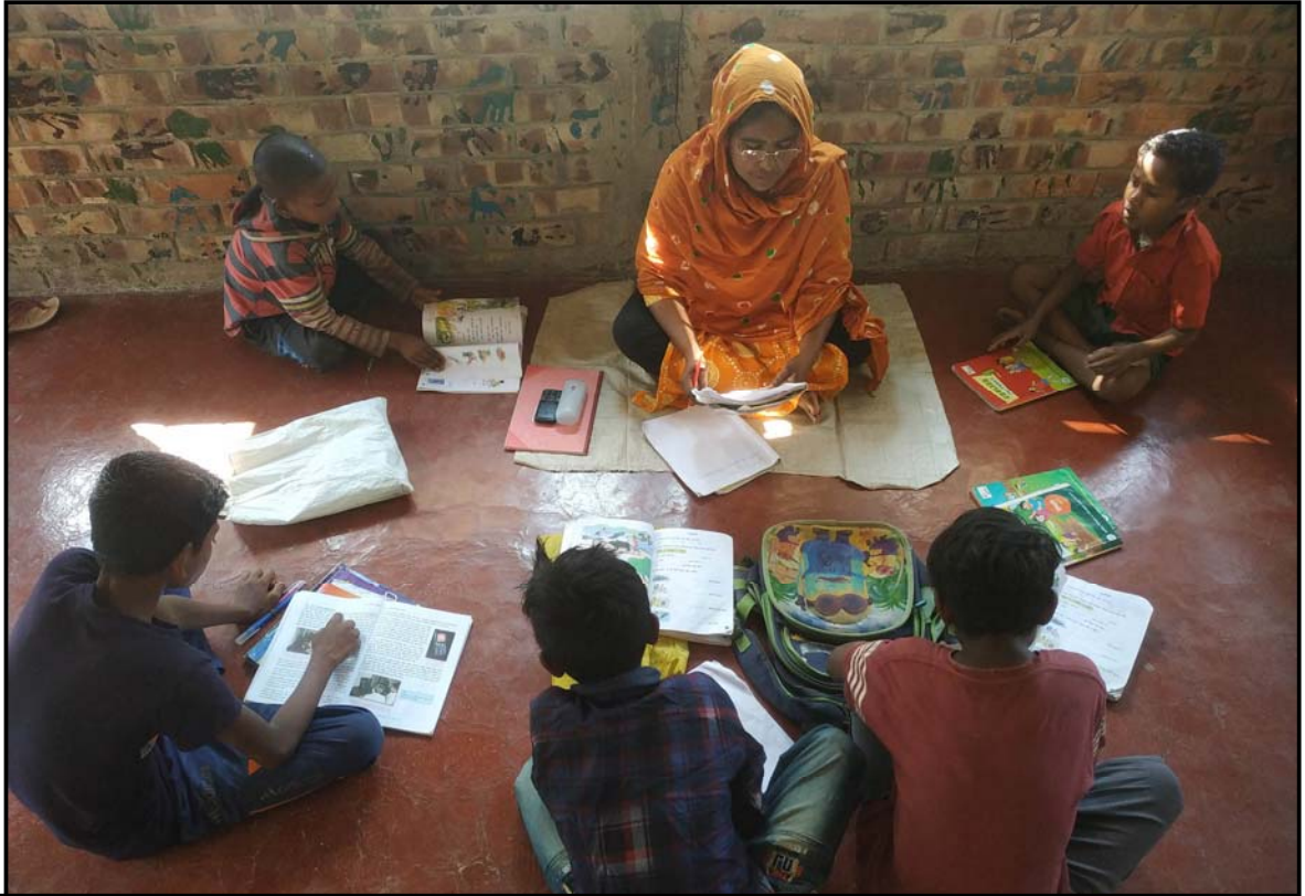
Tuition class at Jogahati village...