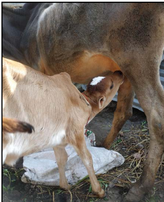
Cow rearing ensure families additional income for sustainable socio economic development!