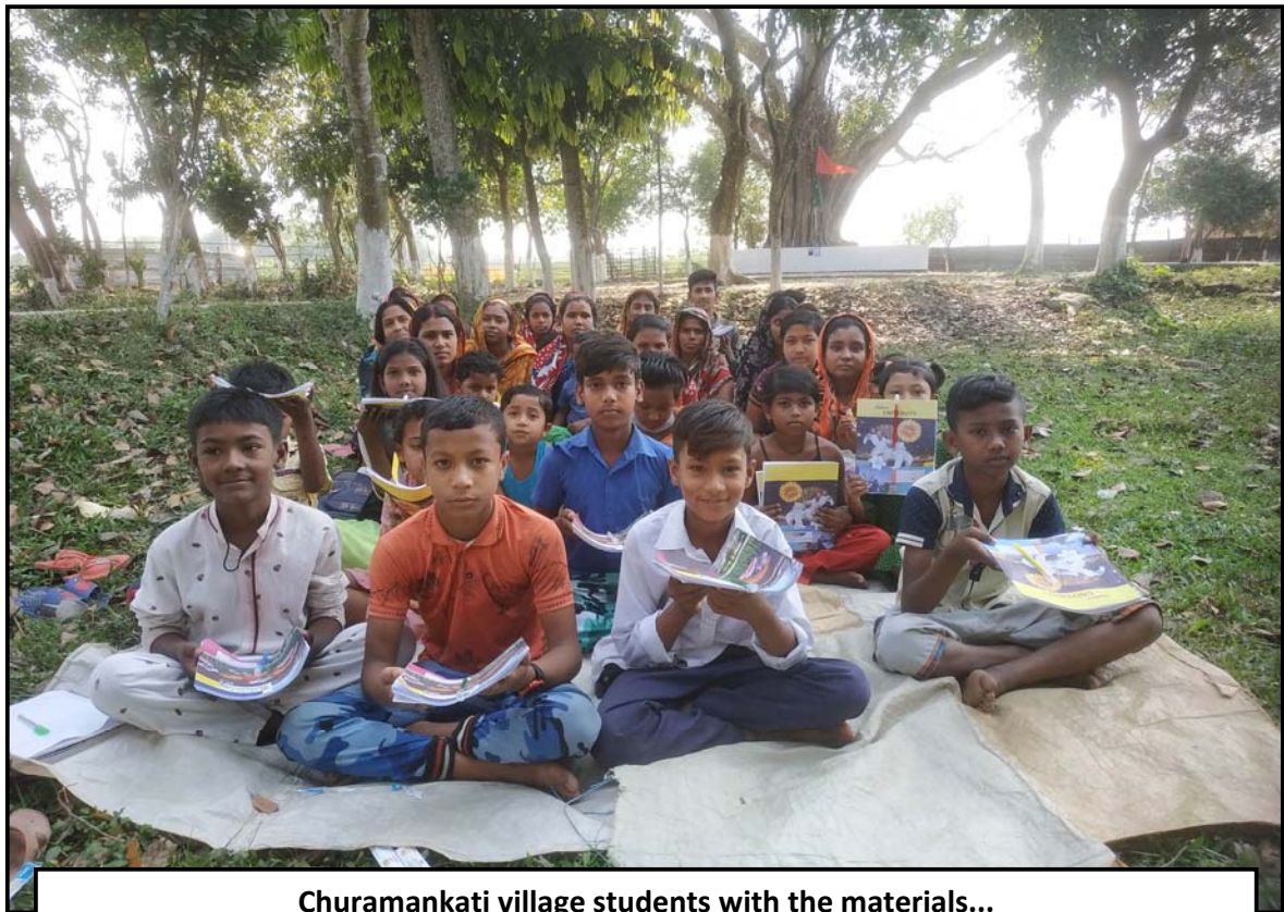
Churamankati village students with the materials...