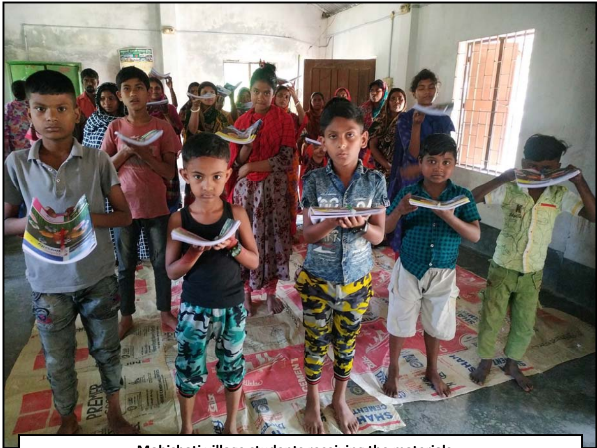
Mohishati village students receiving the materials...