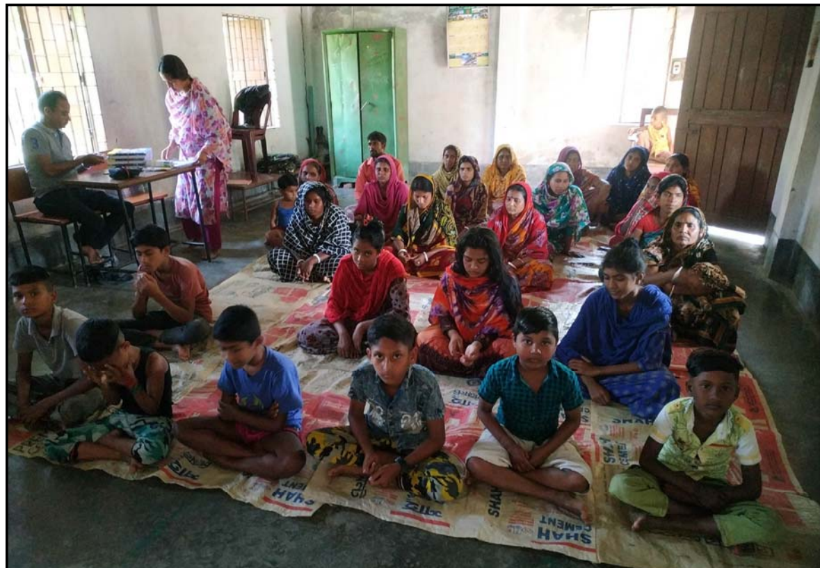
Parents and students meeting at Mohishati village...