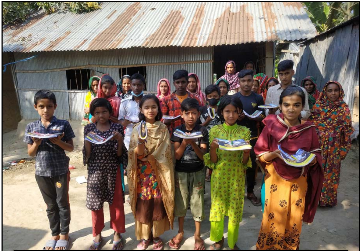
Materials distributed in Sorupdaho village...