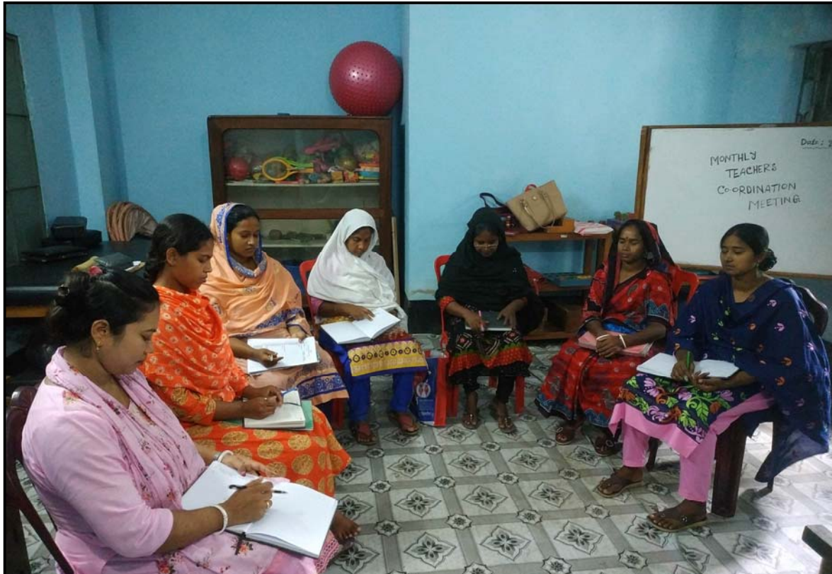
Teachers coordination meeting...