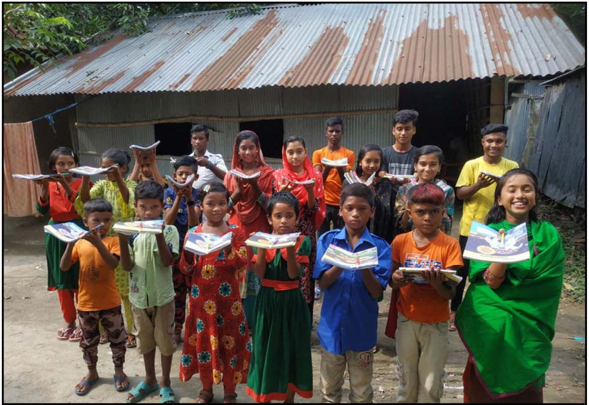
Sorupdaho students received the materials...