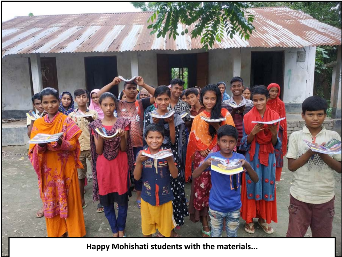
Happy Mohishati students with the materials...