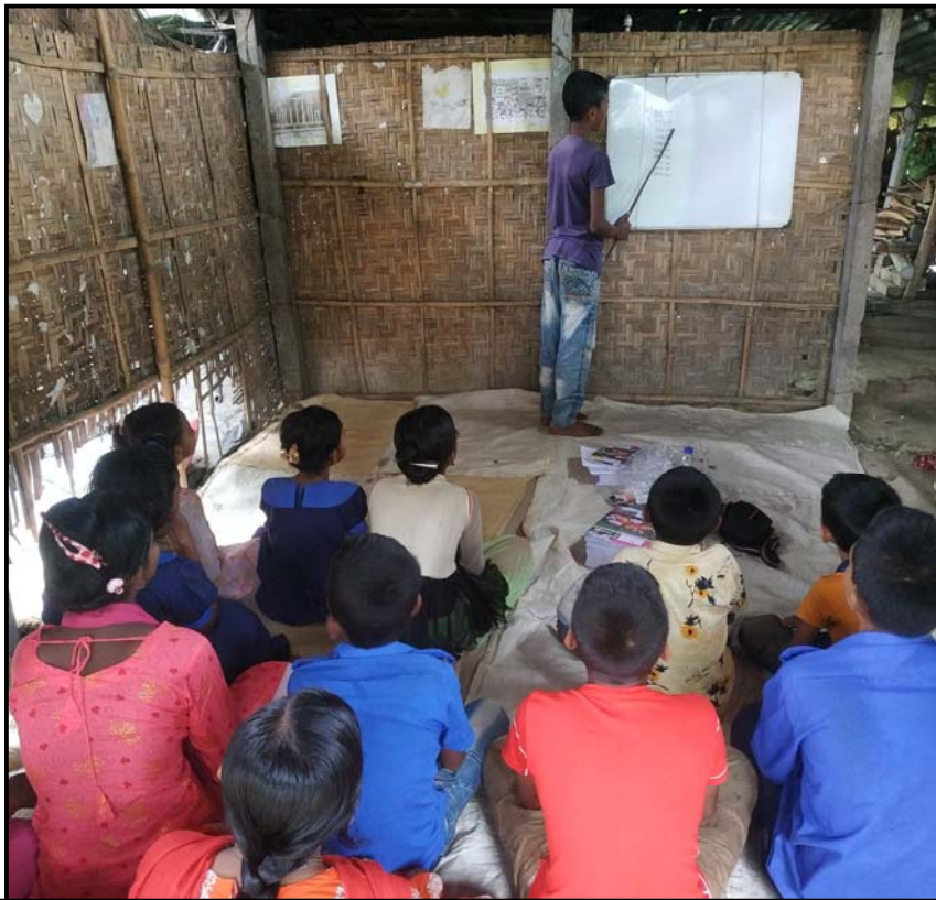
Tuition class at Churamankati village...