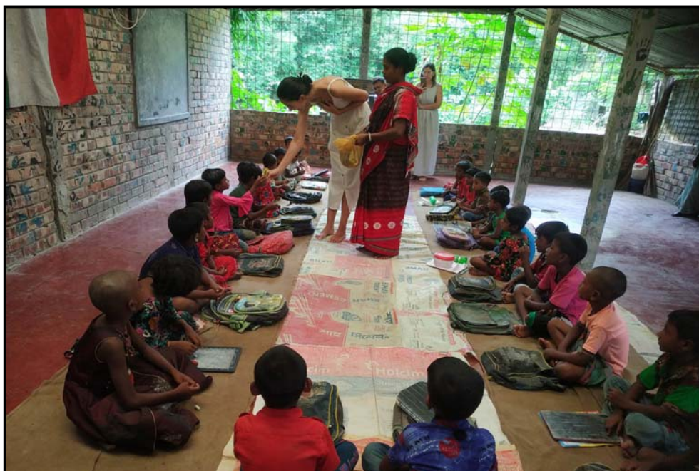
BaSE buyer from Spain distributed Candy to the preschool children. They are very amazed to see IDEA project impact.