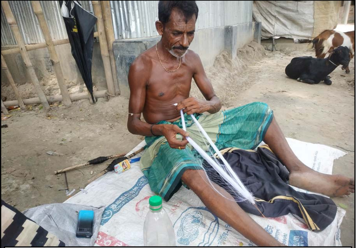
Making fishing net of parents of the children...