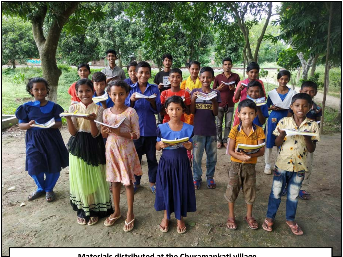
Materials distributed at the Churamankati village...