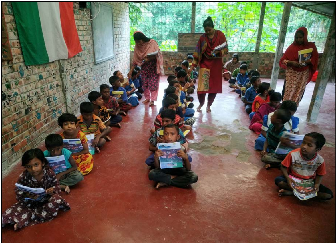
Joghathi materials distribution by the teachers..