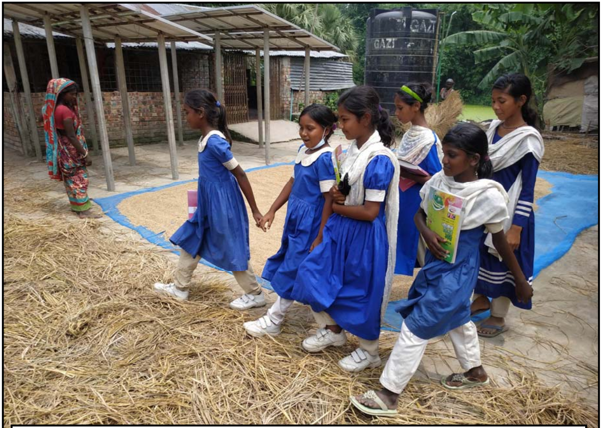
Going to school...