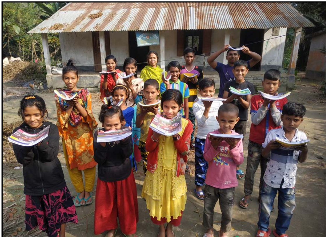
Students with the materials at Mohishati village...