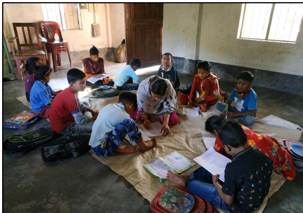
Tuition classes at Mohishati village...