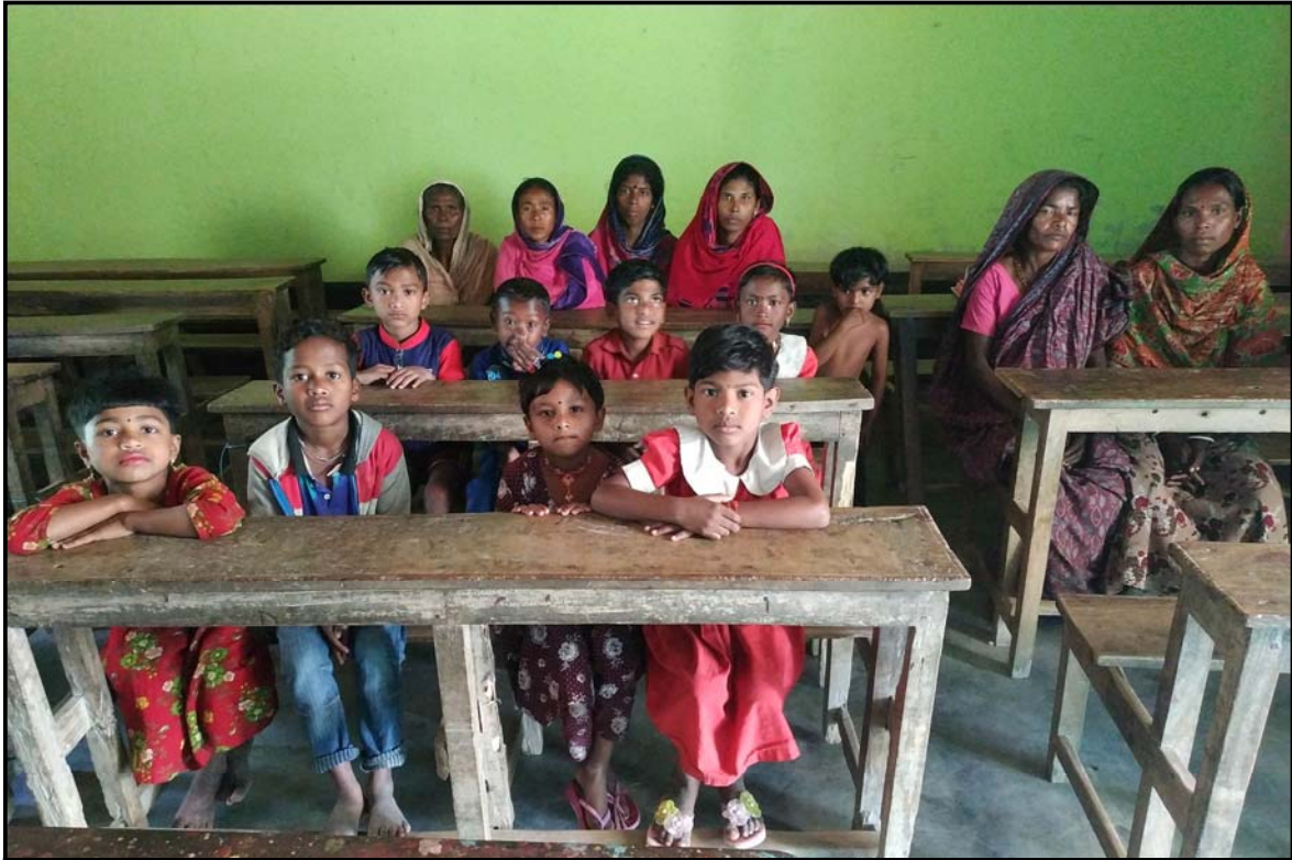
Moms and Preschool students. In 2022 this pre-school students start to Class I primary school...