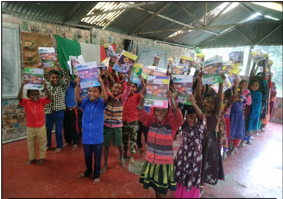
Jogahati students with the materials...