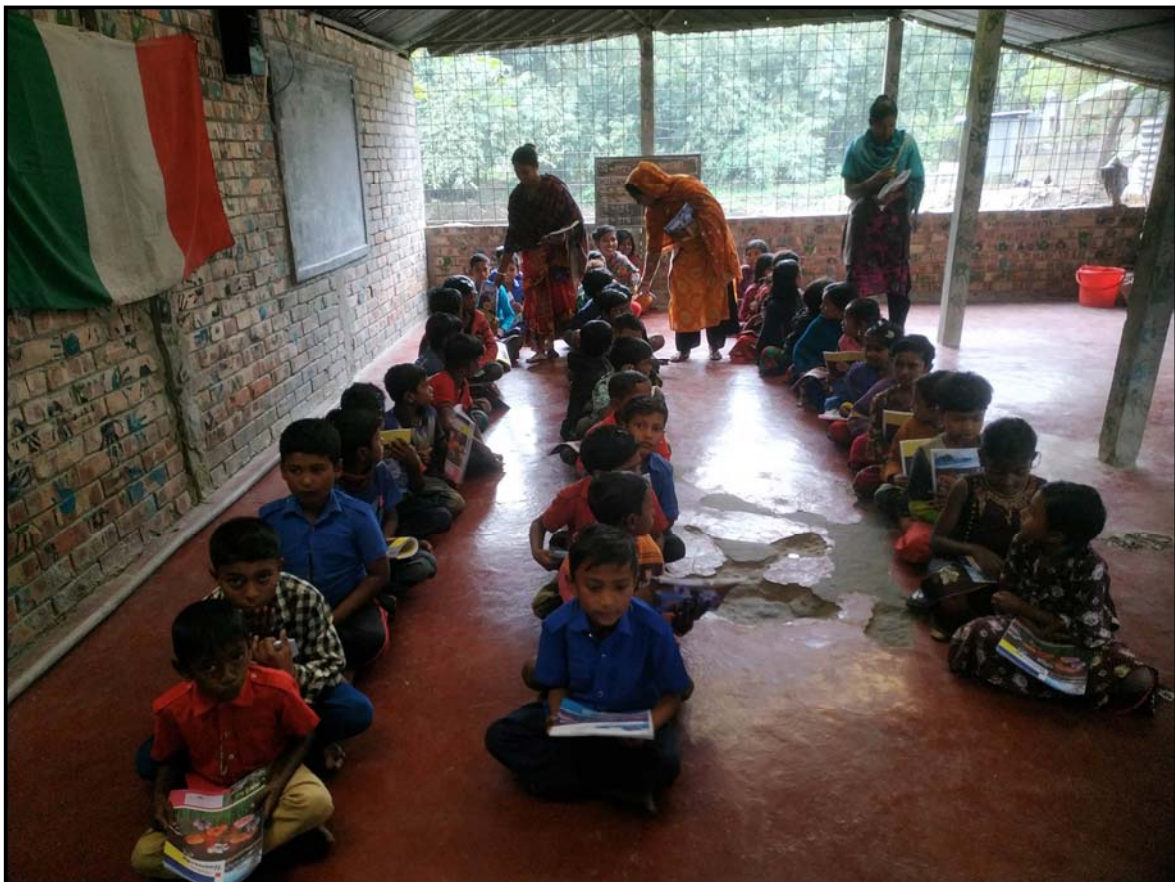
Materials distribution at Jogahati...