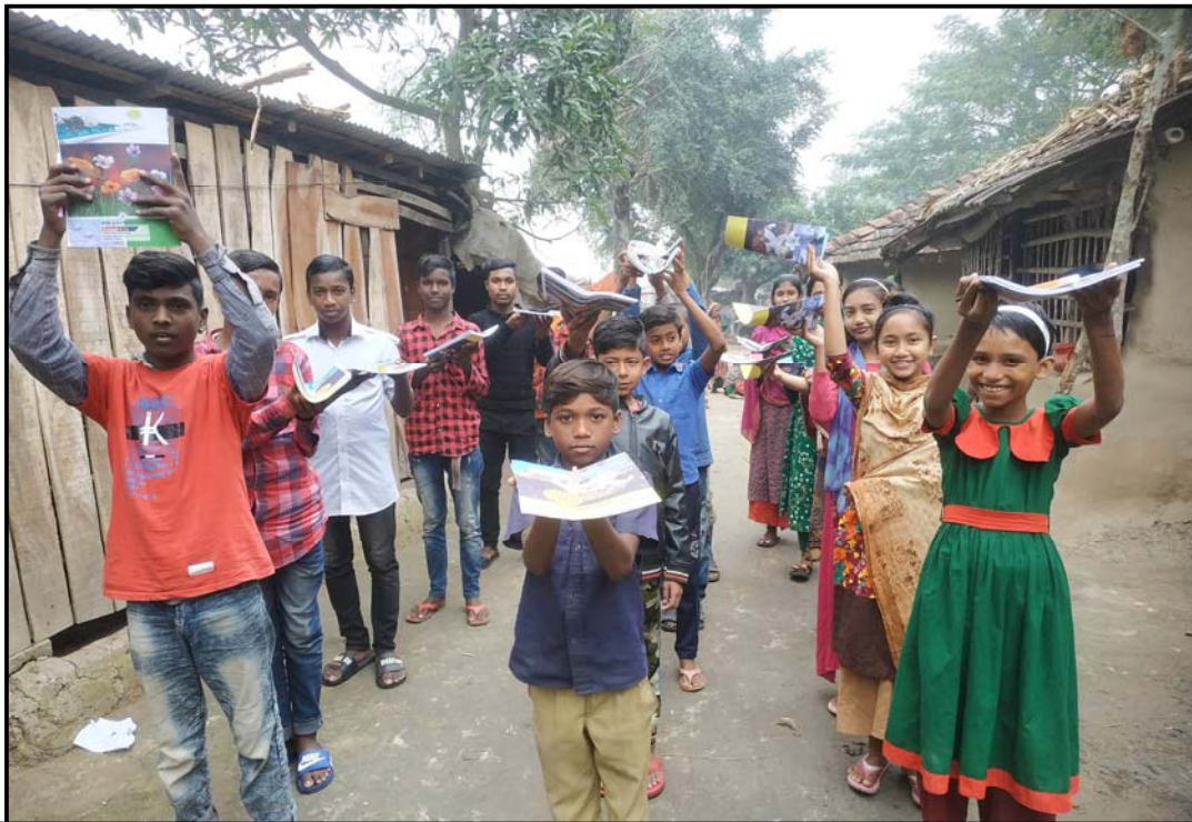
Materials distributed in Sorupdaho village...