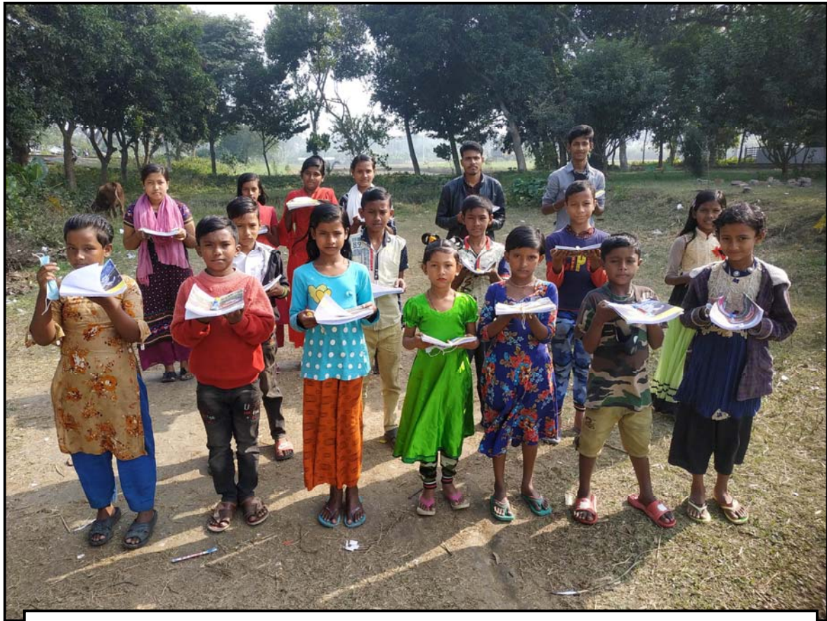
Materials distribution at the Churamankati village...