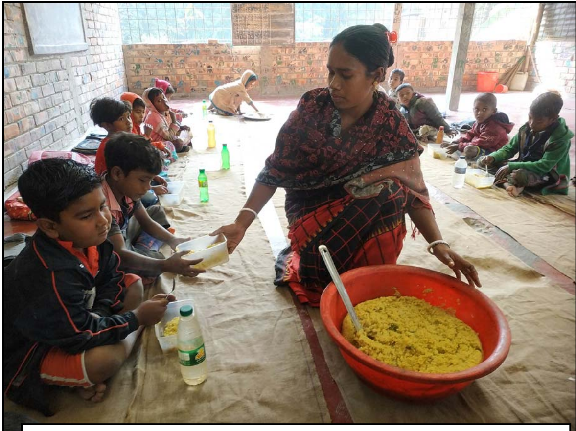
Pre-school students enjoying the warm meal after the class...