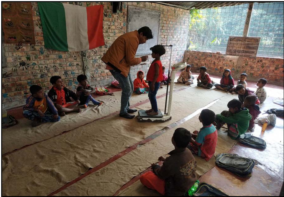
Every month we checked height and weight...