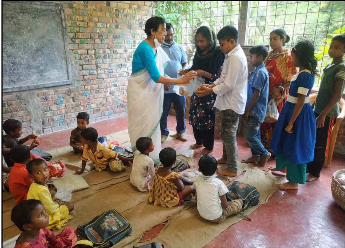
BS Founder and Former Executive Director distributing BS Trees fruits to the children...