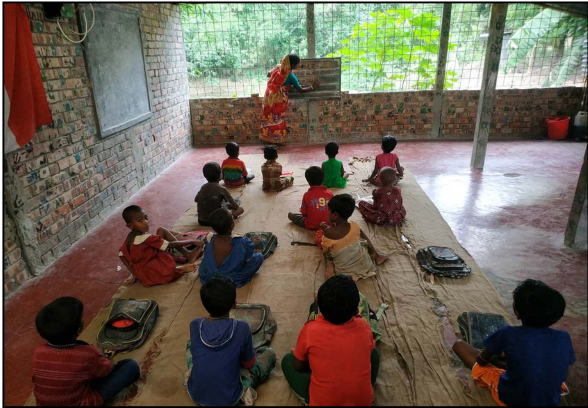
A class ongoing in Jogahati preschool...