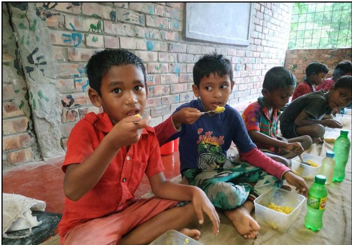
The preschool kids enjoying the lunch after class...