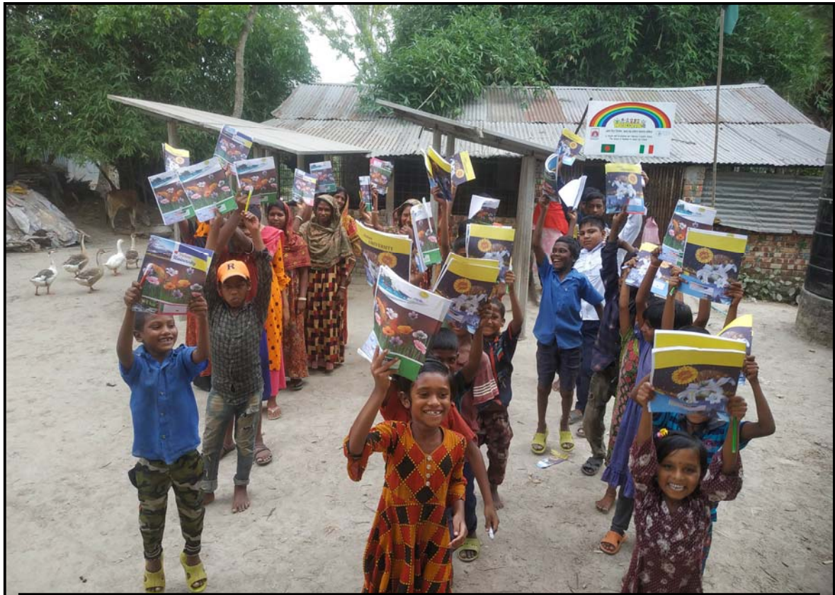
Materials distributed at the Jogahati village...