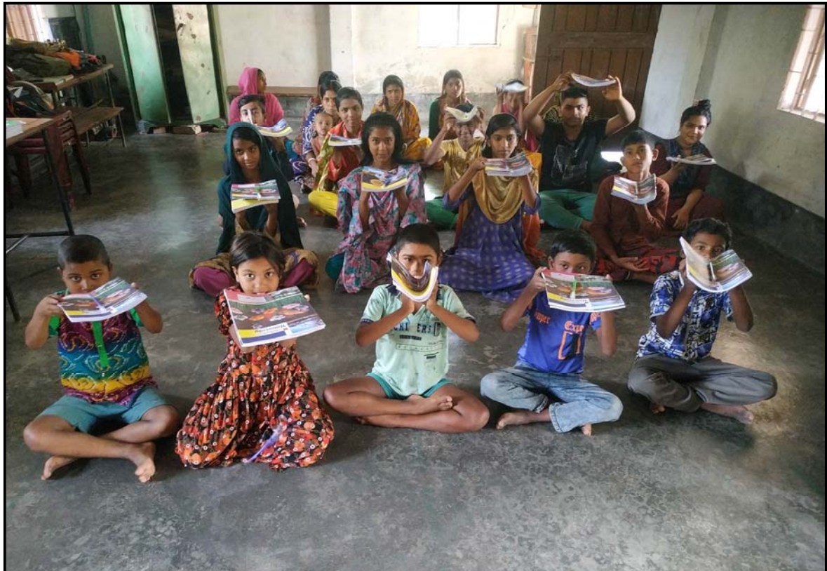
Materials distributed in Mohishati village...