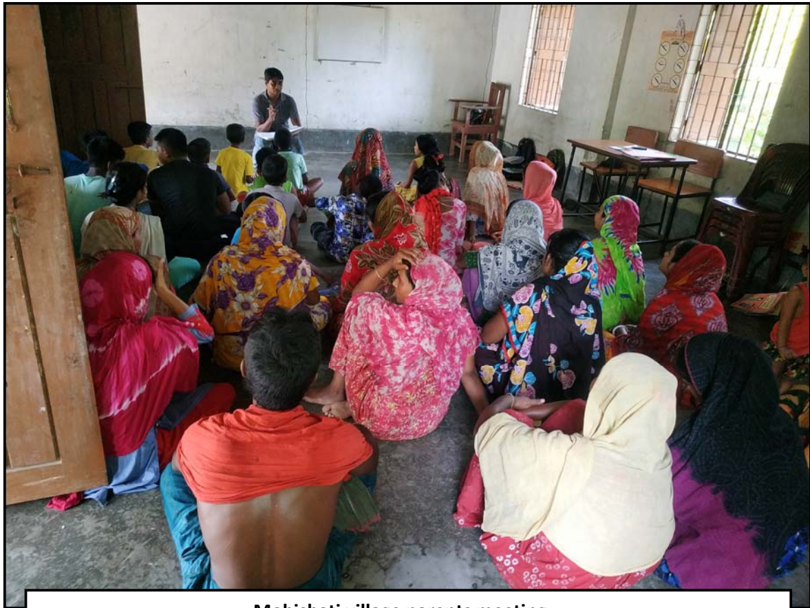
Mohishati village parents meeting...