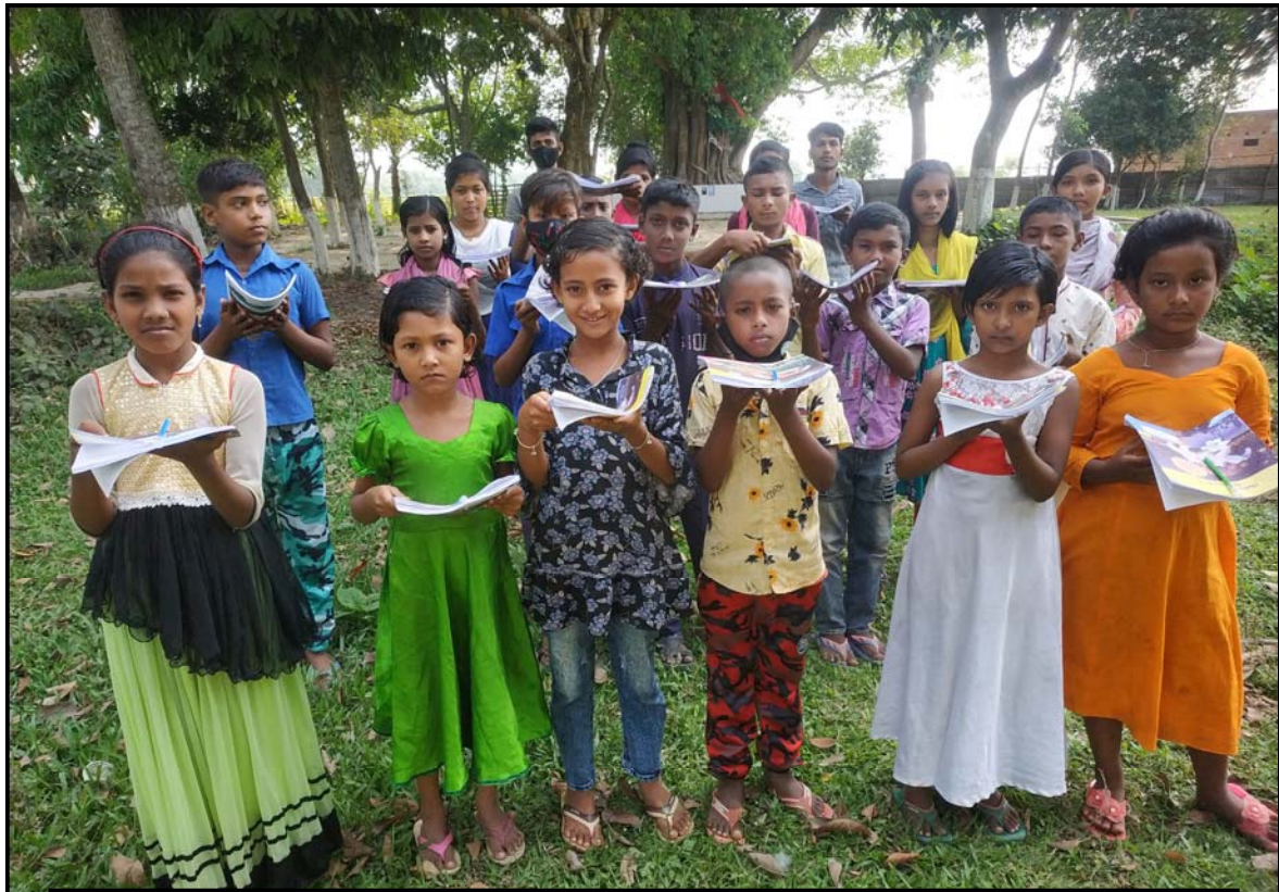
Materials distributed in Churamankati village...