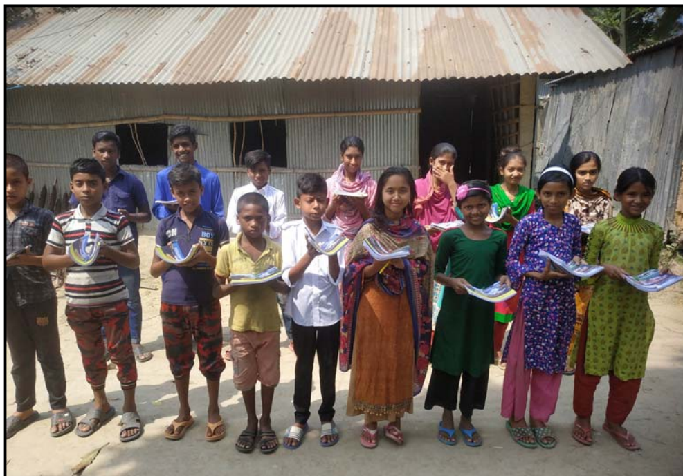
Happy students at the Sorupdaho village with the materials!