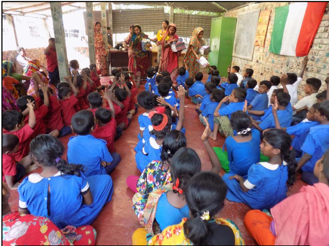
Jogahati village committee distributing materials to the students...