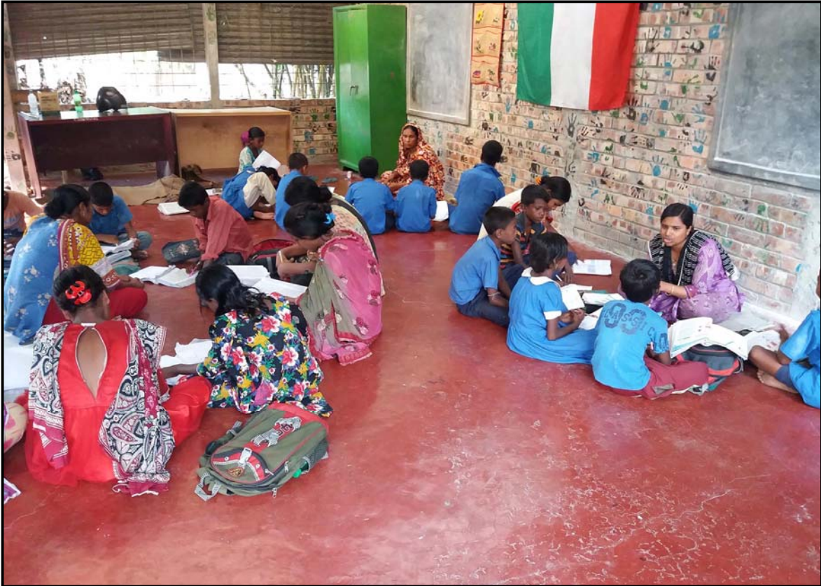
Tuition class at Jogahati village..