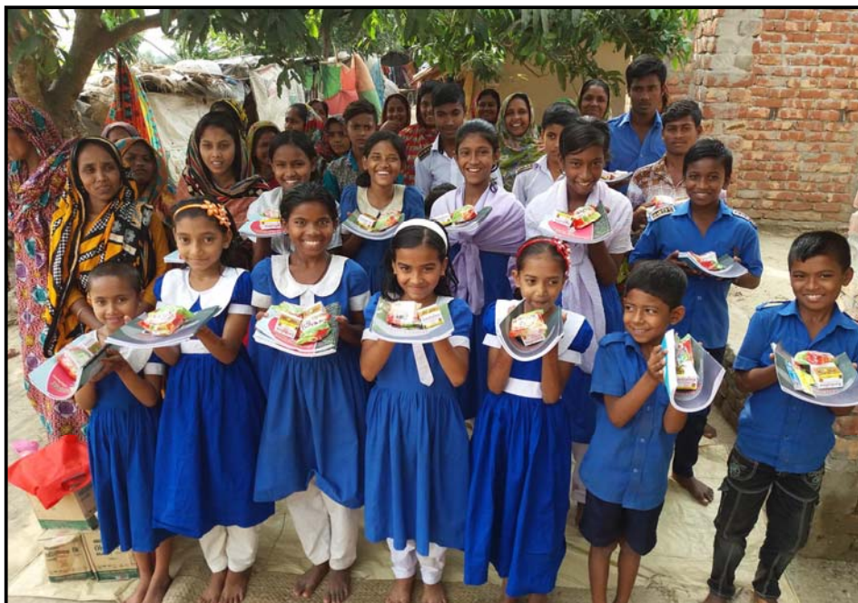
Happy students with the materials...