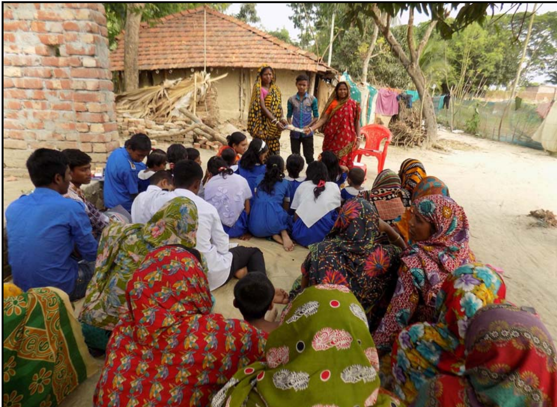
Materials distribution at Sorupdaho village...