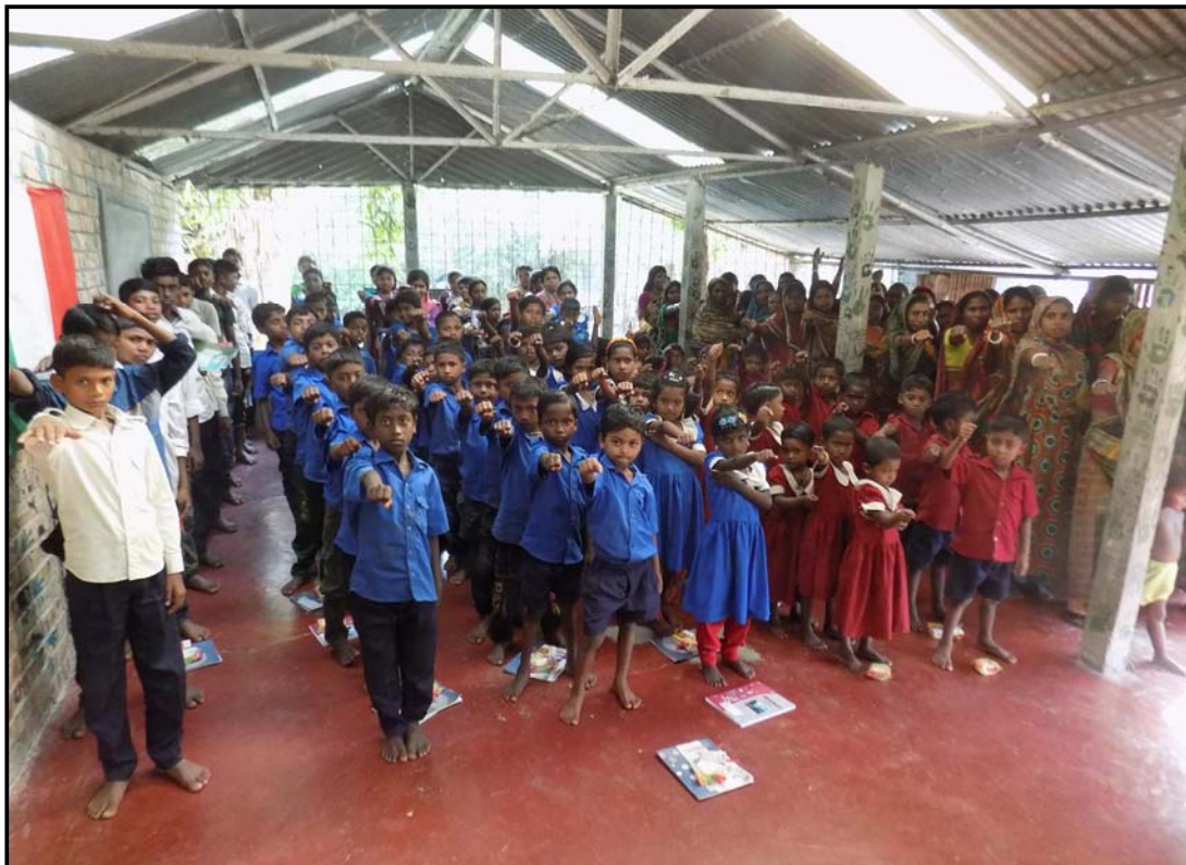
Jogahati parents & students oath to prevent early marriages...