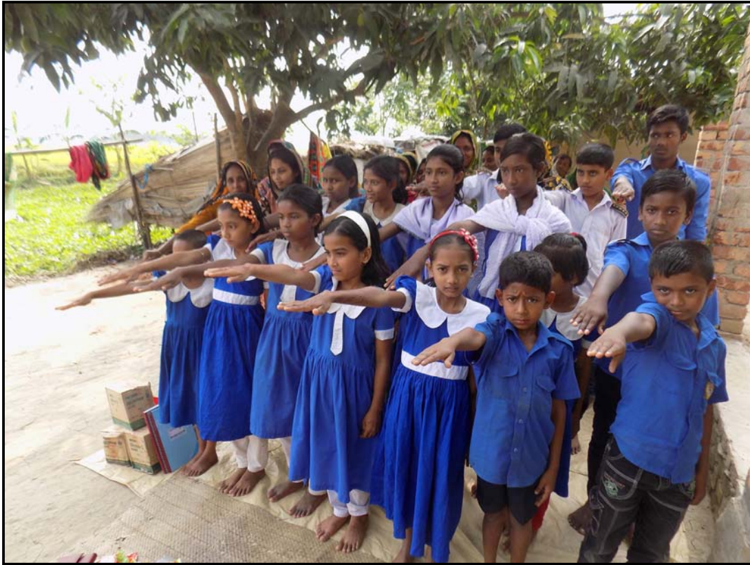
Sorupdaho parents and children oaths to prevent early marriage...