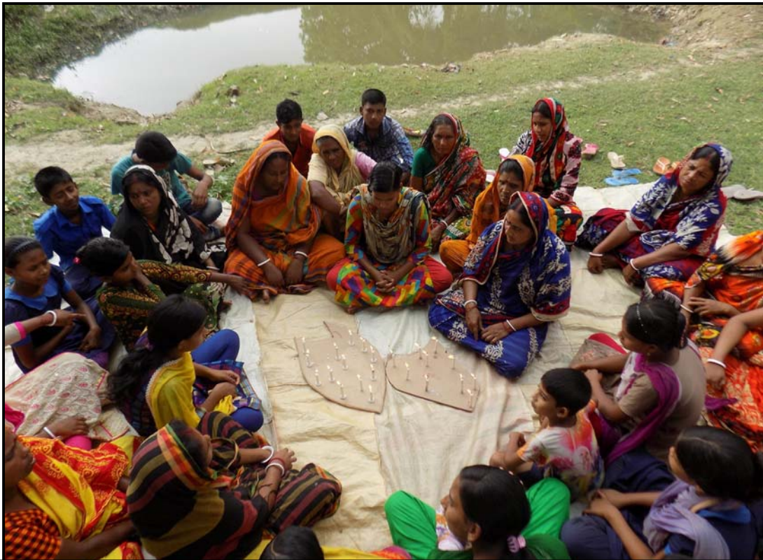
Parents awareness meeting at Churamankati village to prevent early marriage...