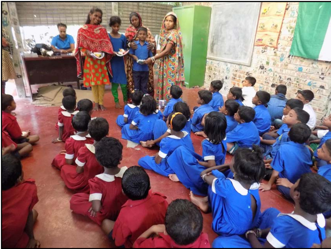
Materials distribution at Jogahati village...