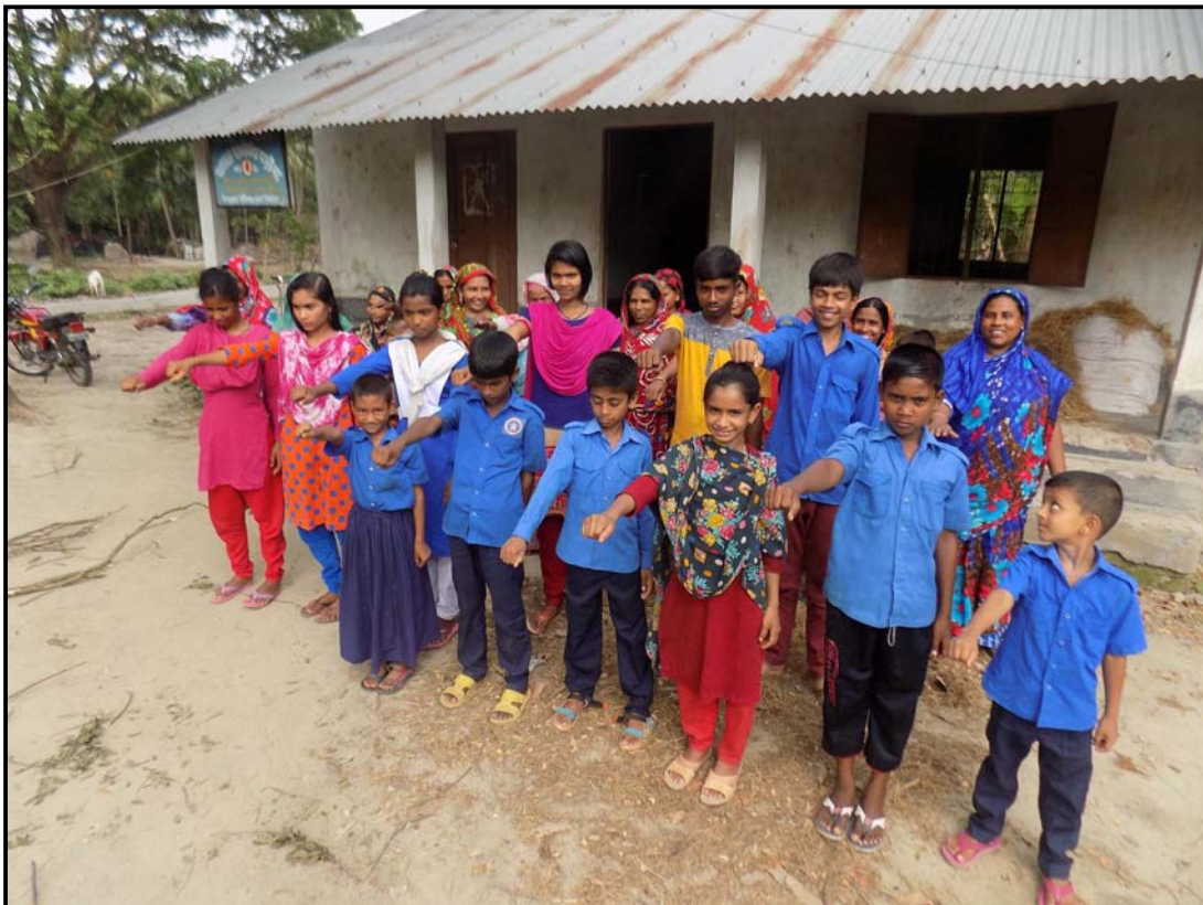
Mohishati parents and students take oaths to not get early marriage...