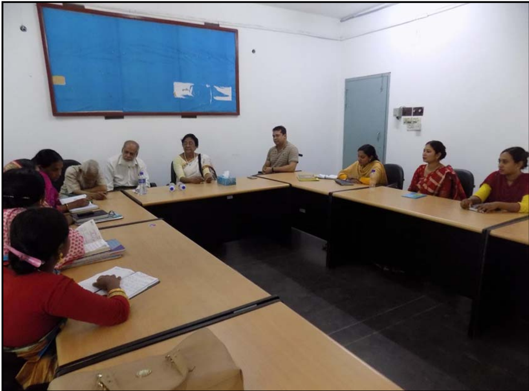
Teachers monthly coordination meeting...