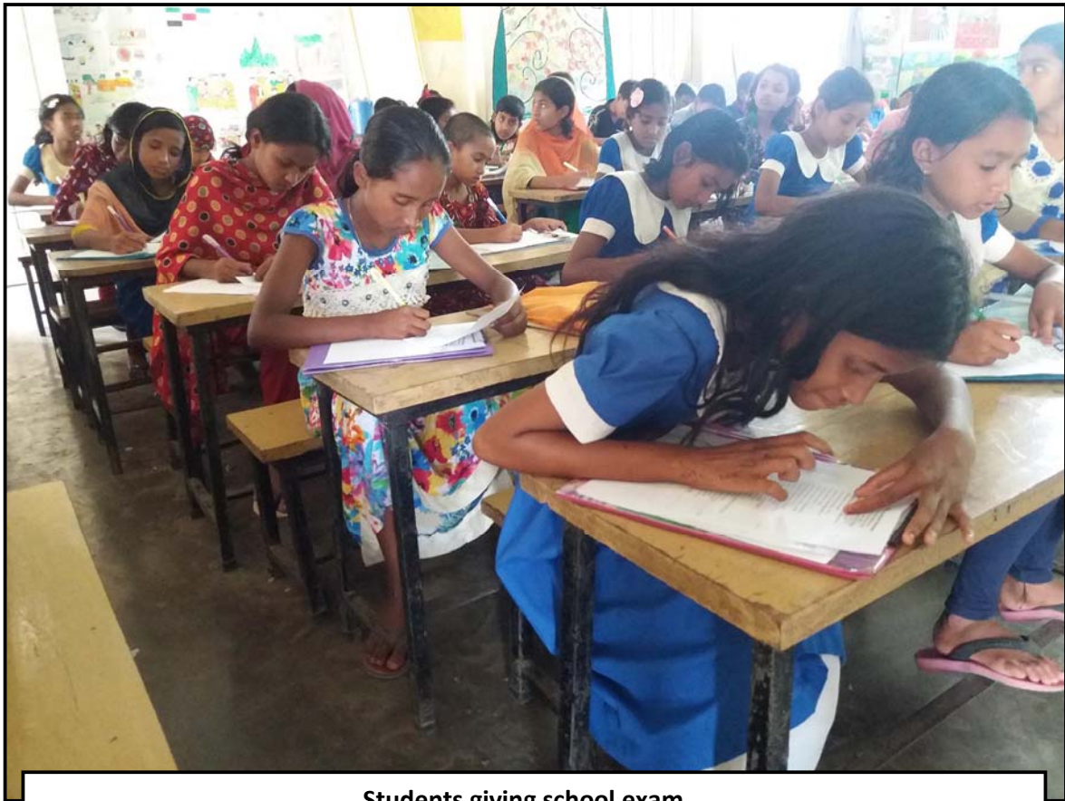
Students giving school exam...