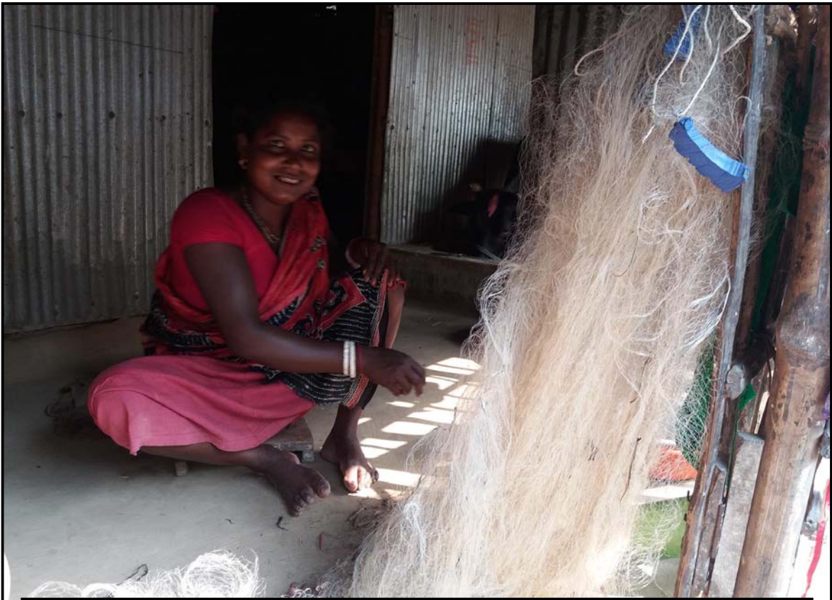
Mother making the fishing net at Jogahati...