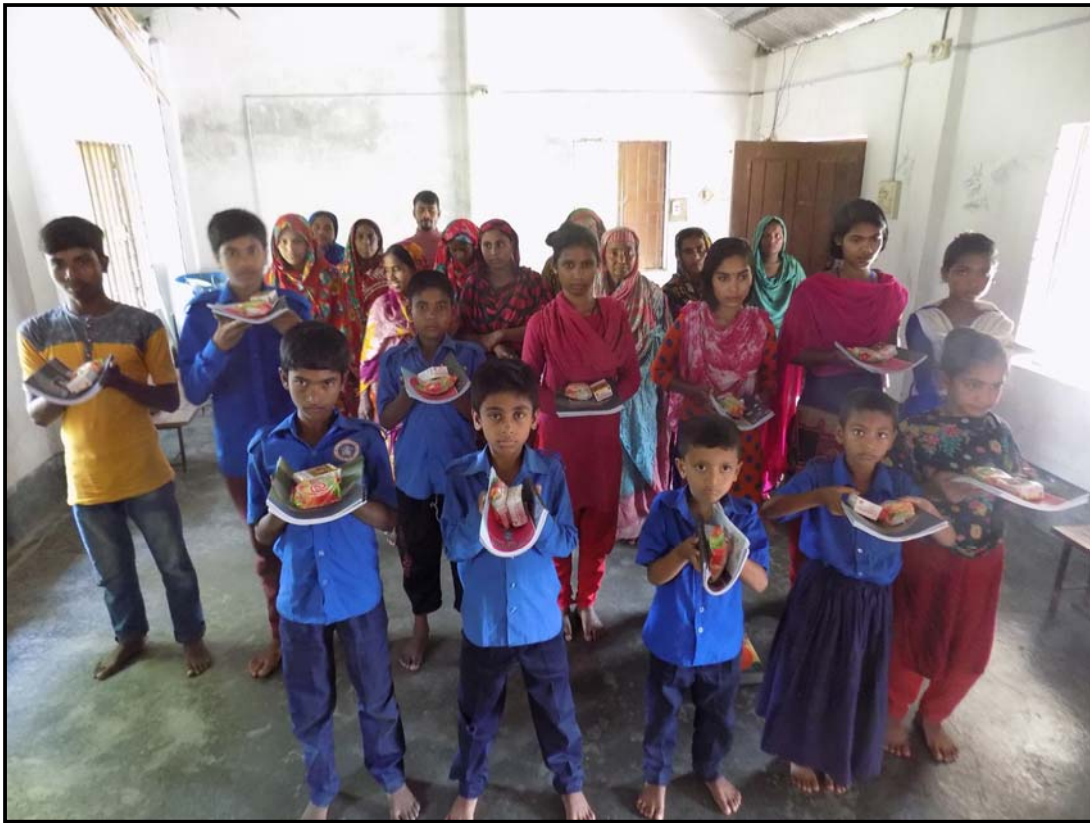
Mohishati students with materials...