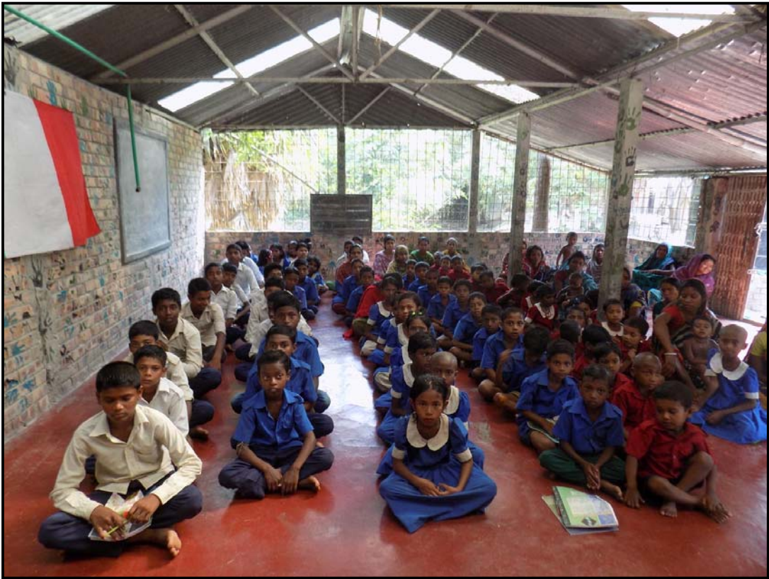
Jogahati community parents-students monthly meeting...