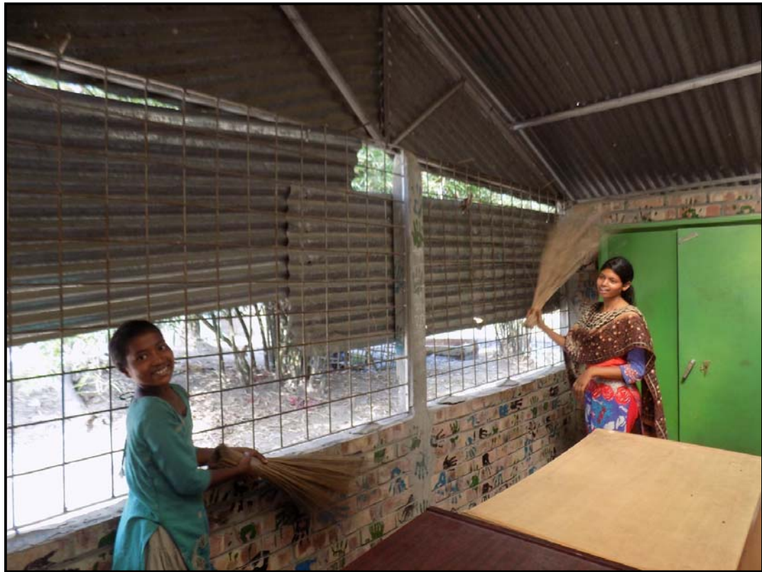
We start to make monthly community cleaning programme...