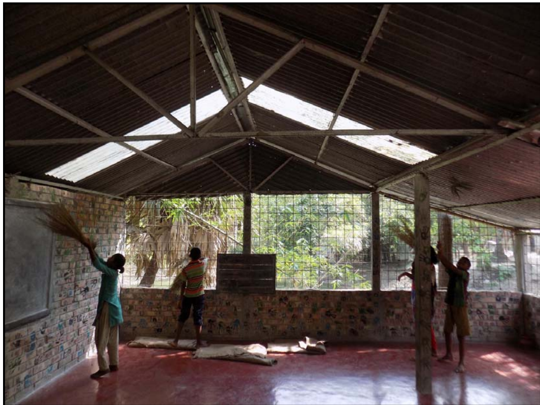
Students cleaning the pre-school inside...