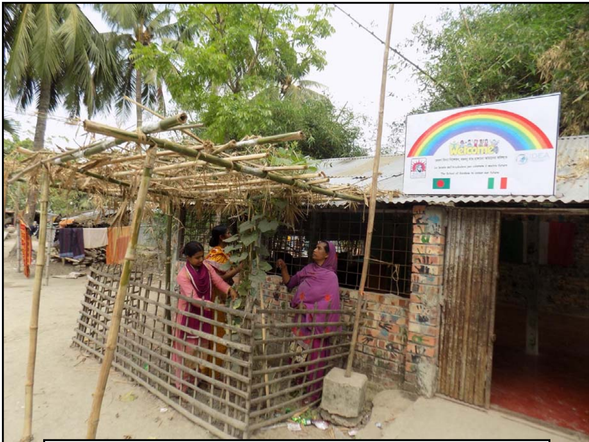
In front of pre-school vegetable garden...