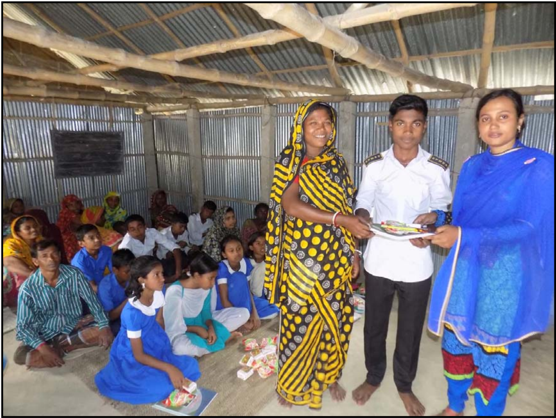
Materials distribution at Sorupdaho village...