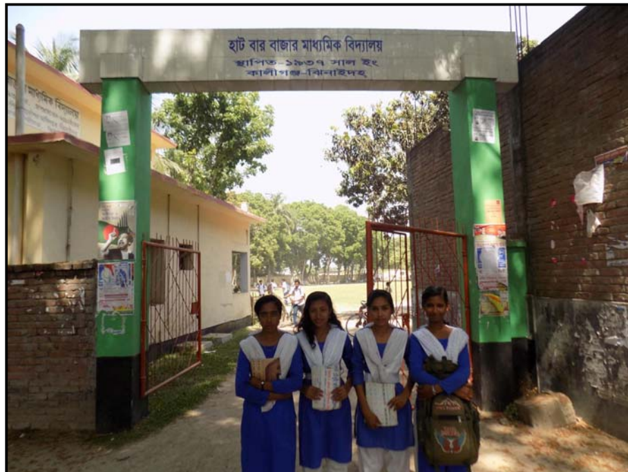
Our supported students in front of school...