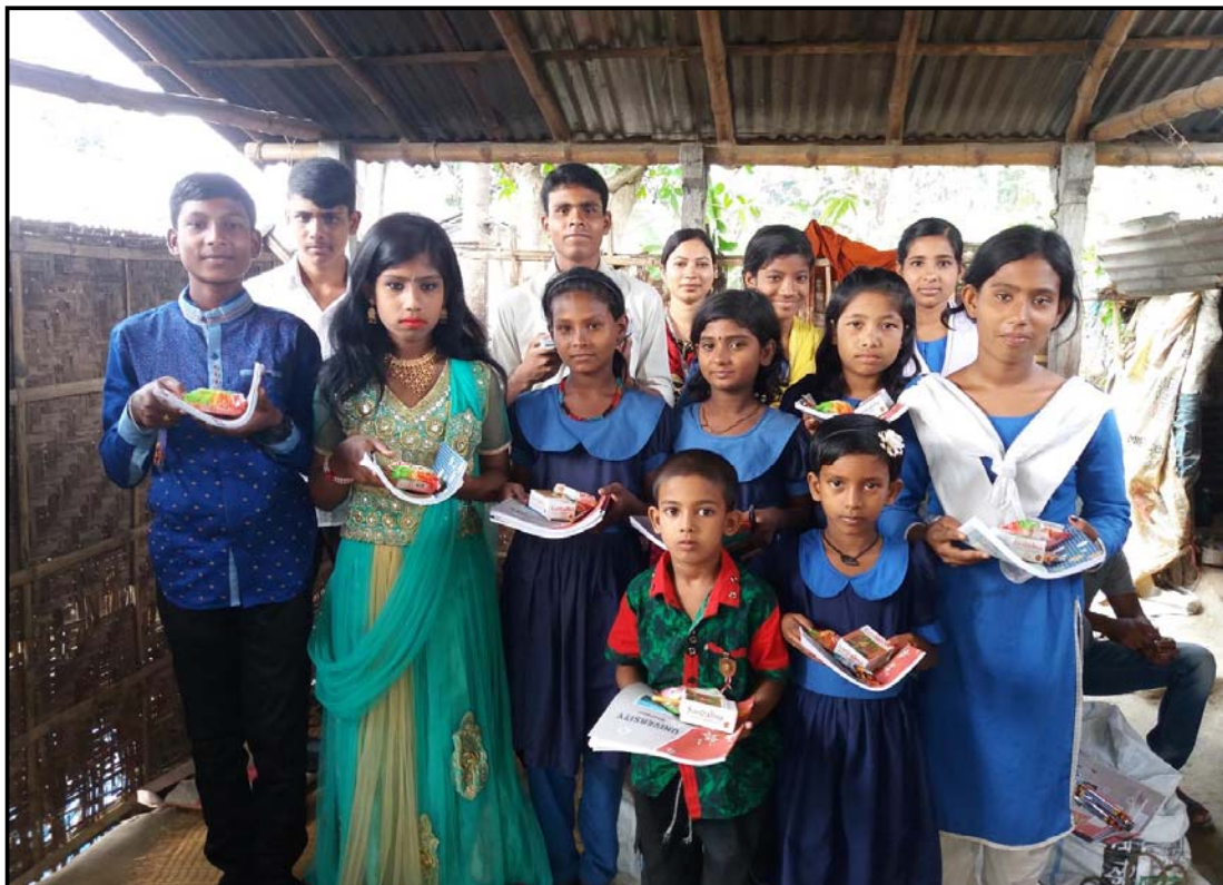
Happy Churamankati students with materials...