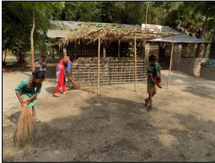
Students cleaning the village...