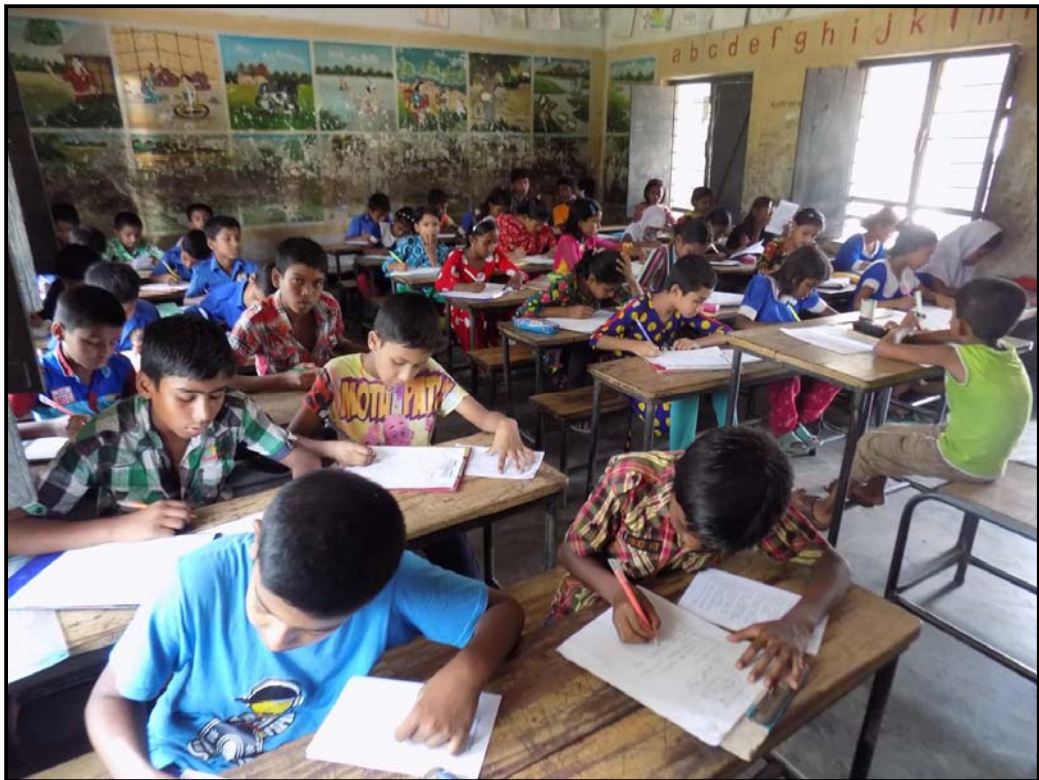
Very attentively giving the exam...