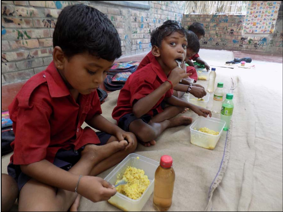
Pre-school students having Khitchury at class.....