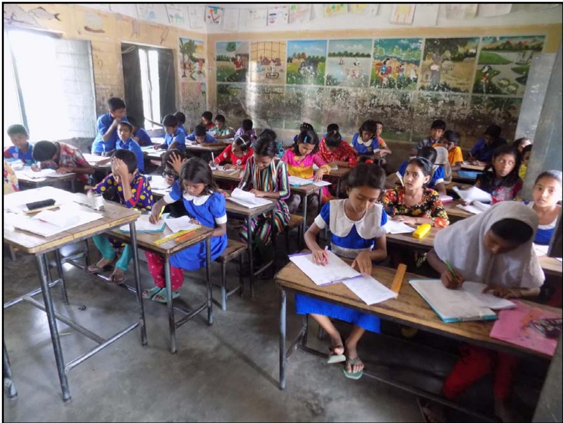
Students giving the class first terminal exam....