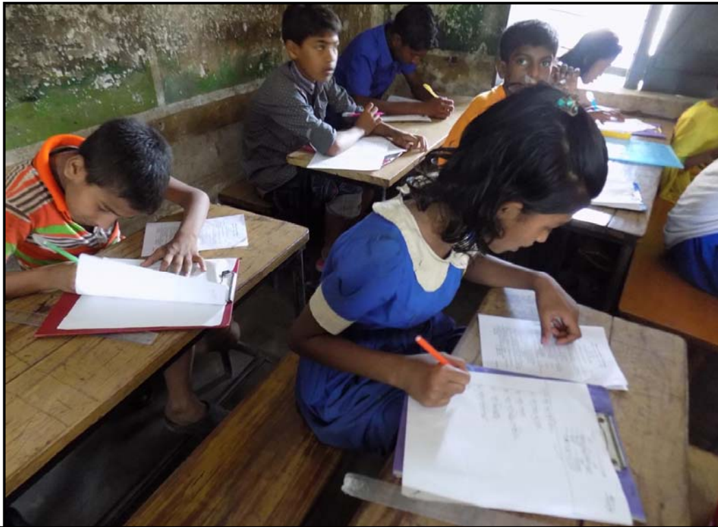
The students are motivated to pass with good result...