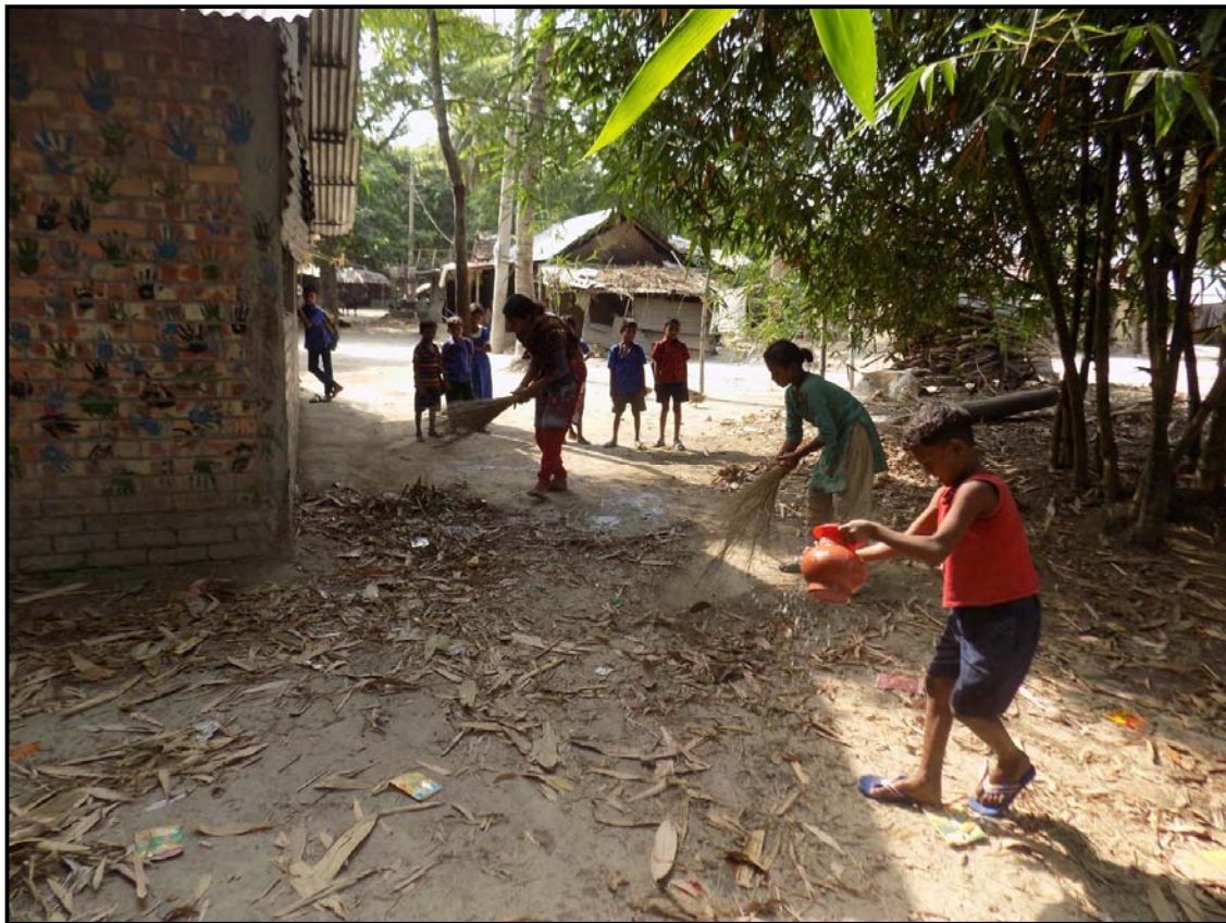
The monthly cleaning programme was very successful...