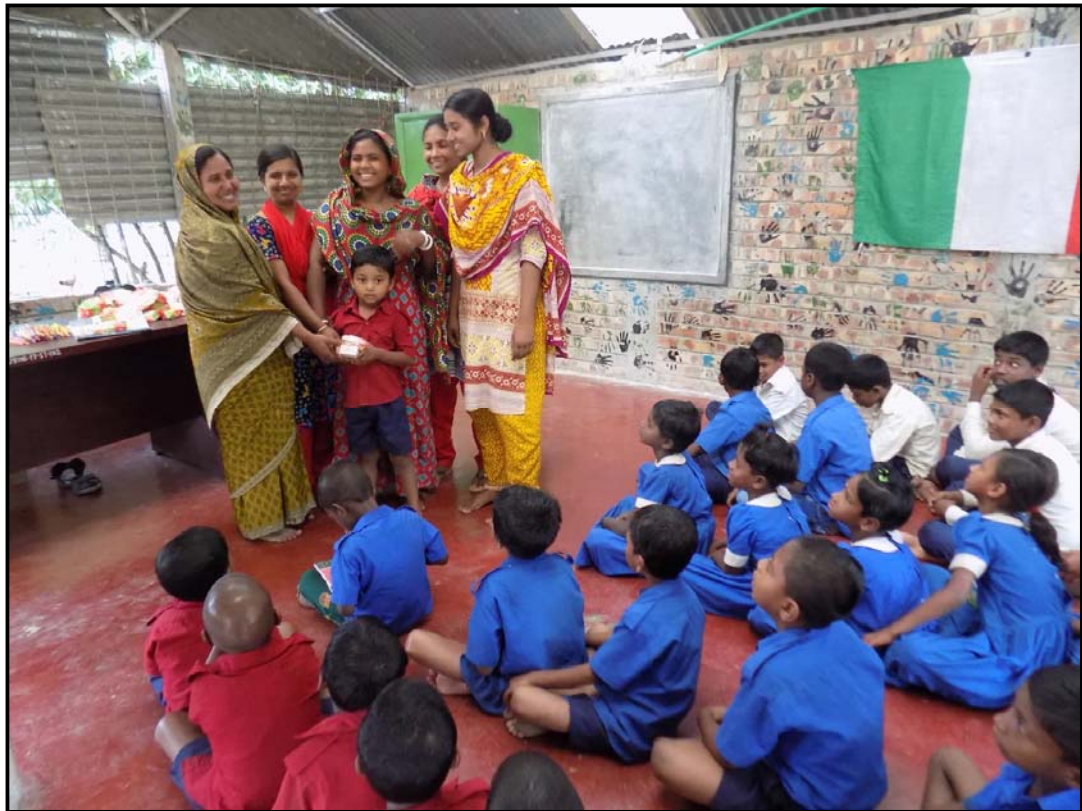
Materials distribution at Jogahati...