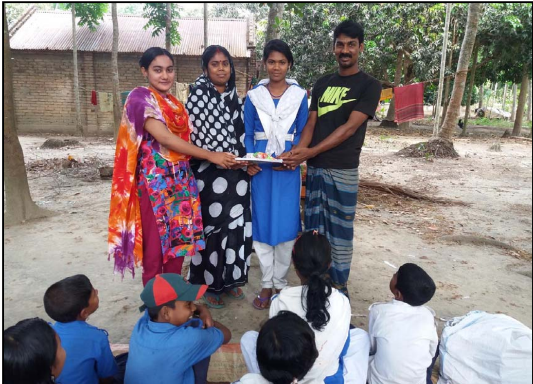
Materials distribution at Mohishati...