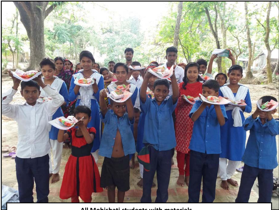
All Mohishati students with materials...