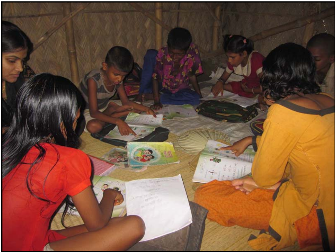
Tuition Programme at Churamankati...