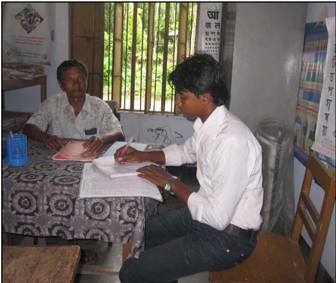
Community Motivator checking student school attendance at Mohishati Govt. School...