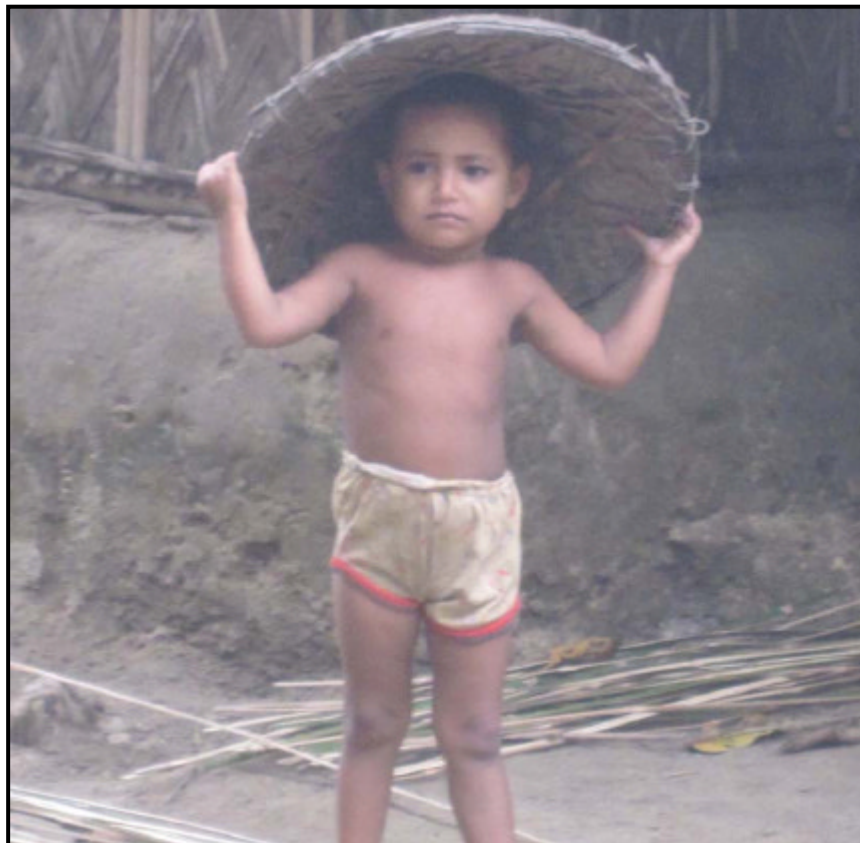
Jogahati village children.....