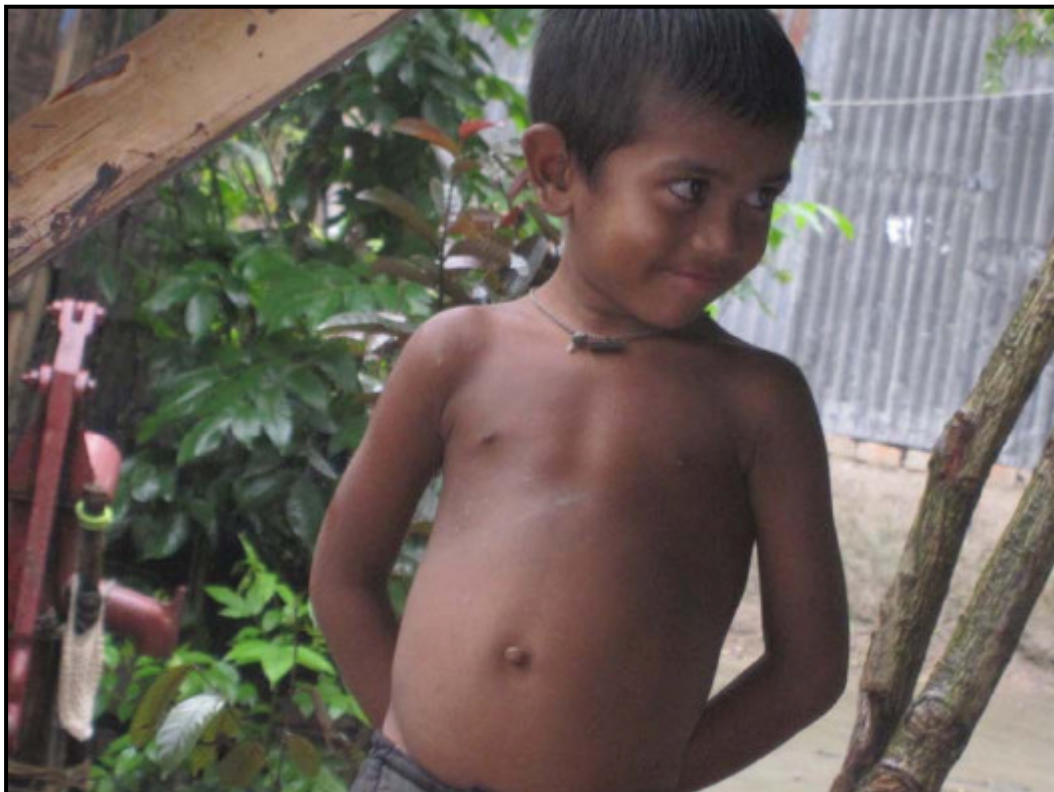
Churamankati village boy... looking for the opportunity....