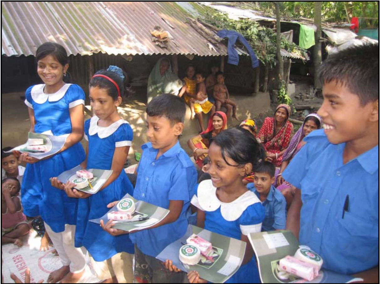
Lolitadaho Community students with the materials...