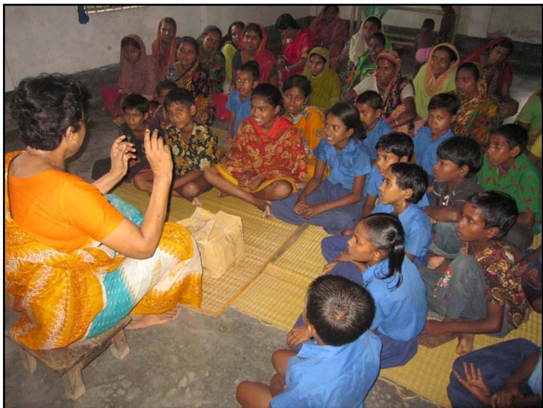
Mohishati Community Education Materials Distribution Programme...