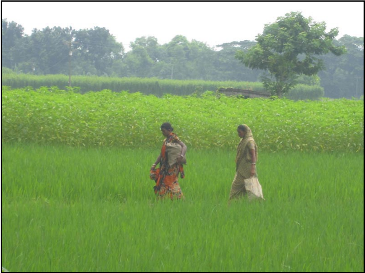
Village women...For the Work...