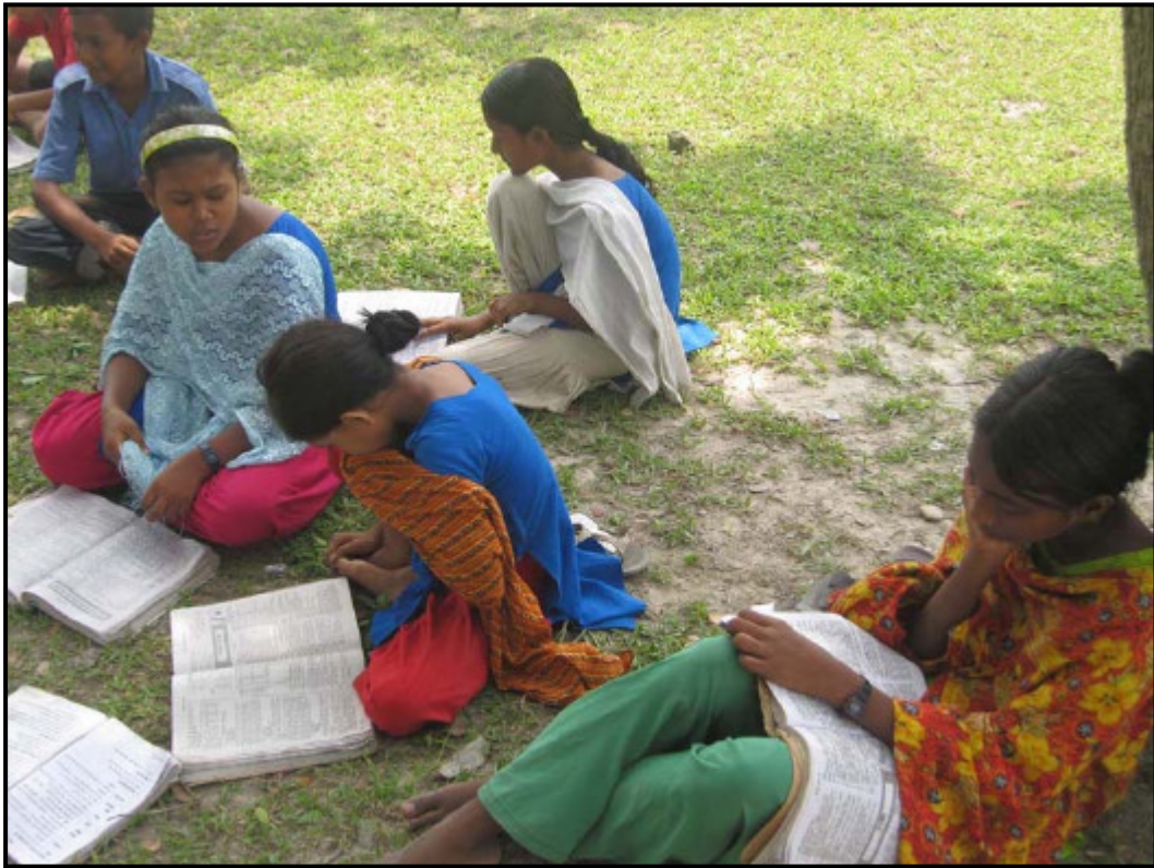
During the school leisure period, students preparing their class study...