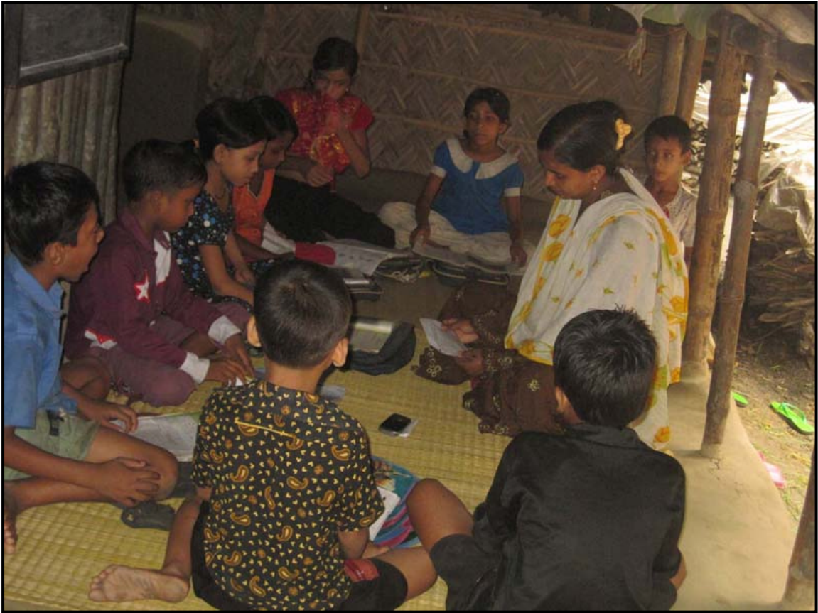
Tuition class at Lolitadaho...