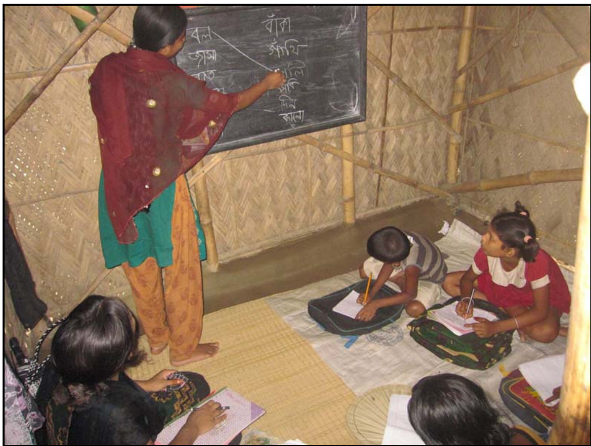
Tuition class at Churamankati...