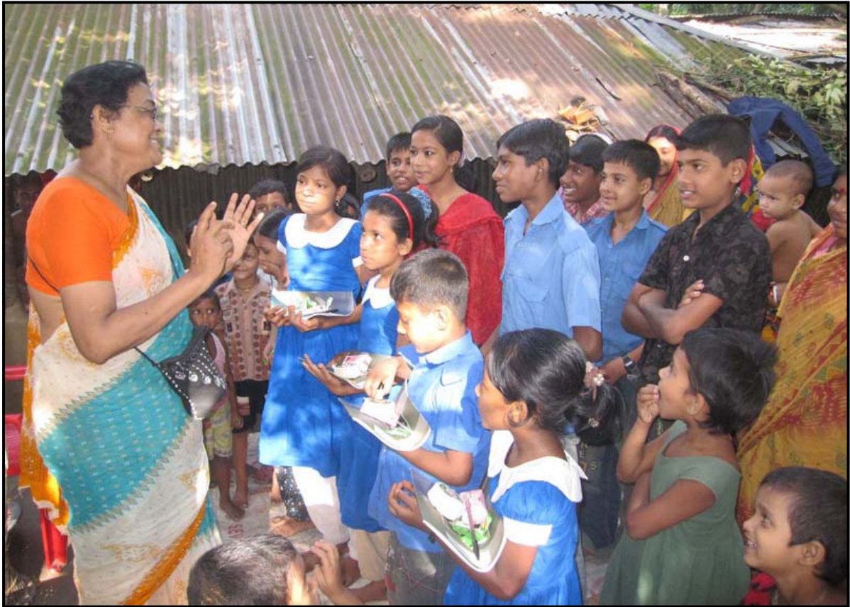
Lolitadaho Community Education Materials Distribution Programme...