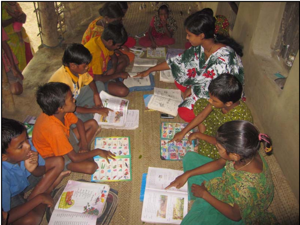
Tuition class at Sorupdaho...