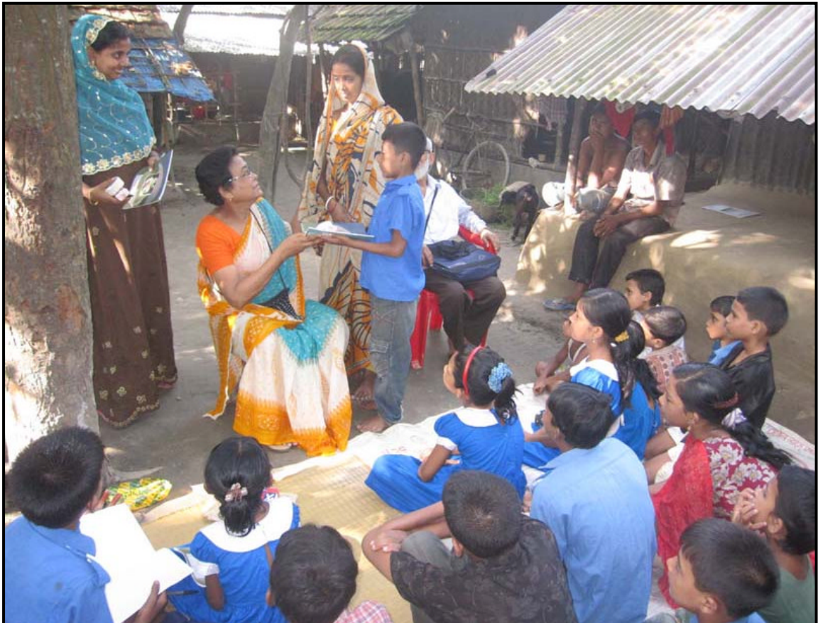
Lolitadaho Community student receiving materials...