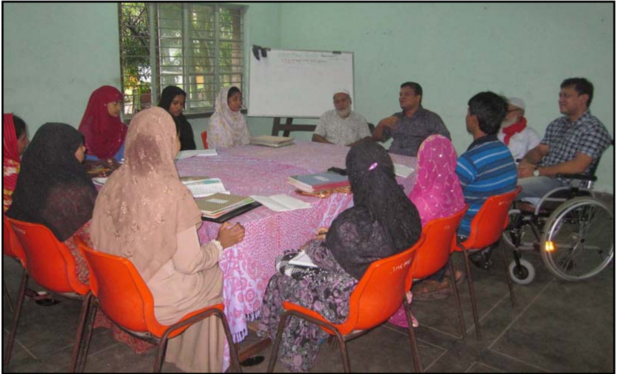
Tuition Teachers Orientation Training....