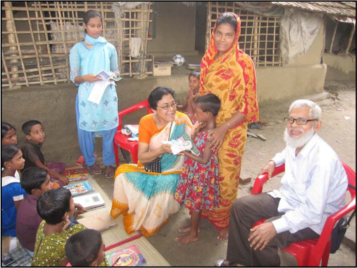
Sorupdaho Community student BS0129 Mim receiving materials...