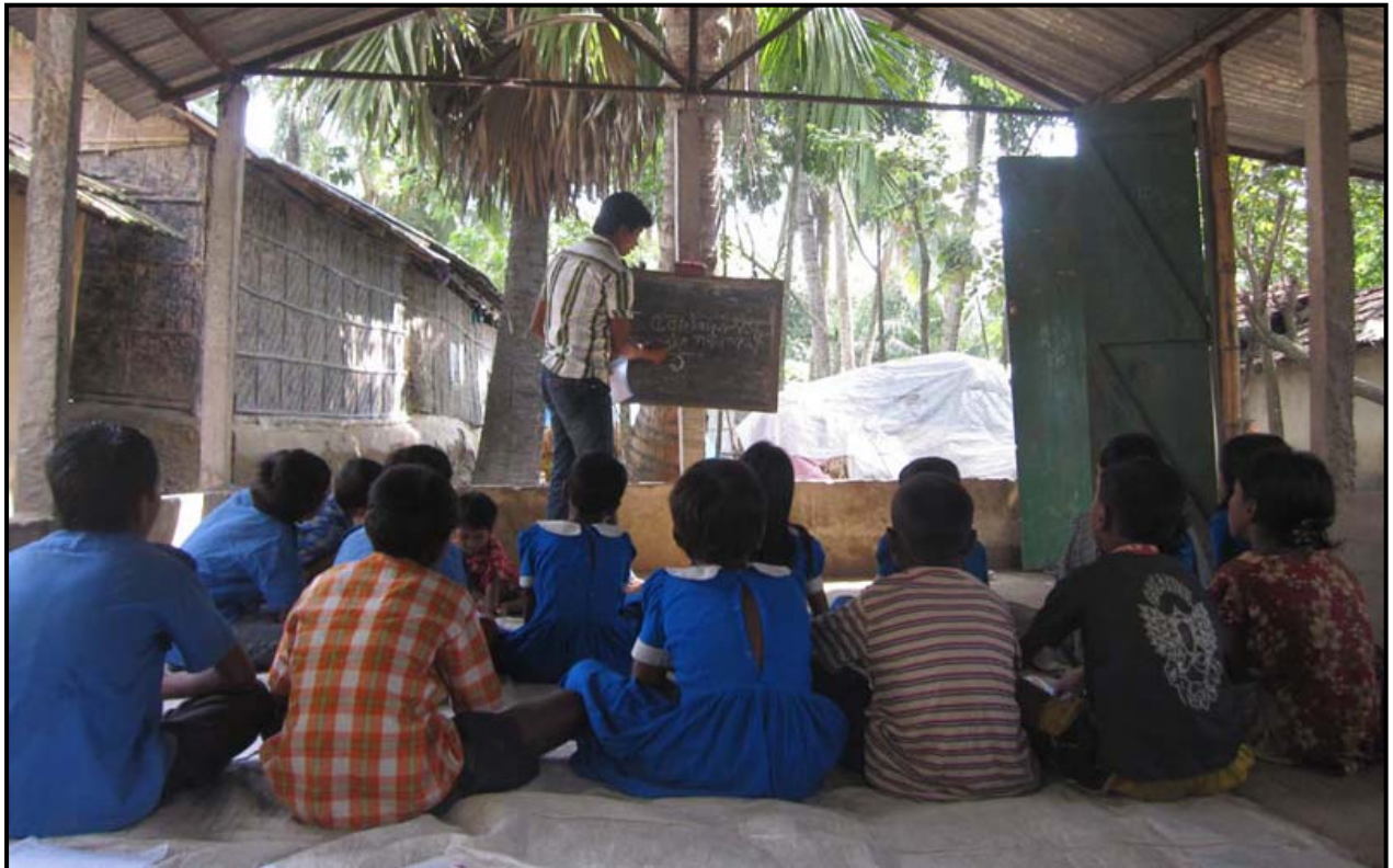
Community Motivator taking class at Jogahati Tuition Programme...