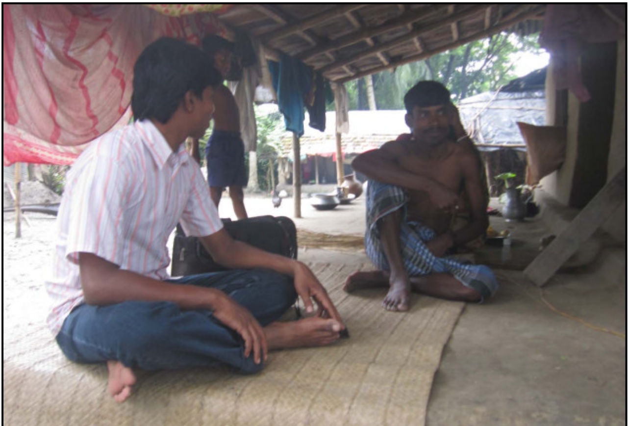
Community Motivator visiting adopted students house and discussion with parents...