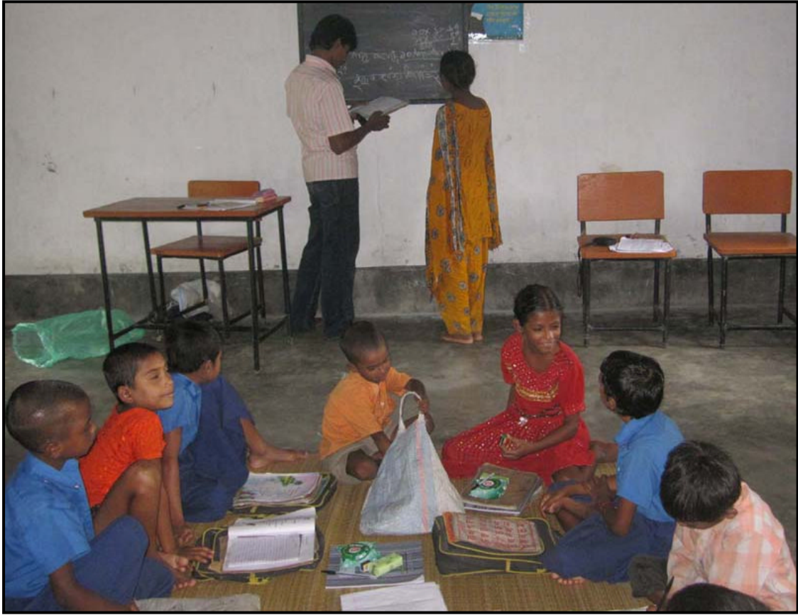
Community Motivator taking class at Mohishati Tuition Programme...