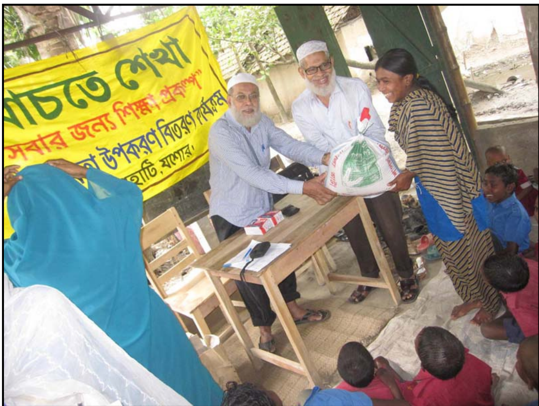
Jogahati Community student BS0002 Maloti receiving materials...