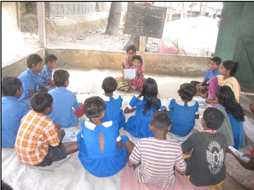
Tuition class at Jogahati...