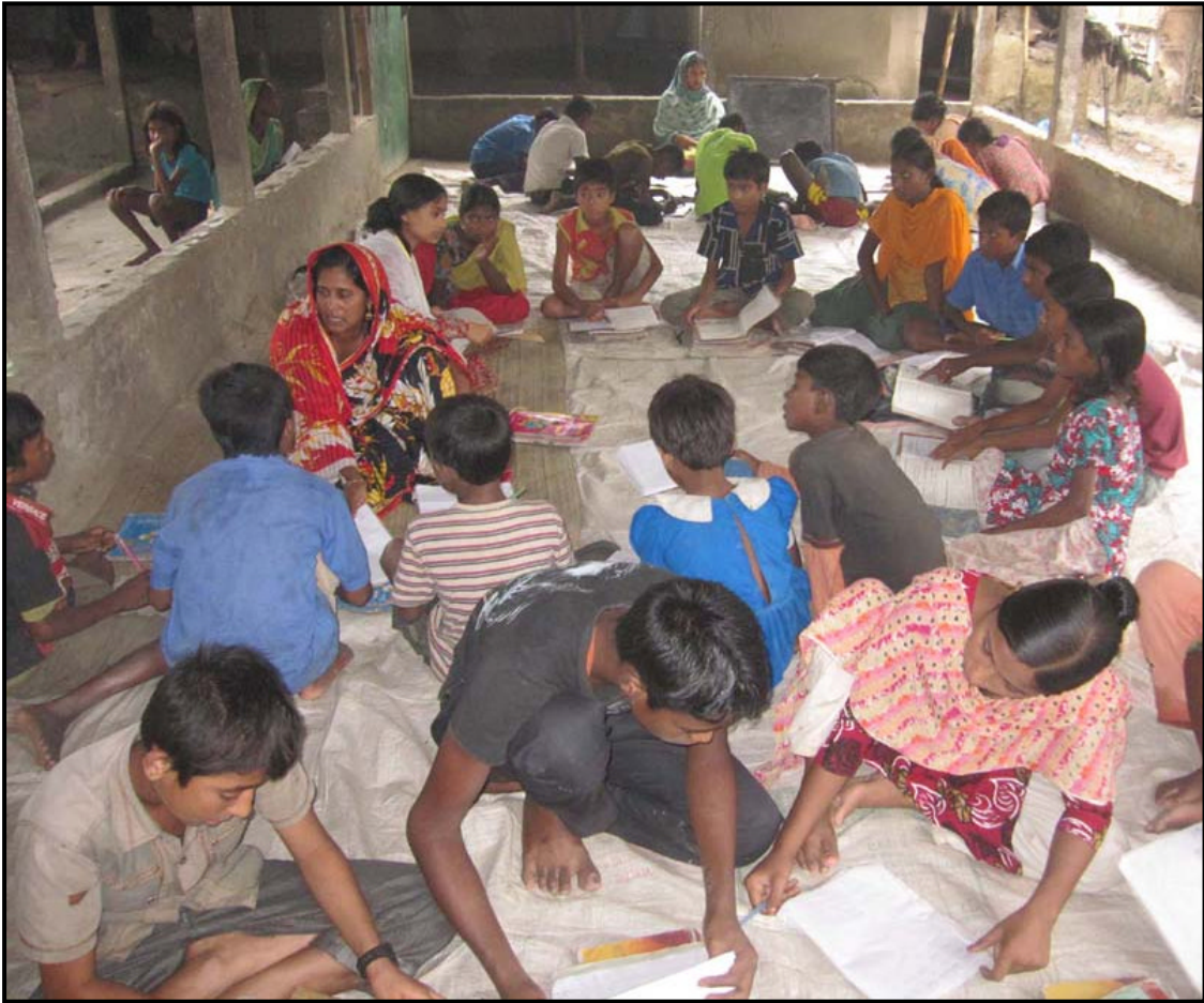
Tuition class at Jogahati...