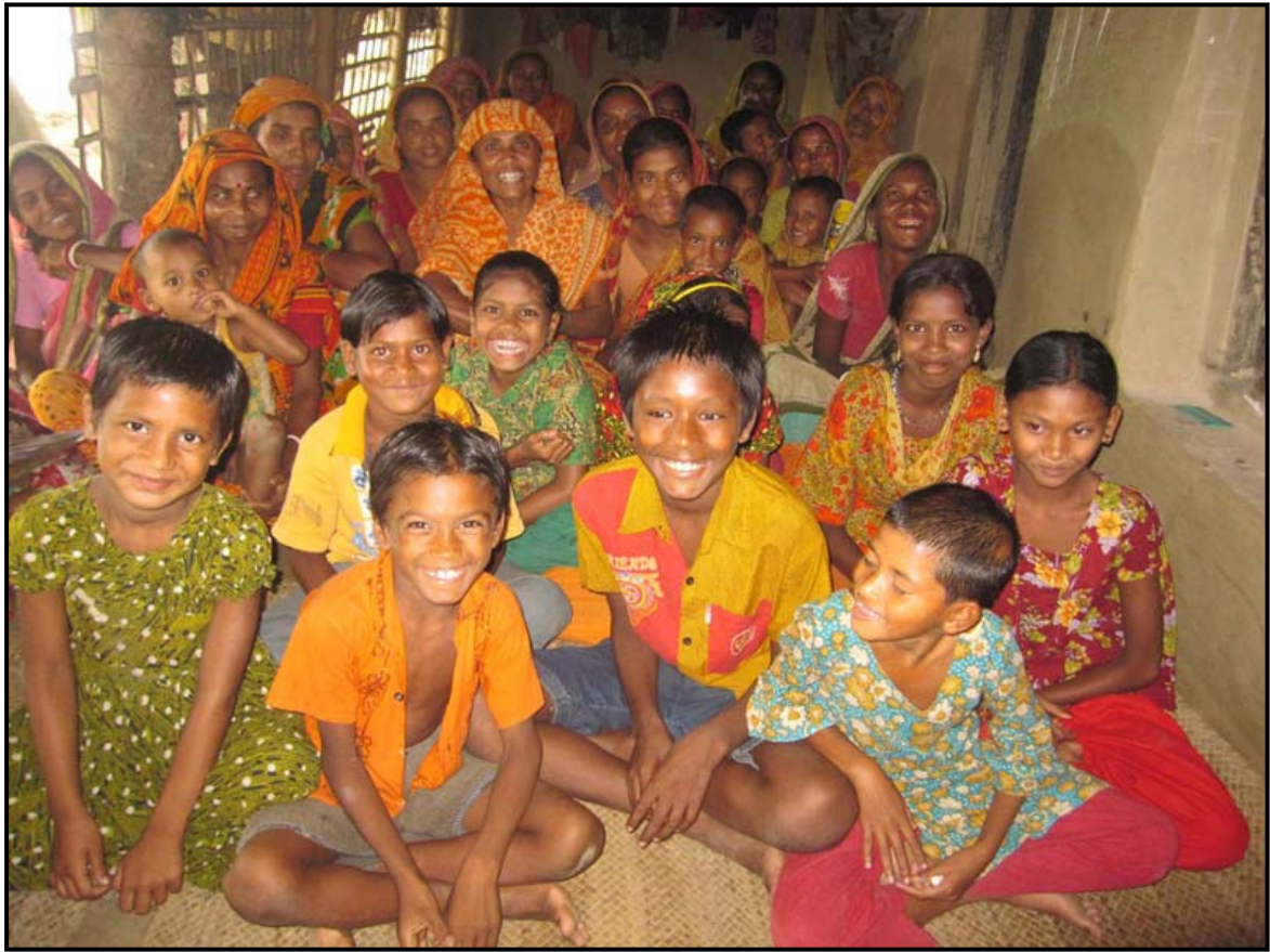
Sorupdaho Guardians Meeting...