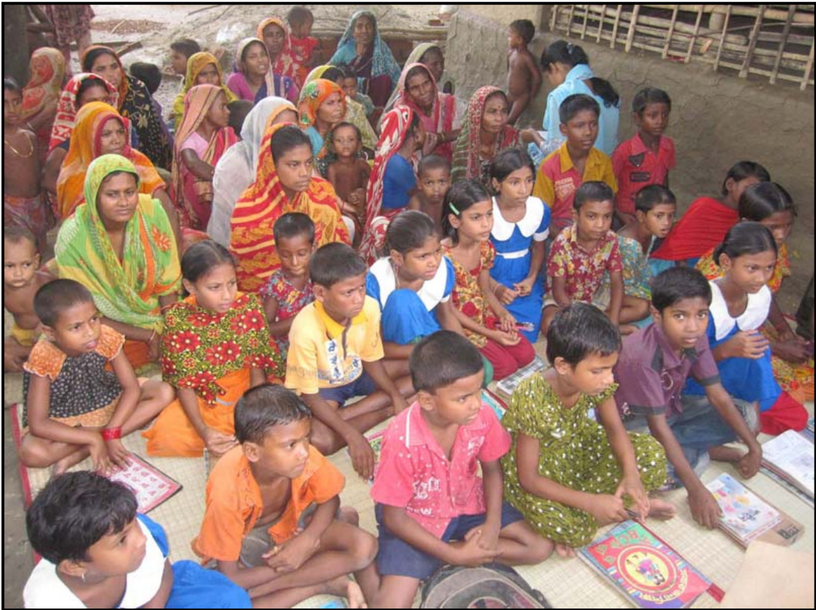
Sorupdaho Community Education Materials Distribution Programme...