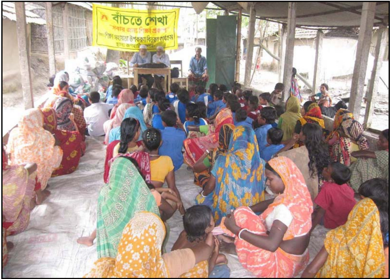
Jogahati Community Distribution Programme...