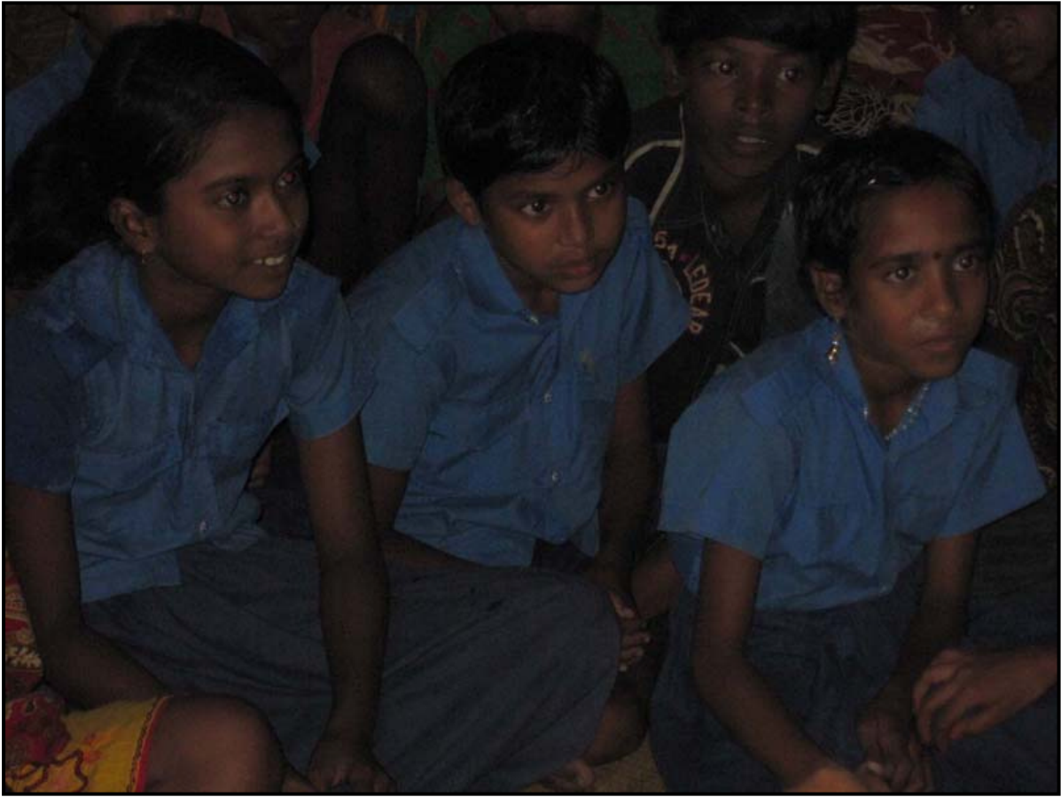
Mohishati Community Education Materials Distribution Programme...