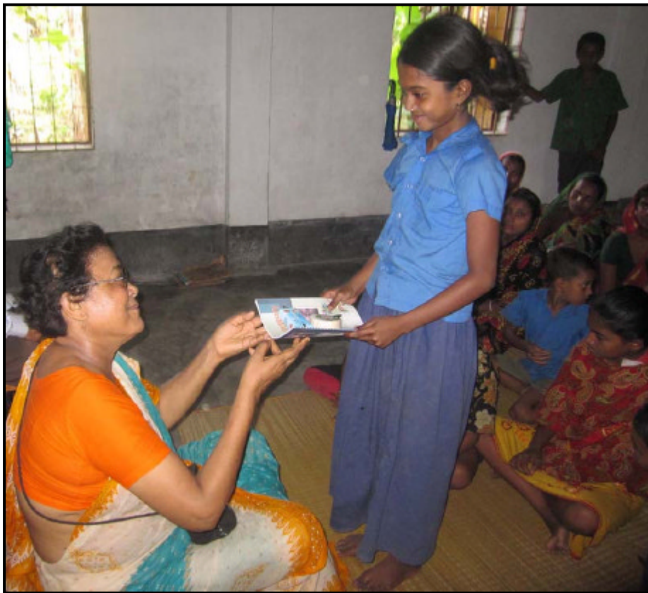
Mohishati Community Education Materials Distribution Programme...