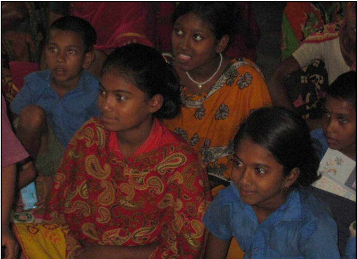
The pretty eyes at Mohishati Materials Distribution Programme...