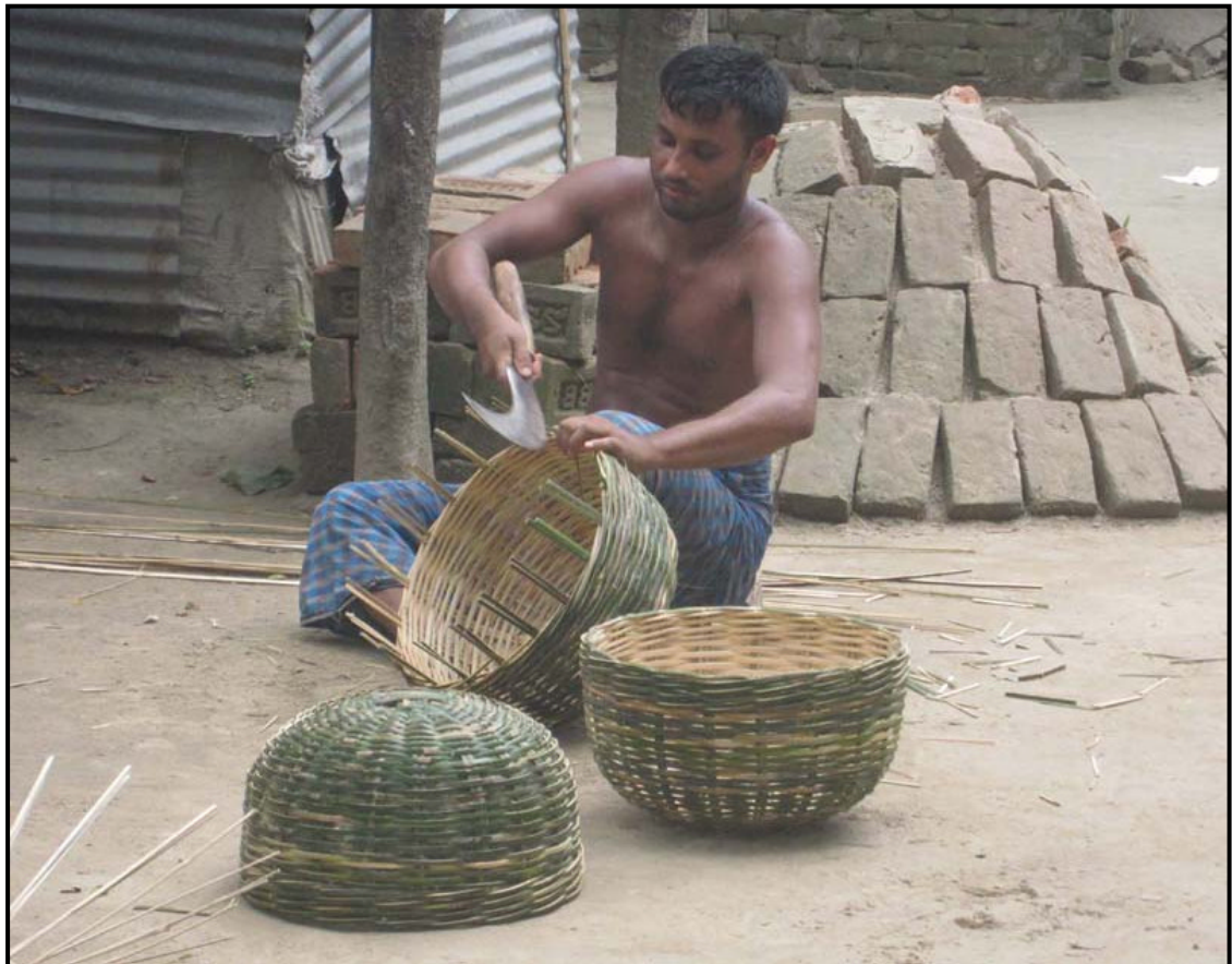
Lolitadaho villager preparing bamboo baskets for local market...