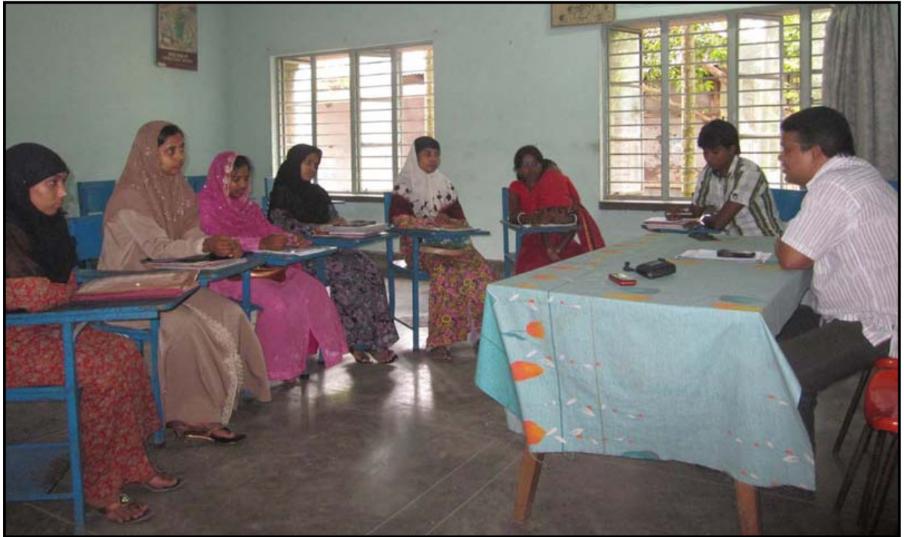
Tuition Teachers Monthly Coordination Meeting...