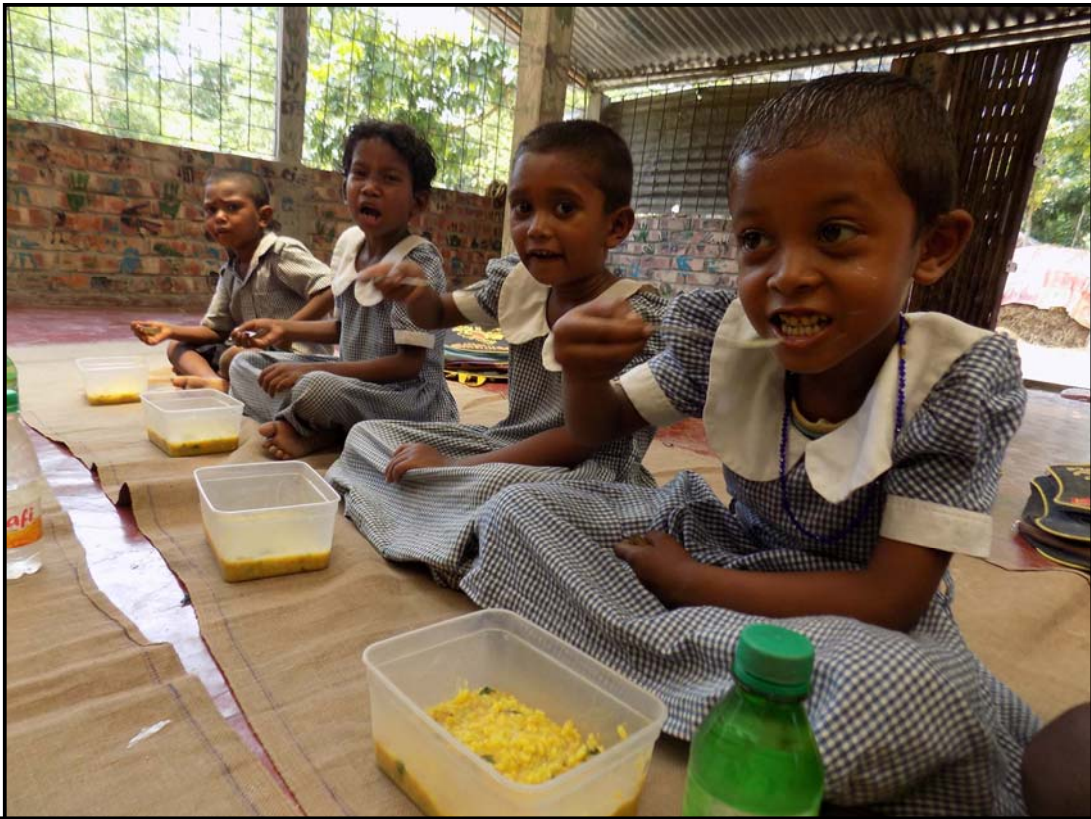
Pre-school students enjoying the meal...