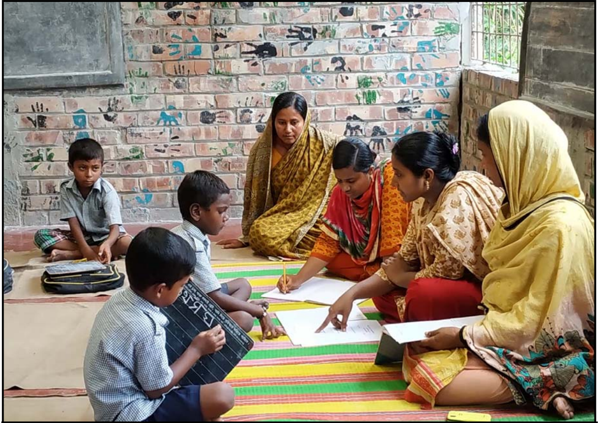
Pre-school student first terminal exam was held in May...