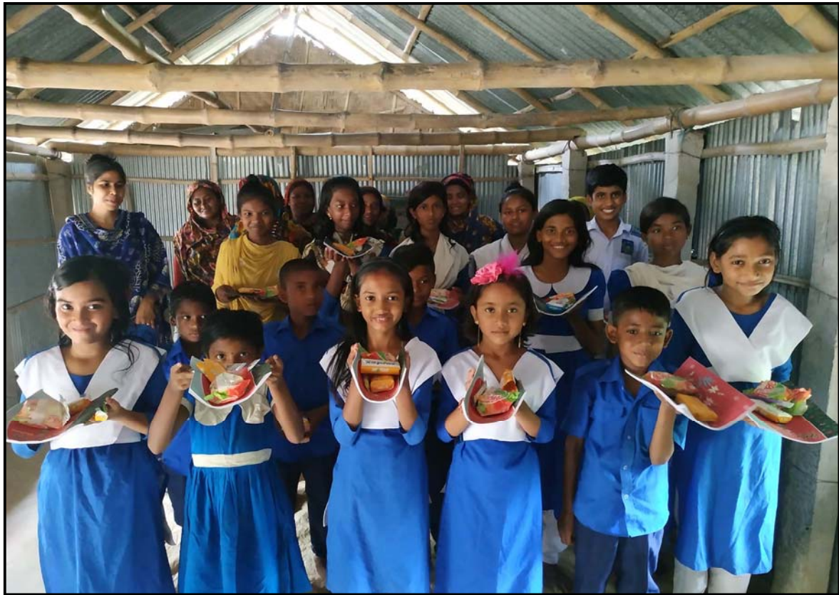
Happy student in Sorupdaho village....