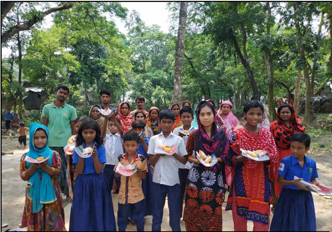
Happy student with materials at Mohishati village...