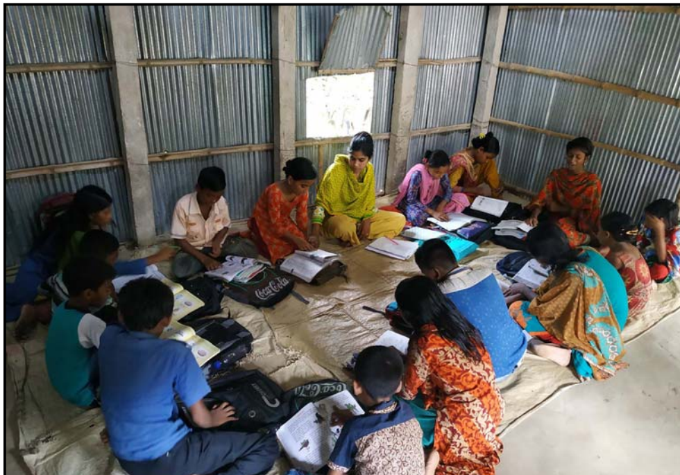
Tuition class going on in Sorupdaho village...