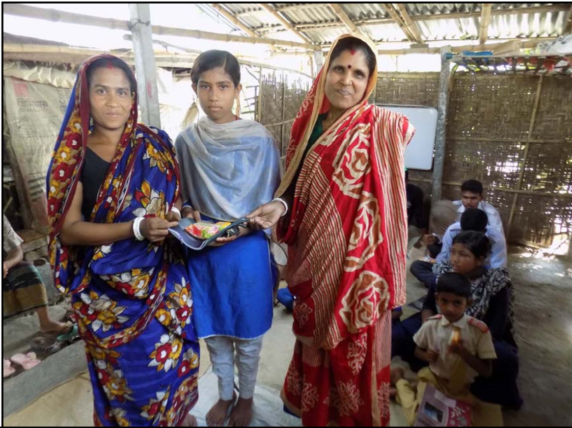
Education materials distribution in Churamankati...