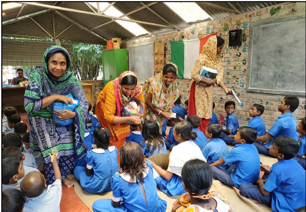
Materials distribution at Jogahati village...