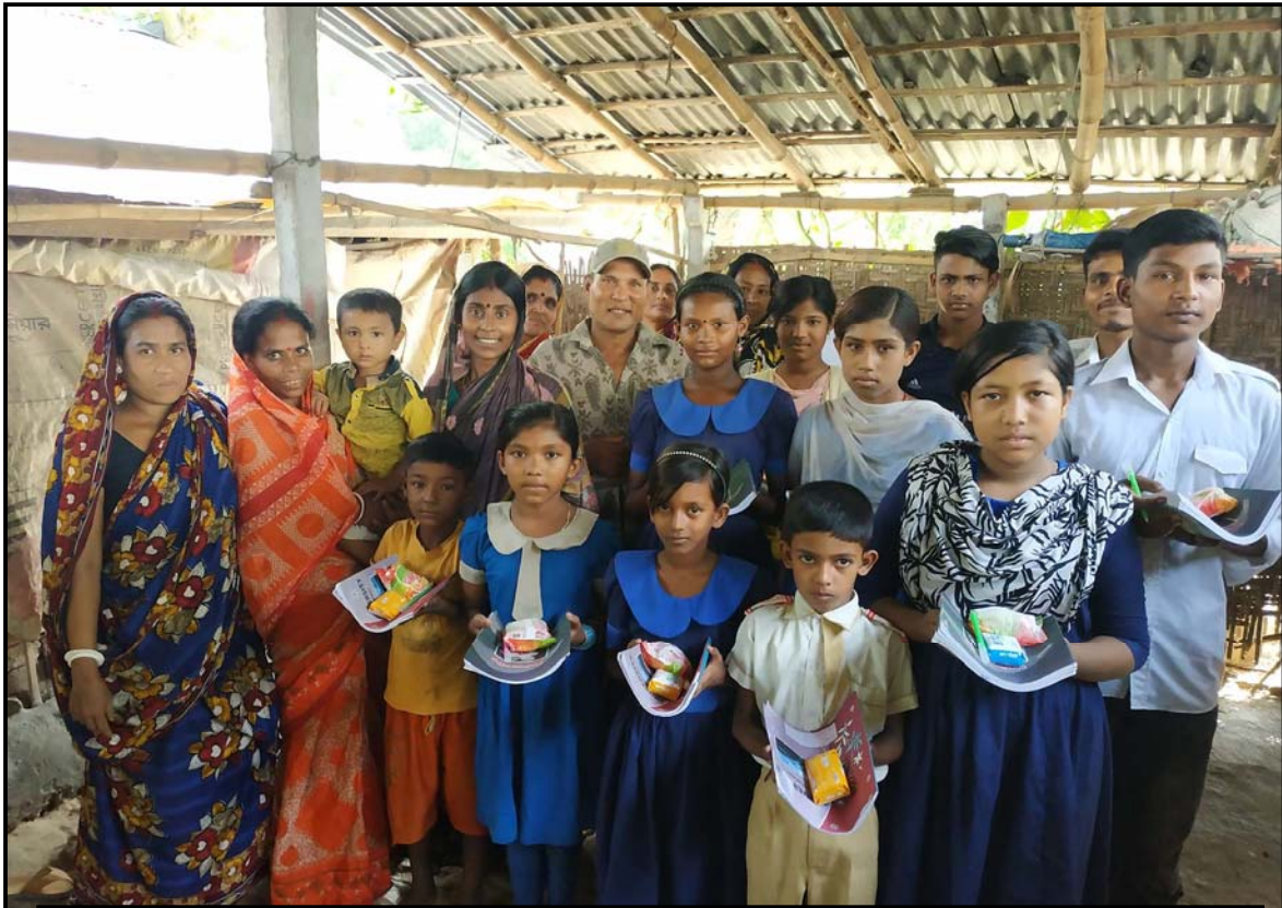
Churamankati village student with the materials...