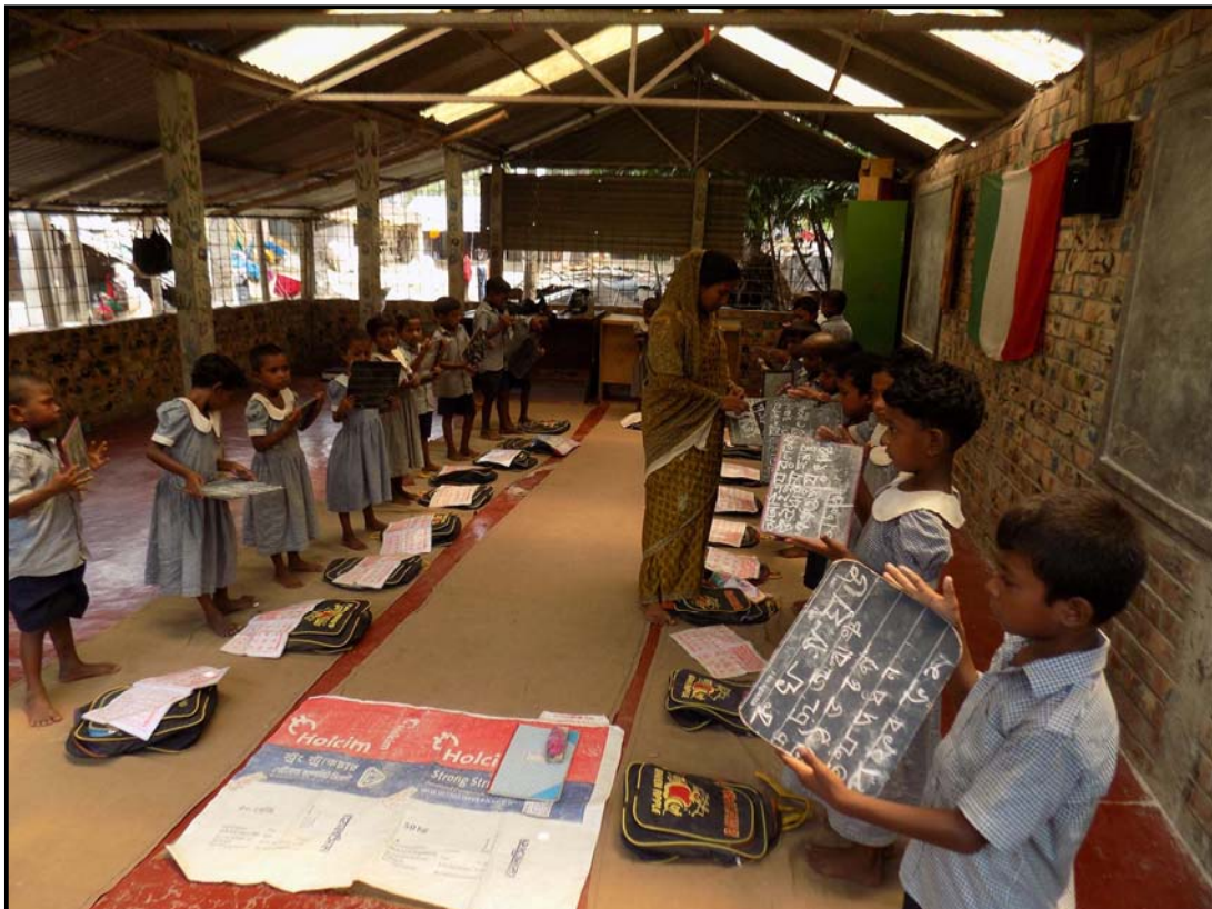
Pre-school class at Jogahati village...