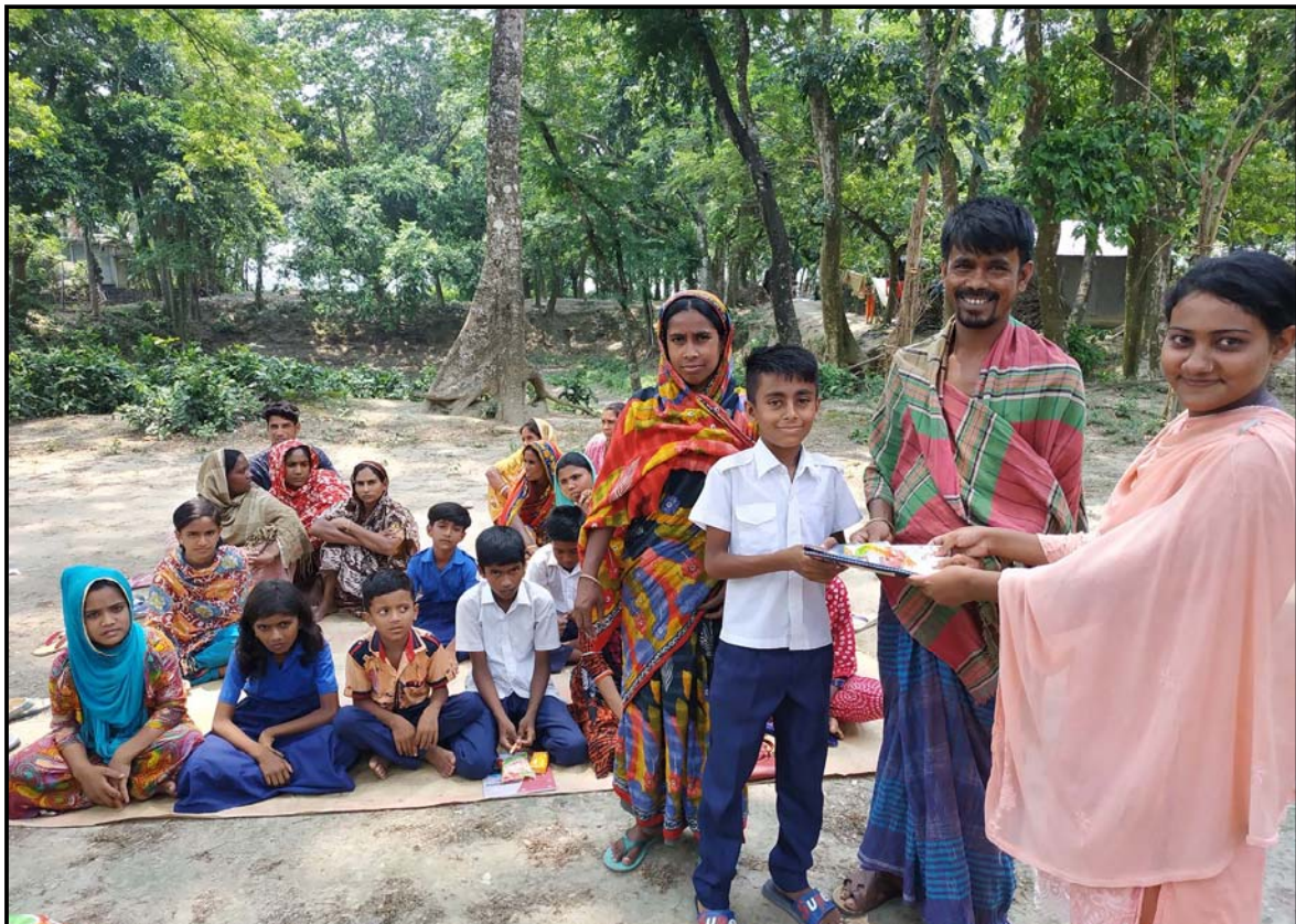
Education materials distribution at Mohishati village...