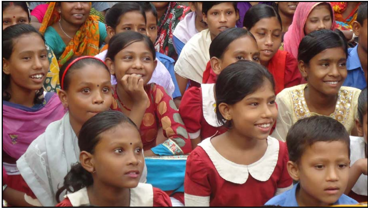
Students Enjoying the Motivation Speech...