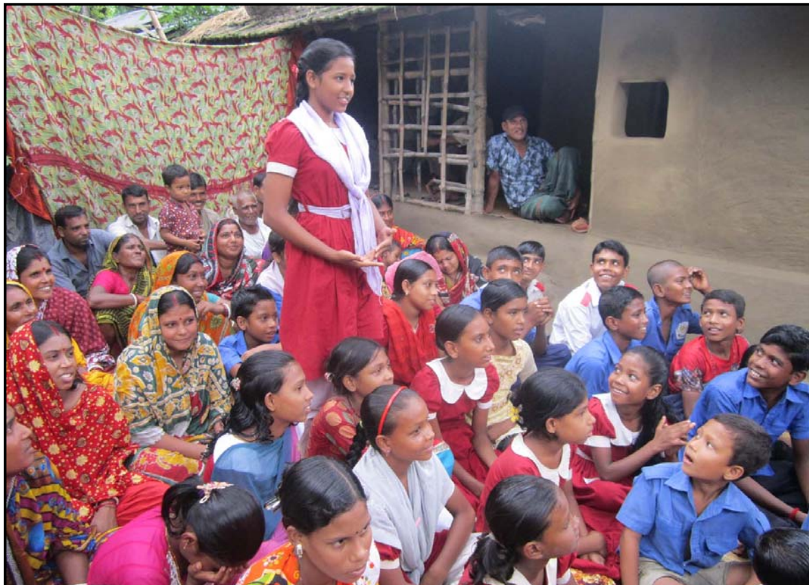
Student Sharing the Dream...