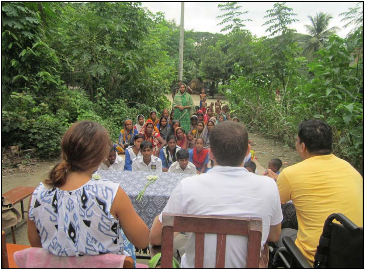
Community Meeting at Mohishati...