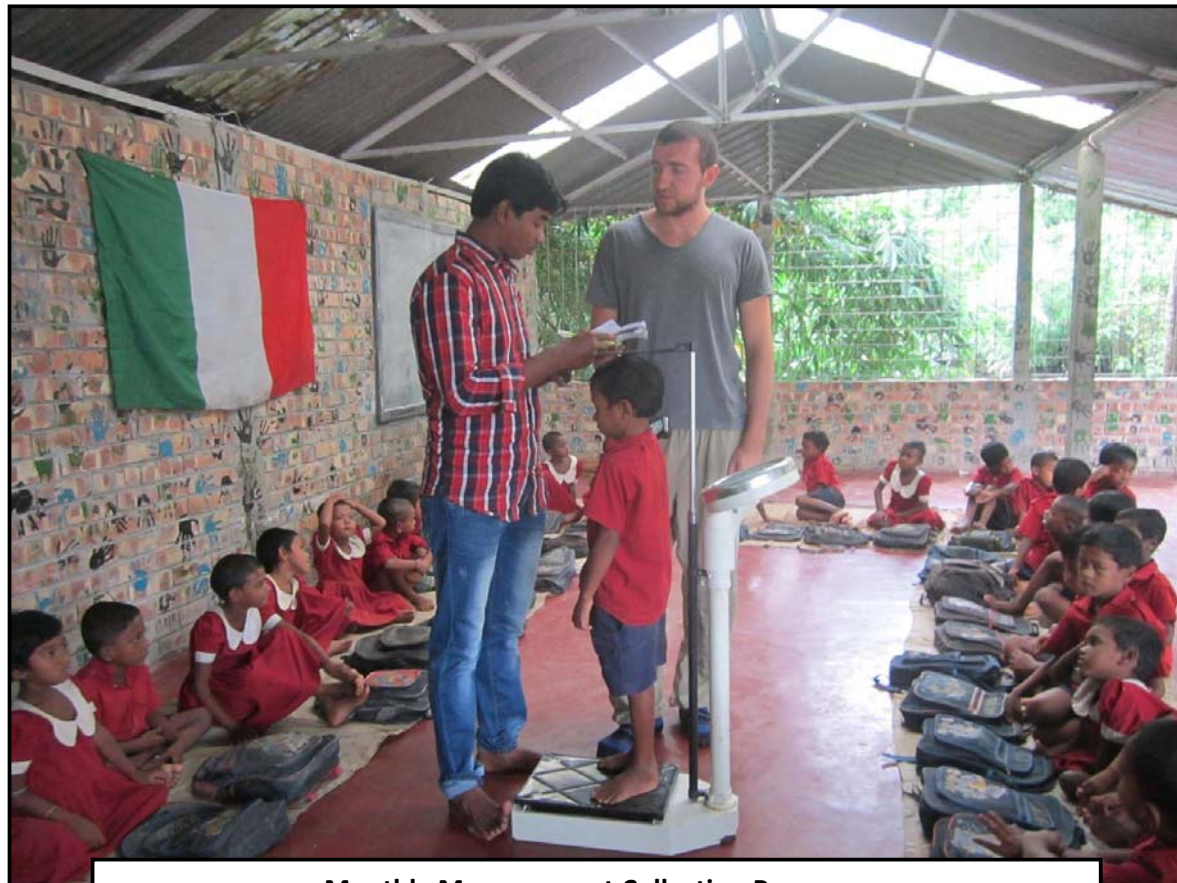
Monthly Measurement Collection Process...