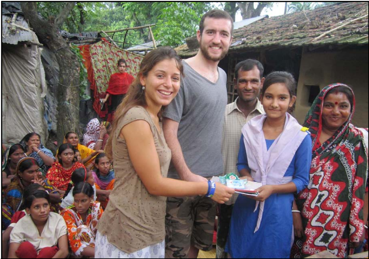
Materials Distribution at Churamankati Community...