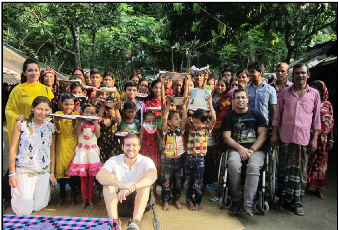
Students and Friends...