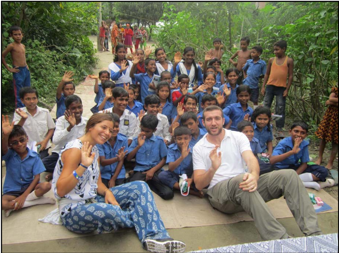
Students and Friends...