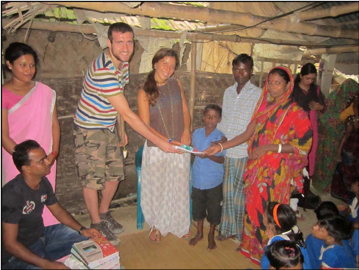
Materials Distribution at Sorupdaho...