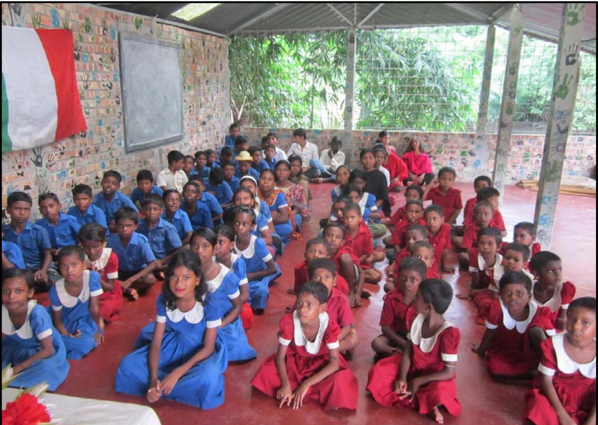
Jogahati Students Now Disciplined and Organised...