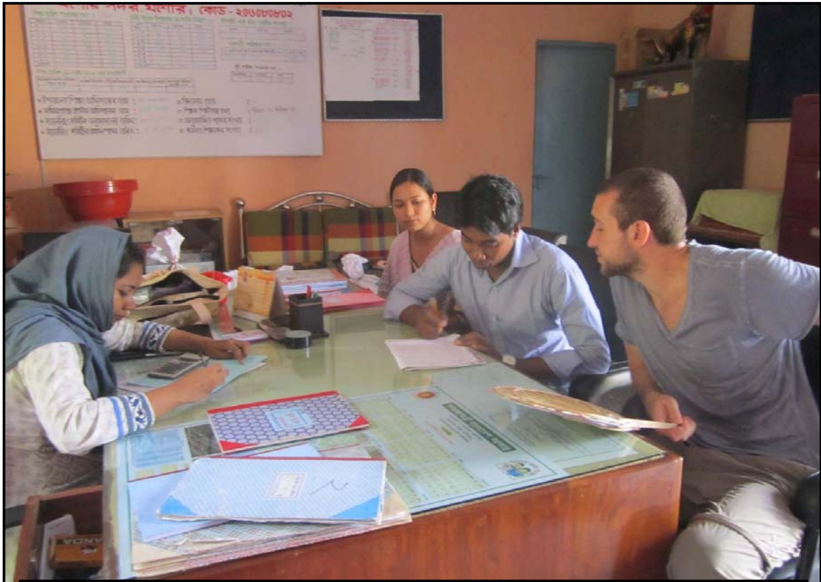
Teacher and Community Motivator Show the Attendance Collection Process...