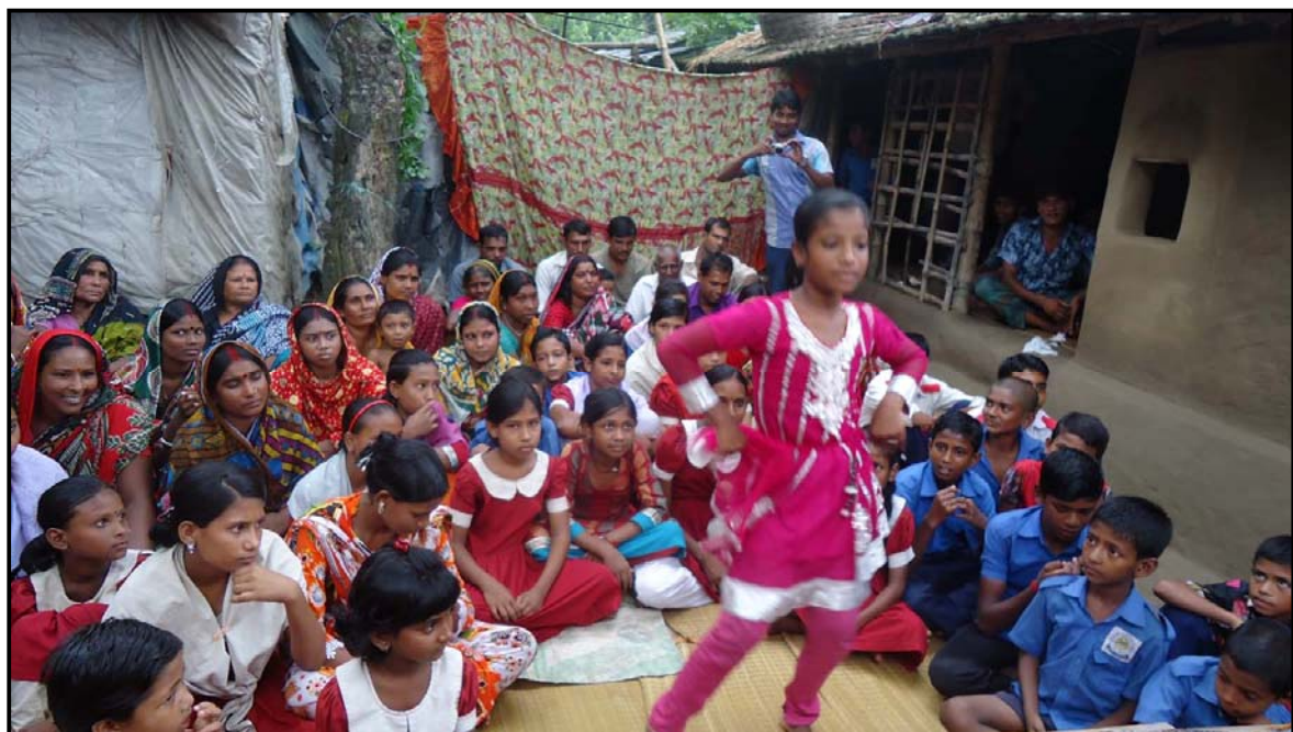
Churamankati Students Showing Her Dancing Talent...