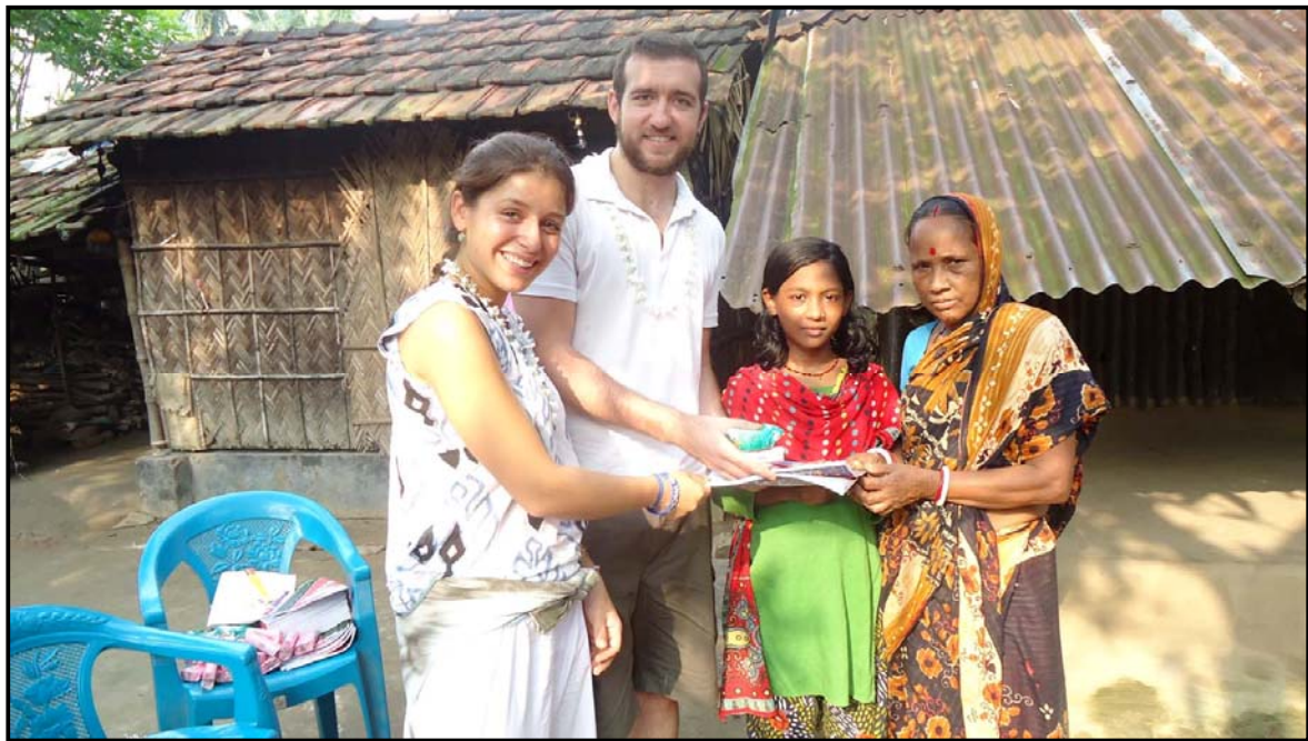
Materials Distribution at Lolitadaho Community...