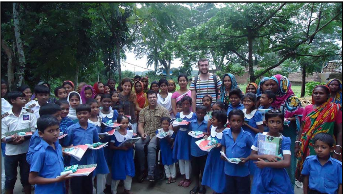
We all together...