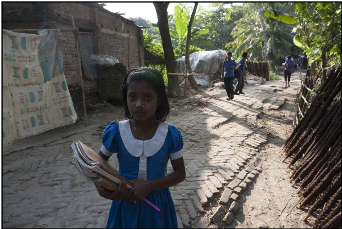
Moving to school on Jogahati Road...