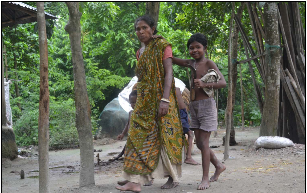
The walk of progress...