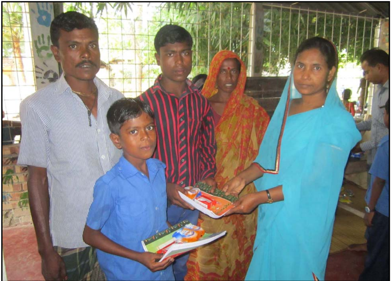
Monthly Distribution Programme: Jogahati student receiving materials...