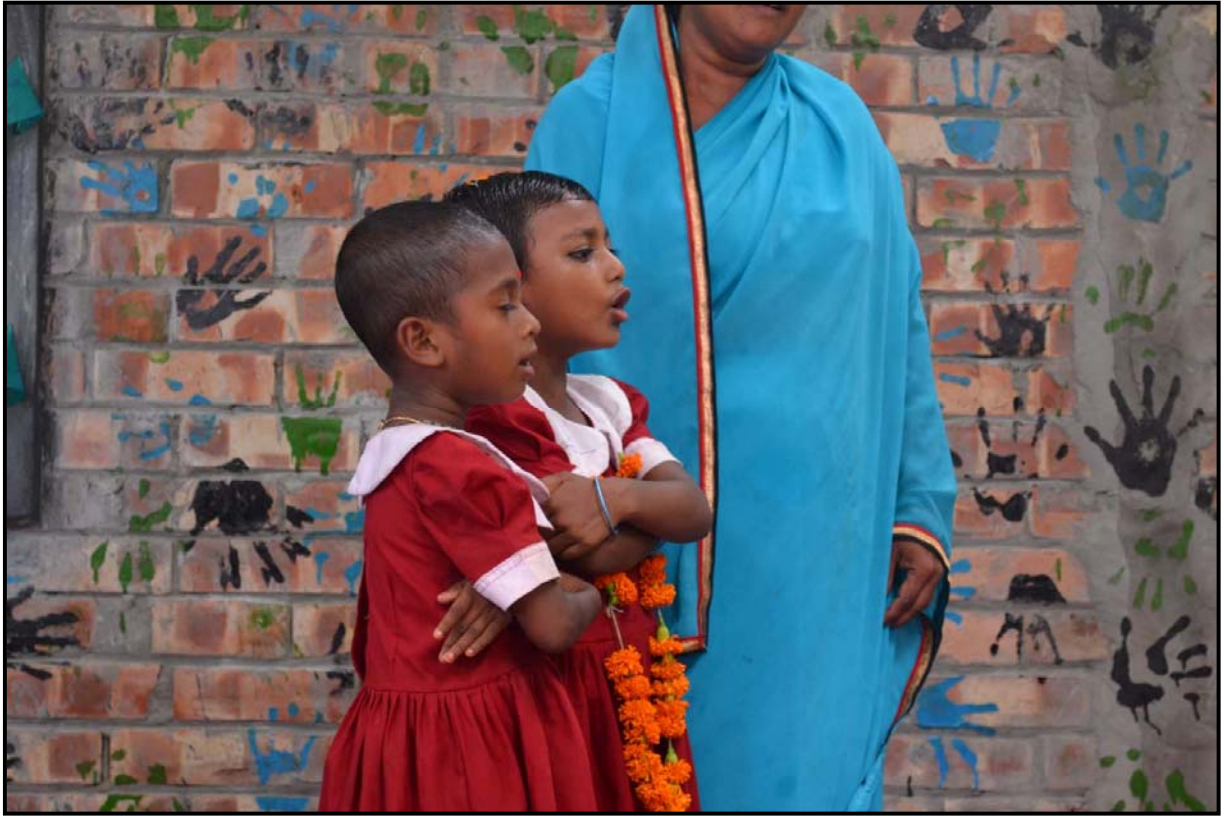
Pre-school student singing with heart...