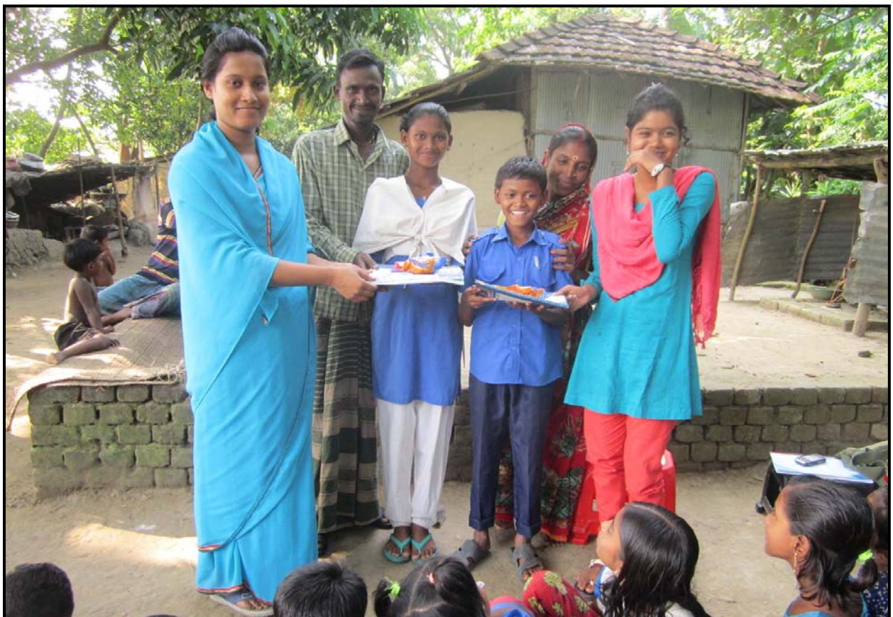
Monthly Distribution Programme: Sorupdaho students receiving materials...