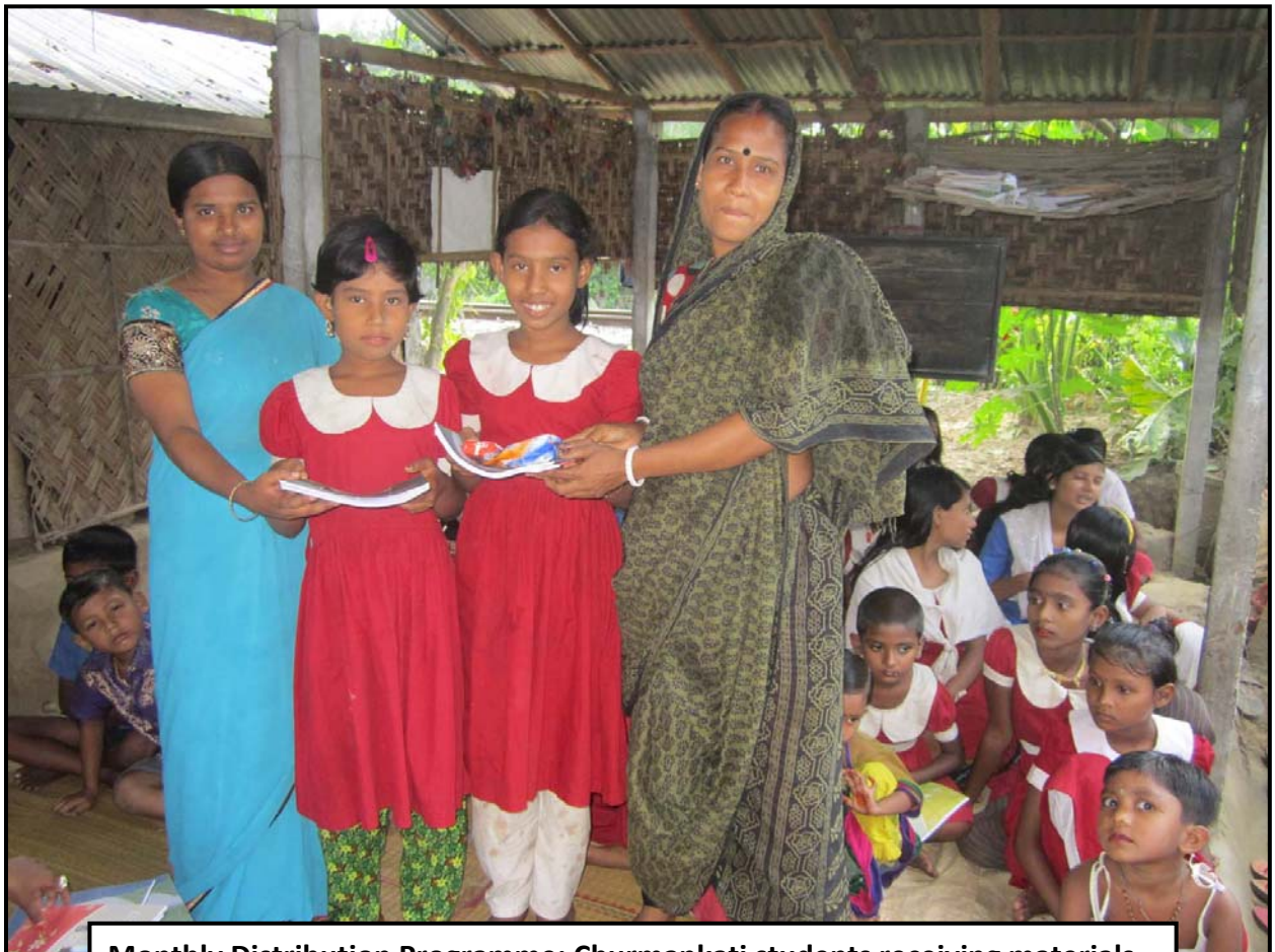
Monthly Distribution Programme: Churmankati students receiving materials...