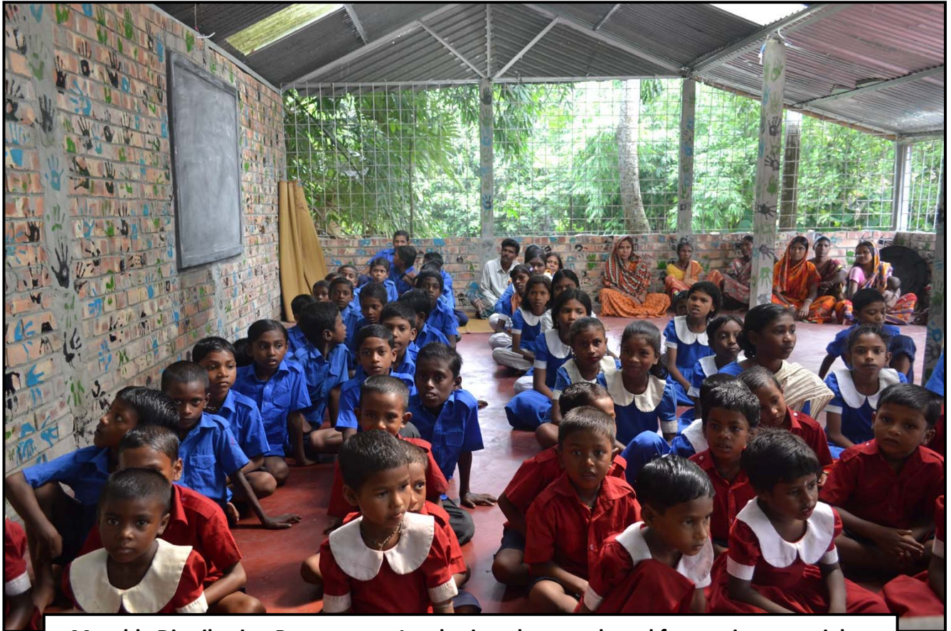
Monthly Distribution Programme: Jogahati students gathered for receive materials...