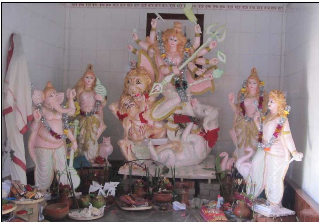
During October celebrated Durga Puja...Hindu community prime festival...