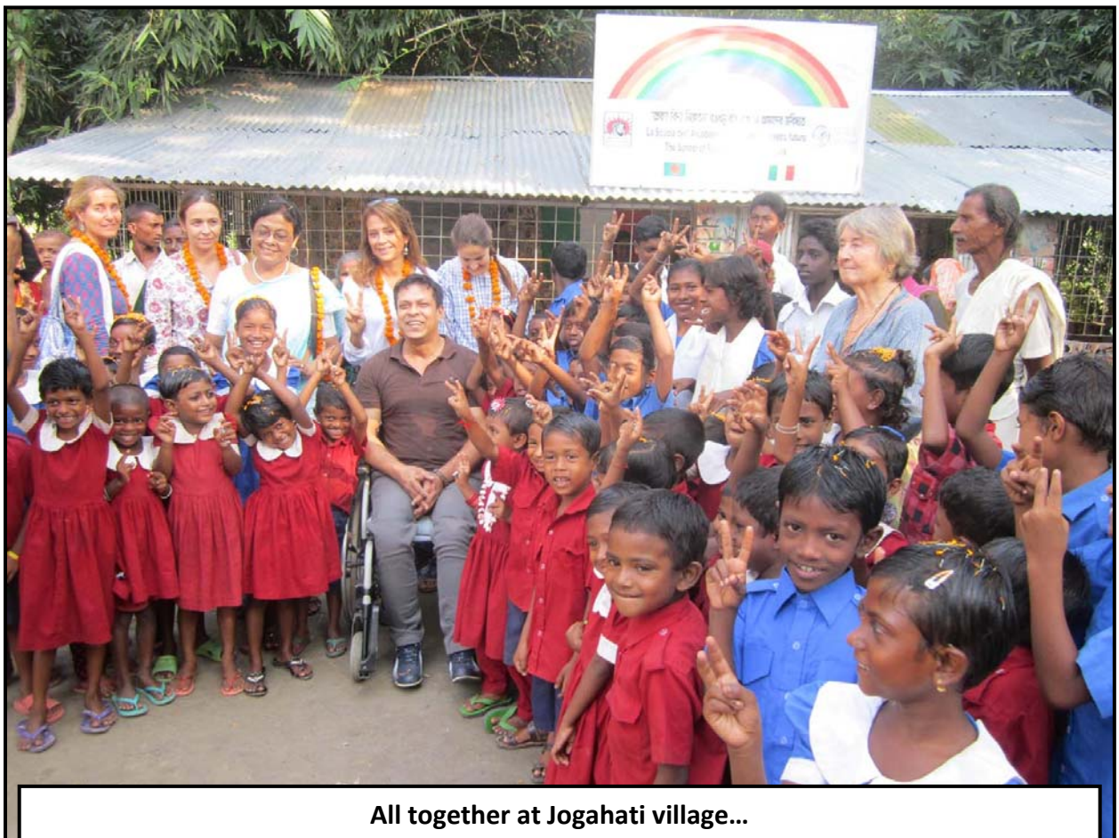
All together at Jogahati village...