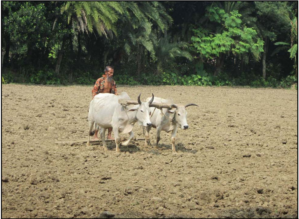
The traditional cultivation method in agriculture field...