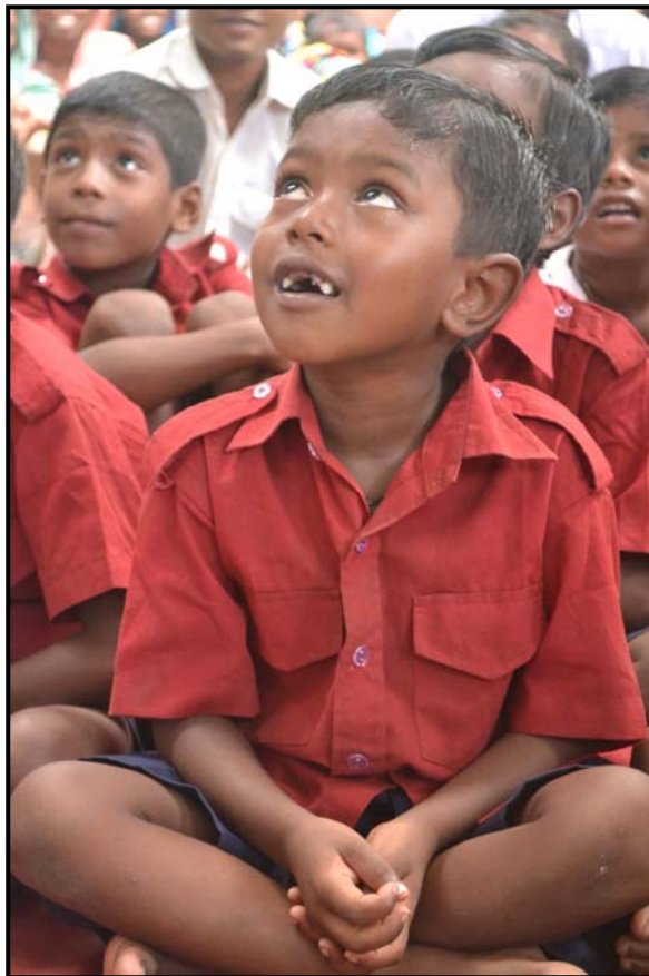
Pre School student also attentive audience...