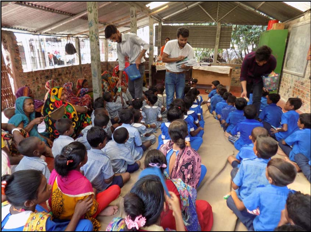
Distribution of materials at Jogahati Village...