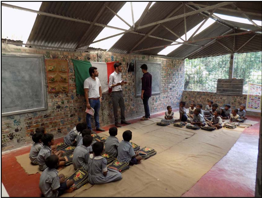
Students from Panjab University India, taking class...