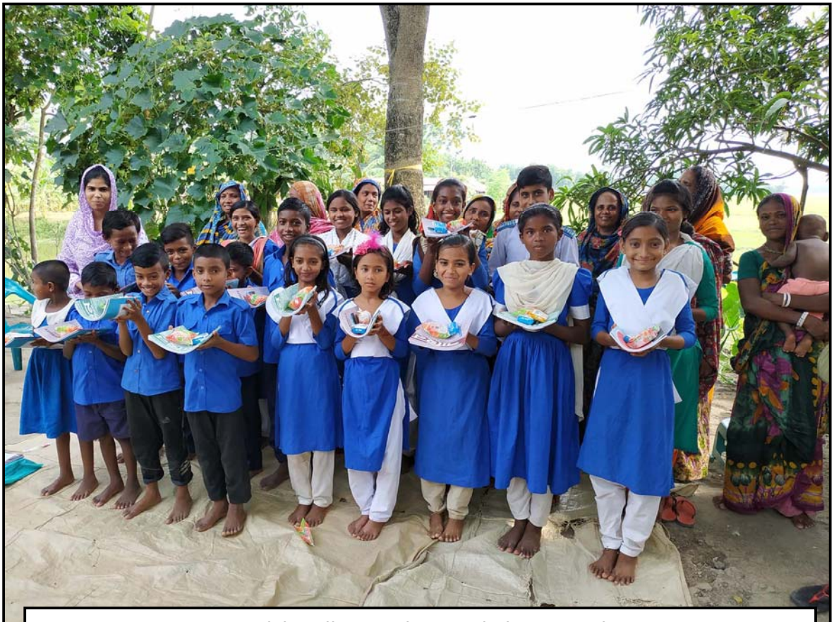
Sorupdaho village students with the materials...