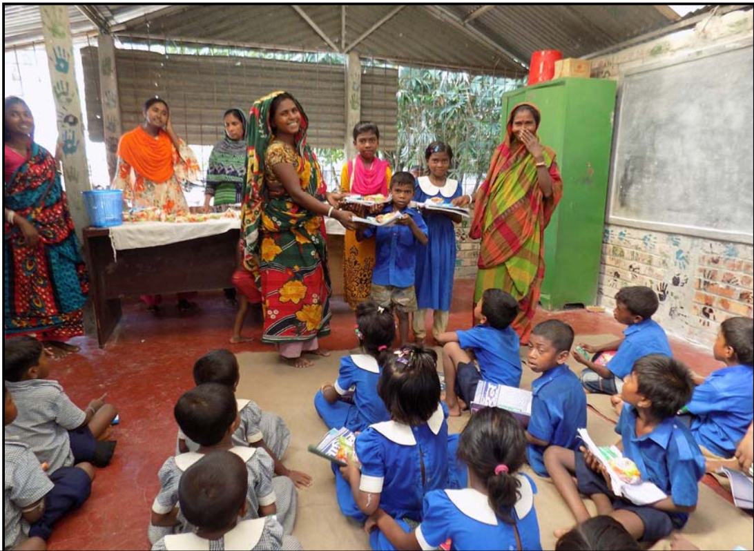
Materials distribution at Jogahati...