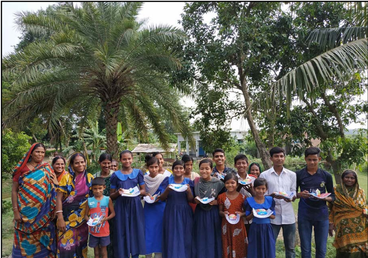
Happy students with the materials at Churamankati village...