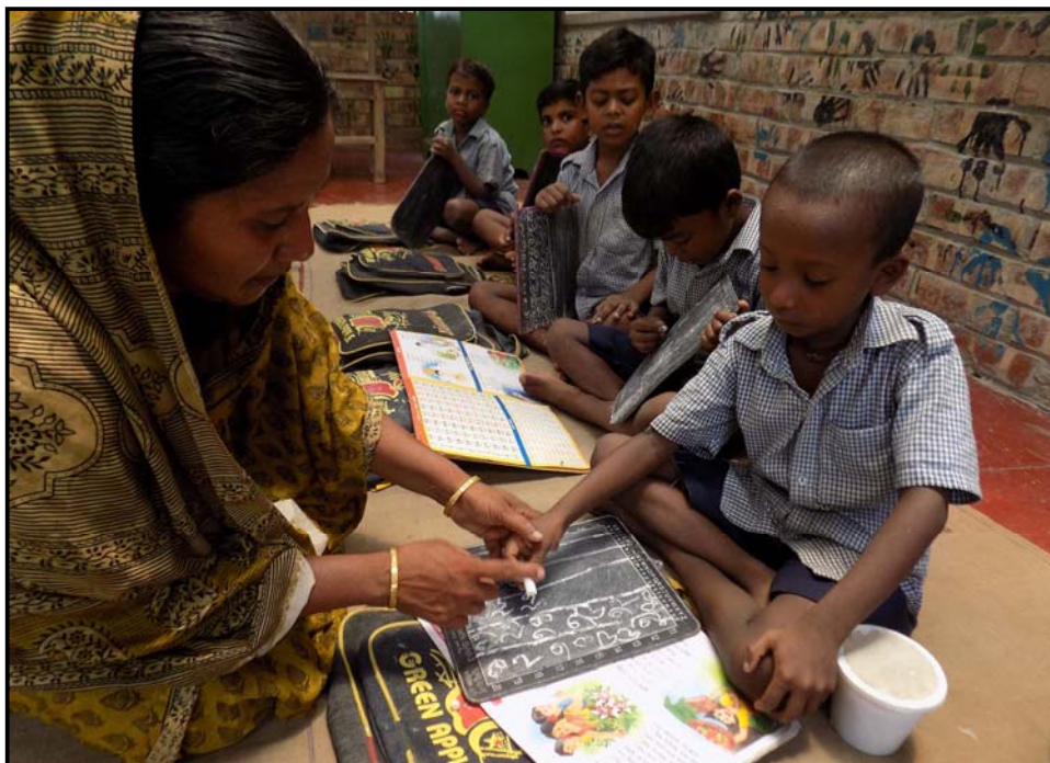
Pre-school class in progress...