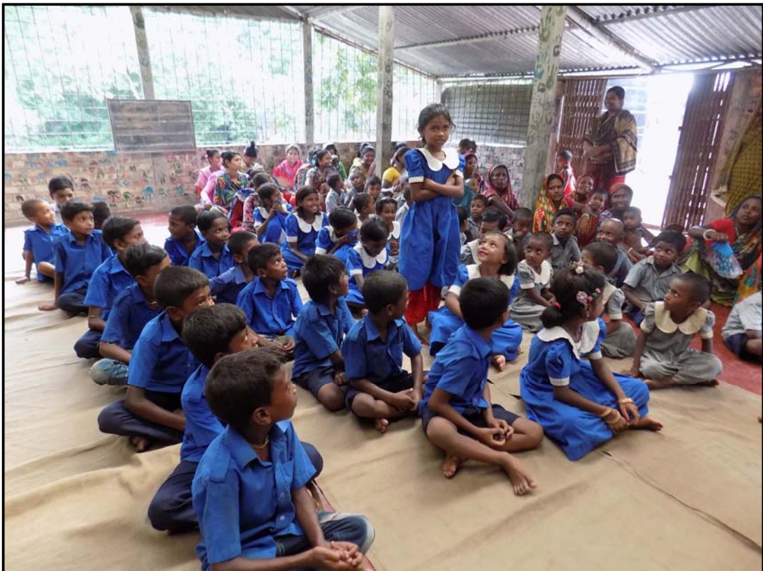
Monthly Parents Meeting at Jogahati Village...