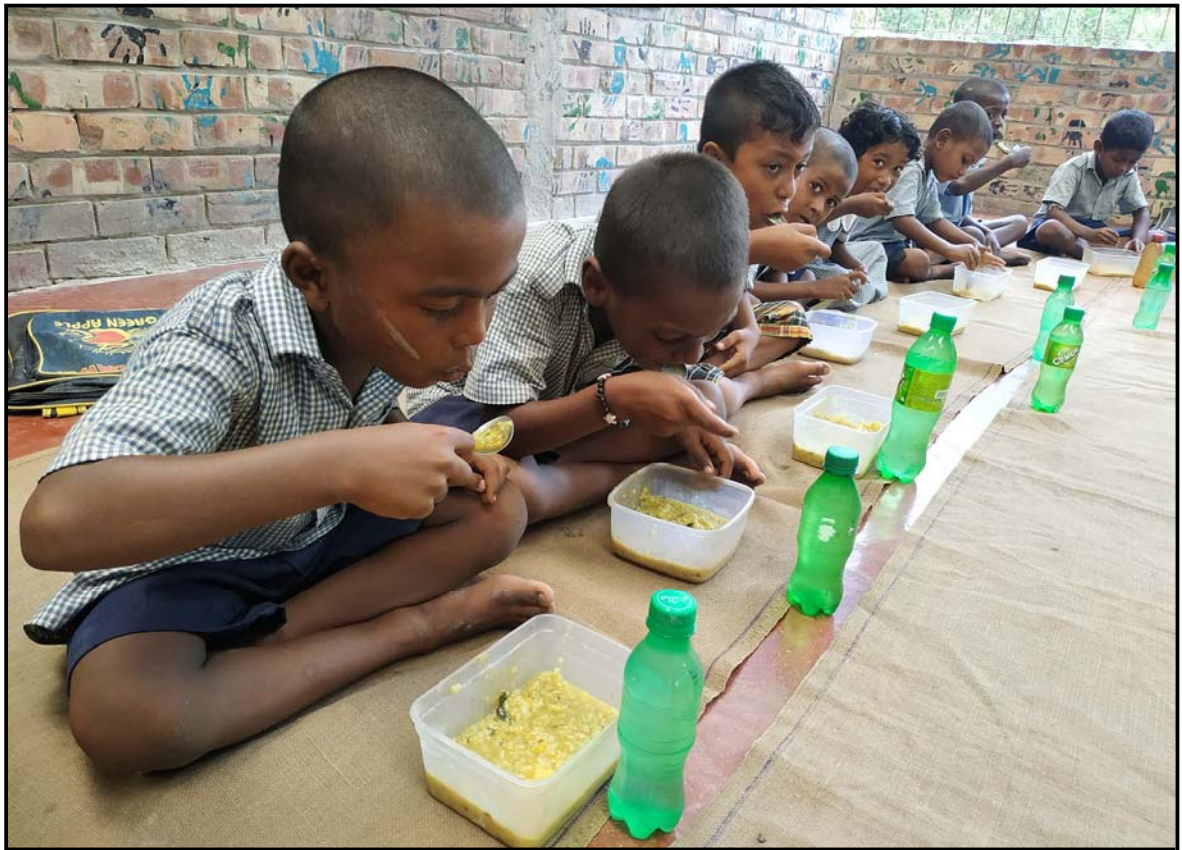
Pre-school students enjoying food after class....