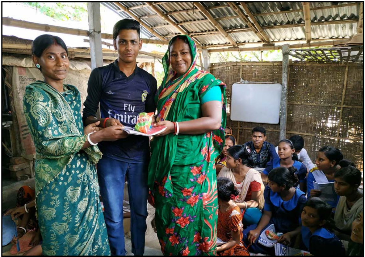
Materials distribution at Churamankati village....