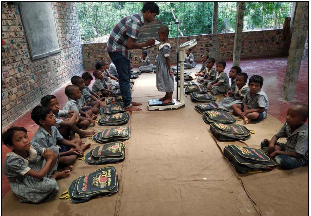
Monthly weight and heart check-up going on in pre-school...