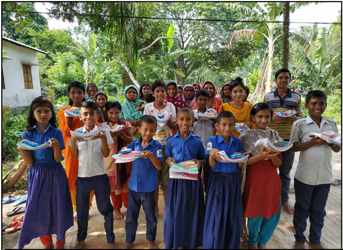
Happy student with the materials at Mohishati village....