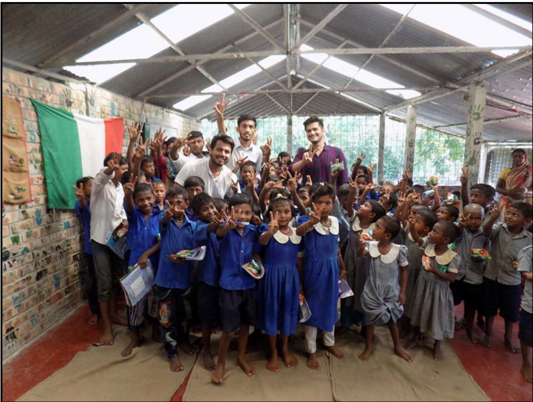
Happy students with the materials...