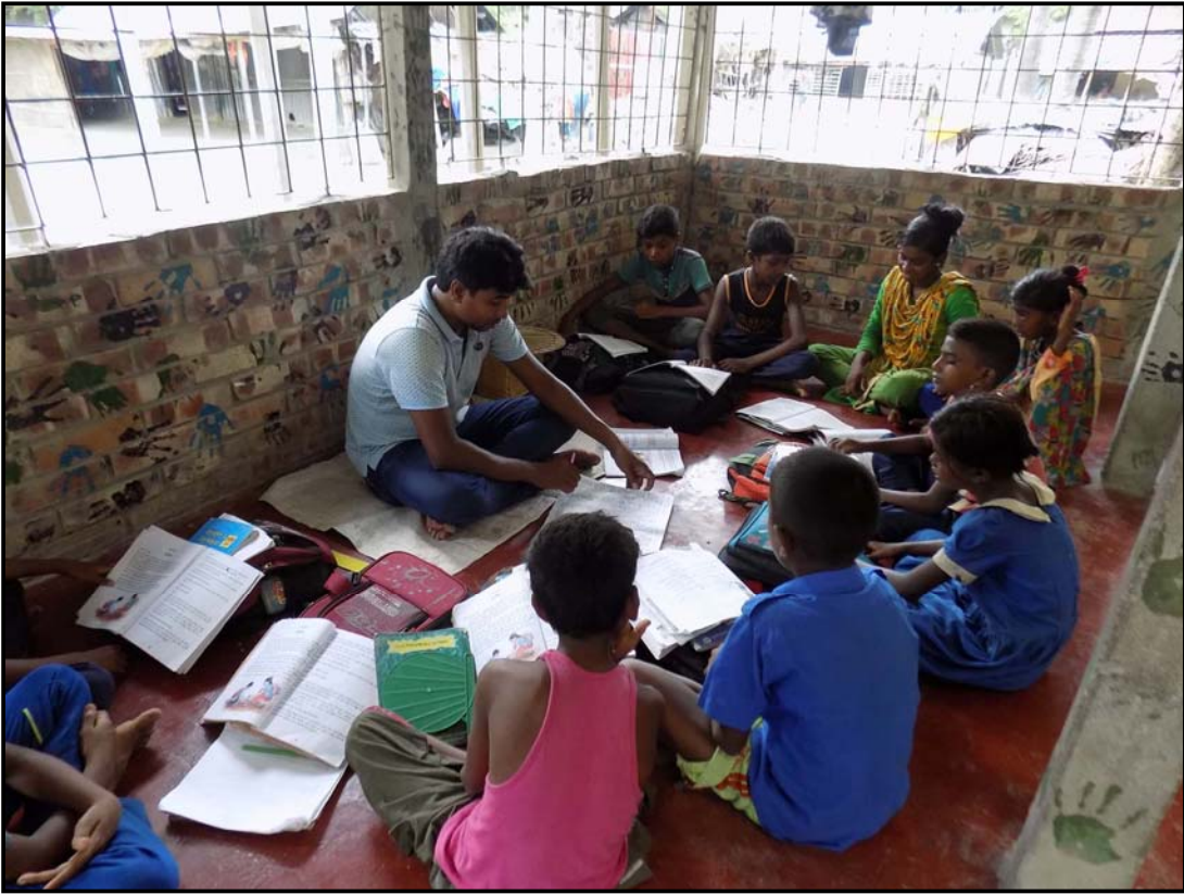
Community Motivator taking tuition class...