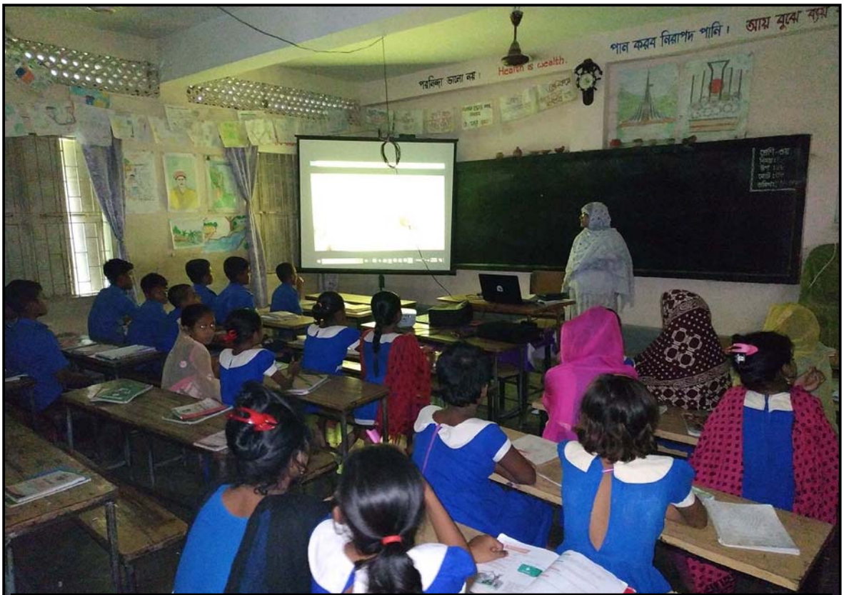
Govt. schools introducing digital class through multimedia projectors...