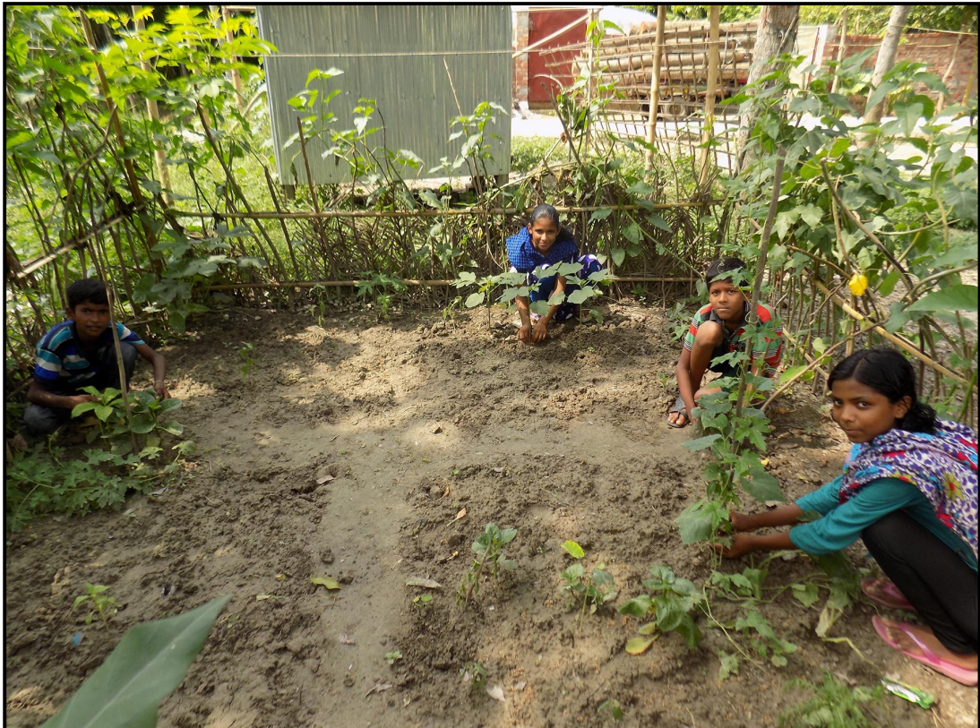
Mohishati student take care of vegetable garden...