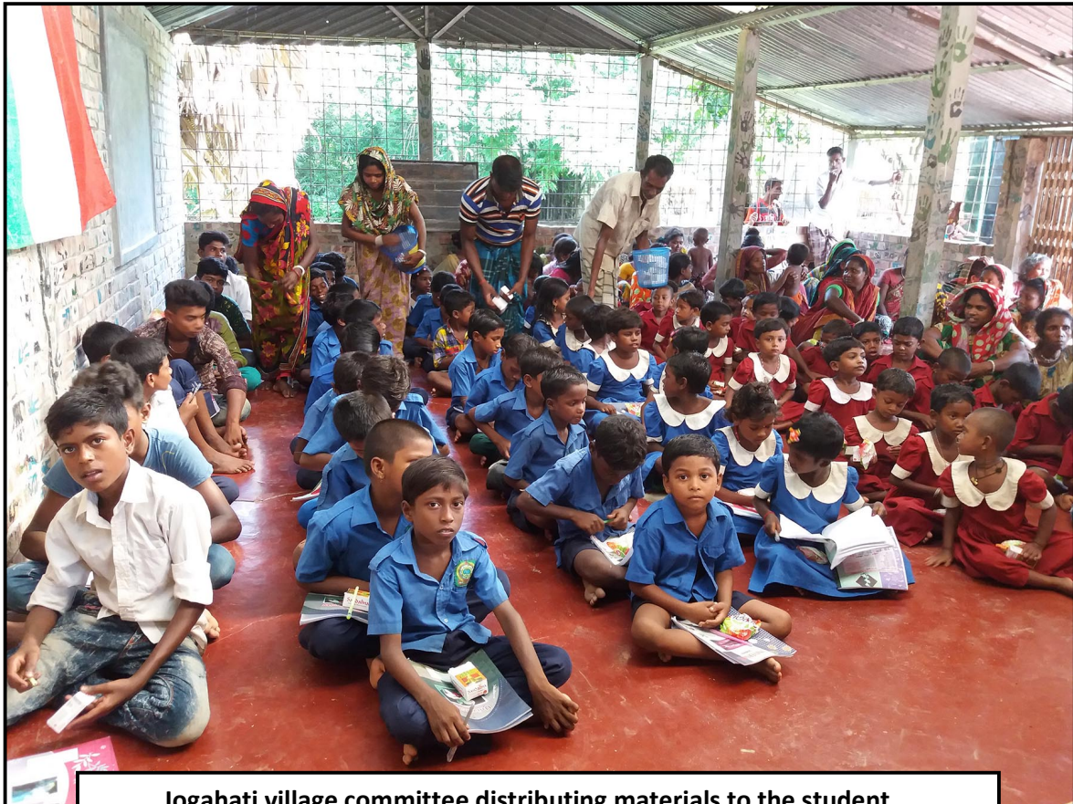
Jogahati village committee distributing materials to the student...