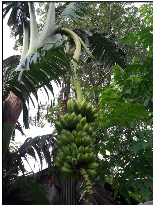
Banana tree in Churamankati at student home...