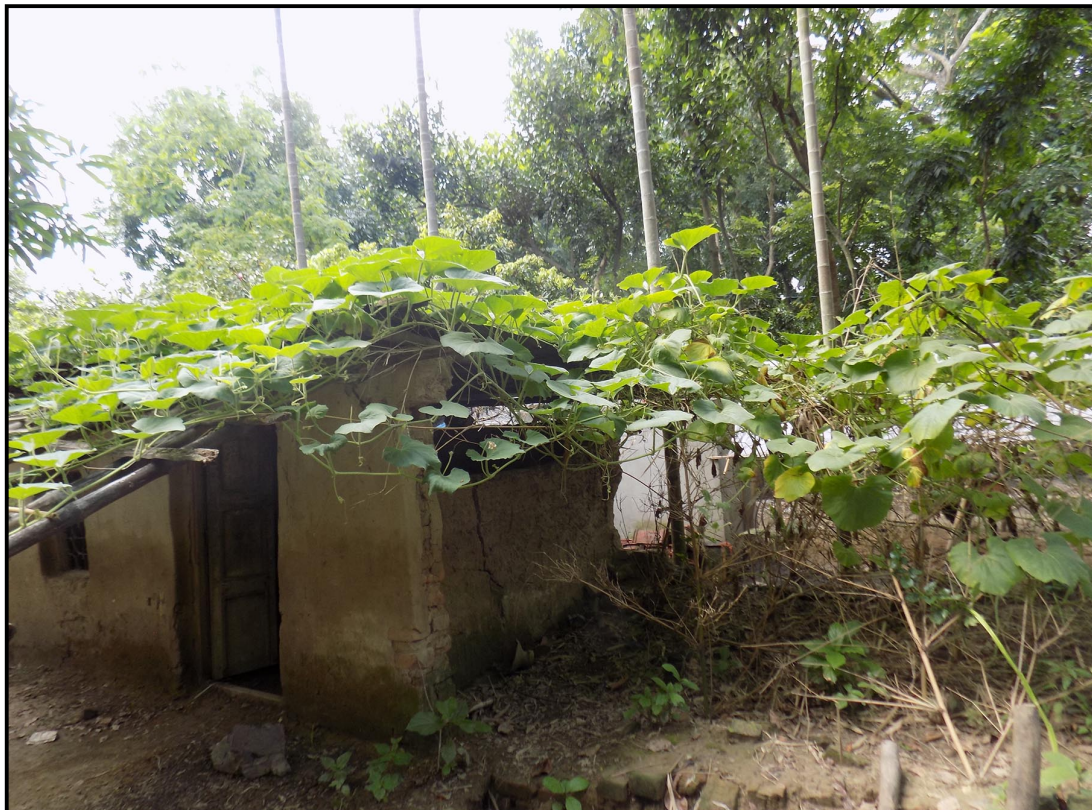
Family planted the bottle gourd vegetable...