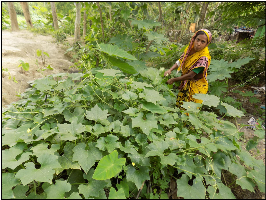
Mother taking care of Luffa vegetable plant...