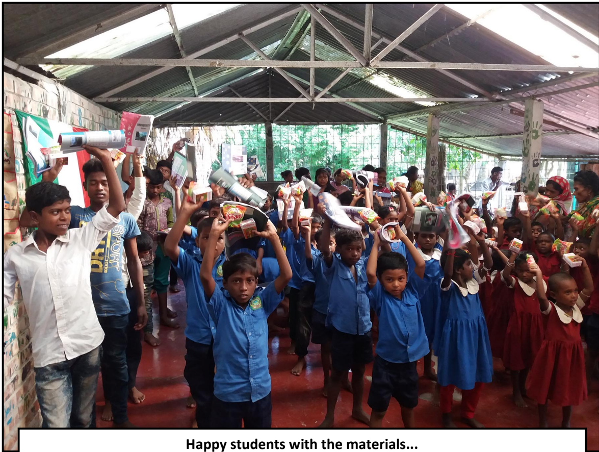
Happy students with the materials...