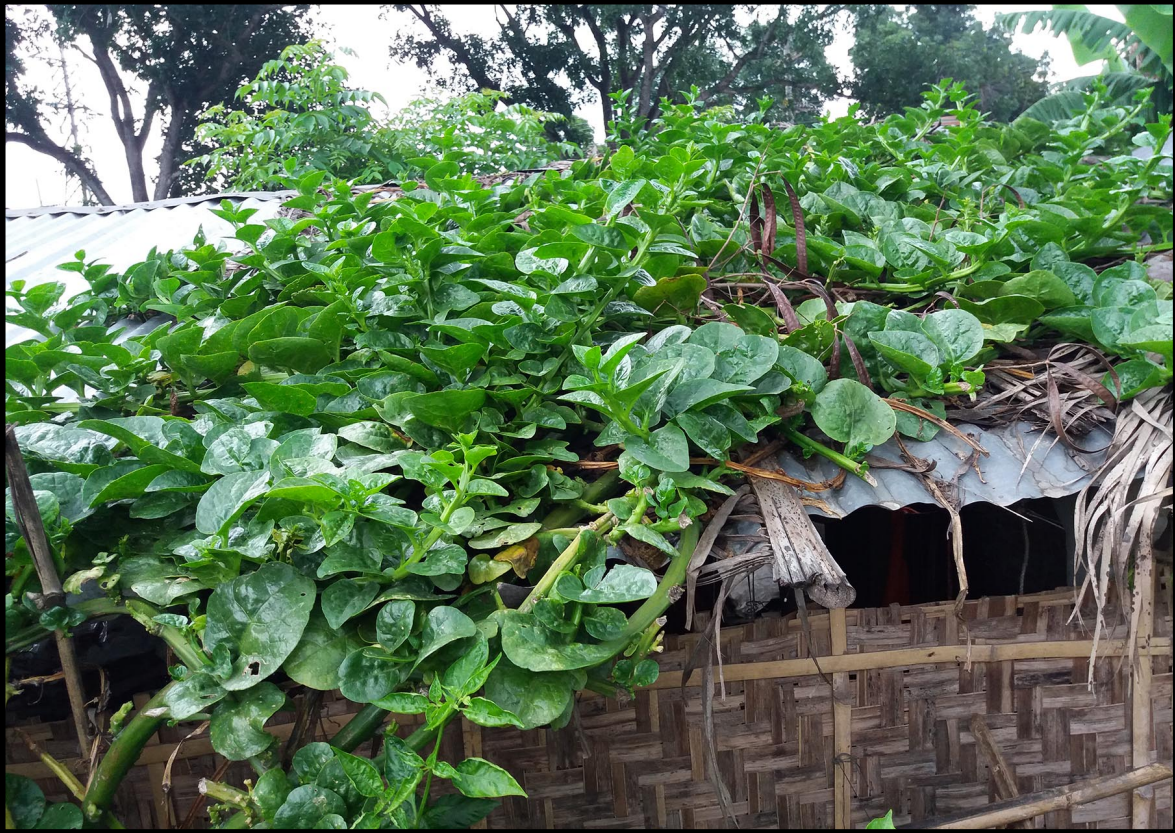
Every community families planted minimum 2 vegetables beside the home...