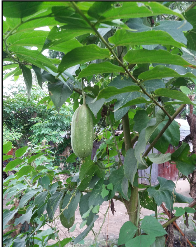
The sponge gourd vegetable at the community...