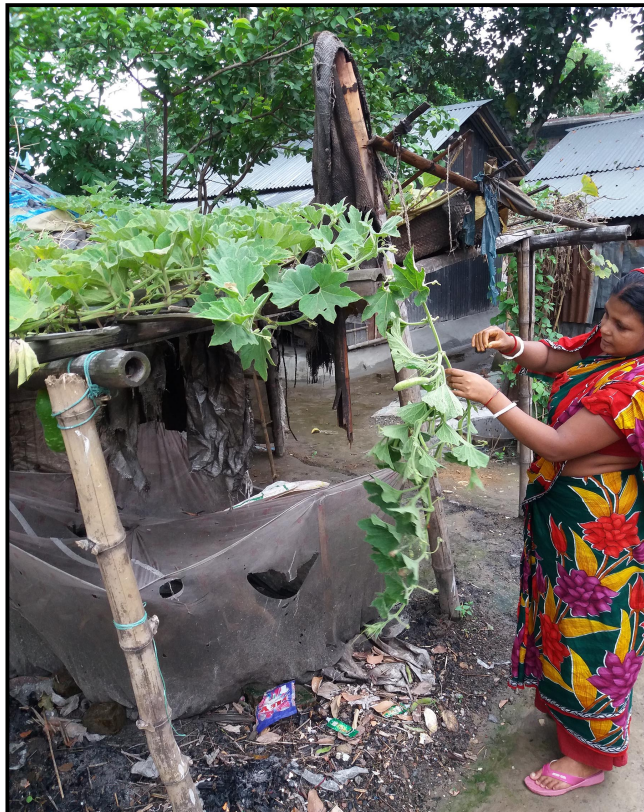
Mother taking care of Kitchen Garden plant...