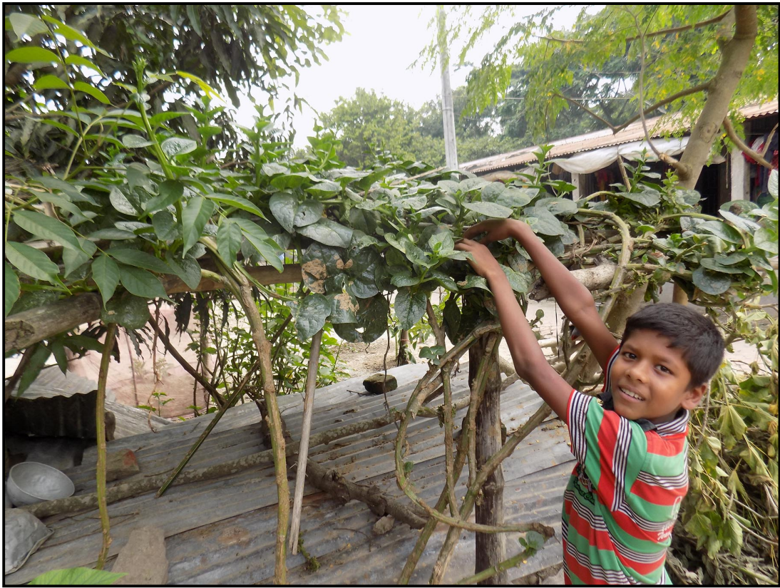
Student taking care of Malabar spinach plant...