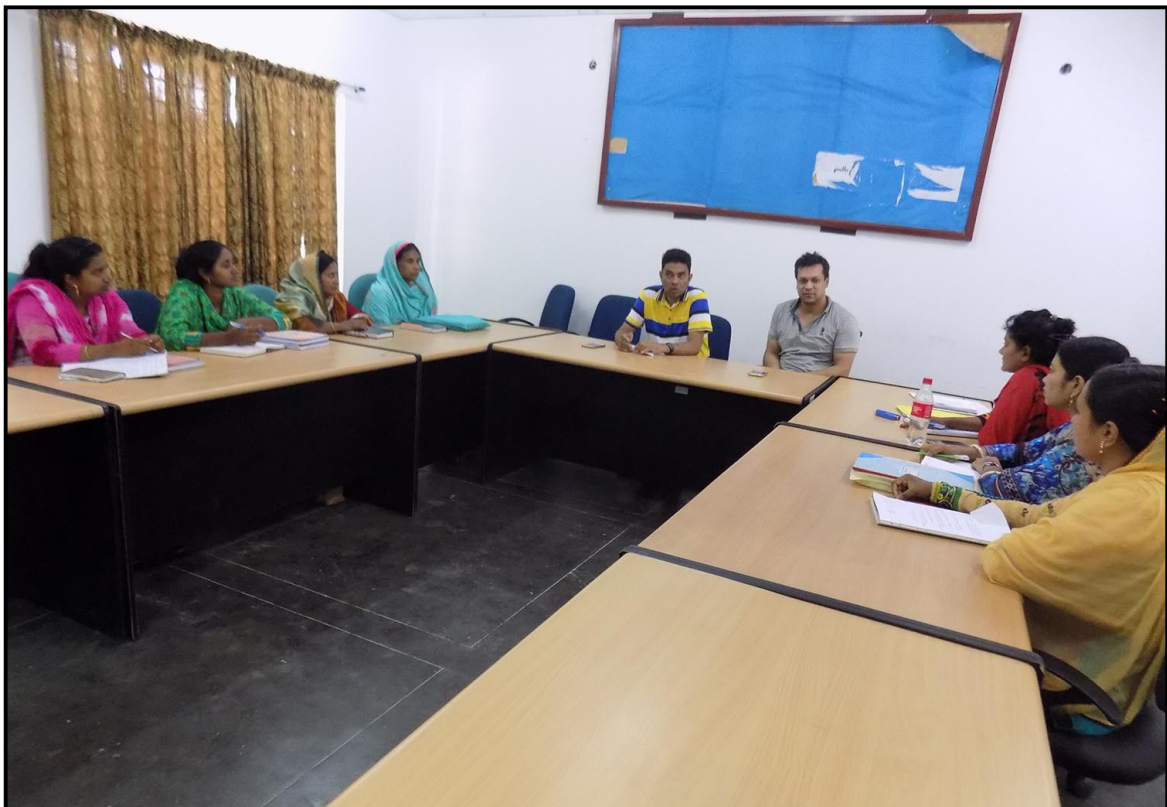
Teachers coordination meeting...