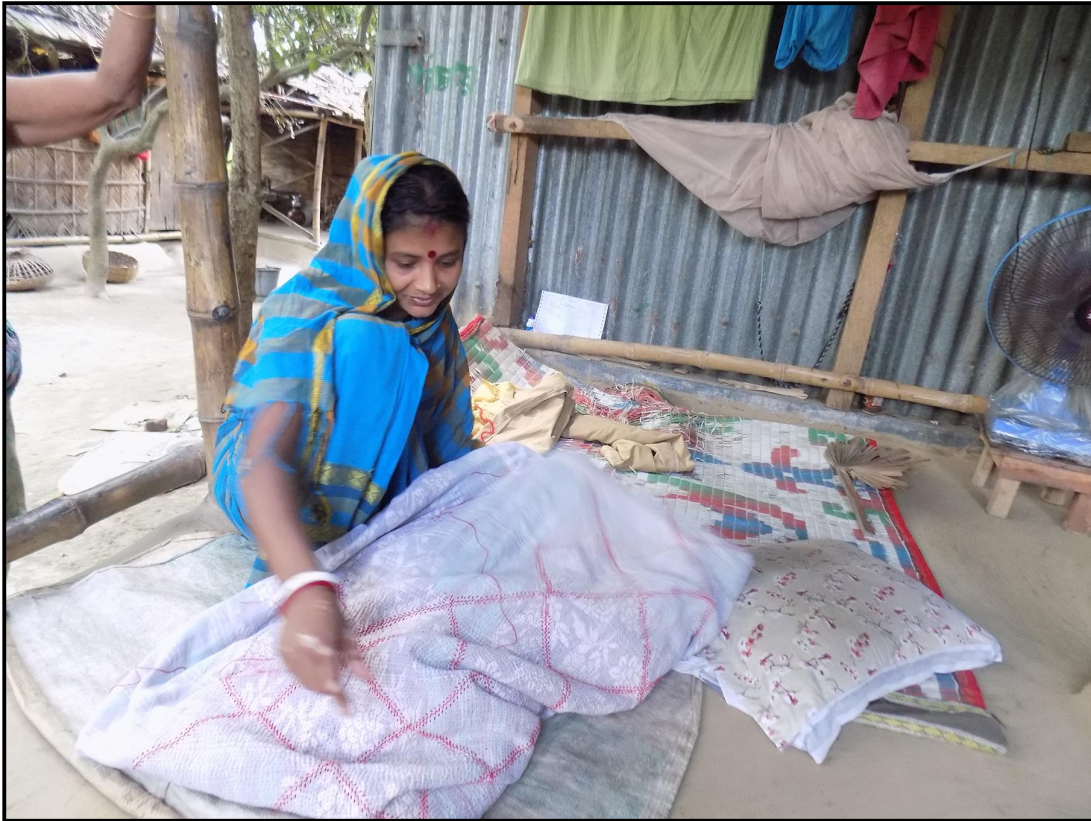
Parents making quilt for home use...