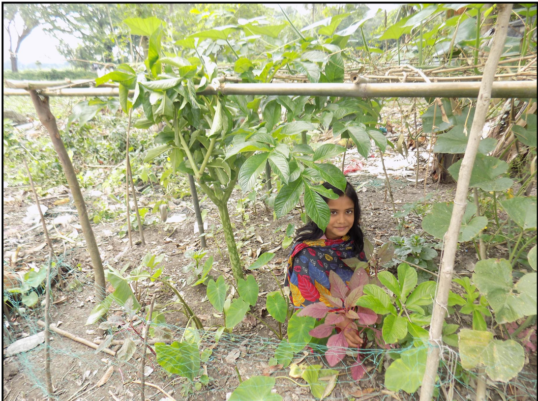
Student taking care of vegetable garden...