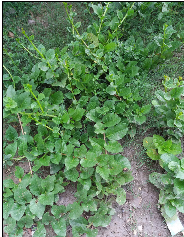
Sorupdaho community family planted vegetables in empty spaces...