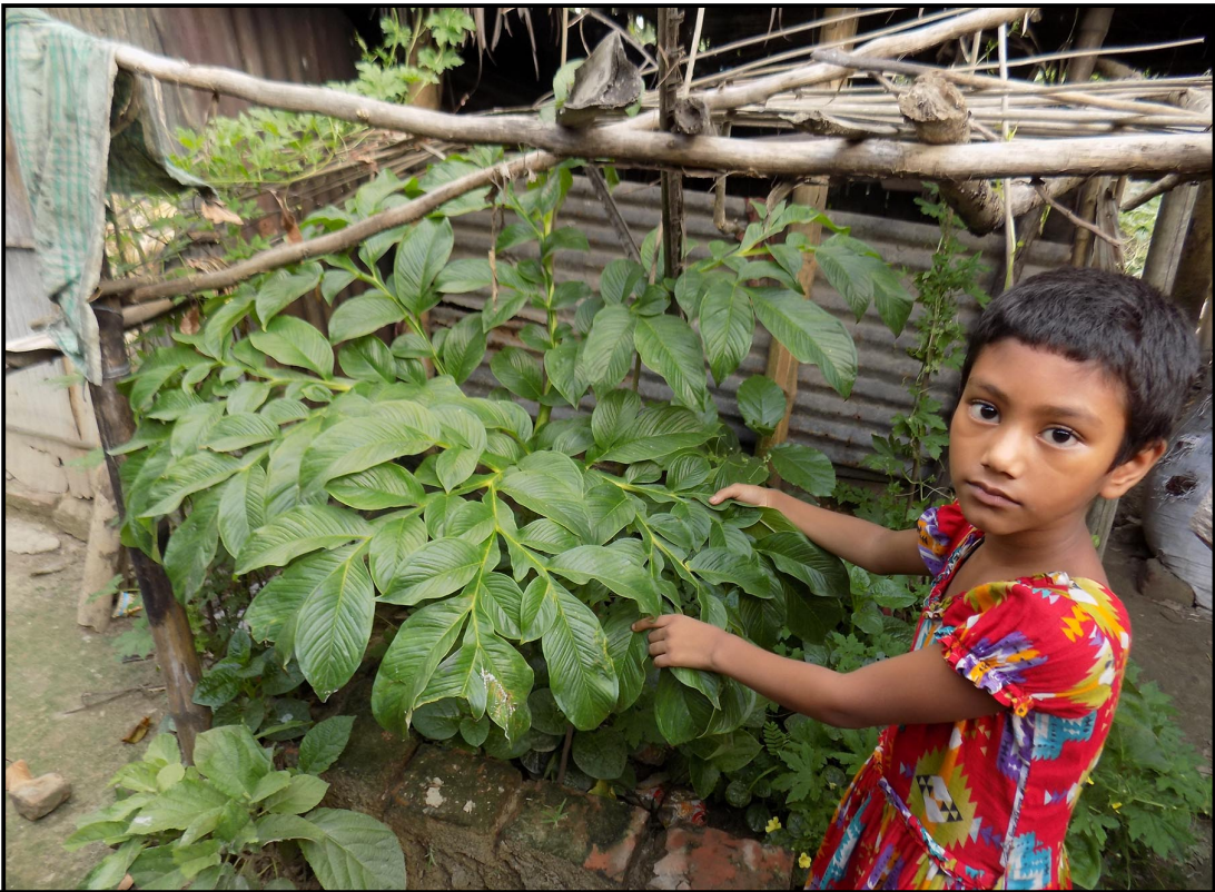
Student take care of planted 'Elephant Foot Yam'...