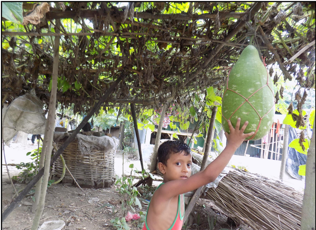
Student showing the bottle gourd vegetable plant...