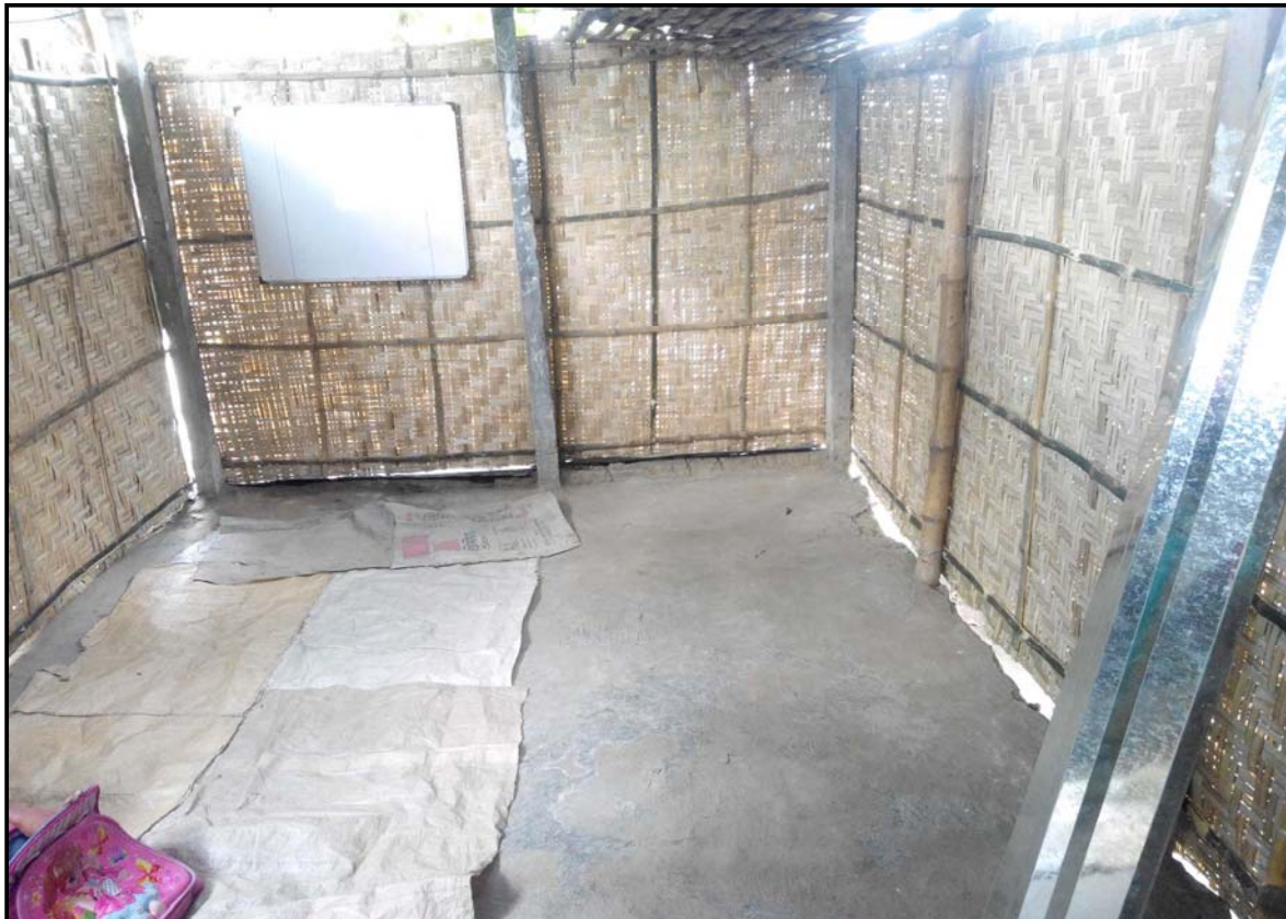
We change the bamboo fence and some new tin in the roof...