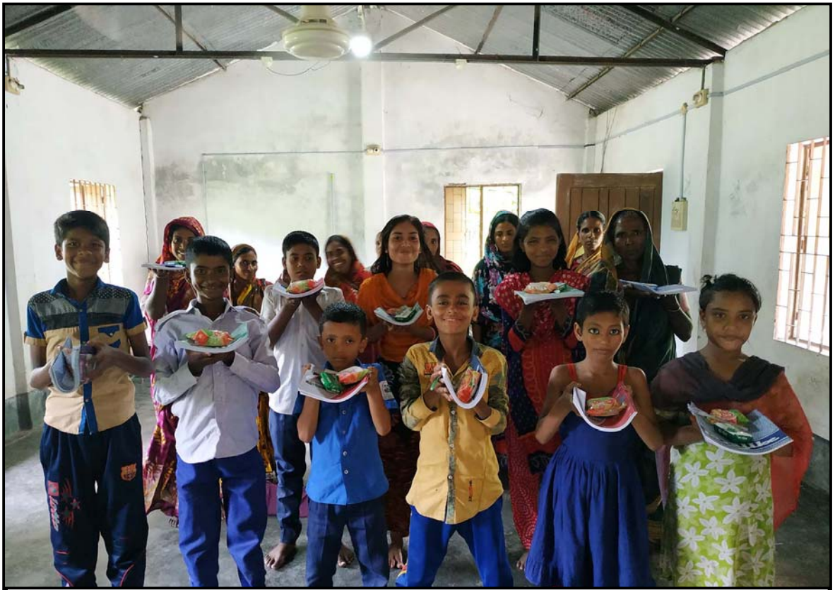
Happy students with the materials at Mohishati village...