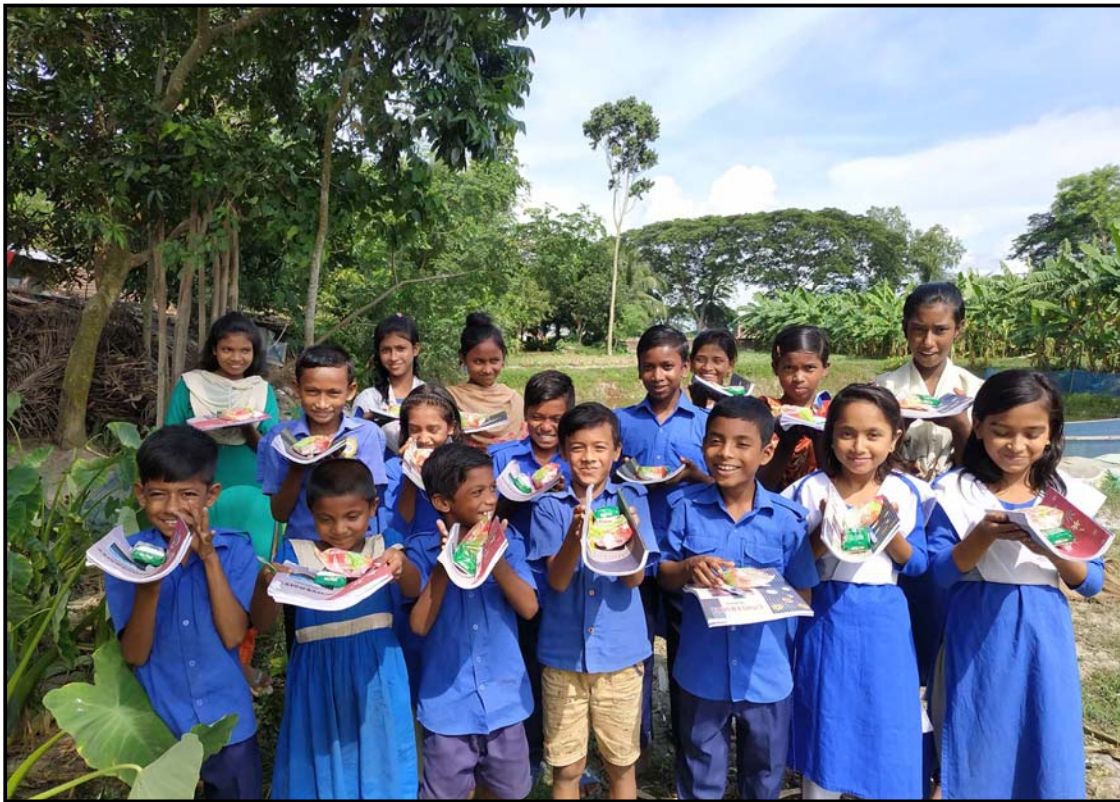
Happy students with the materials at Sorupdaho village...