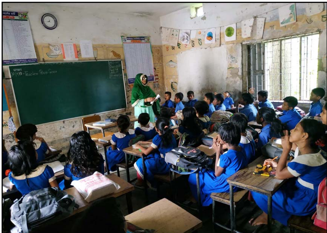
Govt. schools class going on...