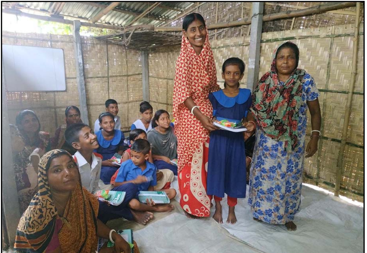
Materials distribution at Churamankati village...