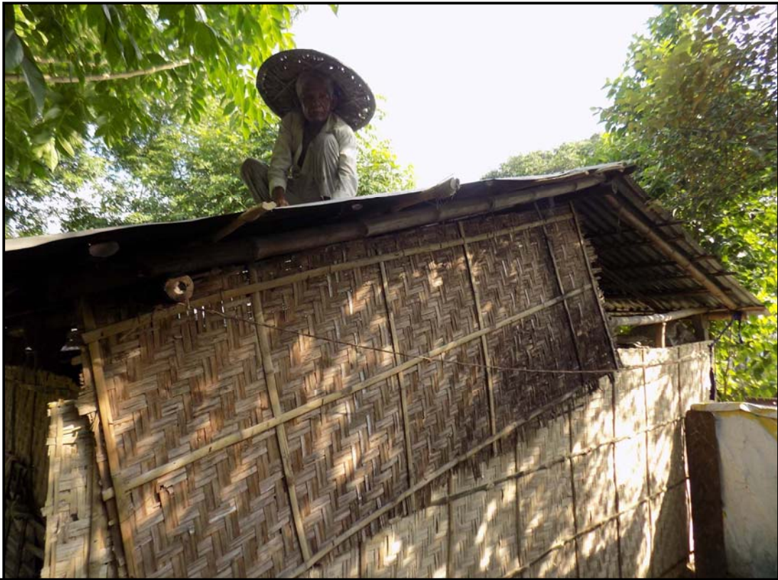
Repairing Study Centre at Churamankati Village...