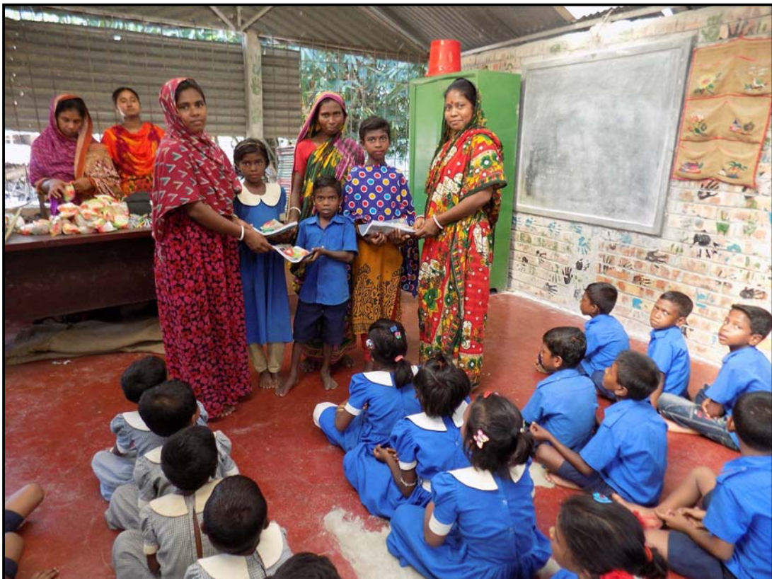
Monthly materials distribution at Jogahati Village...