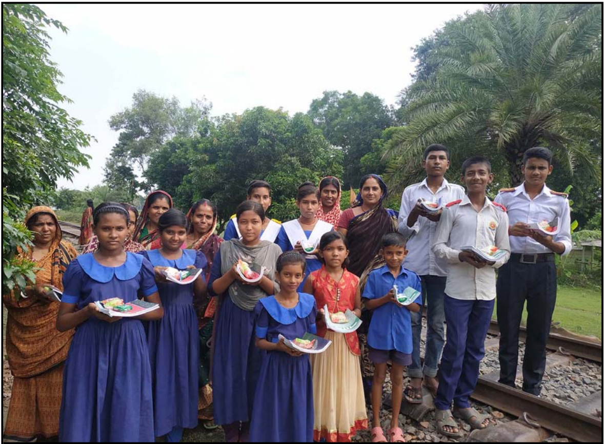
Happy student with the materials at Churamankati village....