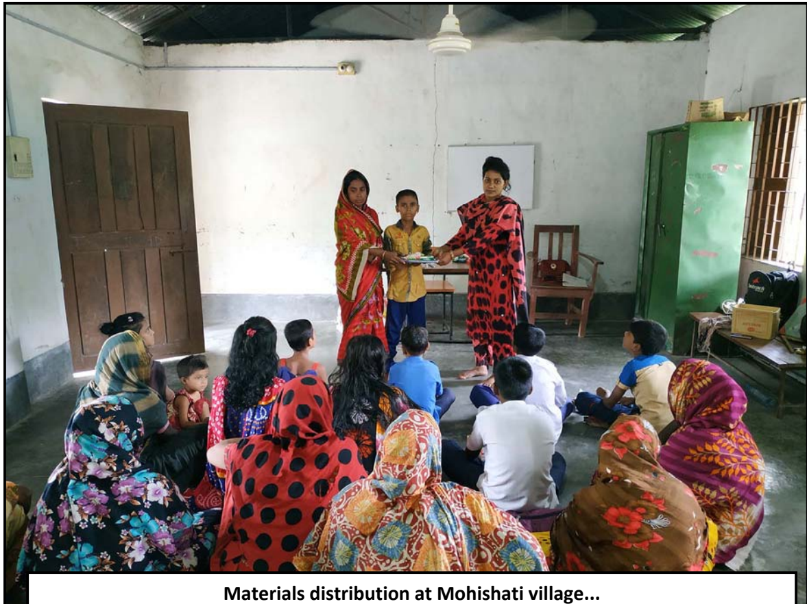
Materials distribution at Mohishati village...