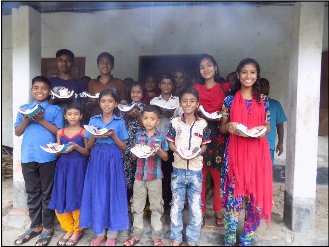
Students with the materials at Mohishati village...