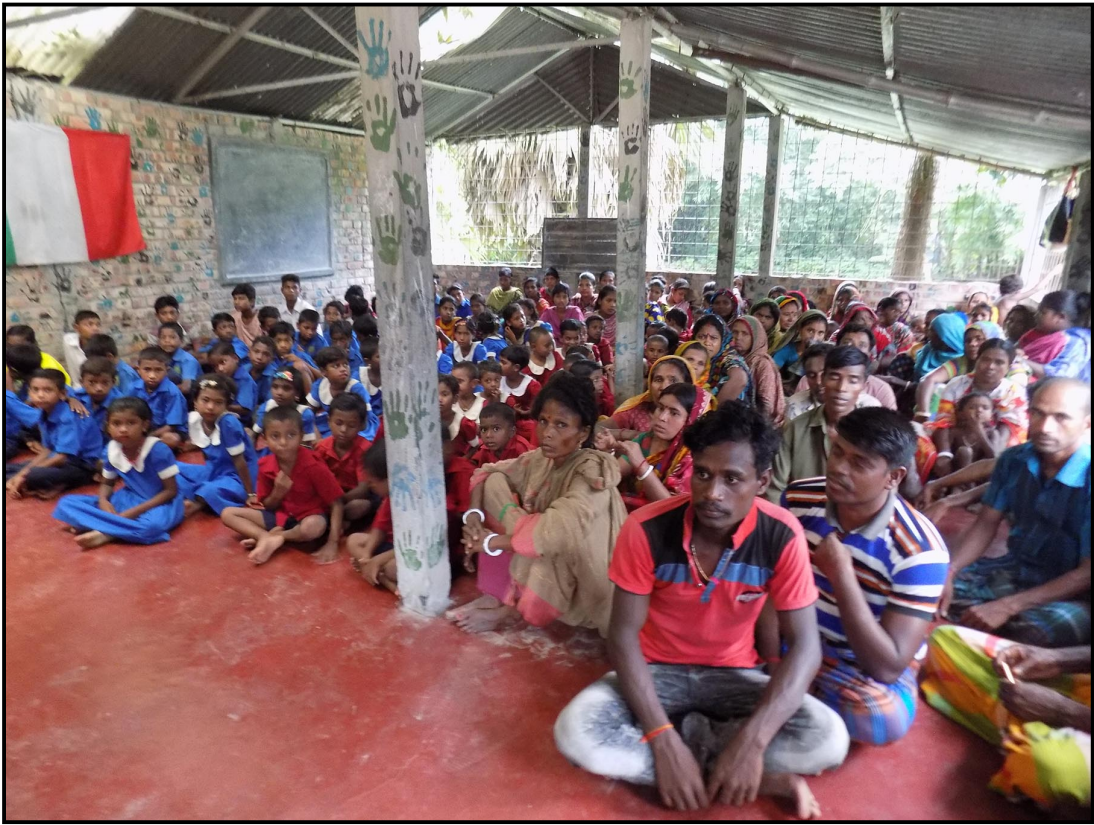
Parents attentively participating at the meeting...