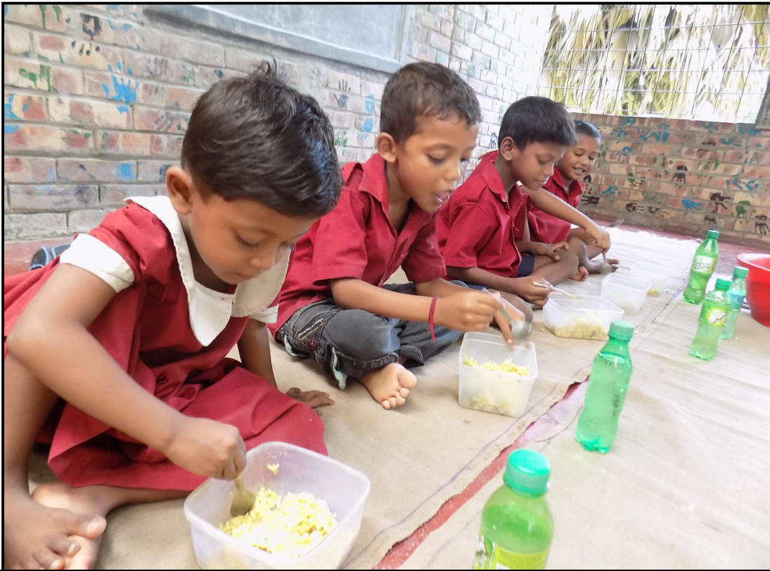
Preschool students enjoying the warm meal after class...