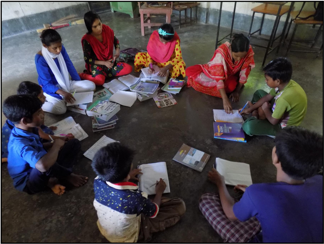
Tuition class at Mohishati study centre...