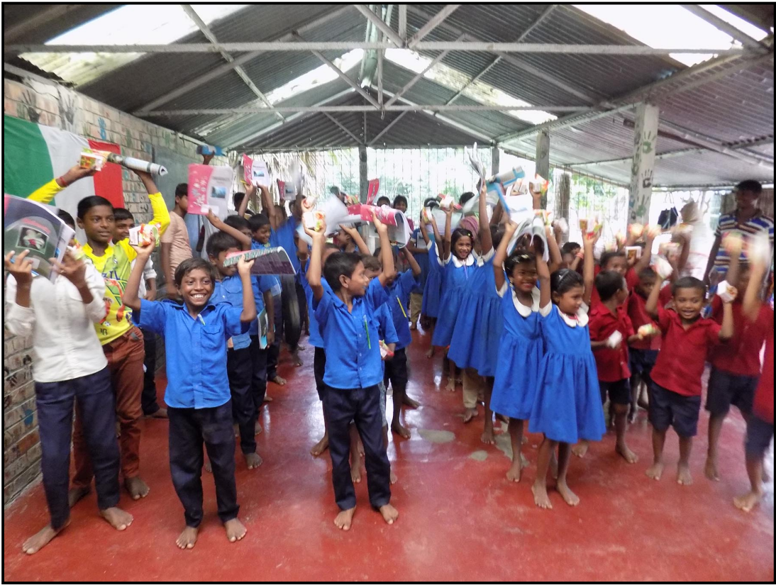
Happy students with the materials at Jogahati...