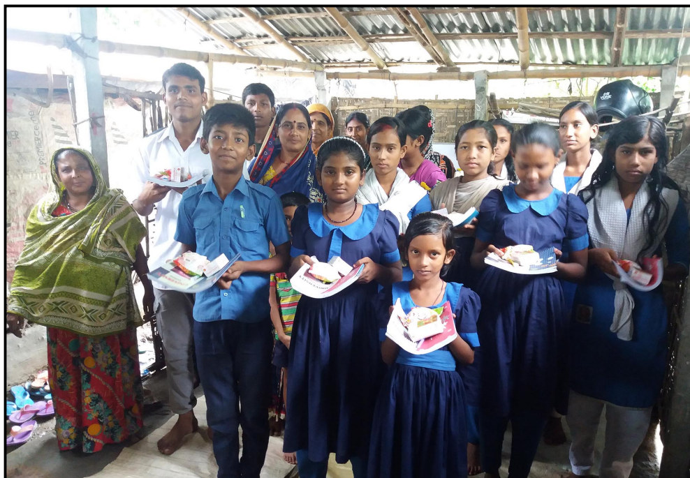
Happy students with the materials at Churamankati village...