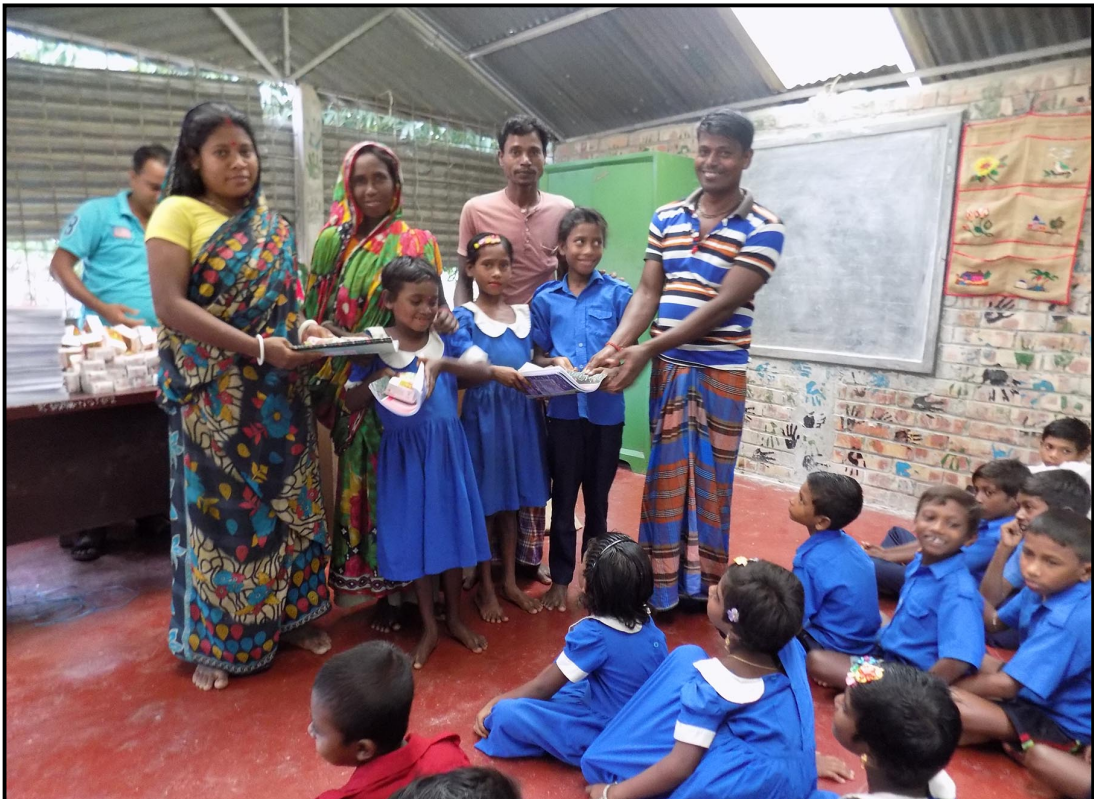
Materials distribution at Jogahati village...