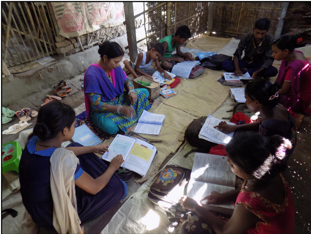
Tuition class at Churamankati study centre...