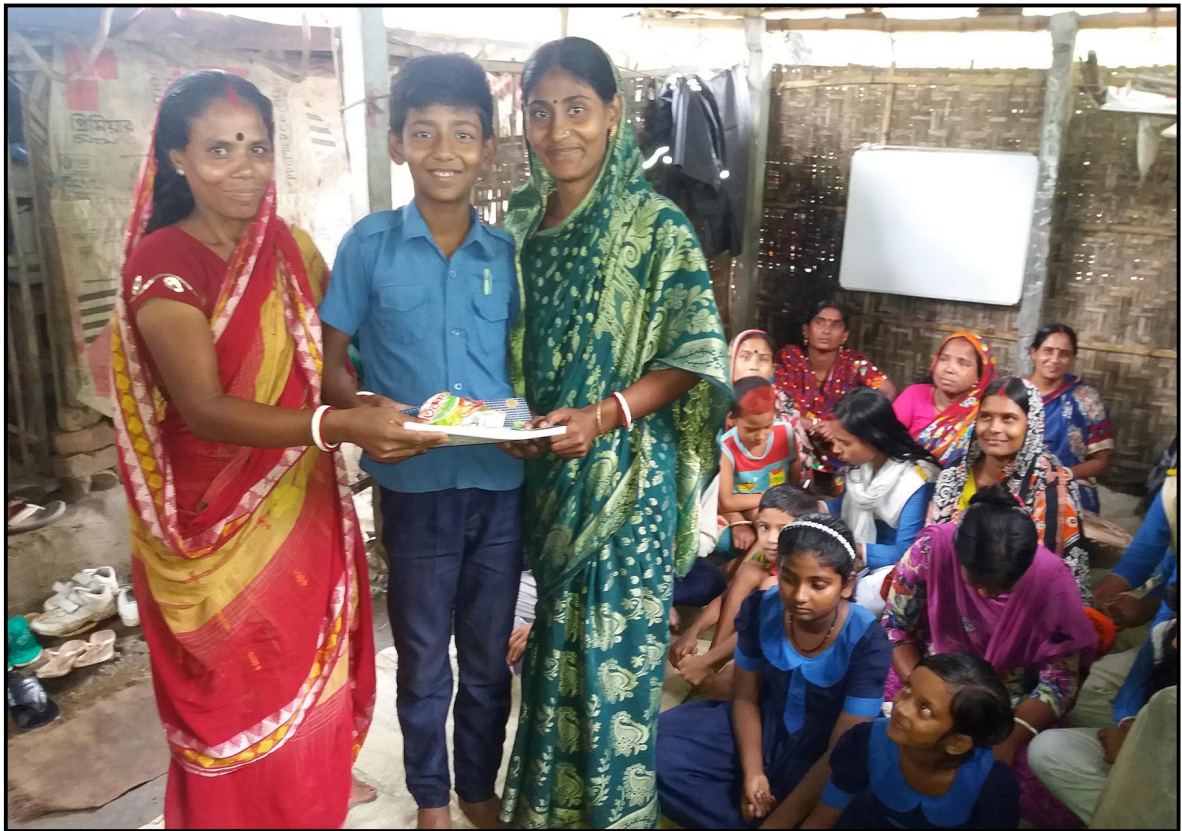
Education materials distribution at Churamankati...