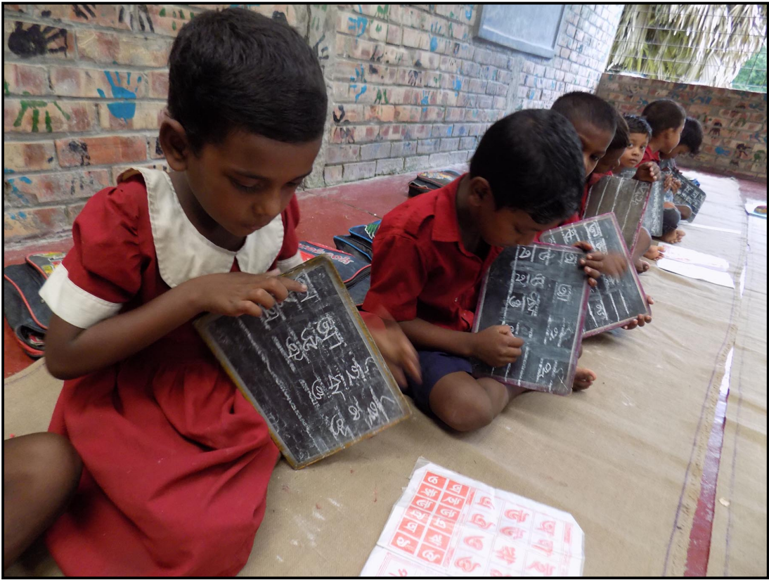
Preschool students in class exercise...