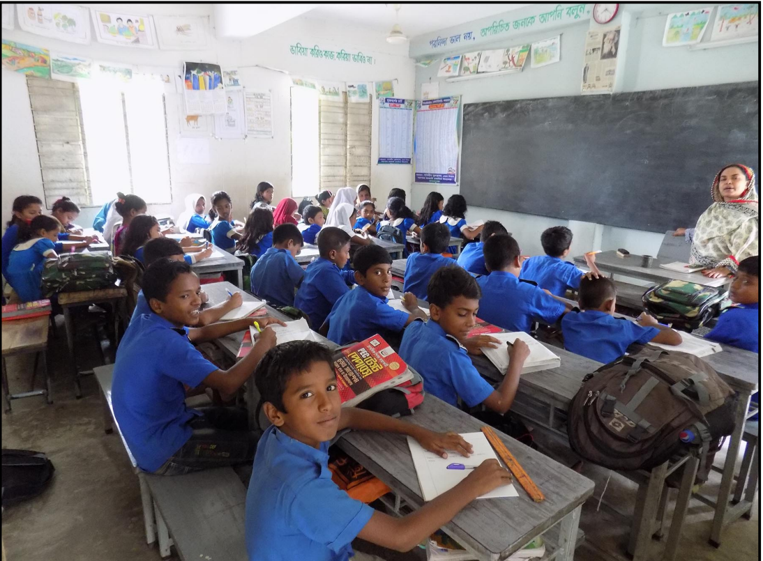
Students at local government school class room...