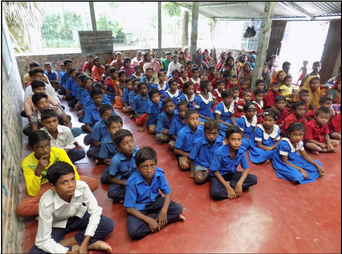
Monthly parents students meeting...