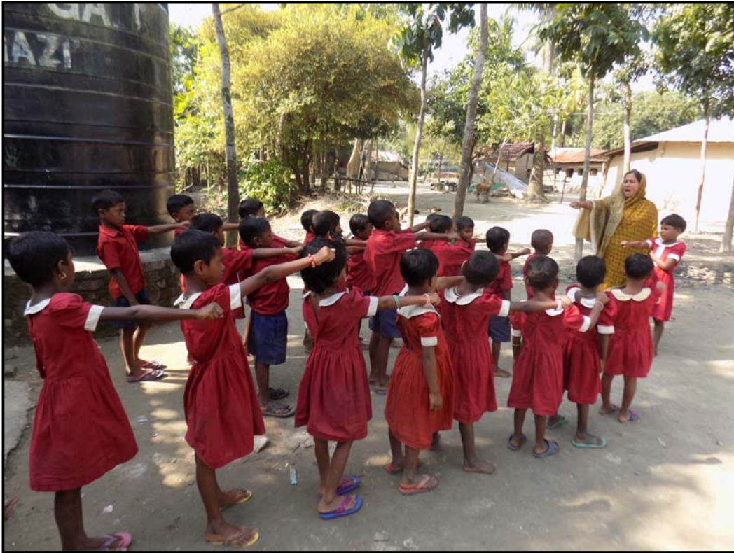
In assembly oath for to make better life and better world...