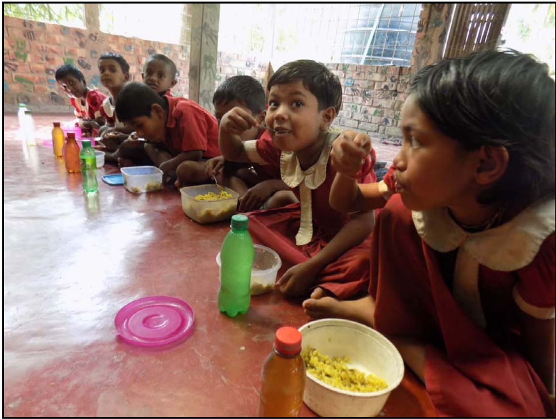
Enjoying the school meal...