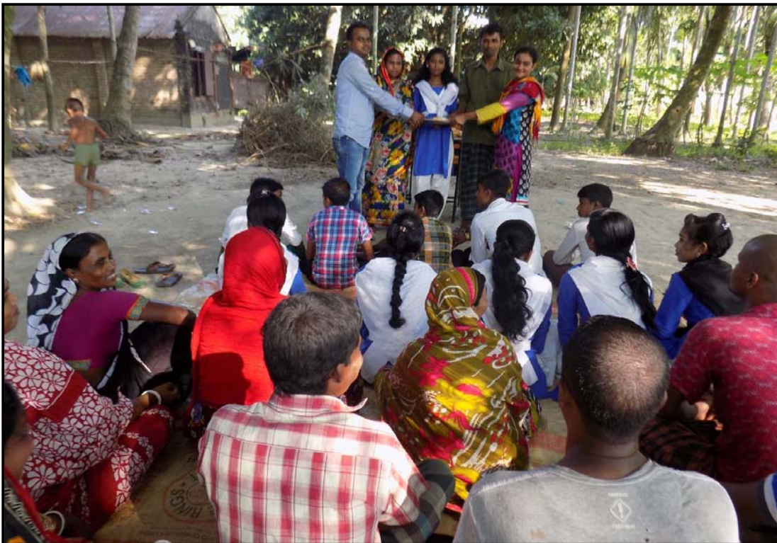
Materials distribution at Mohishati...