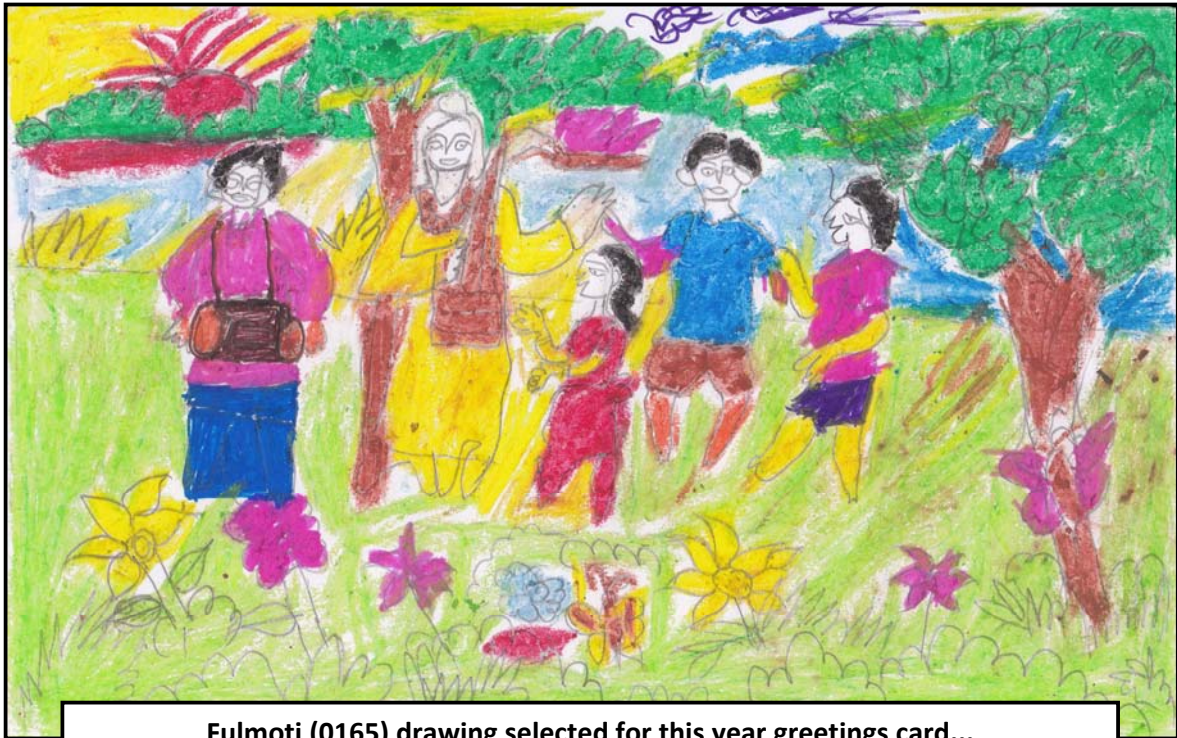
Fulmoti (0165) drawing selected for this year greetings card...