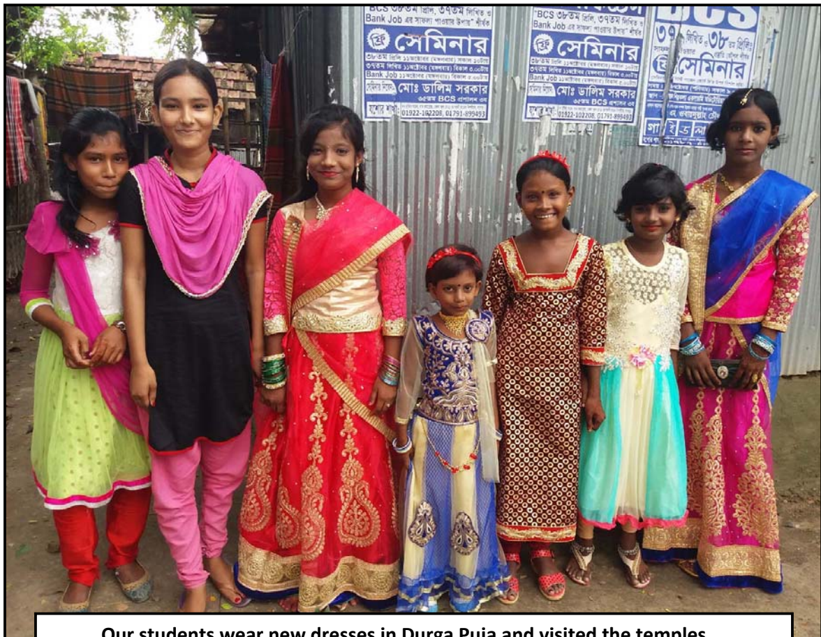
Our students wear new dresses in Durga Puja and visited the temples....