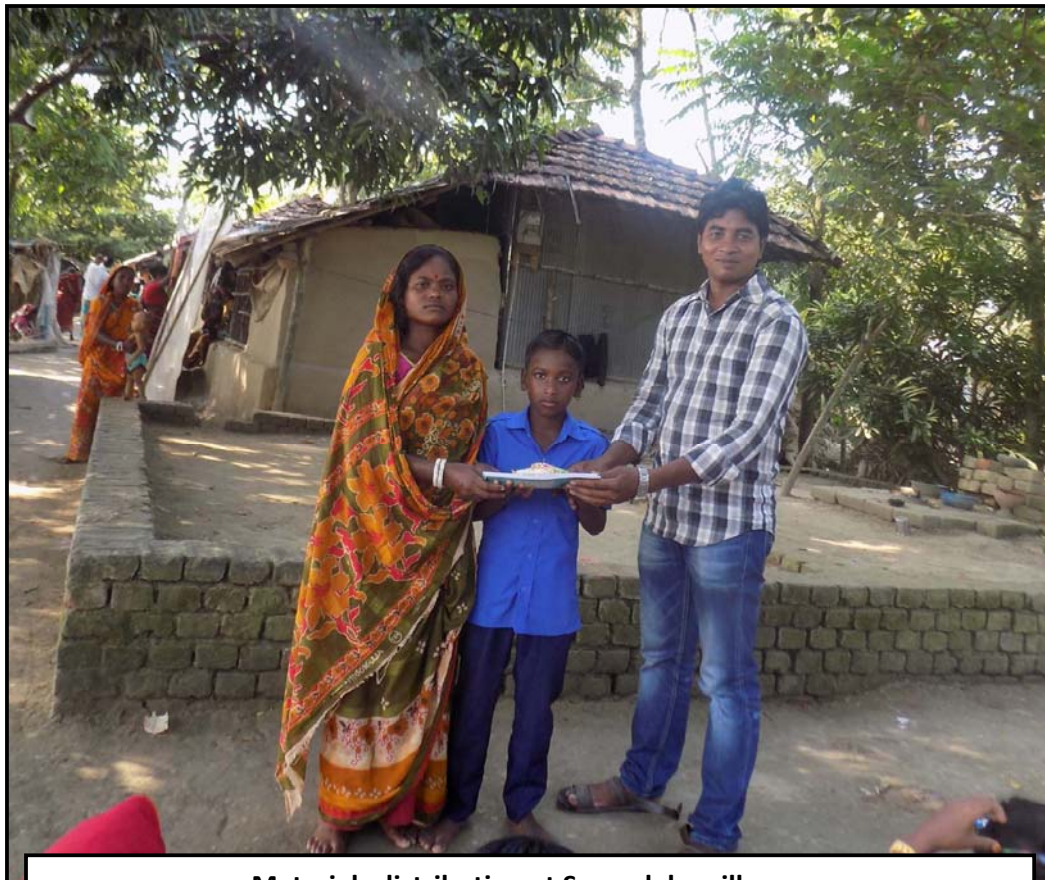
Materials distribution at Sorupdaho village...