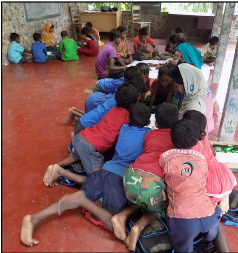
Student curiously taking lesson in study centre...