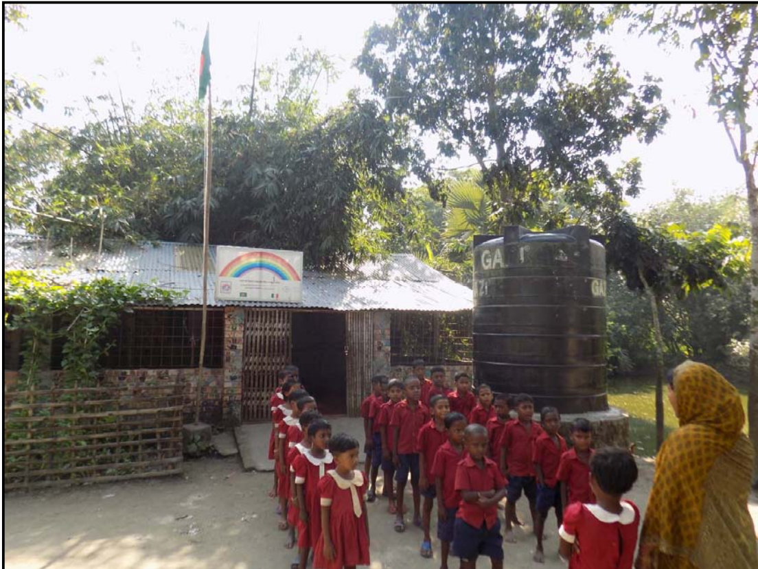
Jogahati pre-school morning assembly...