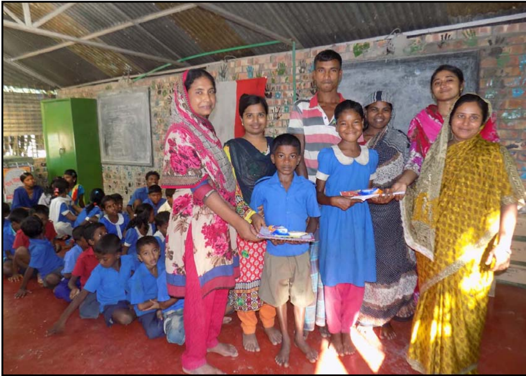
Materials distribution at Jogahati village...