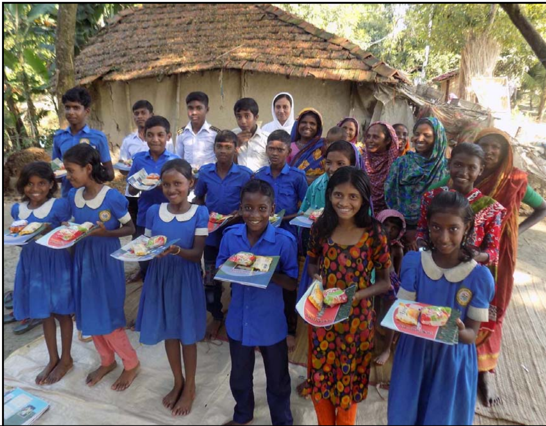
Happy faces with materials...