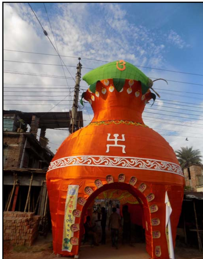
Our children celebrate the Durga Puja. The temple gate near the BS...