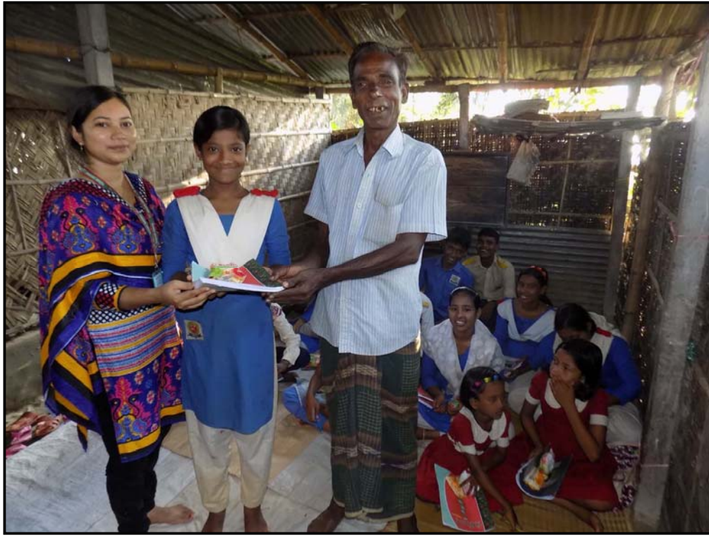
Materials distribution at Churamankati...