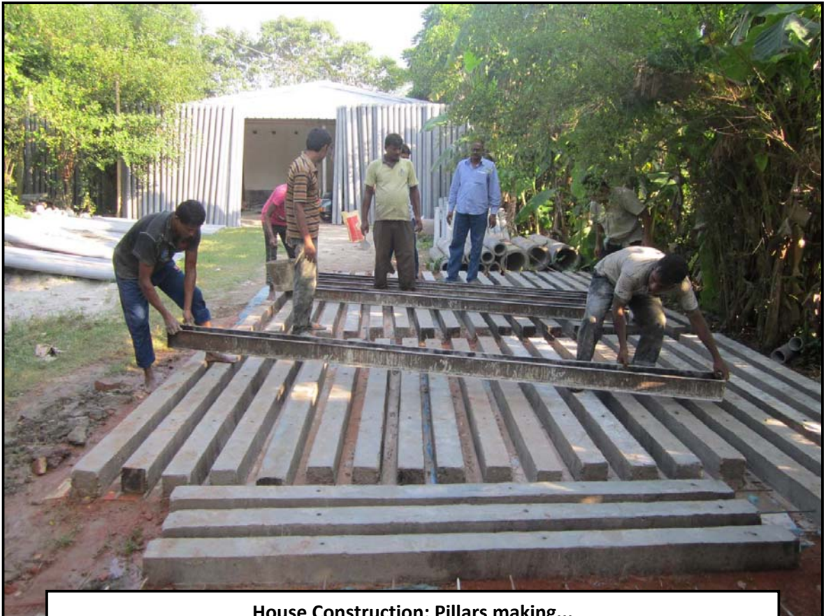
House Construction: Pillars making...