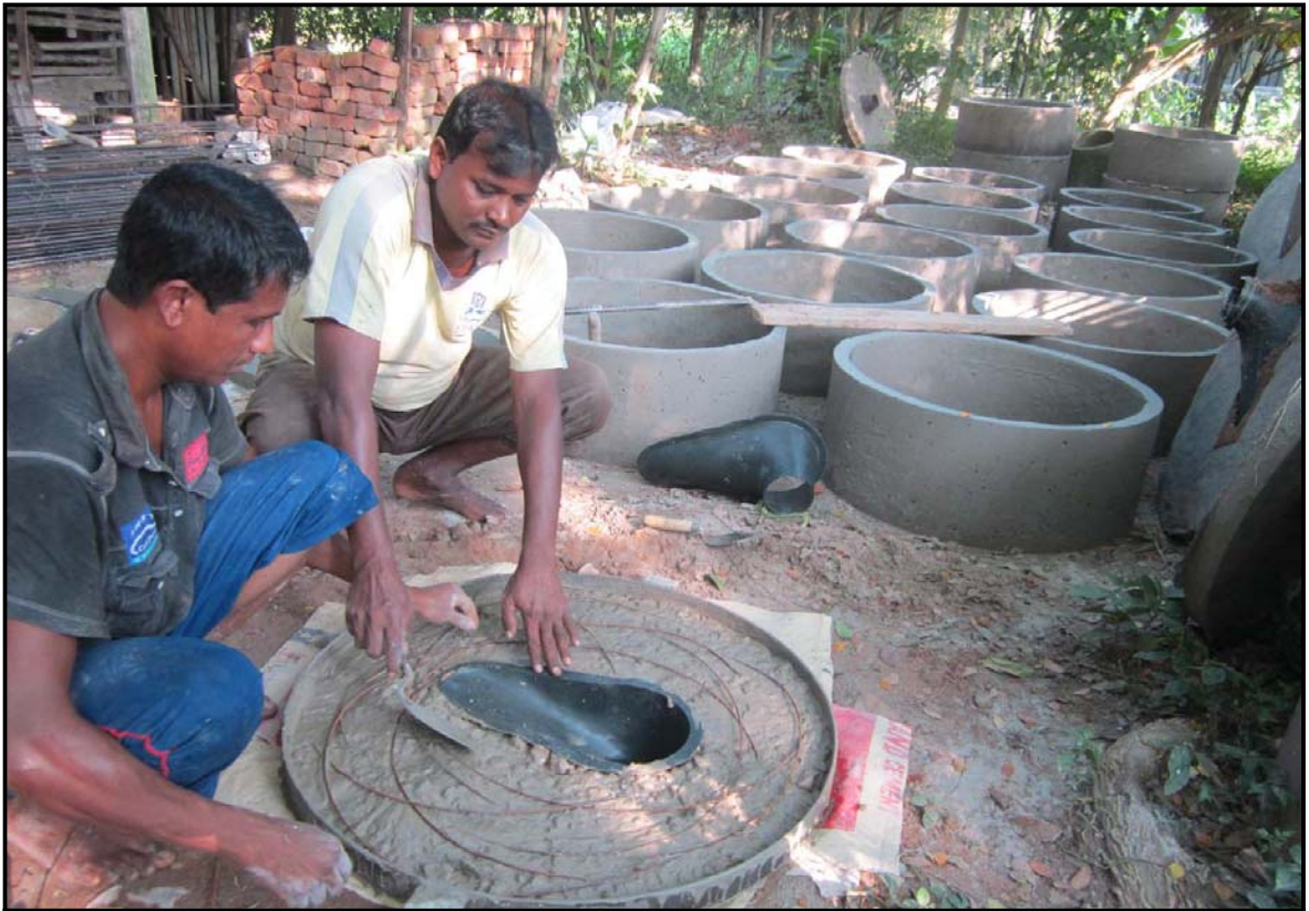
House Construction: Sanitary Latrine materials in production...