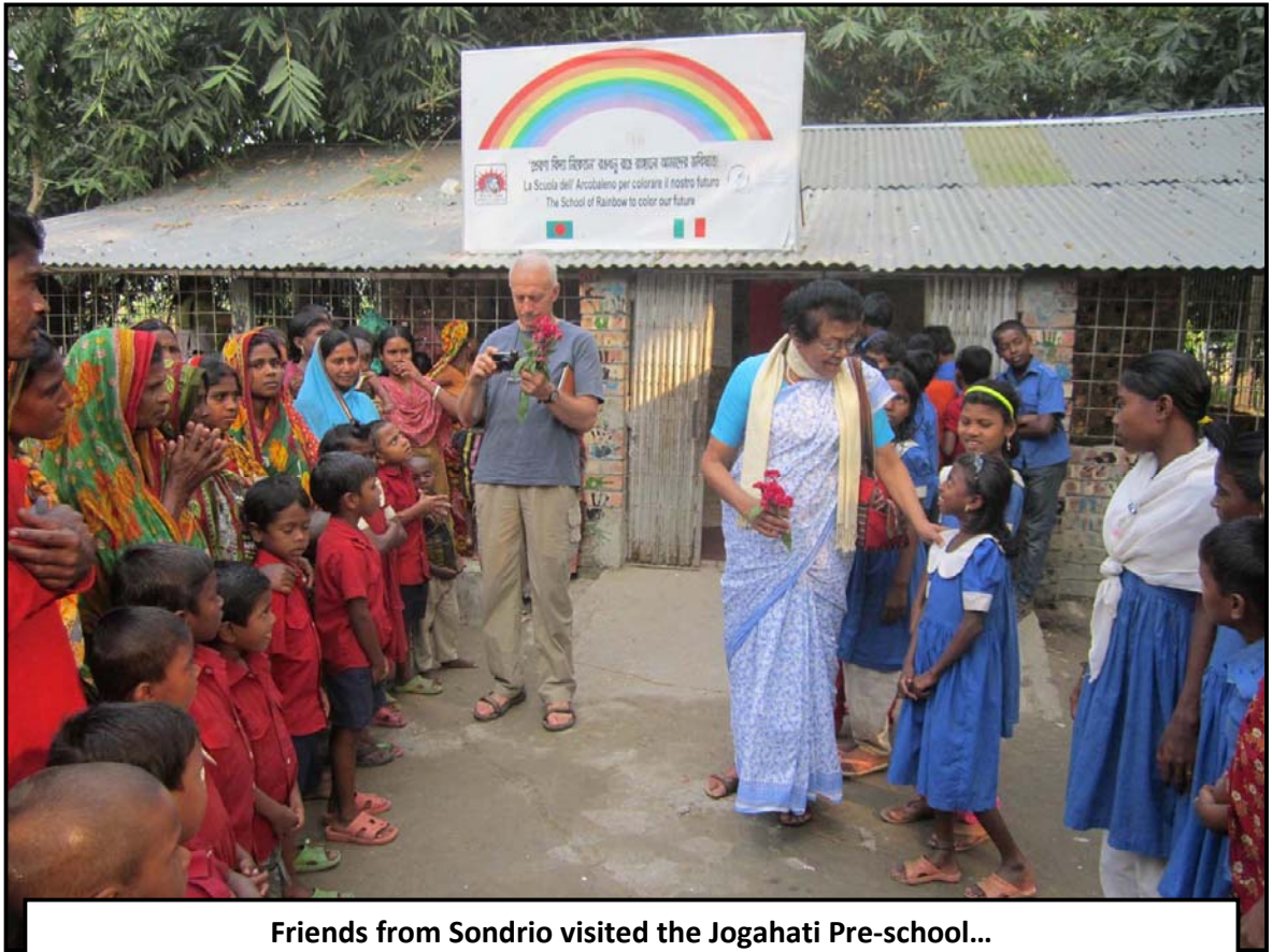
Friends from Sondrio visited the Jogahati Pre-school...