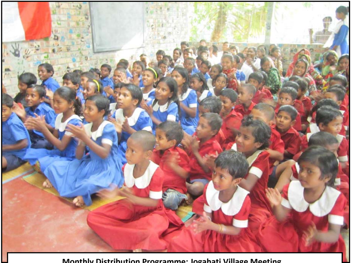
Monthly Distribution Programme: Jogahati Village Meeting...