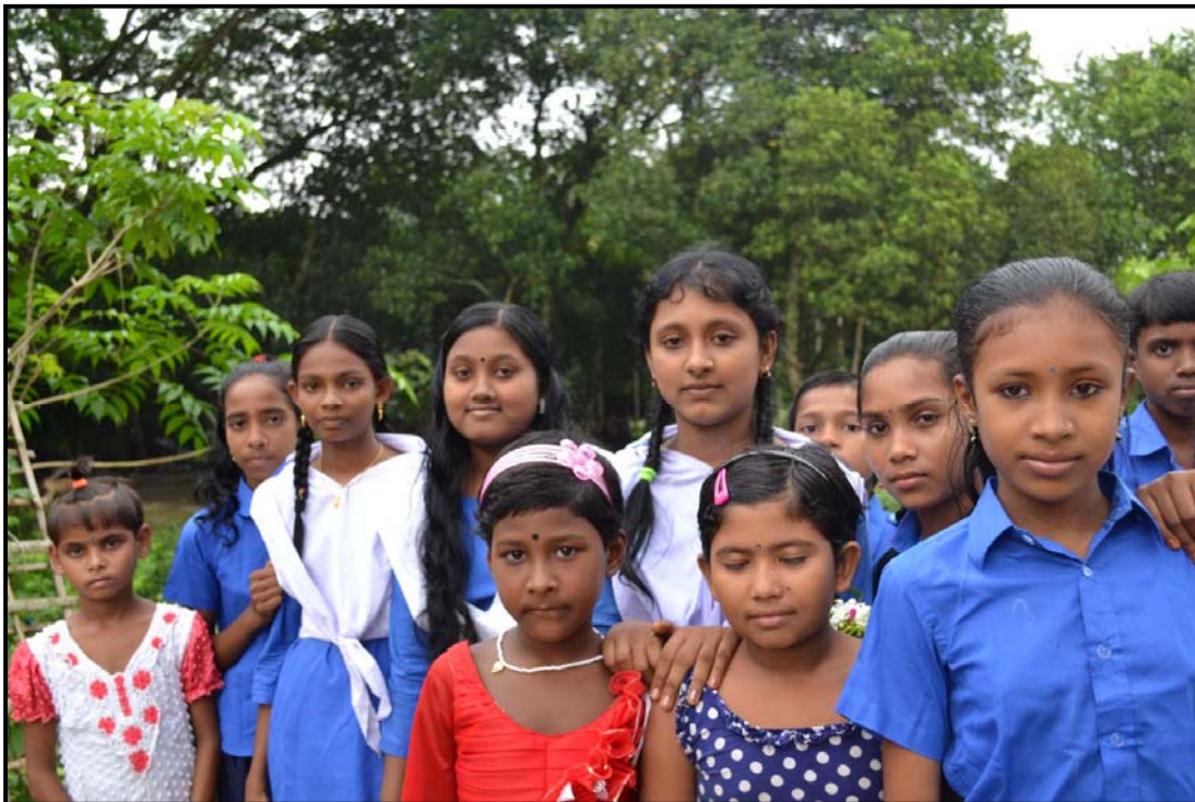
The eyes of hope and prosperity...