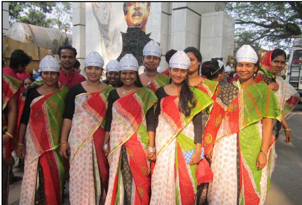
Our teachers and staffs also participated on the reception programme...