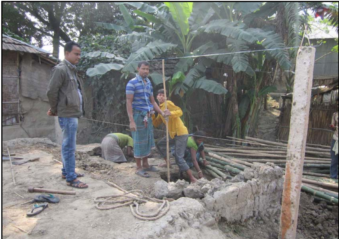
House Construction: Preparation of construction...