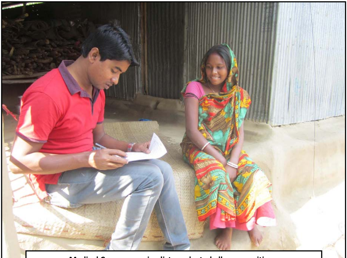
Medical Camp screening list conducted all communities...