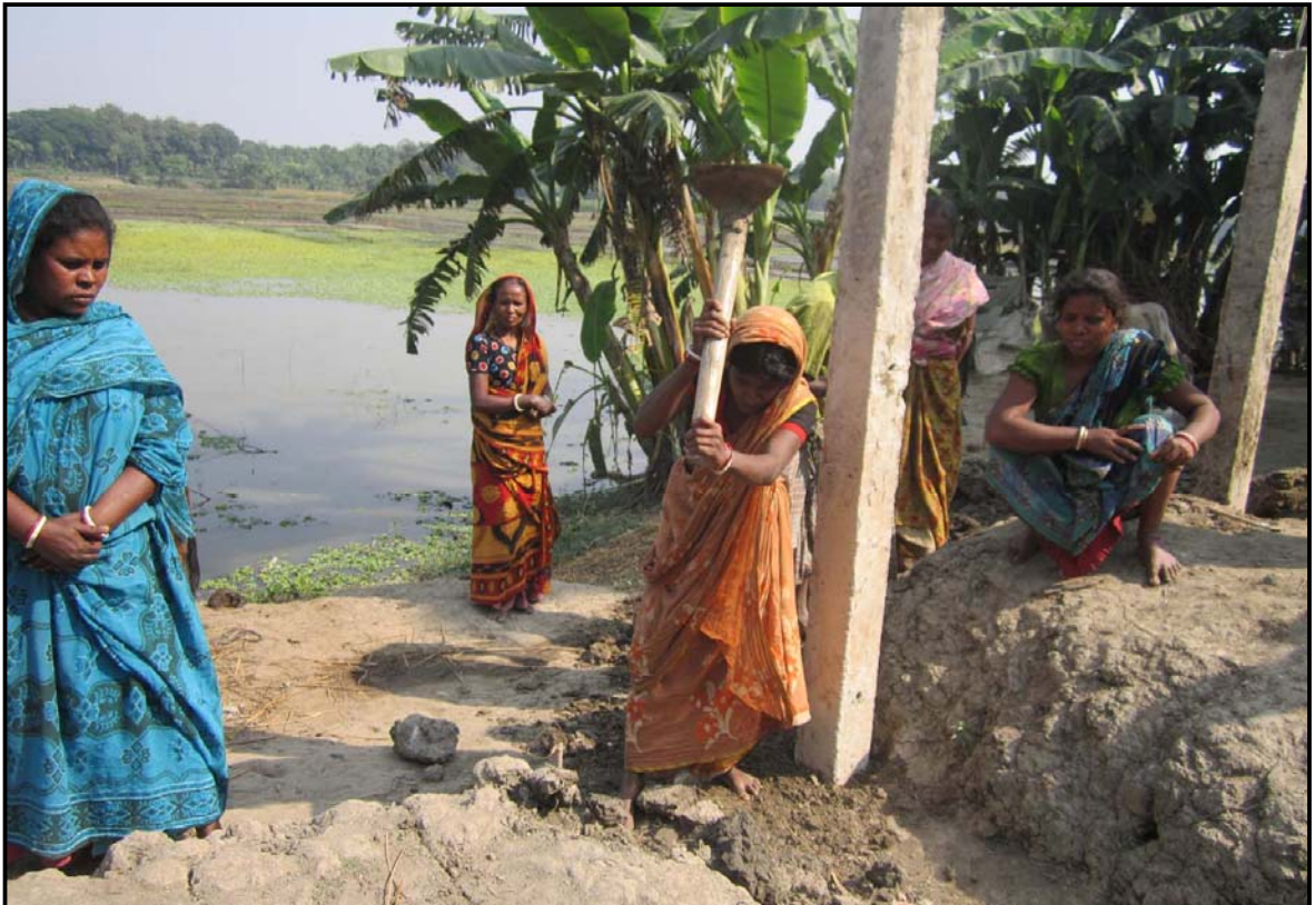
House Construction: Preparation of construction...