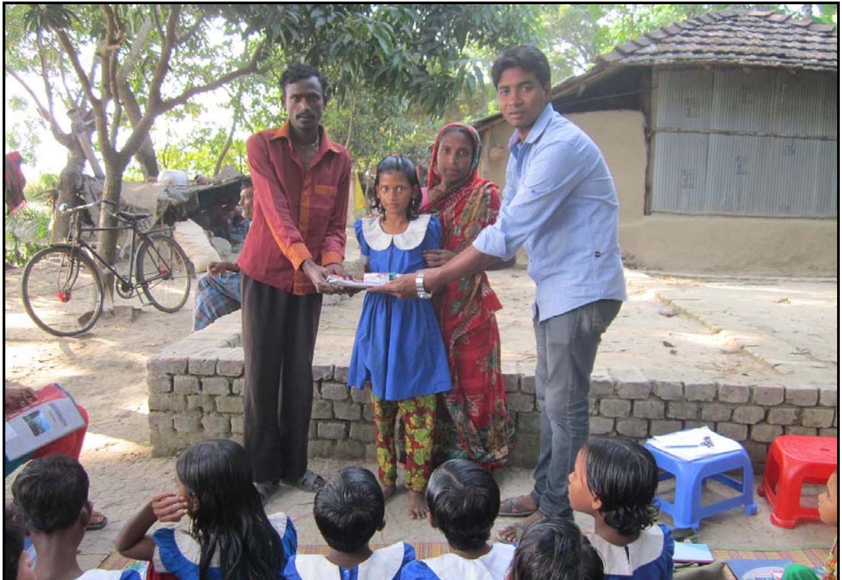
Monthly Distribution Programme: Sorupdaho students receiving materials...