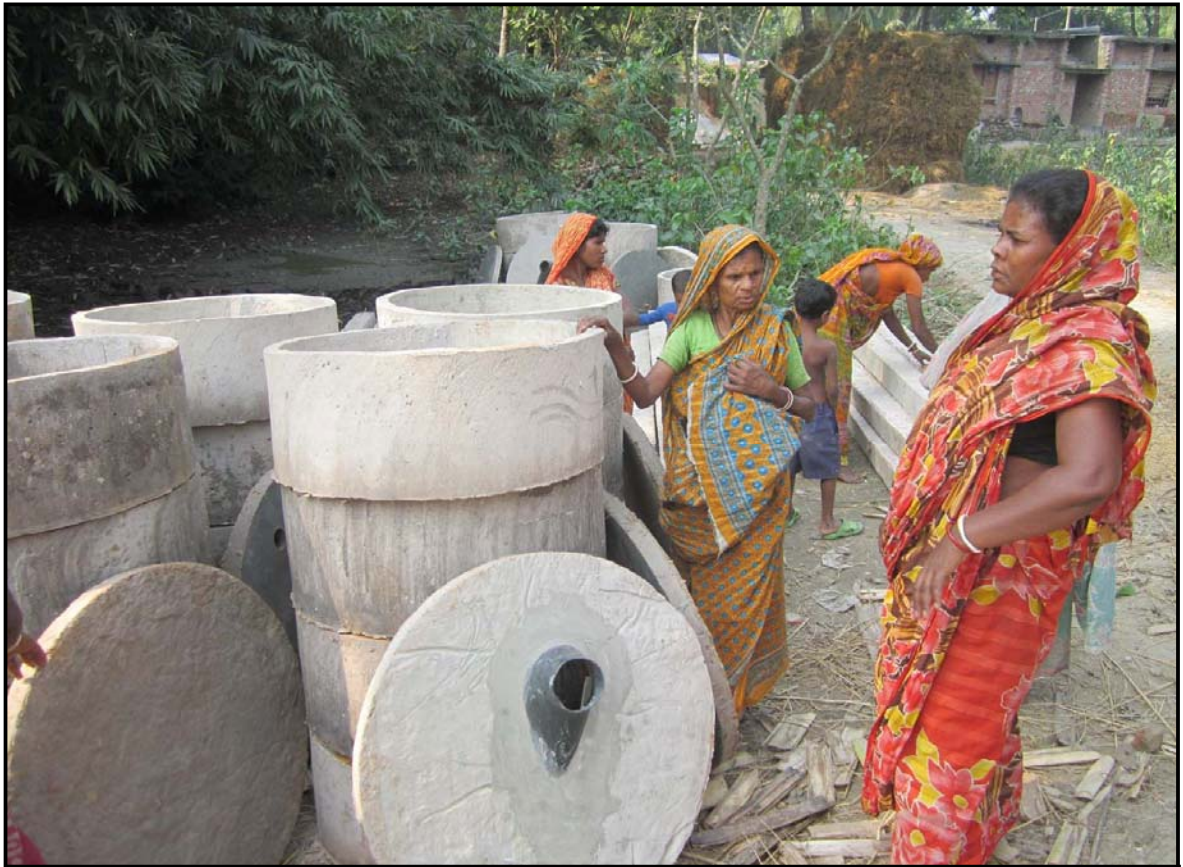
House Construction: Family members receiving house construction materials...