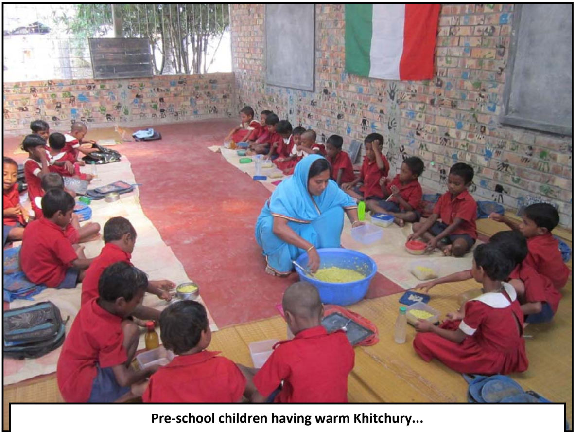
Pre-school children having warm Khitchury...