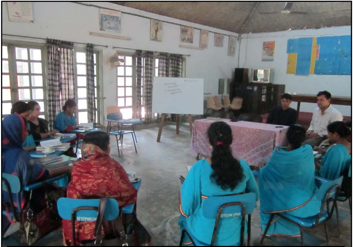
Monthly Teachers Coordination Meeting...