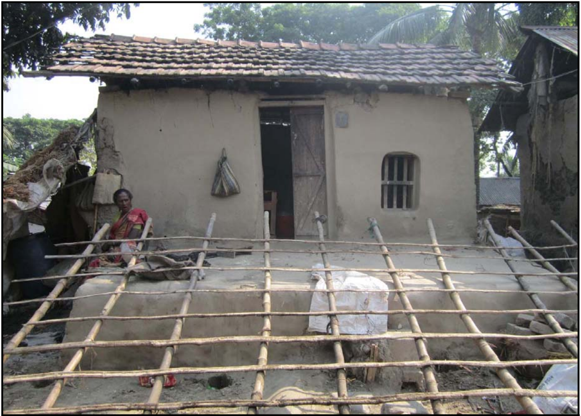
House Construction: Preparation of construction...