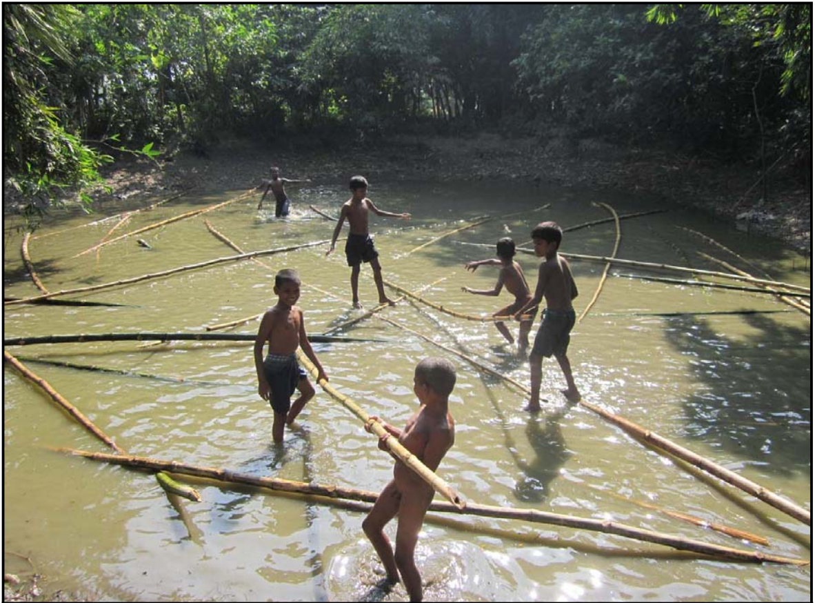
House Construction: Bamboo for roof frame...