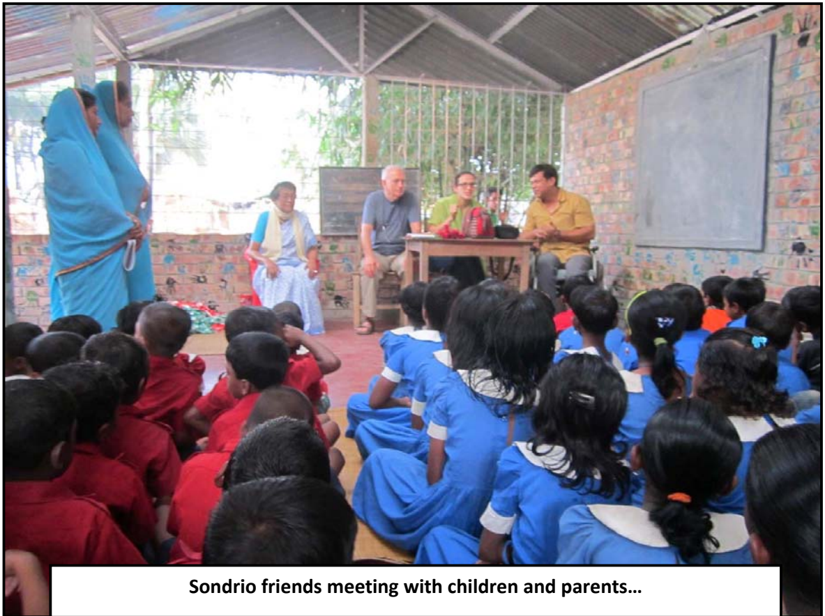
Sondrio friends meeting with children and parents...