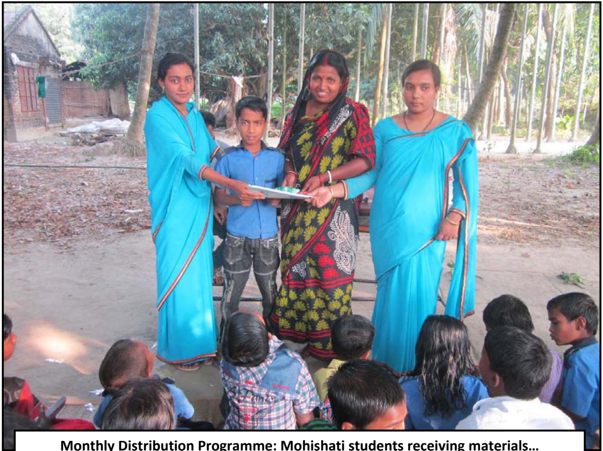
Monthly Distribution Programme: Mohishati students receiving materials...