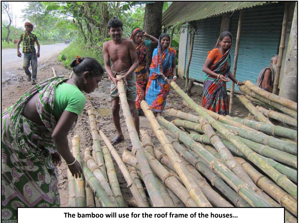
The bamboo will use for the roof frame of the houses...