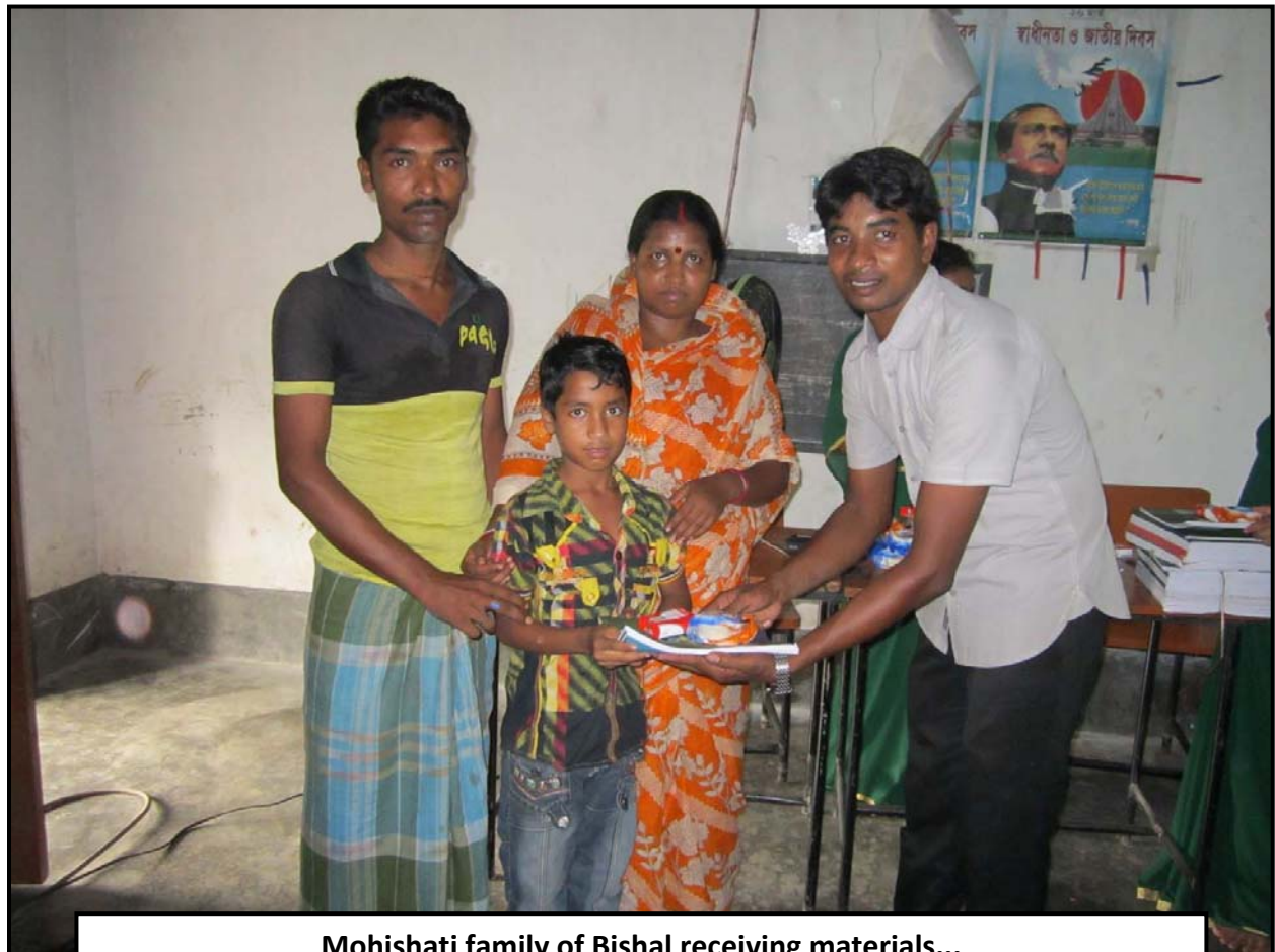
Mohishati family of Bishal receiving materials...