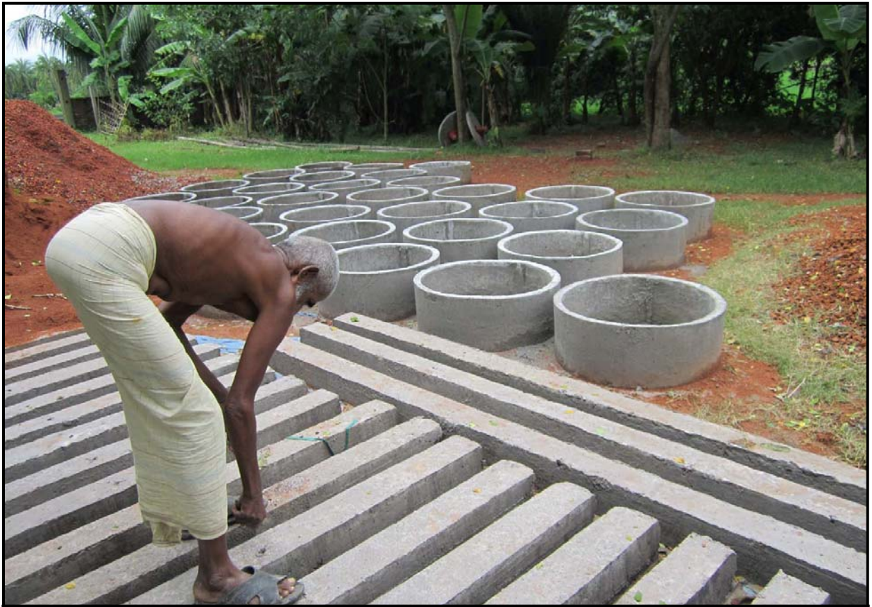
Construction of pillar & toilet rings for houses...