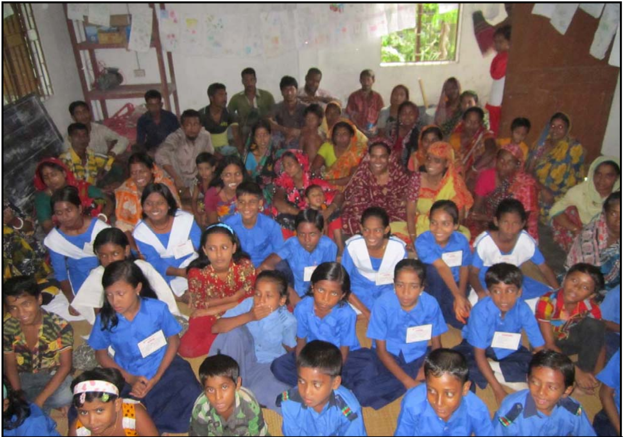
Mohishati students and parents follow-up meeting...