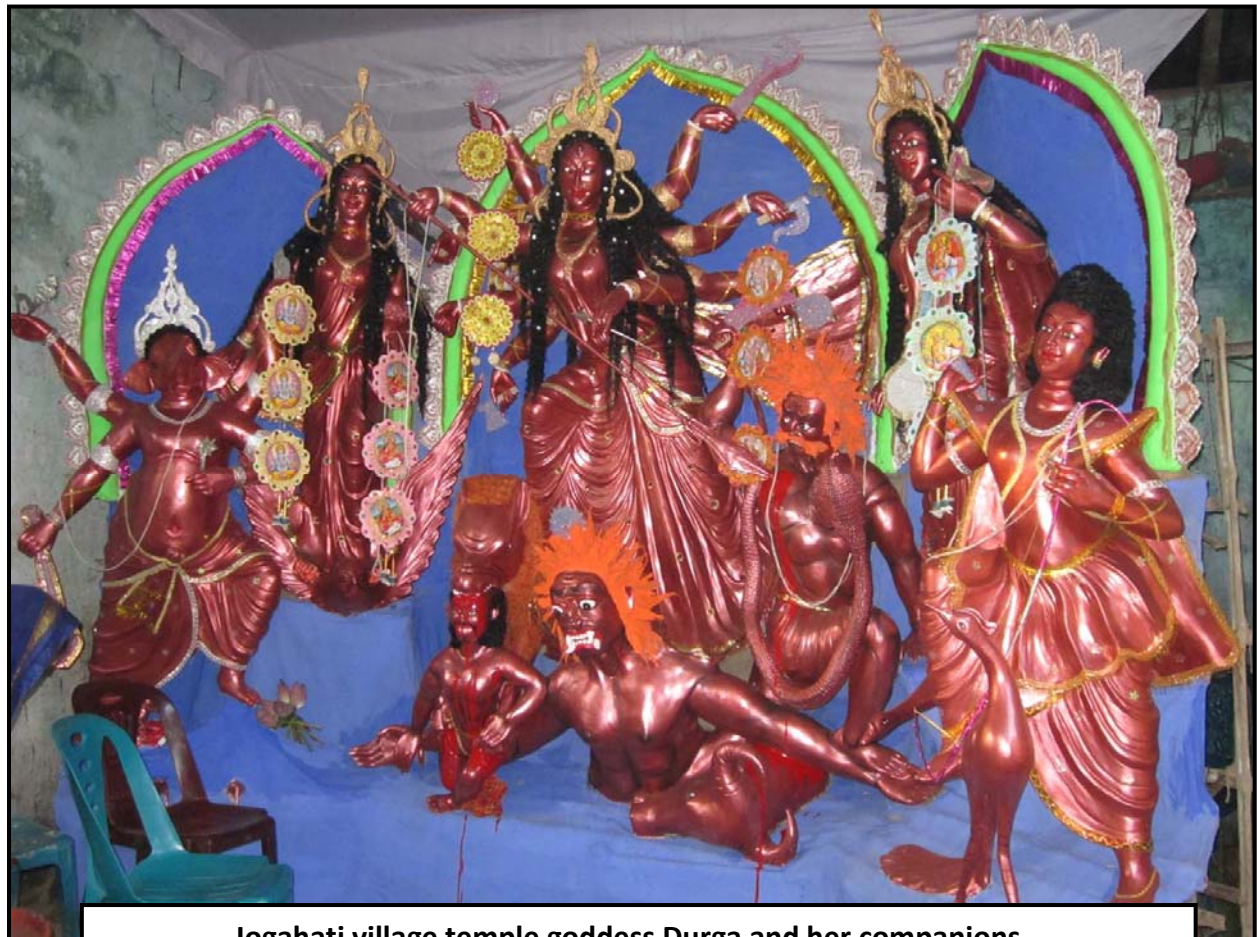
Jogahati village temple goddess Durga and her companions...