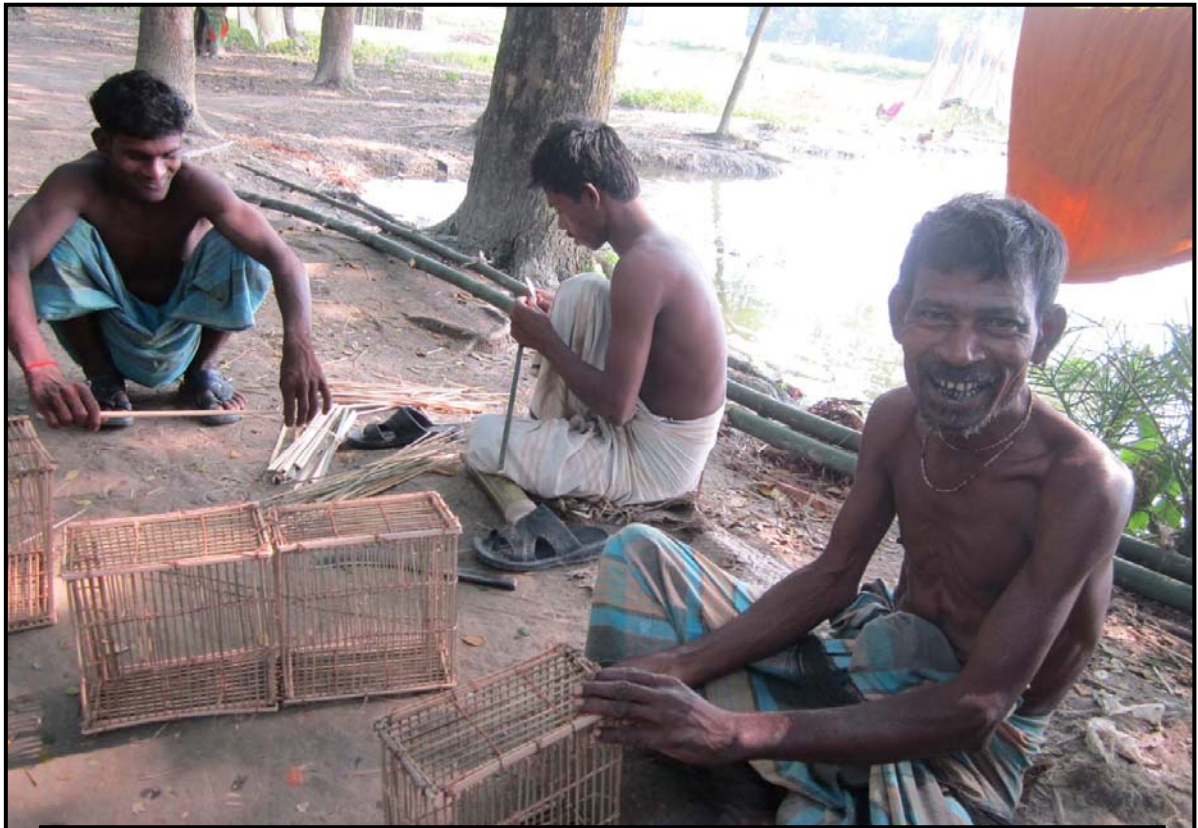
Now the men at Sorupdaho are more active and improving the livelihoods...