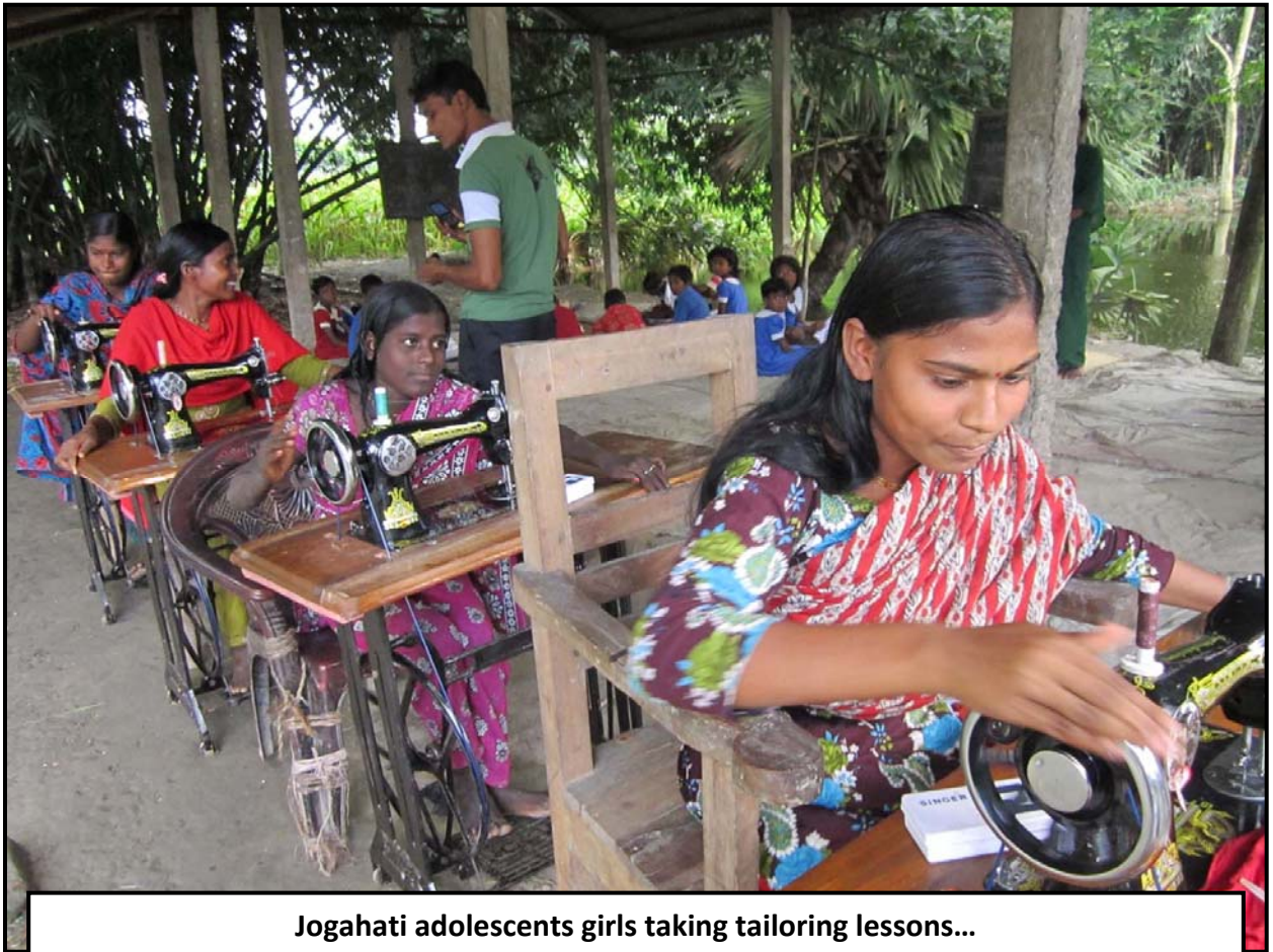
Joghati adolescents girls taking tailoring lessons...