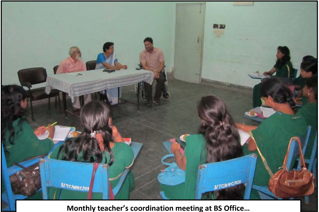
Monthly teacher's coordination meeting at BS Office...