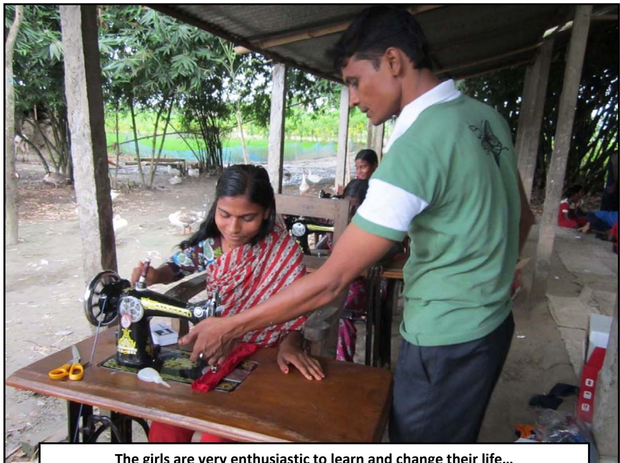
The girls are very enthusiastic to learn and change their life...