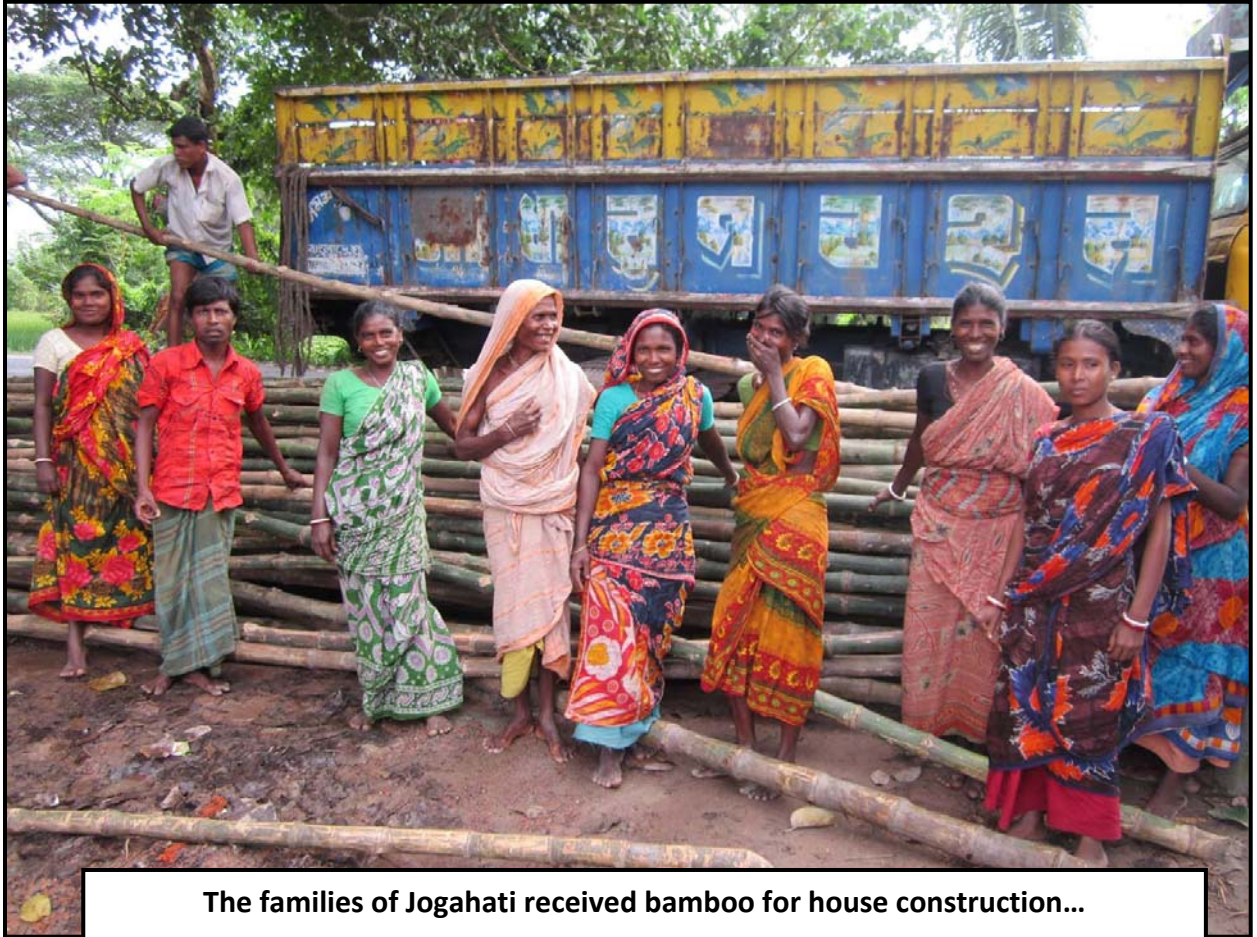
The families of Jogahati received bamboo for house construction...