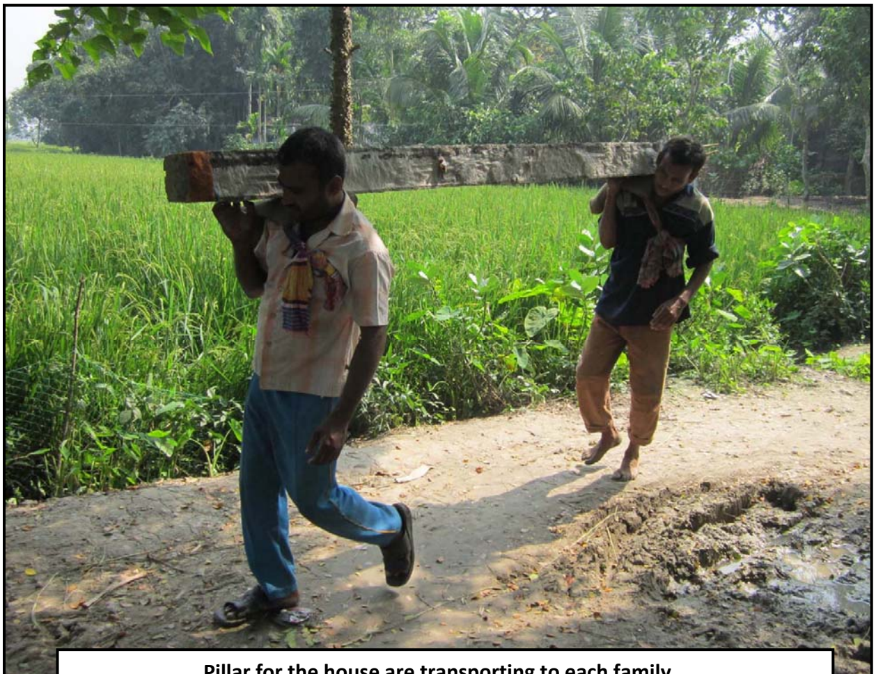
Pillar for the house are transporting to each family...