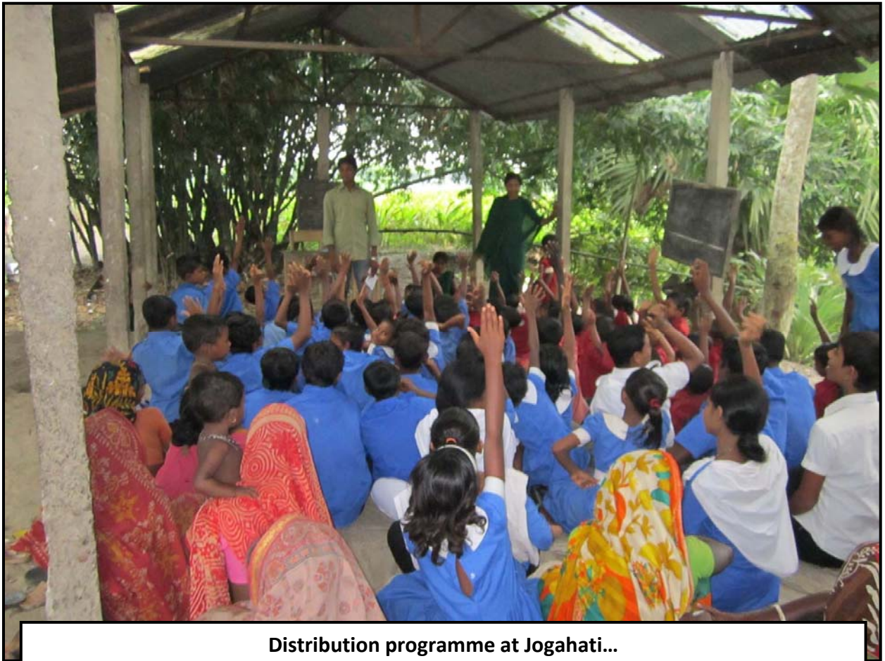
Distribution programme at Jogahati...