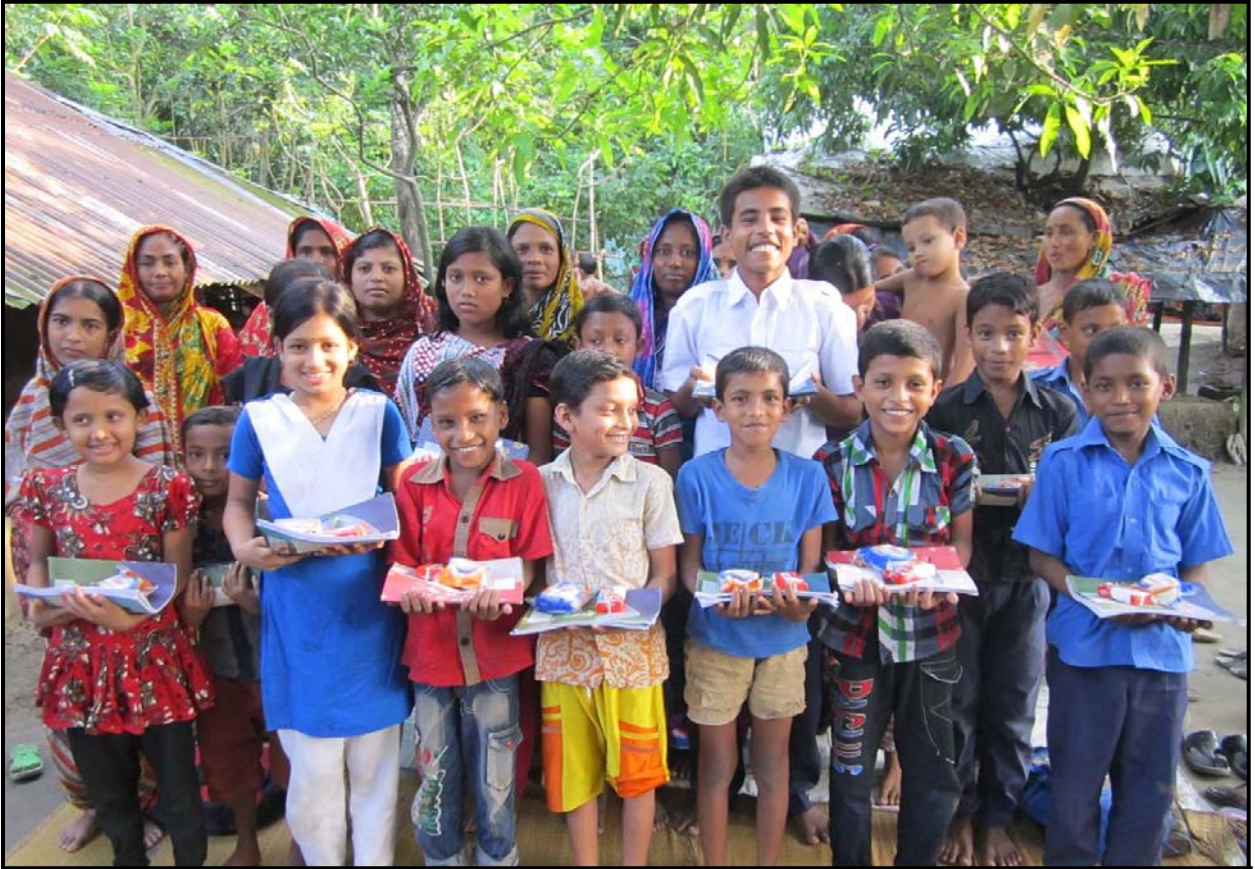
Lolitadaho all children together with the materials...