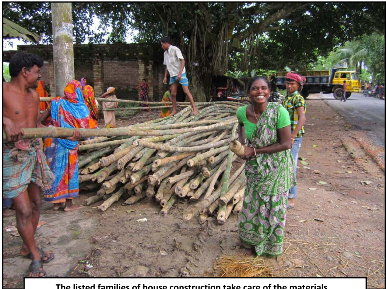
The listed families of house construction take care of the materials...