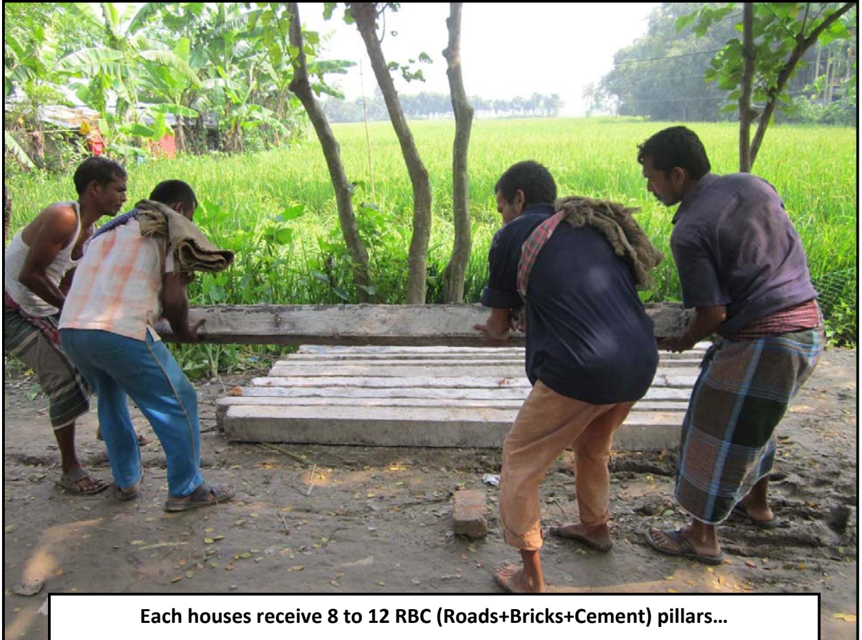
Each houses receive 8 to 12 RBC (Roads+Bricks+Cement) pillars...