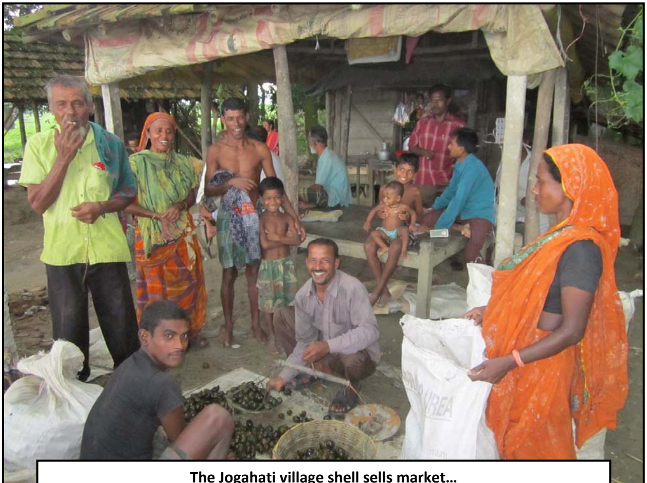
The Jogahati village shell sells market...