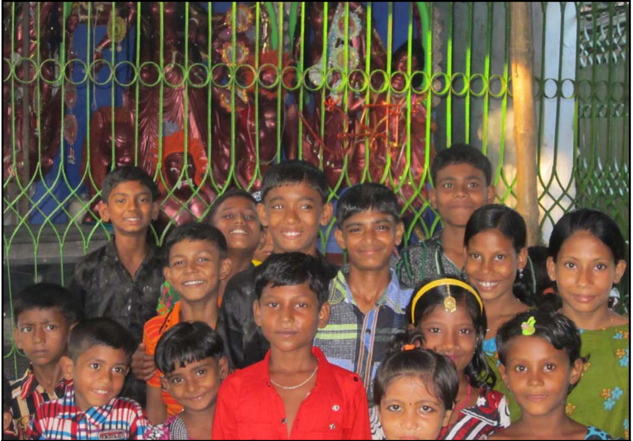
In 10 th to 14 th October children enjoyed the Durga Puja...