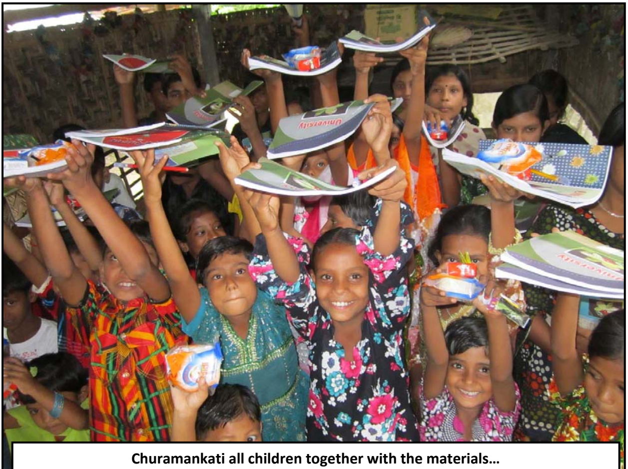
Churamankati all children together with the materials...