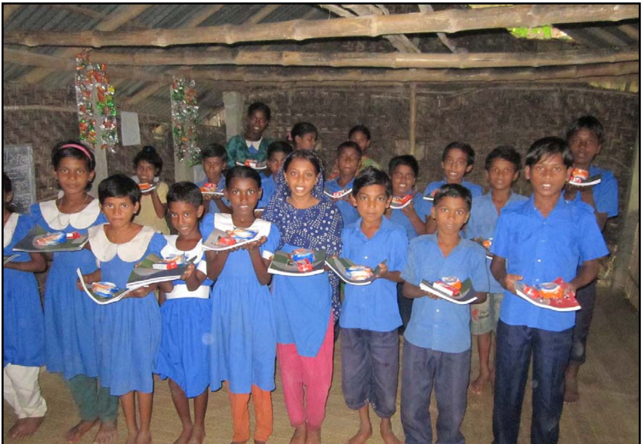
Sorupdaho all children together with the materials...