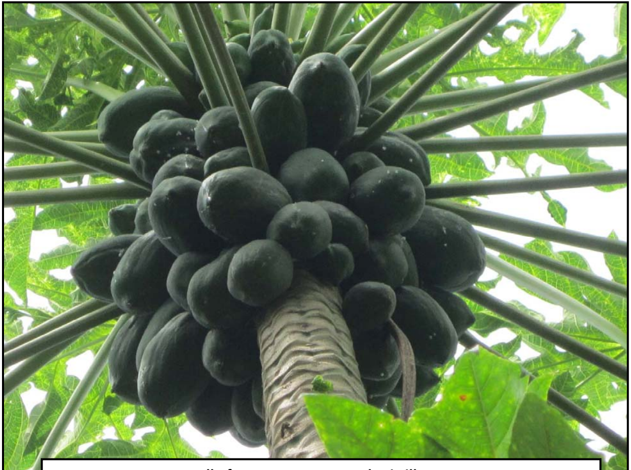
Full of green Papya at Jogahati village...