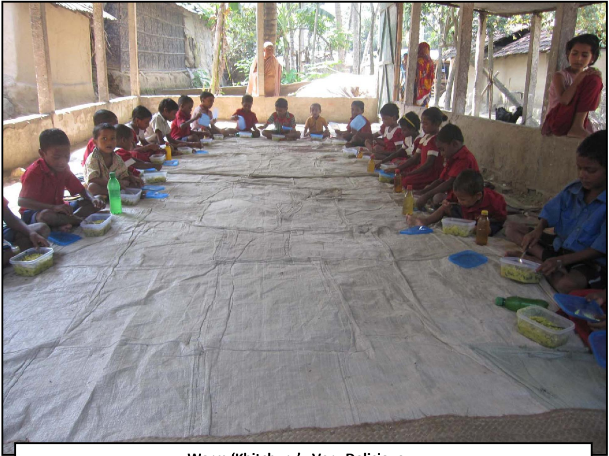
Warm 'Khitchury'...Very Delicious....