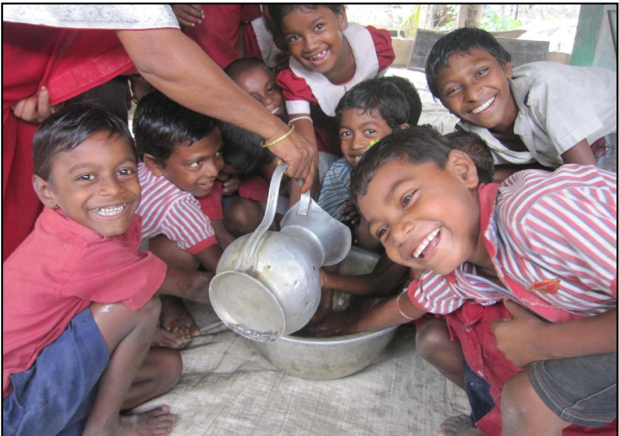
Washing hands before taking 'Khitchury'...