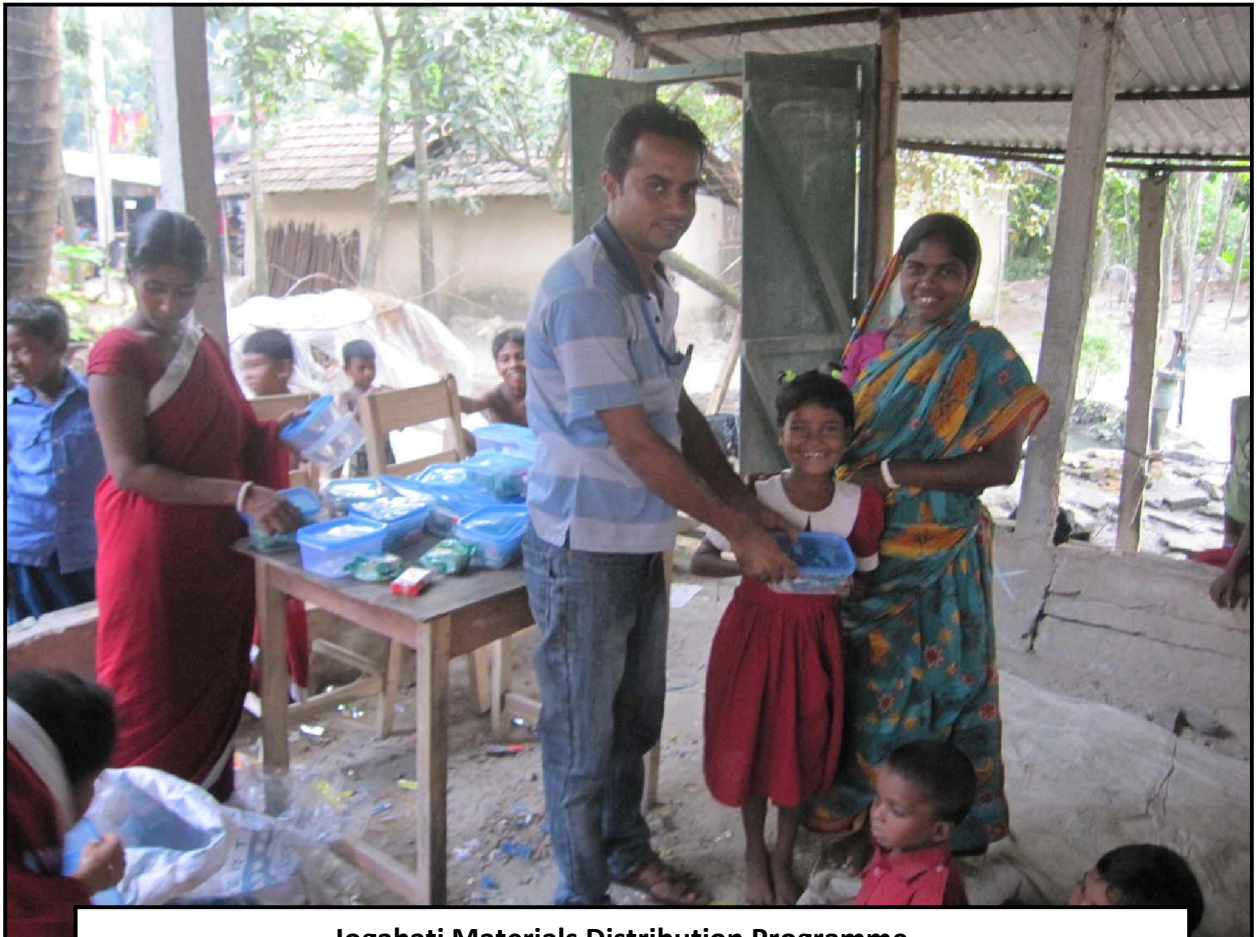
Jogahati Materials Distribution Programme...