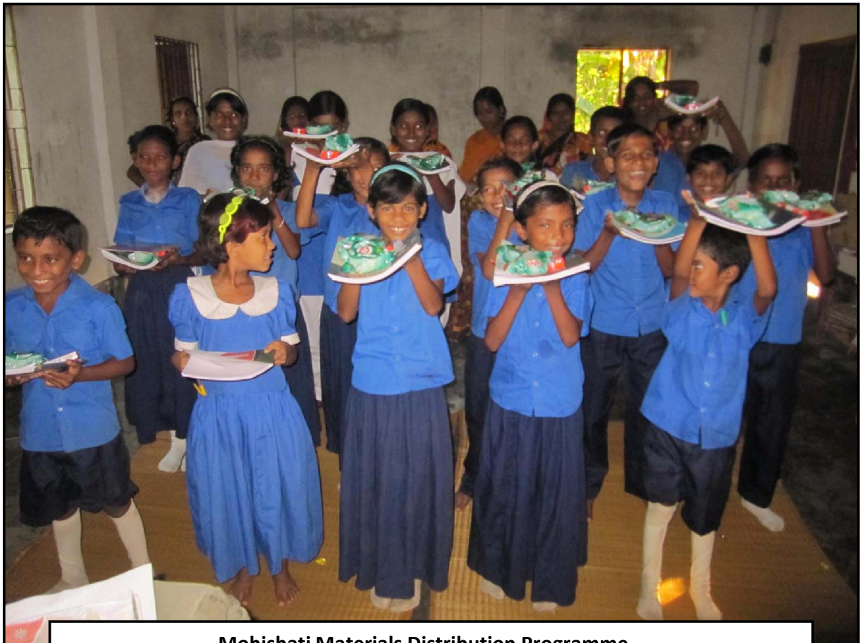
Mohishati Materials Distribution Programme...