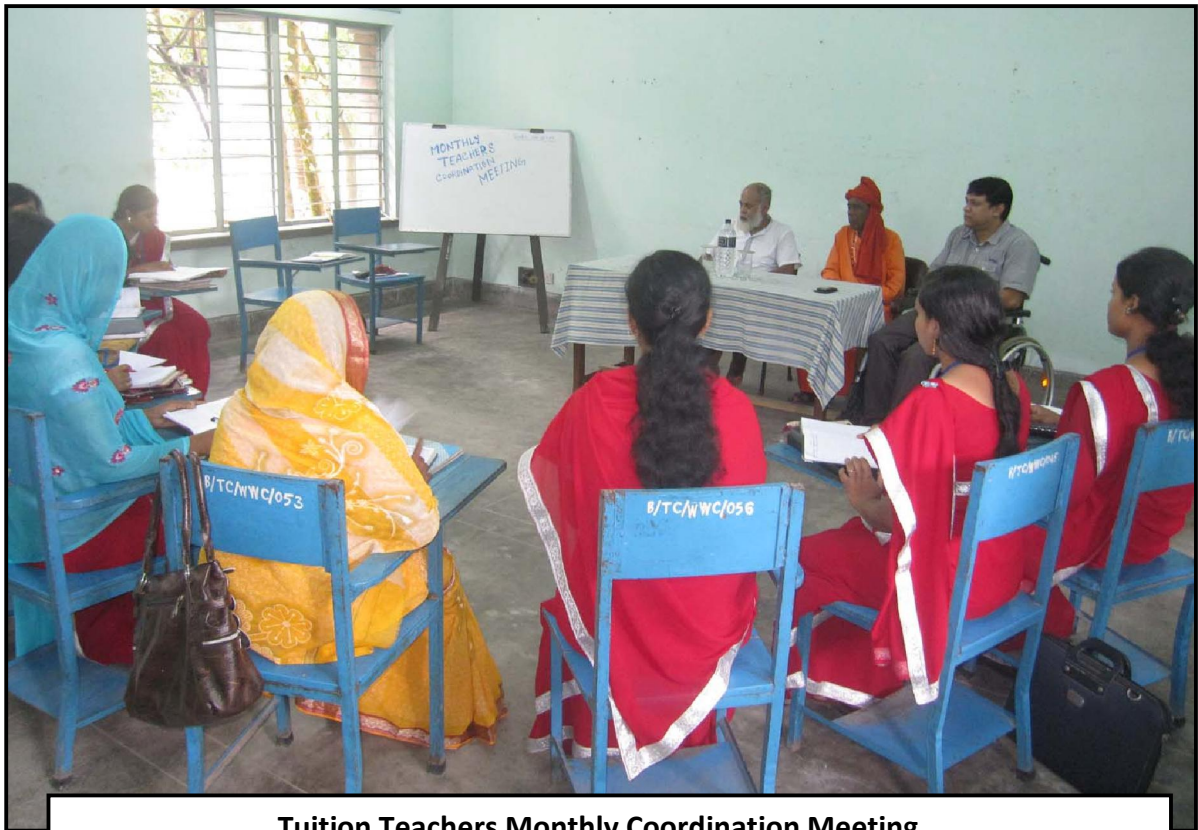
Tuition Teachers Monthly Coordination Meeting...