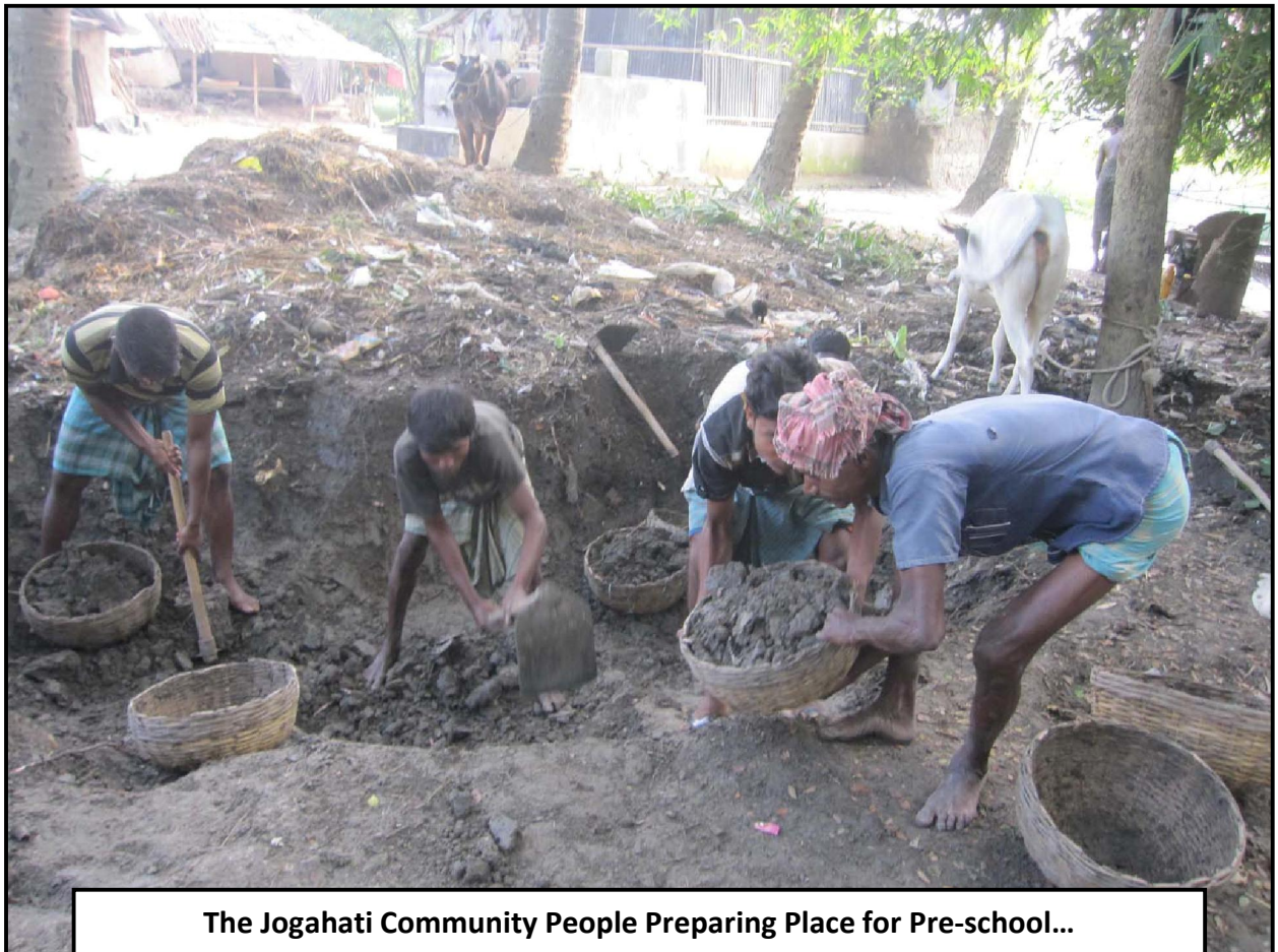
The Jogahati Community People Preparing Place for Pre-school...