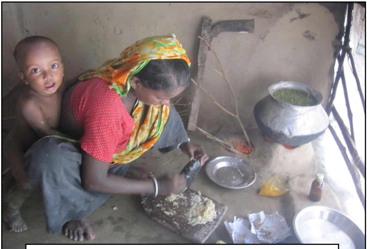
One of Mom Preparing 'Khithury' for the Pre-school Students...