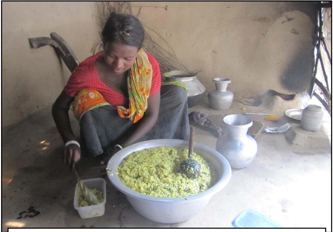
Preparing 'Khitchury' for the Pre-school Students...