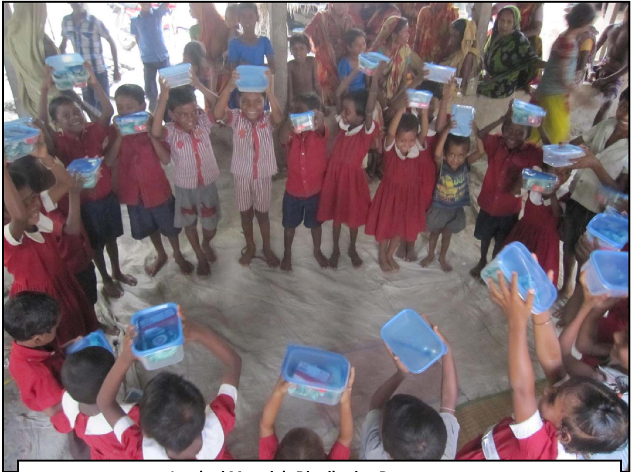
Jogahati Materials Distribution Programme...