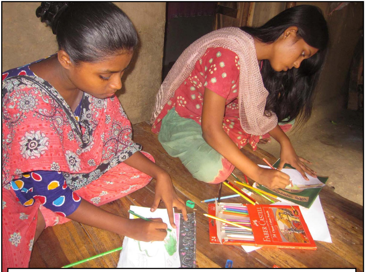
Karuna (BS0098) and Boishakhi (BS0099) Participating in Art Competition too...