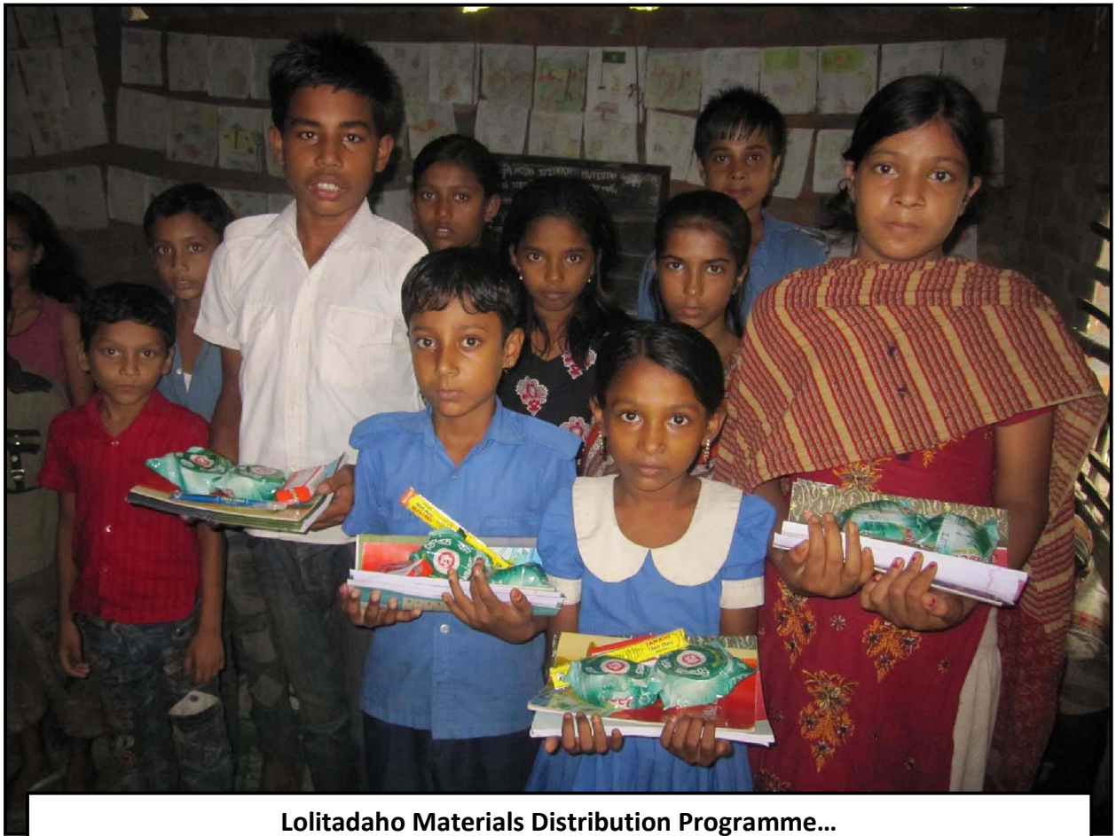
Lolitadaho Materials Distribution Programme...