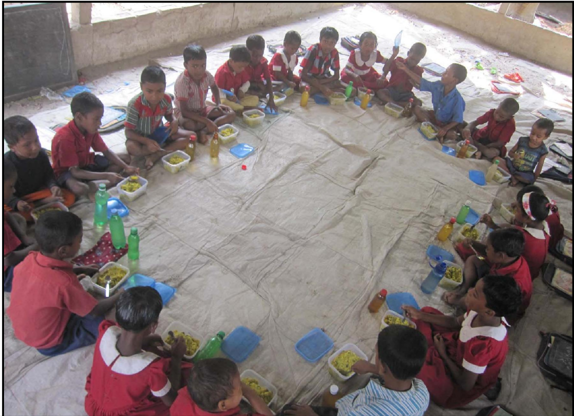
Enjoying 'Khitchury' Meal...