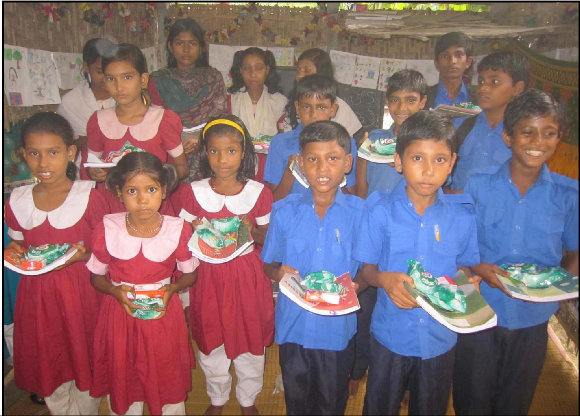
Churamankati Materials Distribution Programme...