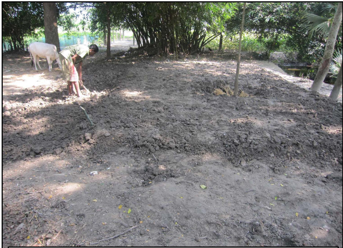
The Jogahati Community People Preparing Place for Pre-school...