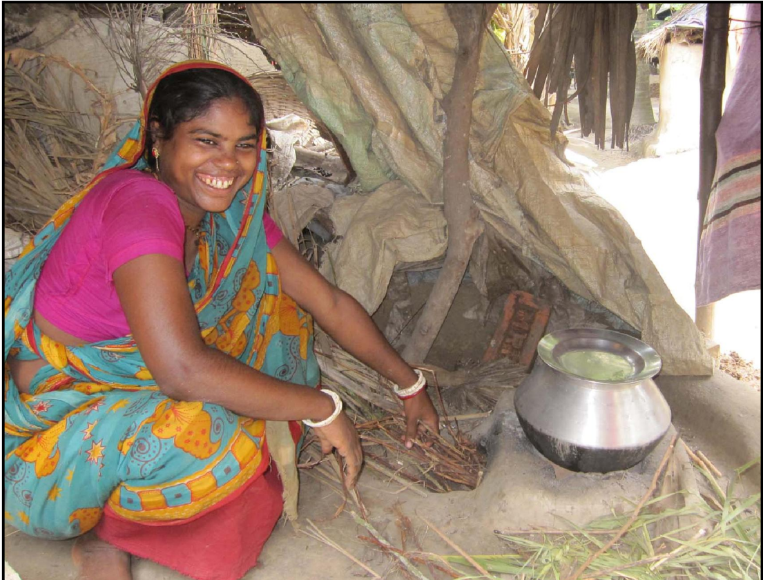
One of Mom Cooking 'Khithury' for the Pre-school Students...