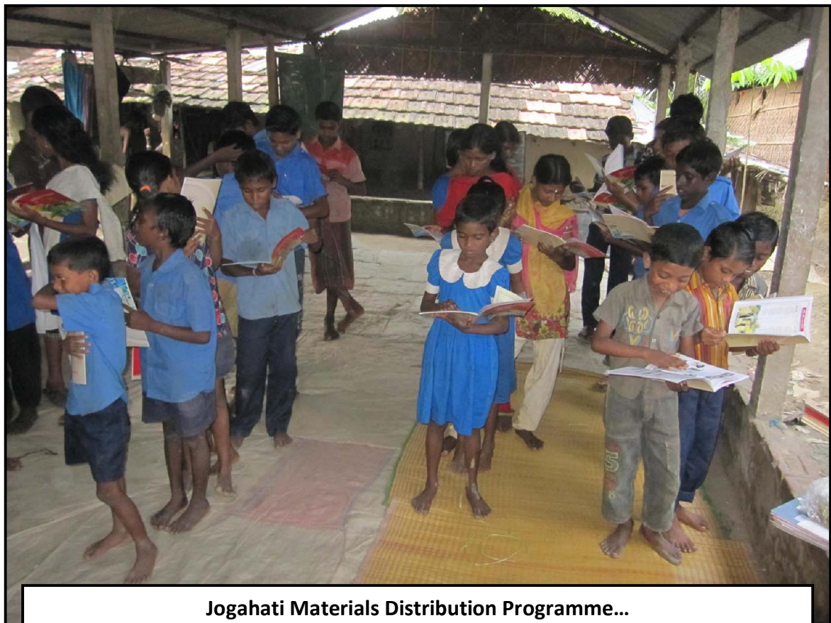
Jogahati Materials Distribution Programme...