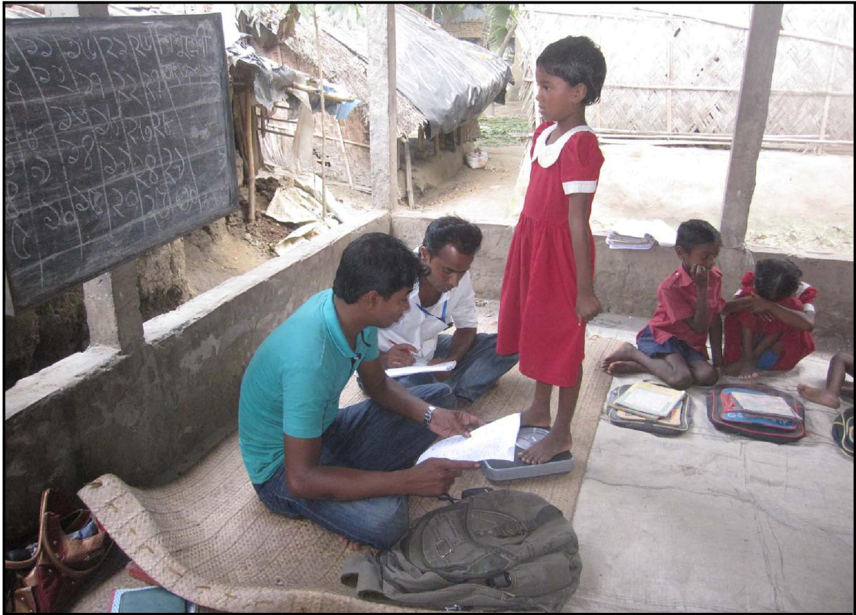
Measuring Weight for Pre-school Students...