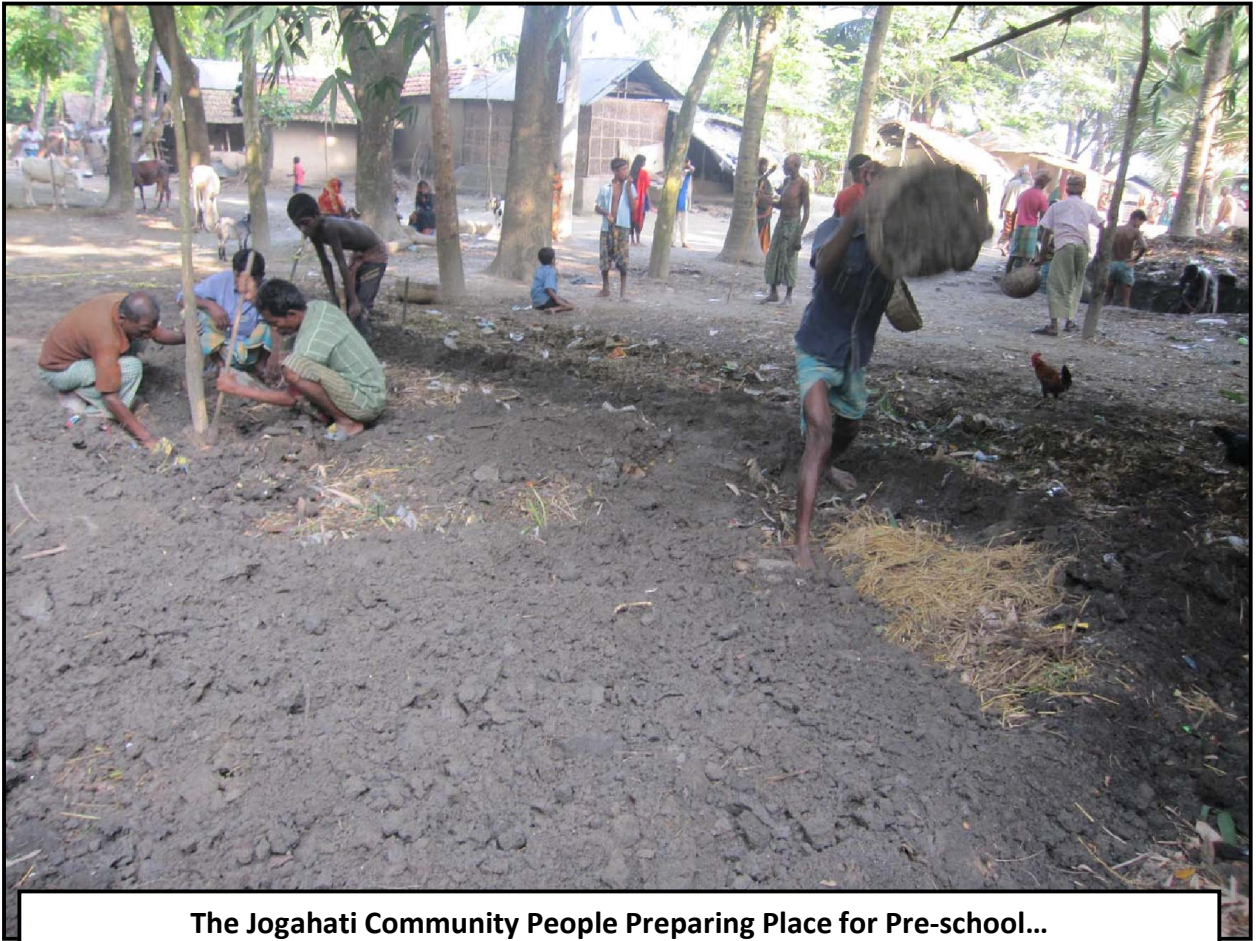
The Jogahati Community People Preparing Place for Pre-school...