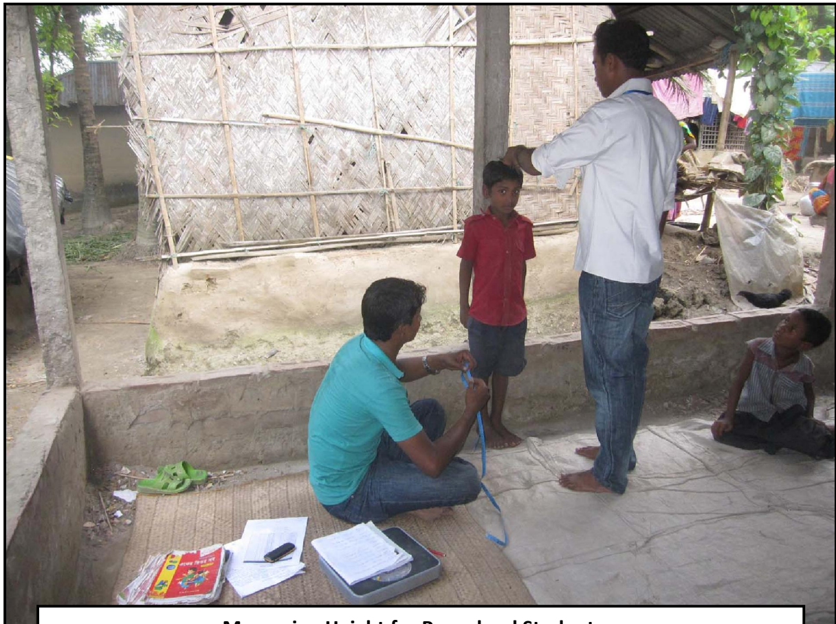
Measuring Height for Pre-school Students...