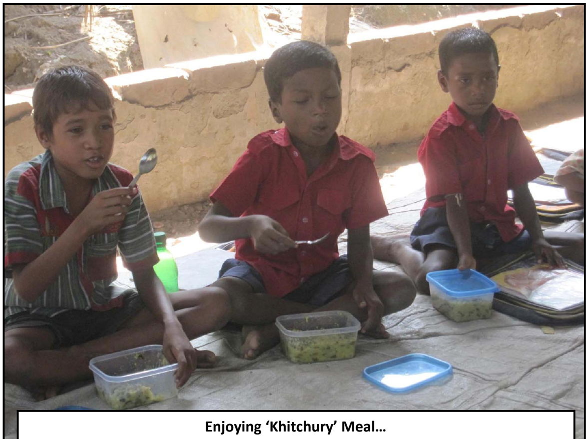
Enjoying 'Khitchury' Meal...