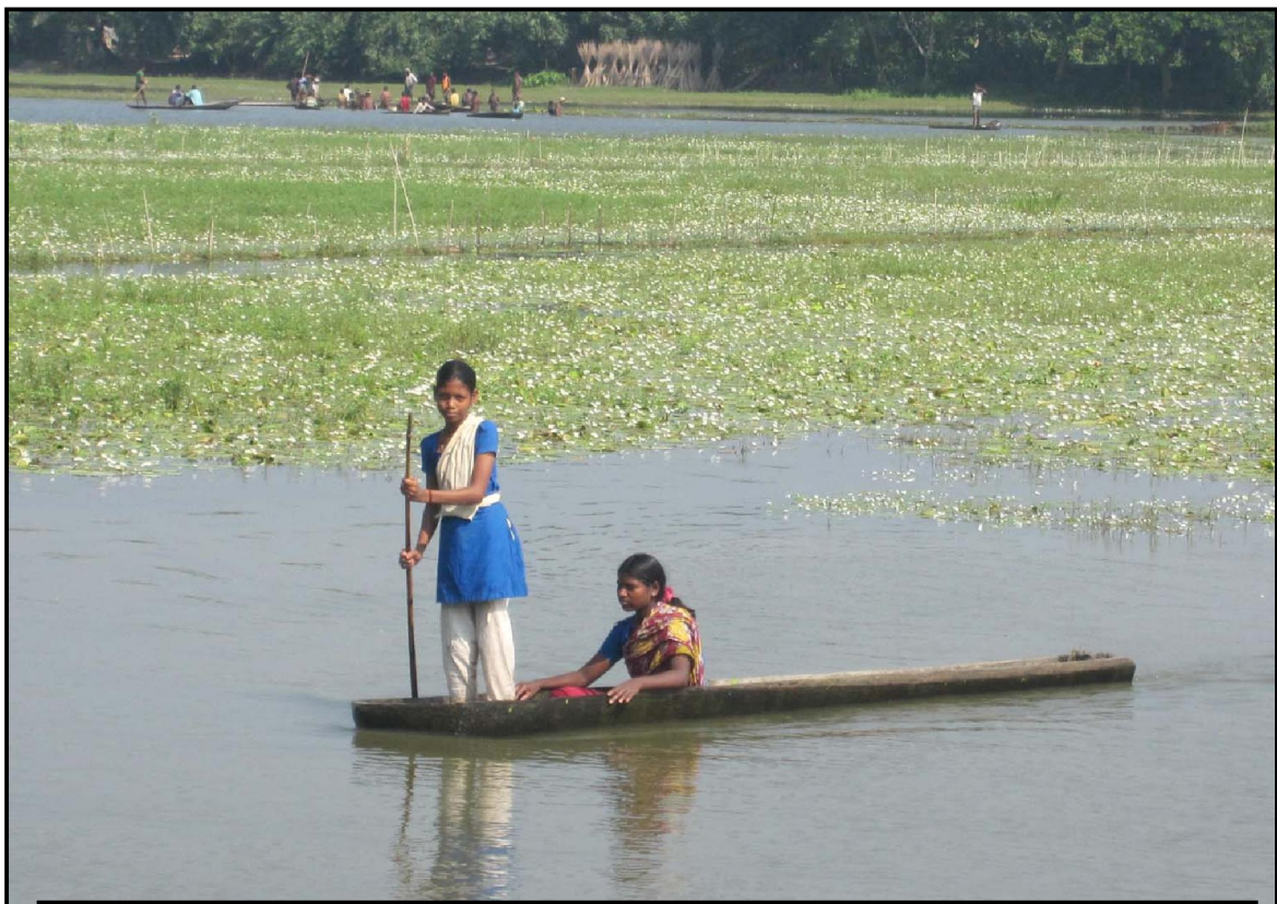
Jogahati Children Boating at Leisure Time...