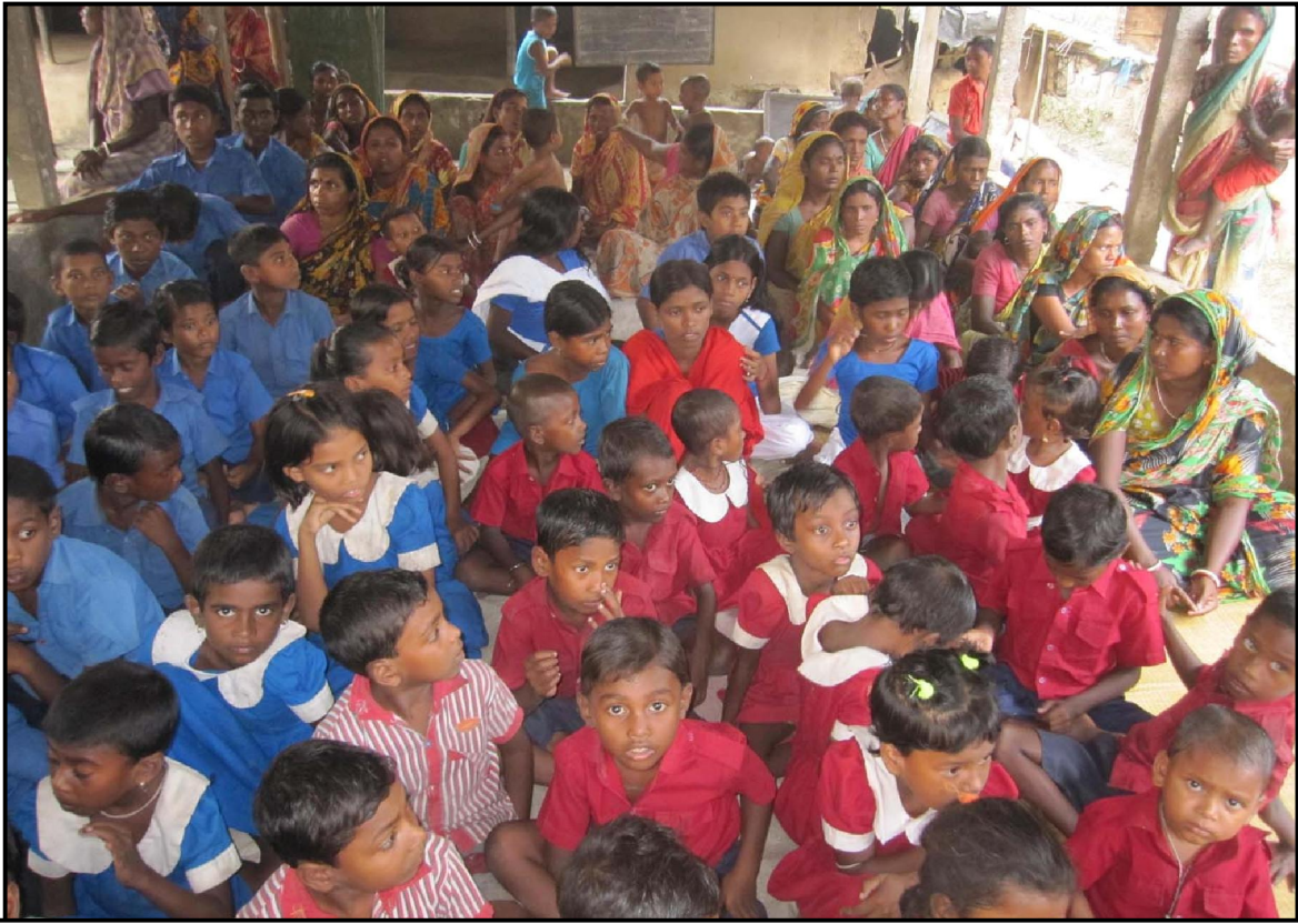
Jogahati Materials Distribution Programme...