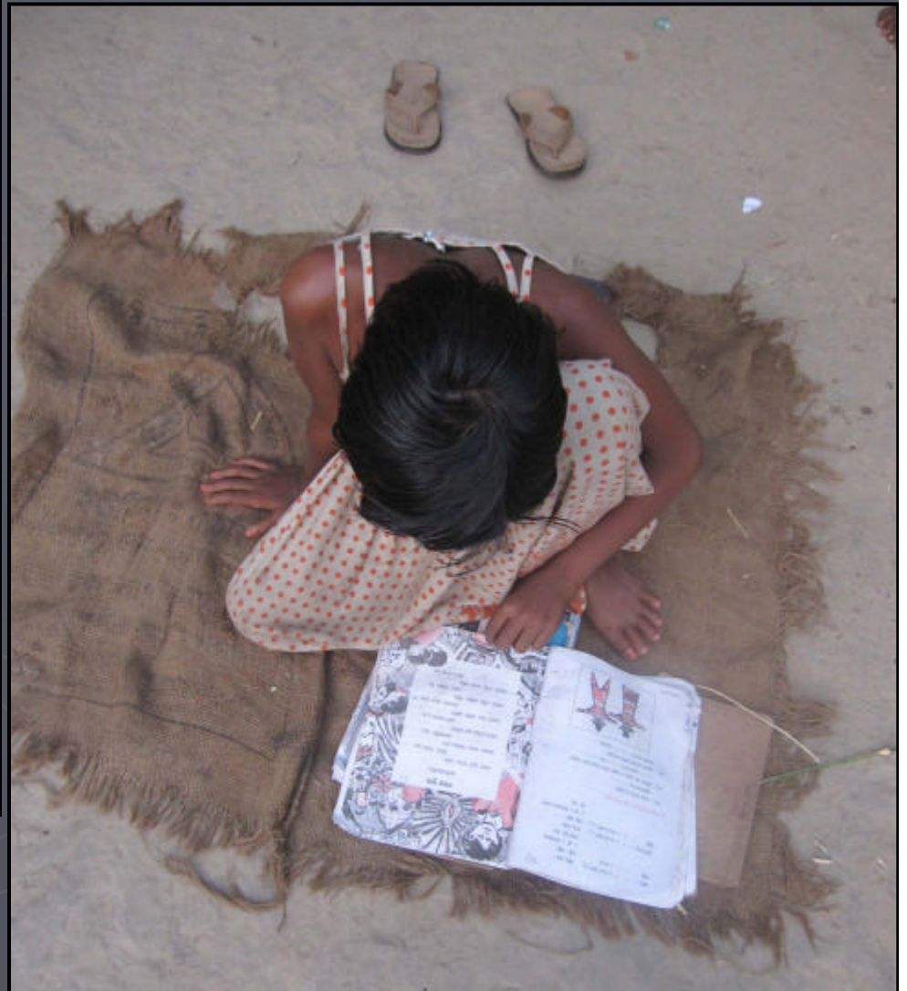
After school study at home...