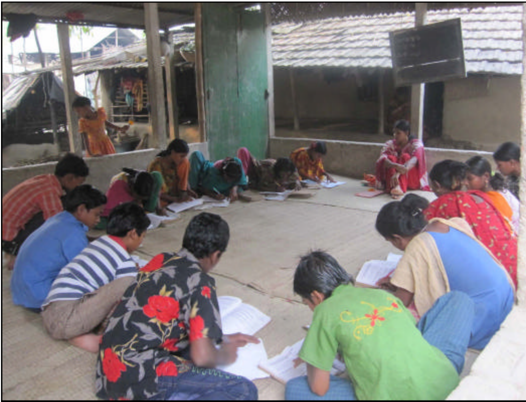
Tuition Programme at Jogahati...Total 51 students receive the quality education support in 4-batch...