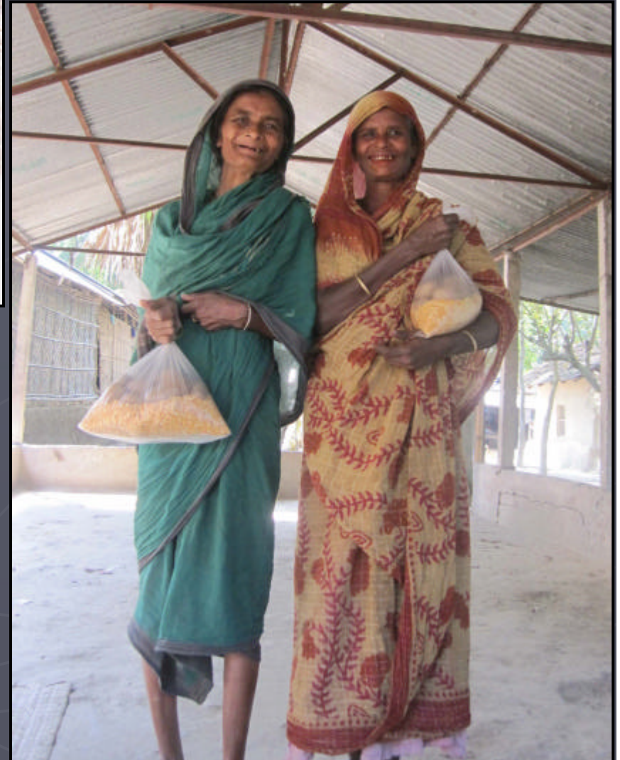
After distribution Dhal and Potato has saved...The extra materials distributed to the two widow women...