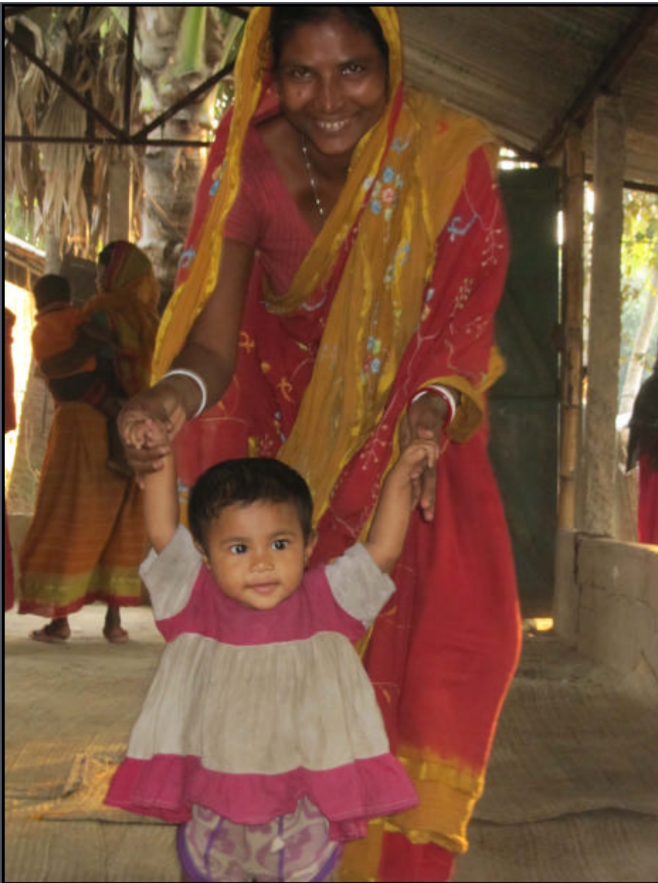
The new beginning...