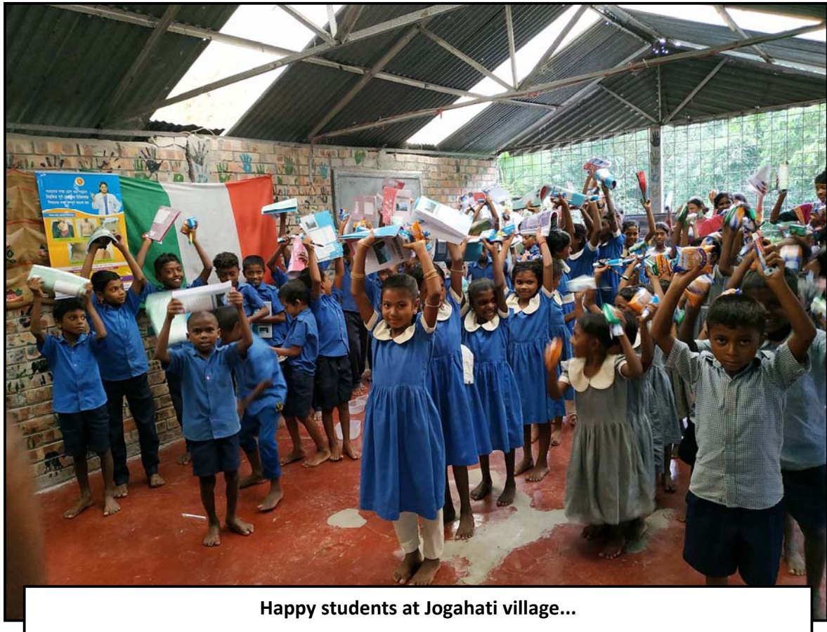
Happy students at Jogahati village...