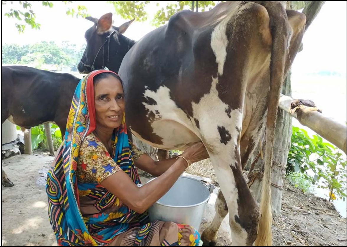
A family of Sorupdaho village changing life through cow rearing...