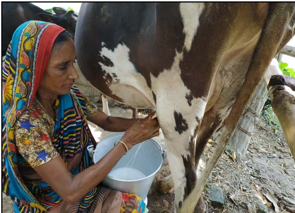
She sell the milk and use for family needs...