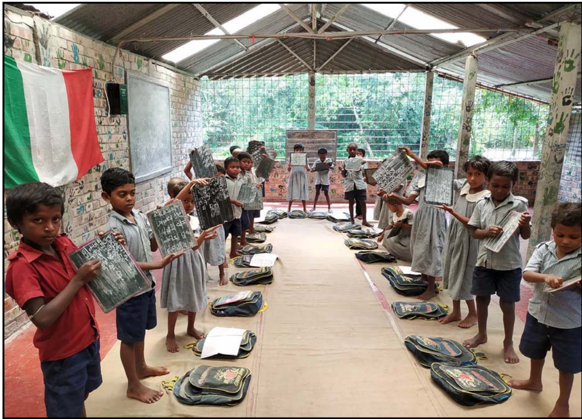
Pre-school students in class....