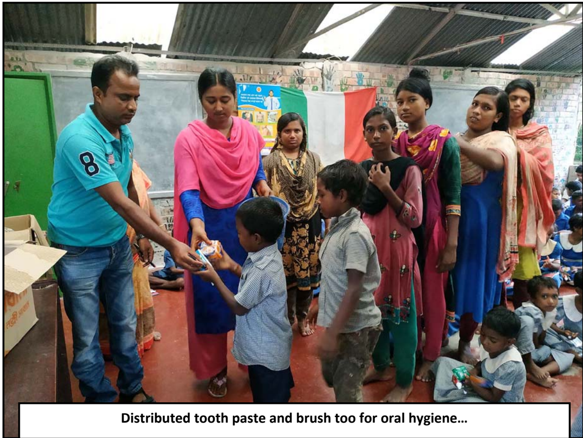
Distributed tooth paste and brush too for oral hygiene...