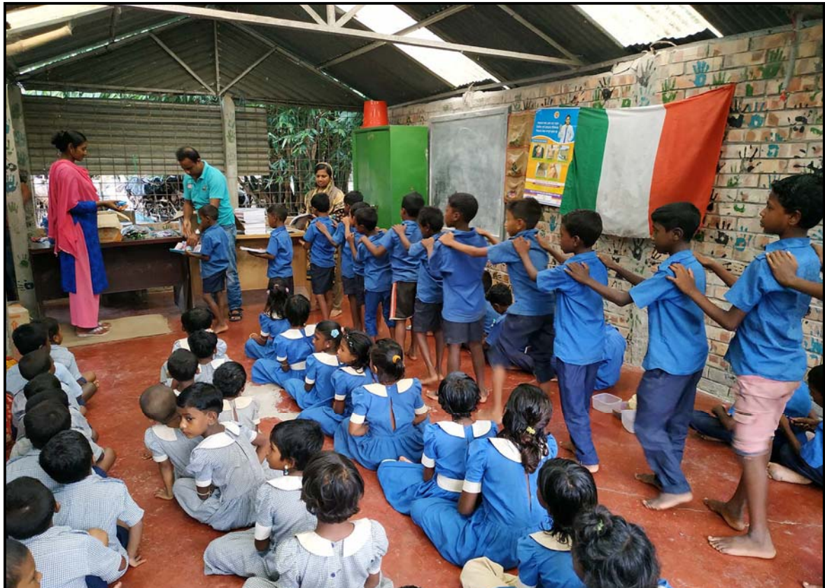
Materials distribution at Jogahati village...