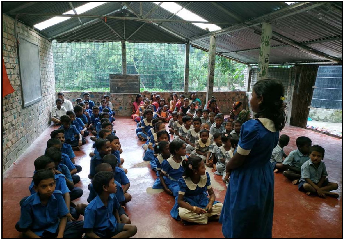
Monthly students parents meeting at Jogahati Village...