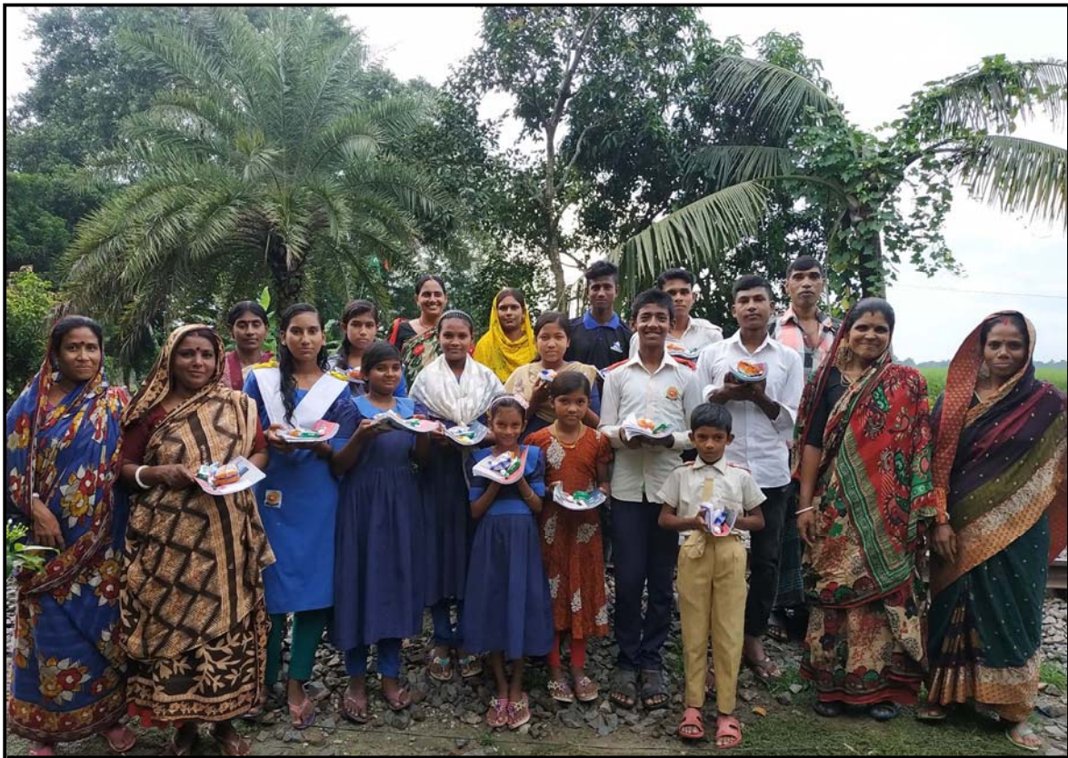
With the materials, happy students at Churamankati village...