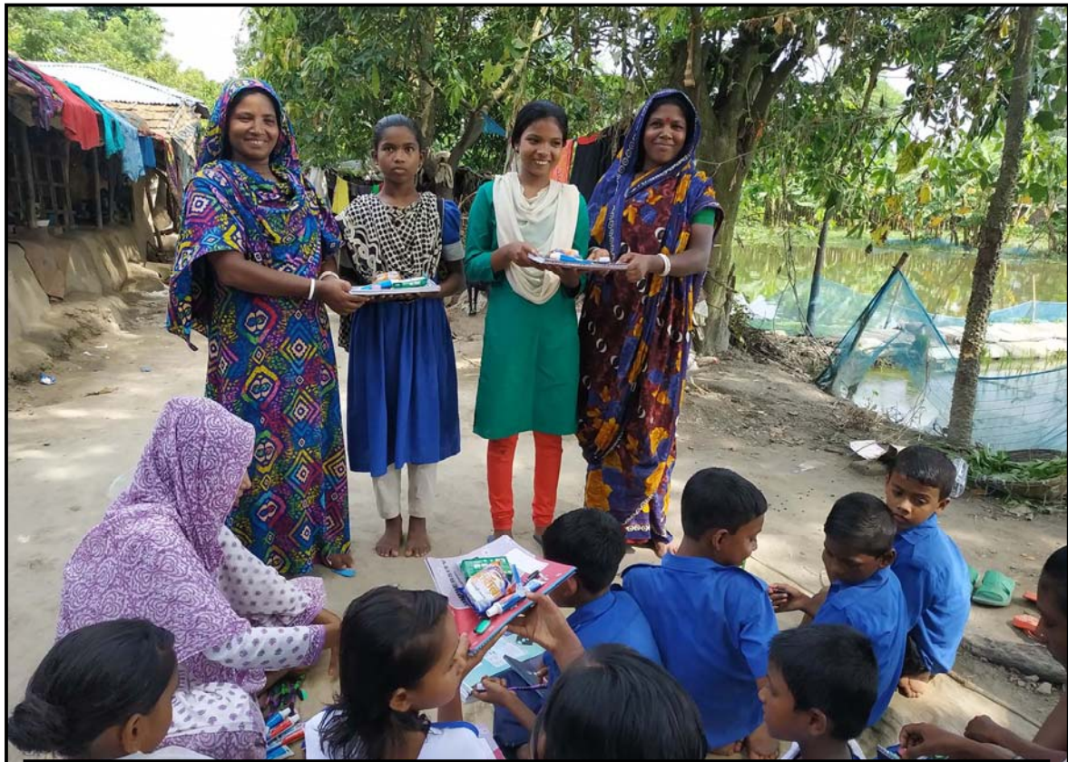
Materials distribution programme at Sorupdaho village...