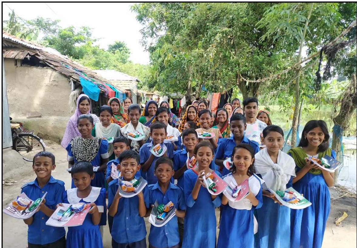
Happy students with materials at Sorupdaho village...