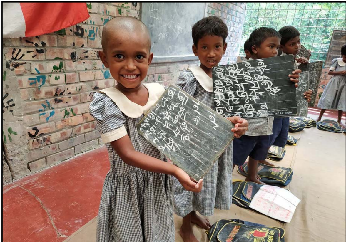
Pre-school students started to learn alphabets...