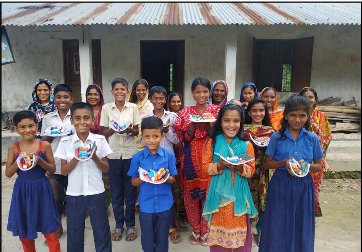
Students with the materials at Mohishati village...