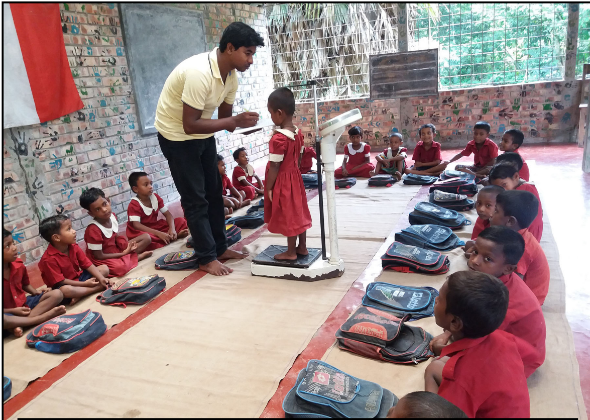
Every month we monitor the pre-school student weights & heights...