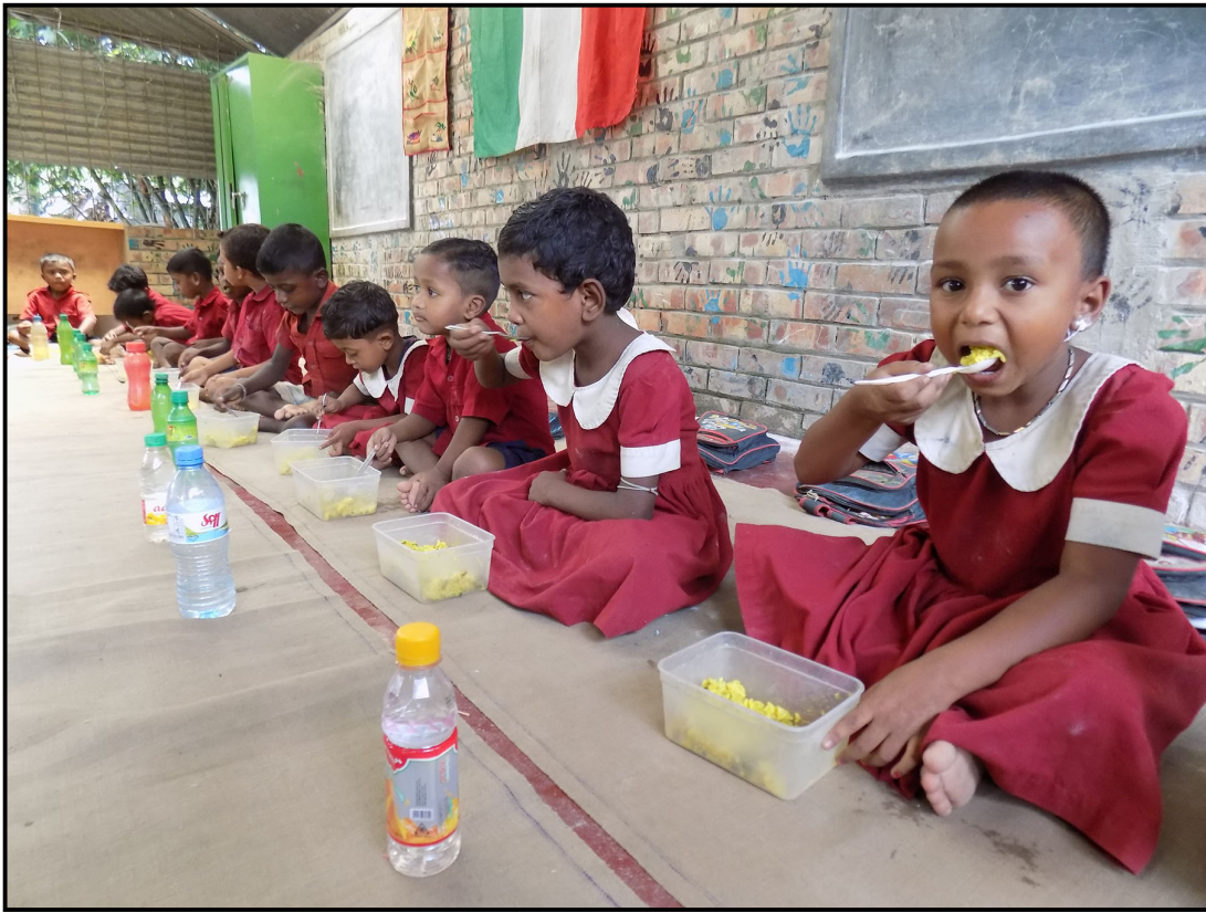
Children enjoy the everyday school meal...