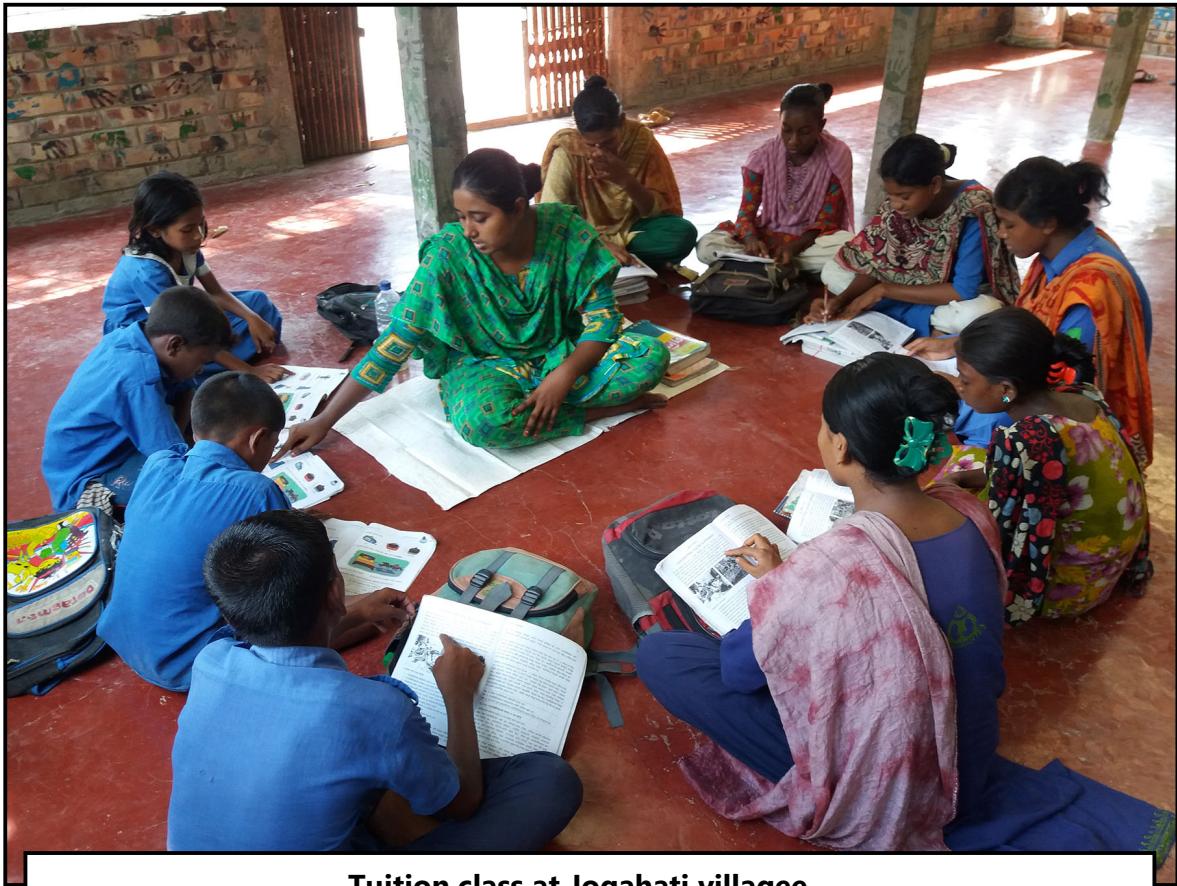
Tuition class at Jogahati villagee...