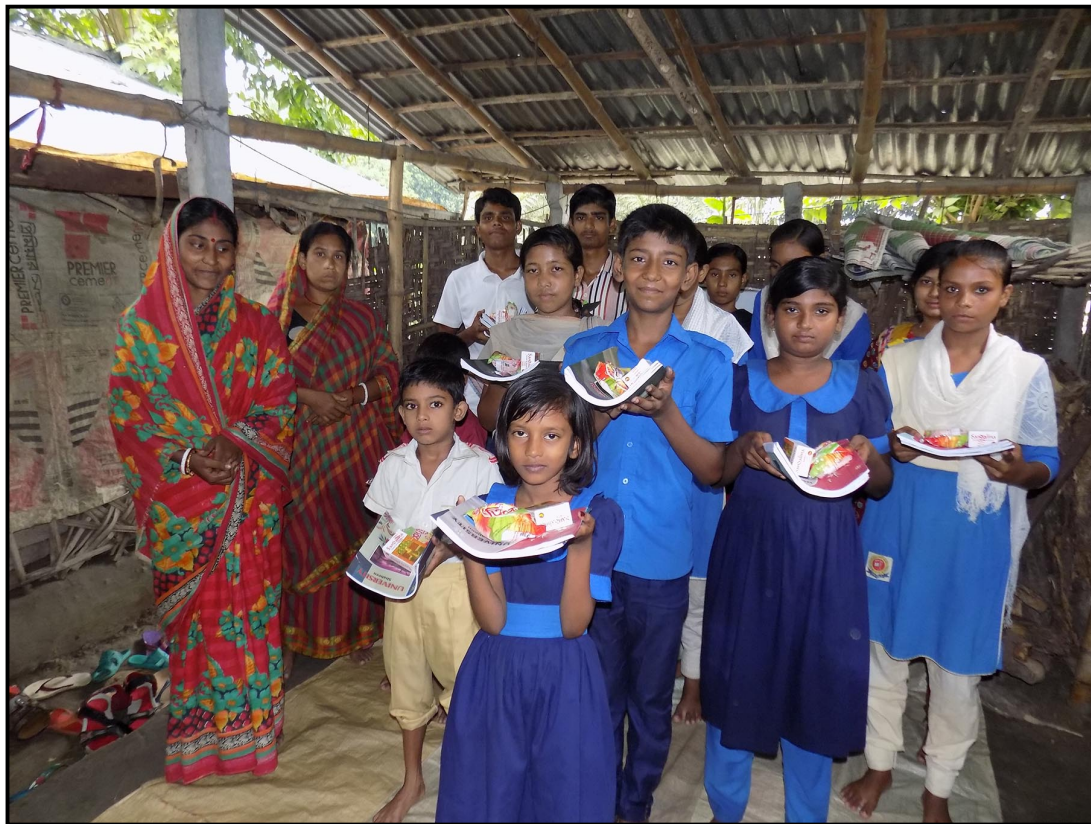
Students with the materials at Churamankati village...