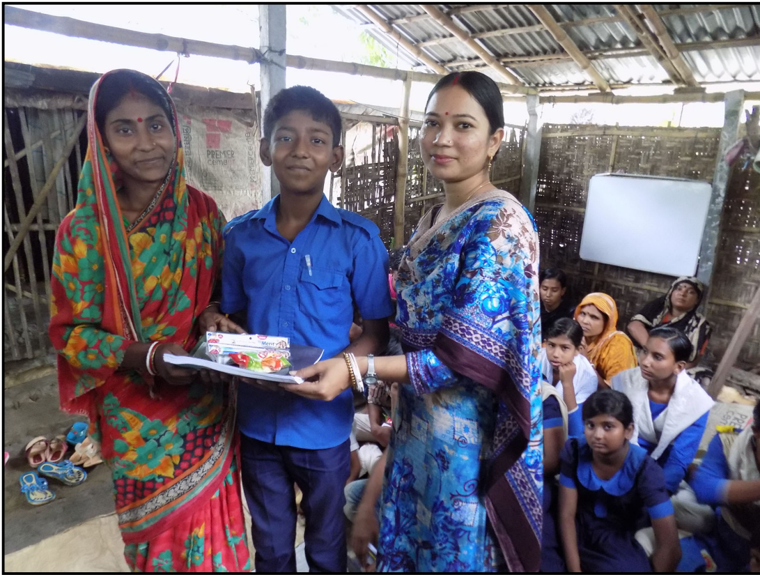
Happy students with the materials at Churamankati...