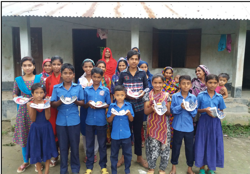
Happy students with the materials at Mohishati village...