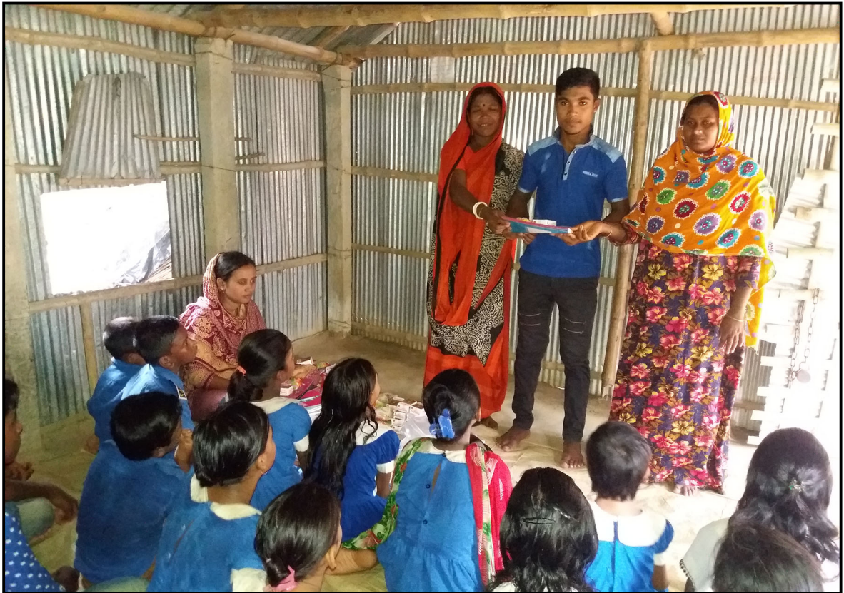
Education materials distribution at Sorupdaho...