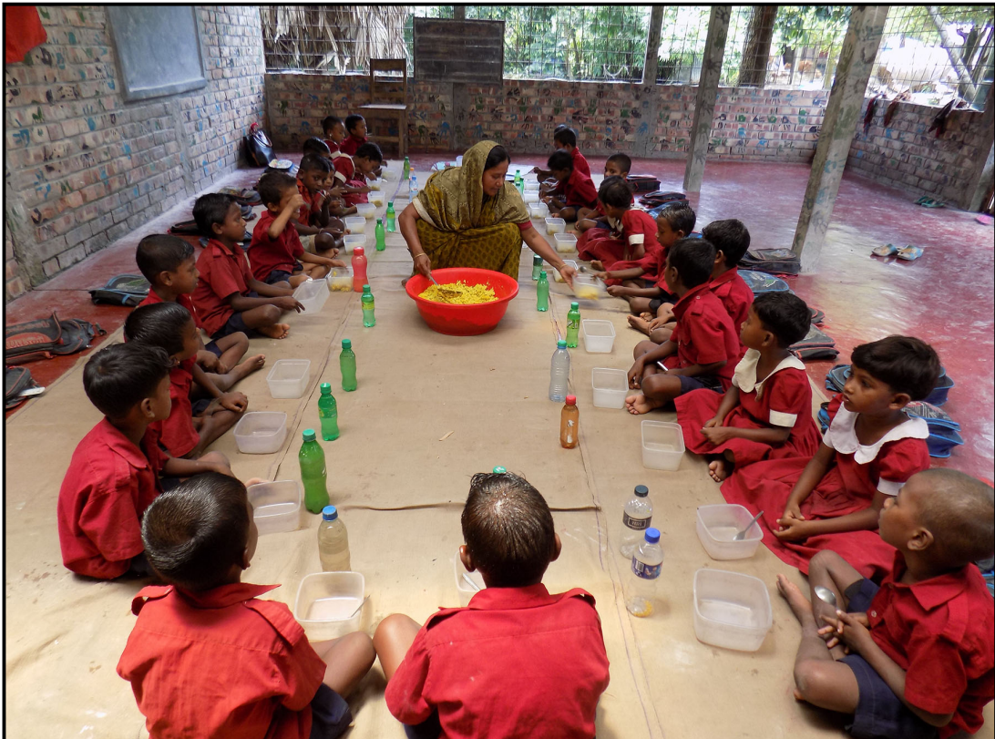
The school meal help students for their growth and daily nutrition...