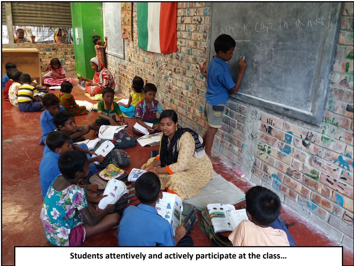
Students attentively and actively participate at the class...