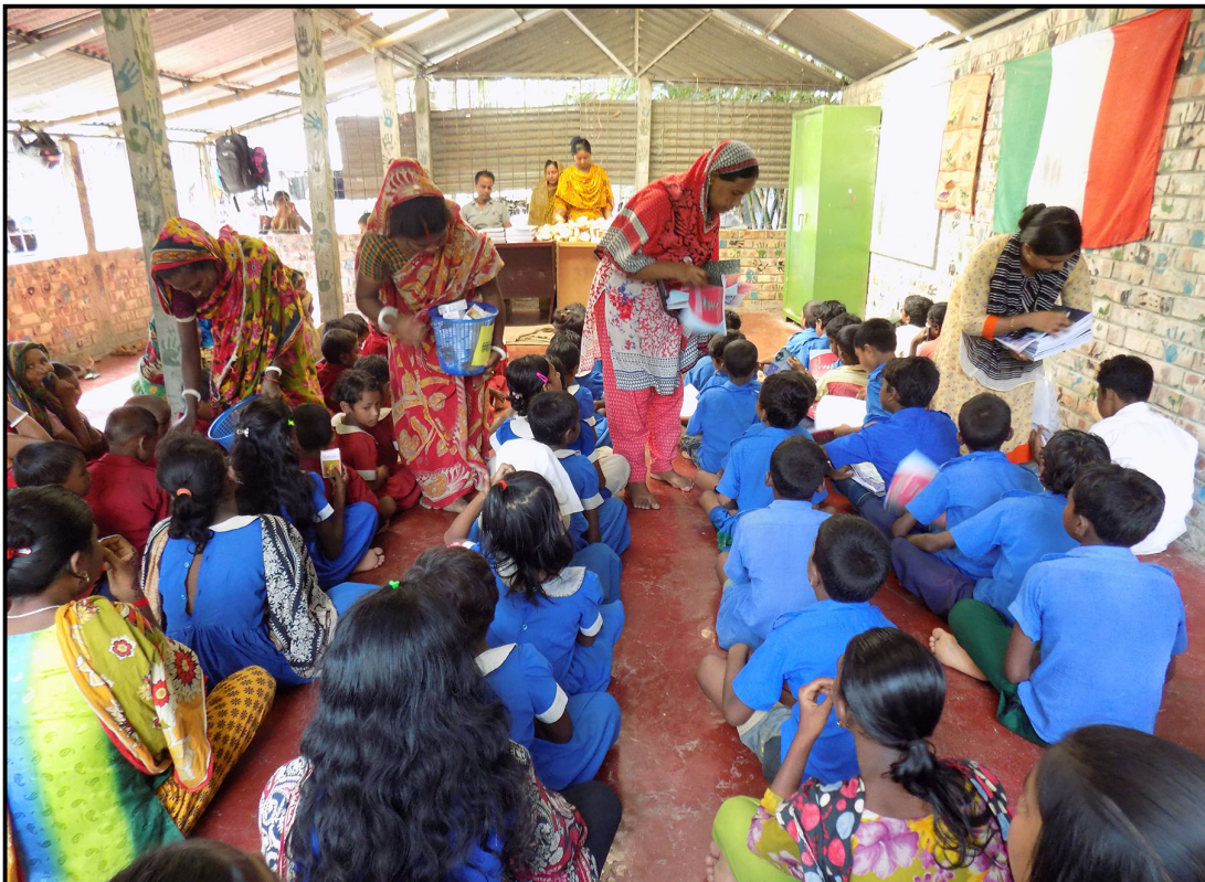
Materials distribution at Jogahati village...