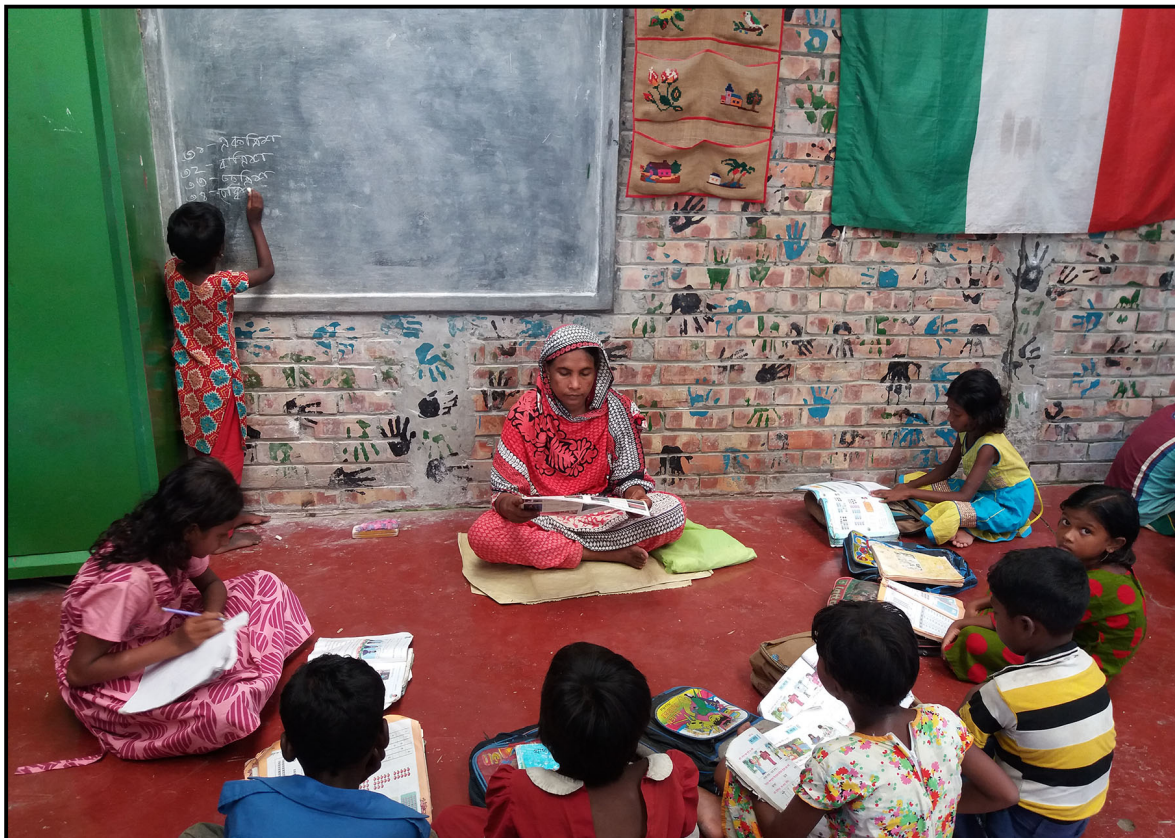
The tuition programme help the students to prepare for next day school class preparation...