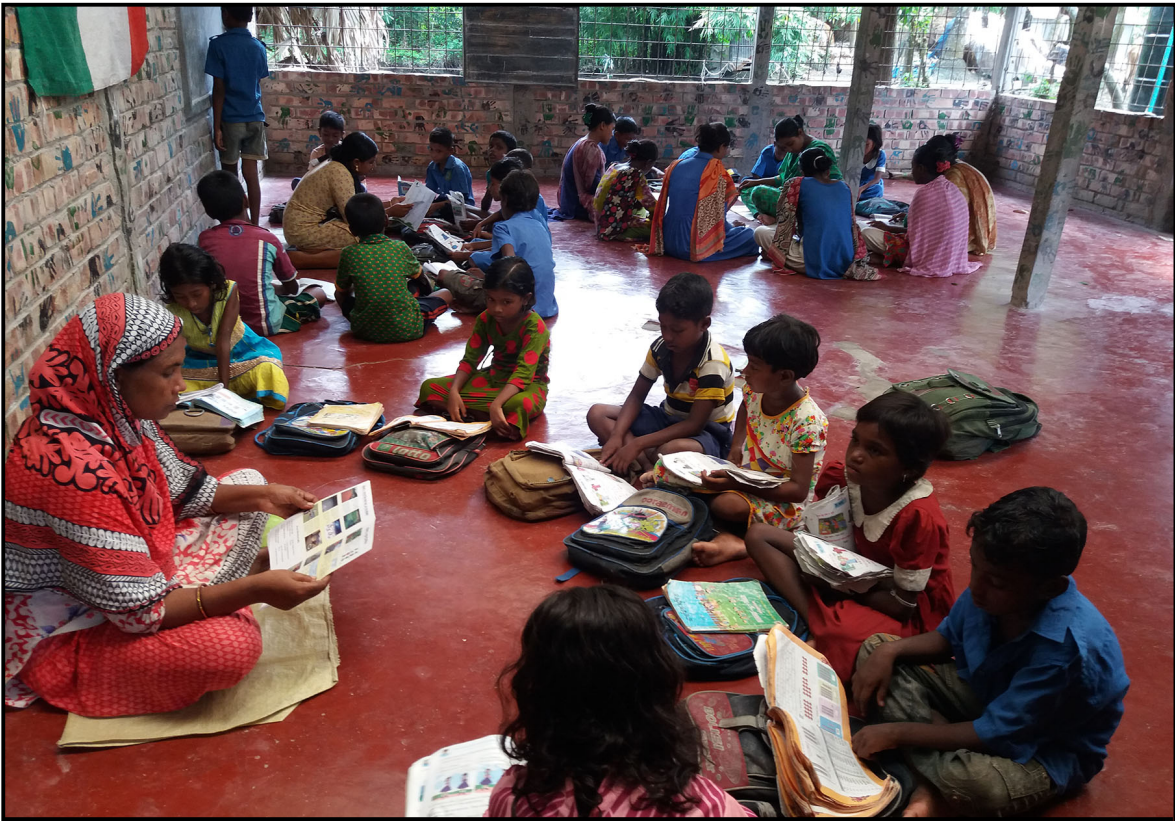
Teachers regularly take classes in two batch...