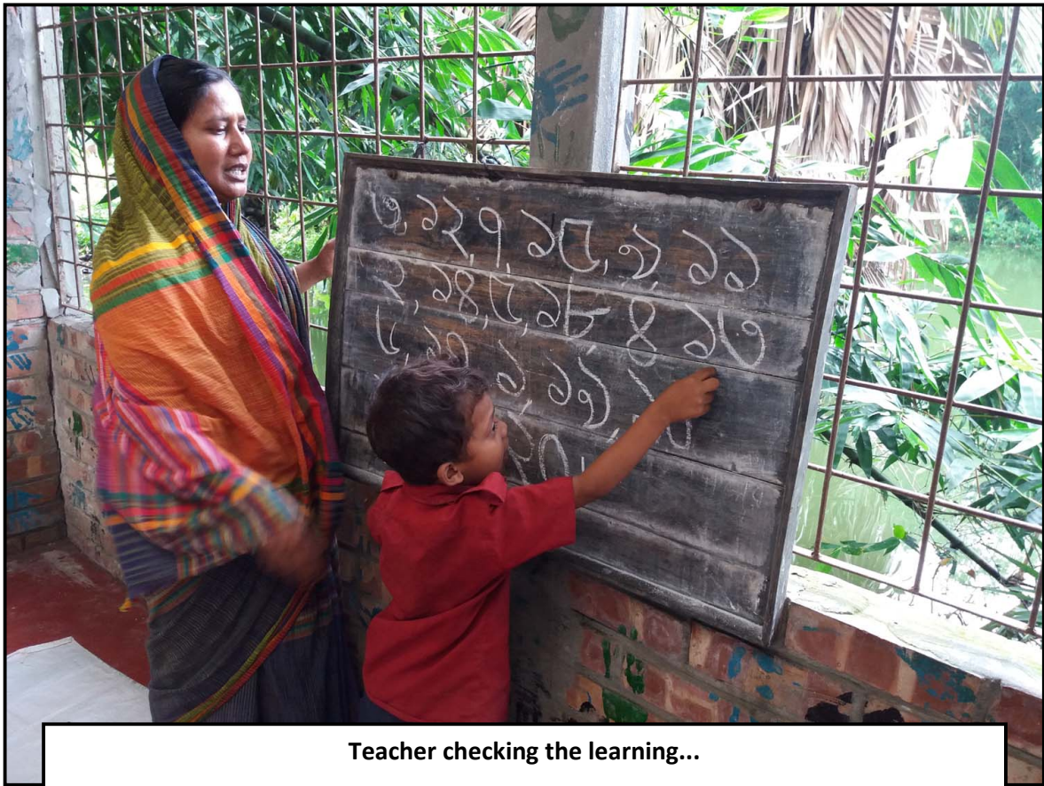
Teacher checking the learning...