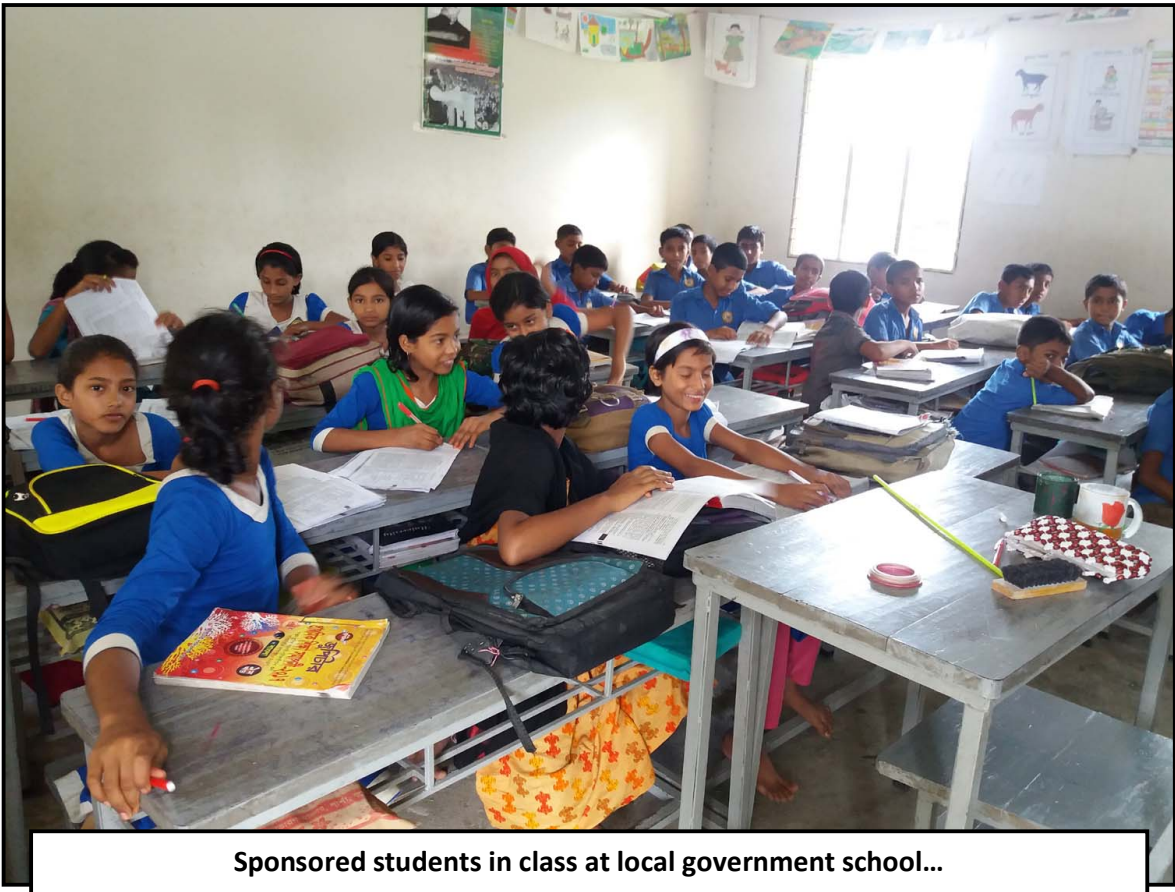
Sponsored students in class at local government school...