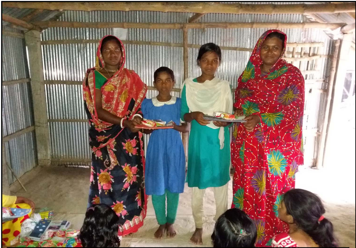
Materials distribution at Sorupdaho village...