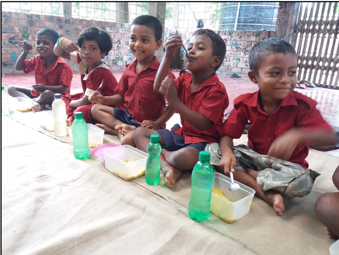
After class pre-school kids enjoying the warm meal...