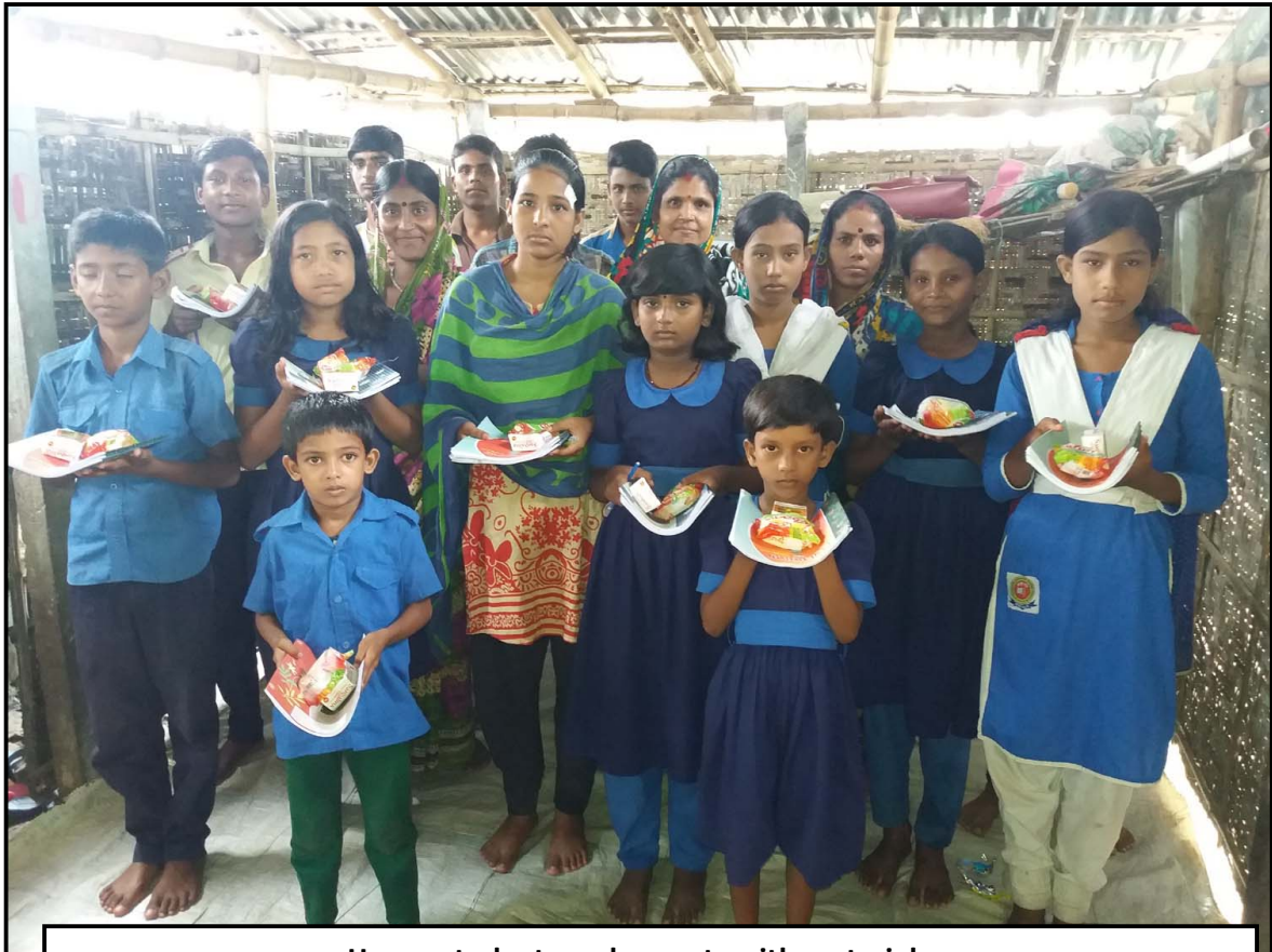
Happy students and parents with materials...