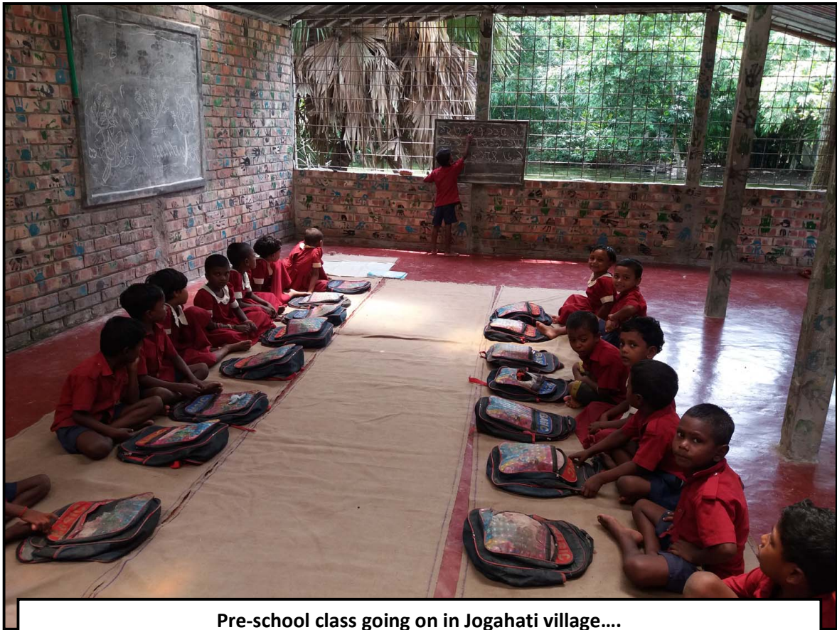
Pre-school class going on in Jogahati village...