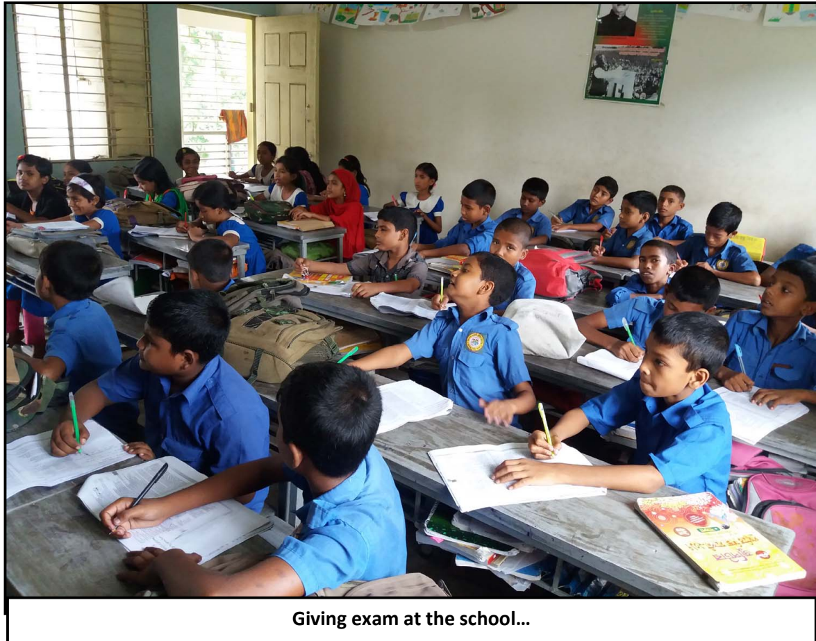
Giving exam at the school...