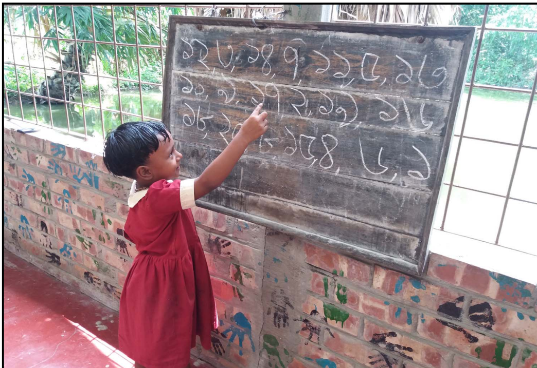
At the class pre-school student learning the numbers...