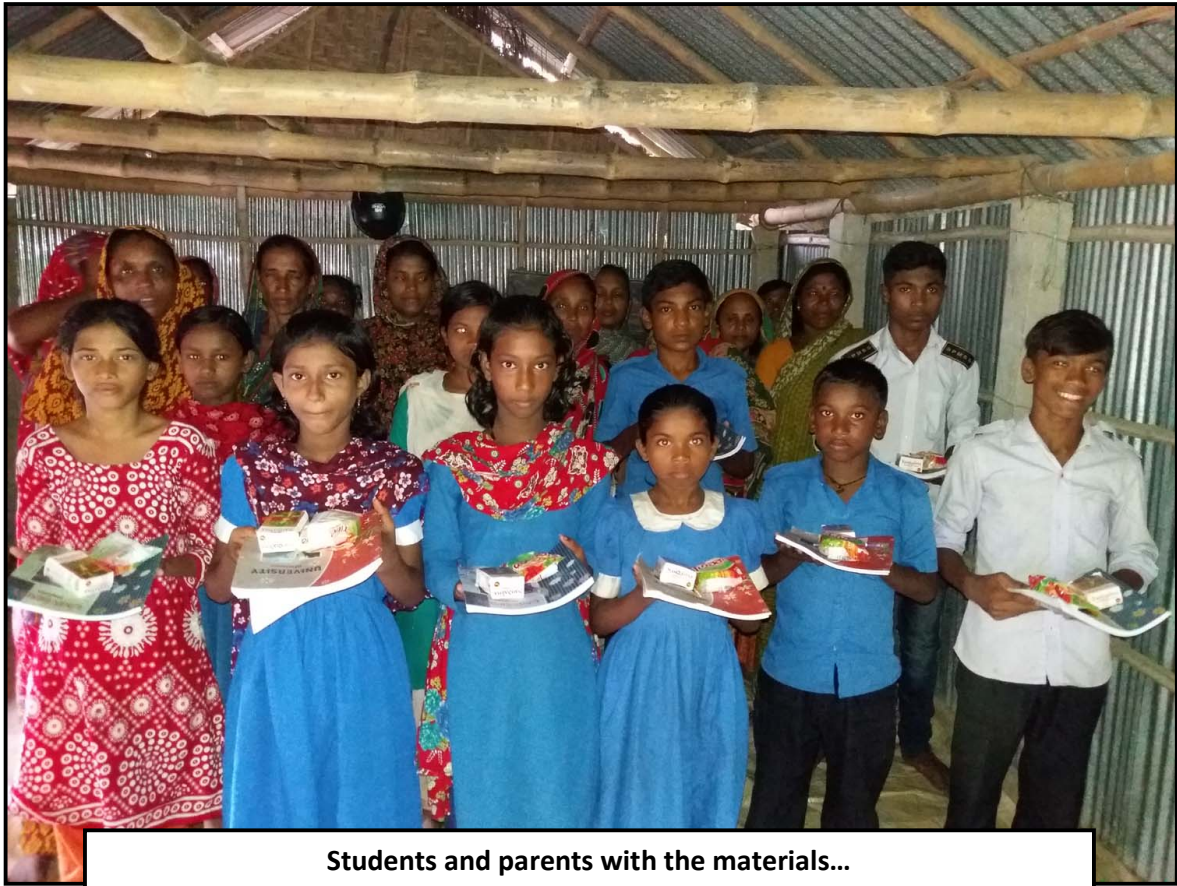
Students and parents with the materials...