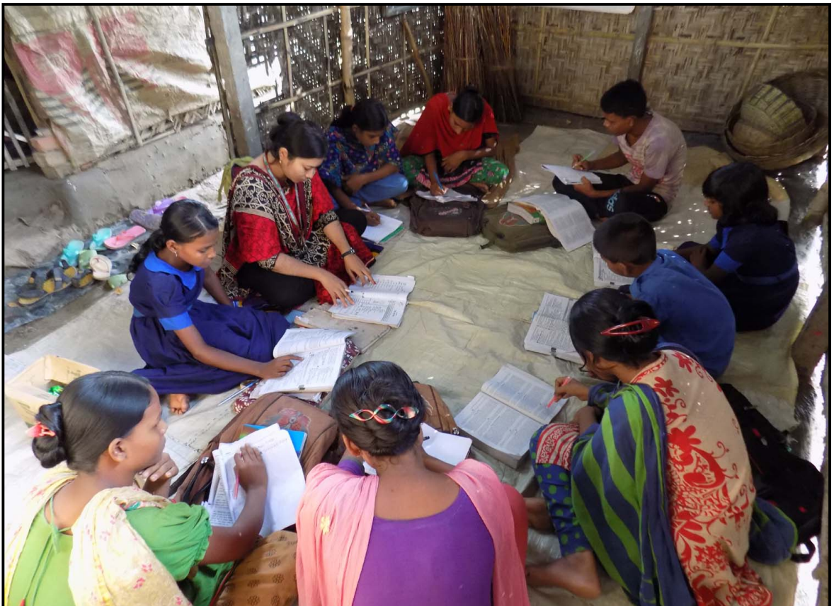
Tuition class at Churamankati village...