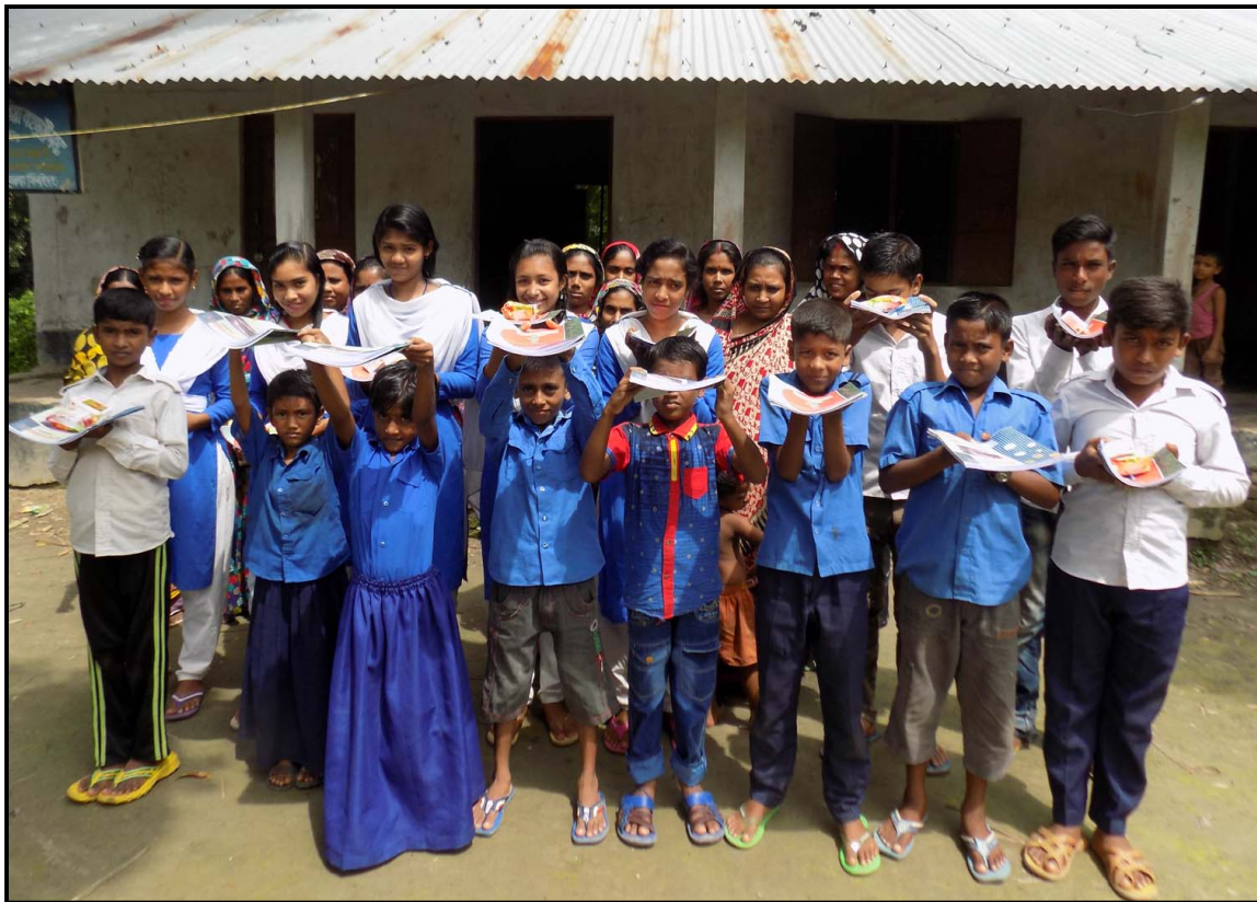
Children and parents with the materials...