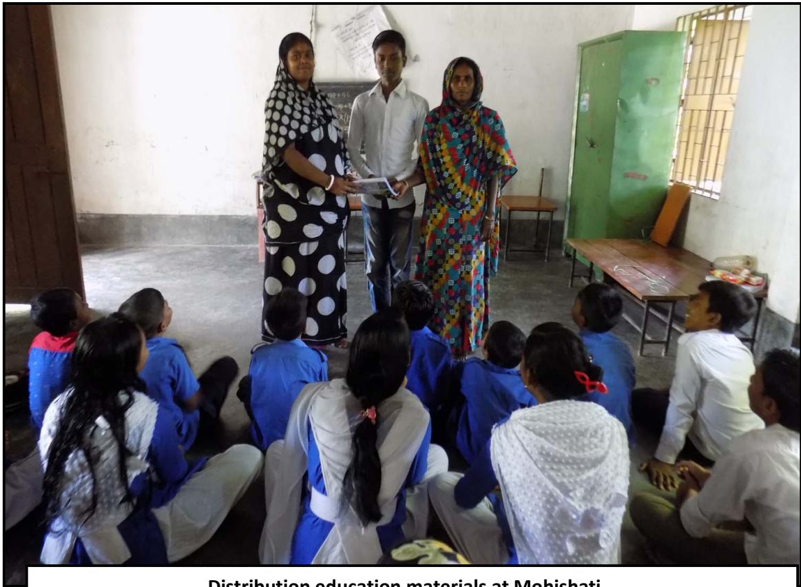
Distribution education materials at Mohishati...