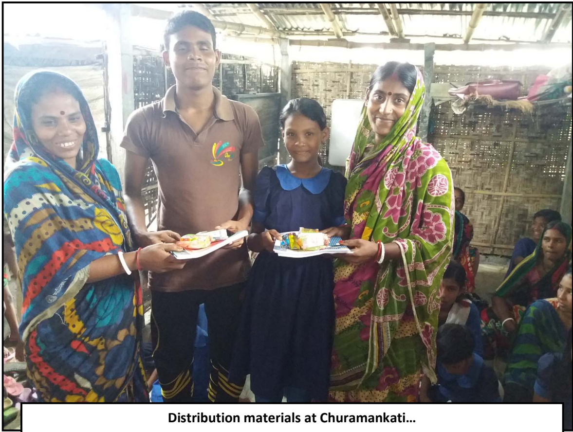
Distribution materials at Churamankati...