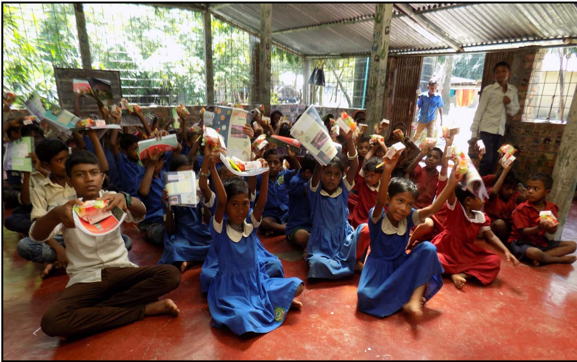
After education materials distribution at Jogahati village...