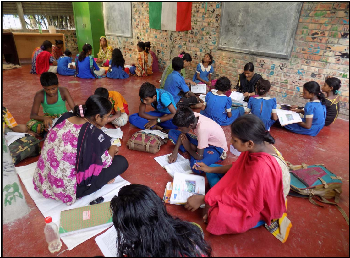
Tuition class going on in Jogahati village...