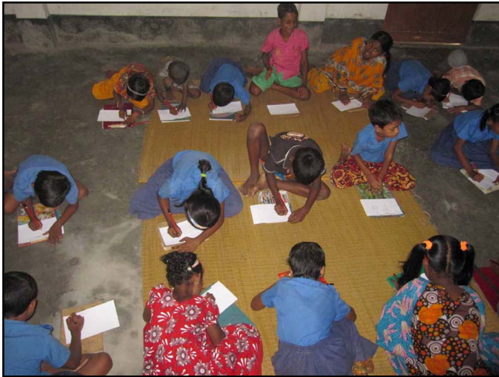
Students drawing in Mohishati