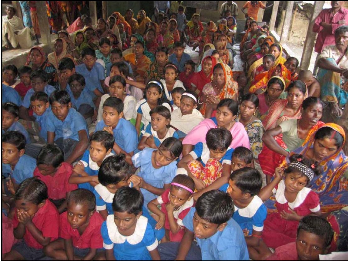
Waiting for the distribution in Jogahati..