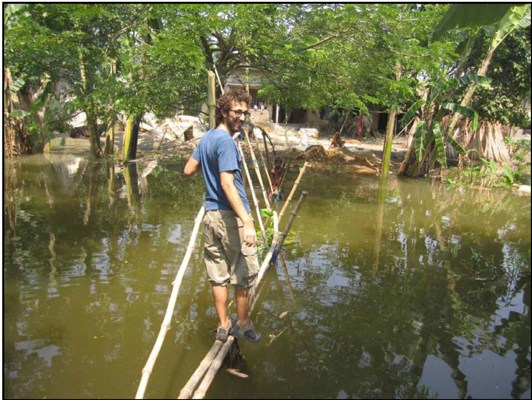
Preparing for an unscheduled dive..