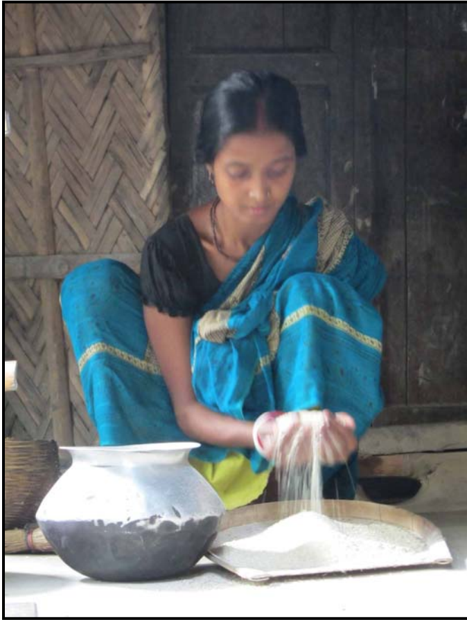
Preparing rice for lunch