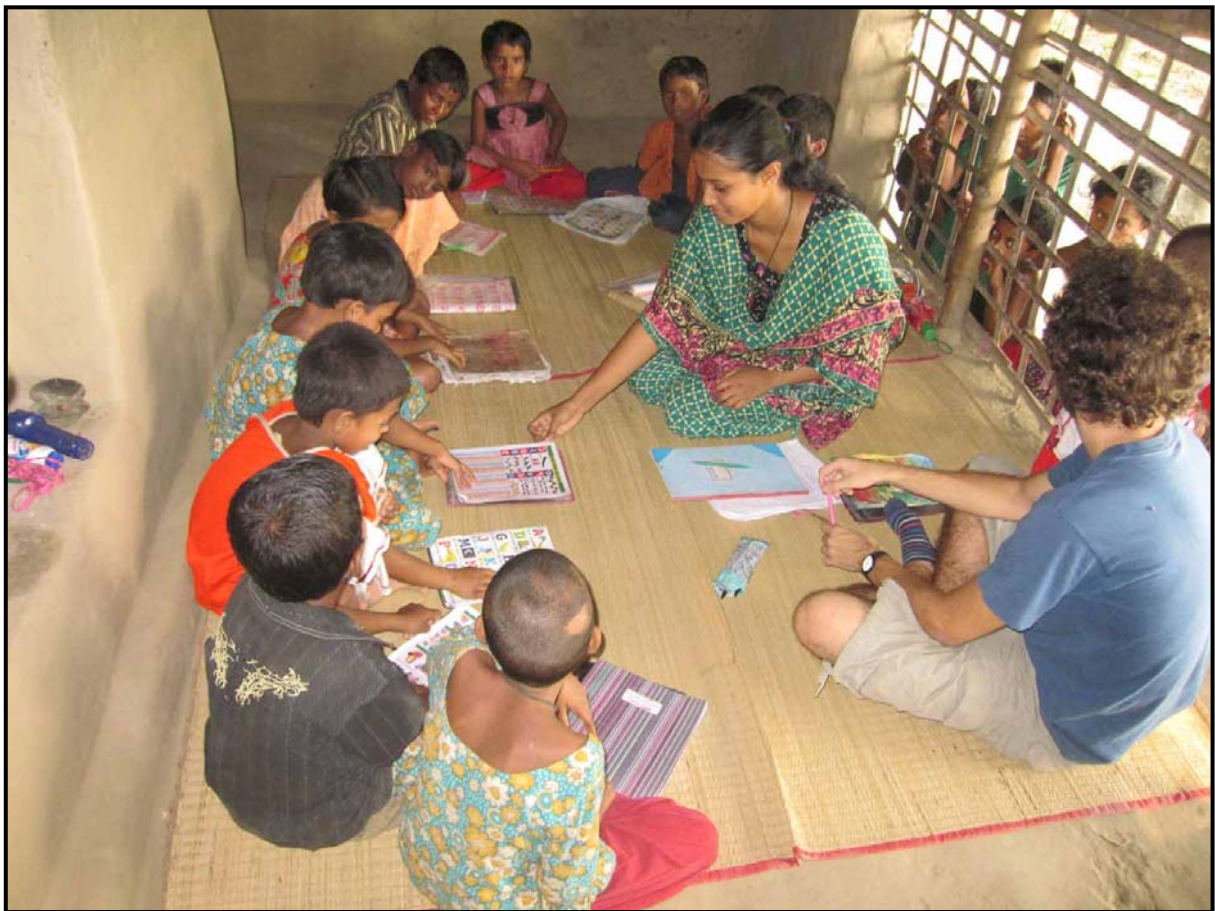
Tuition Programme in Sorupdaho