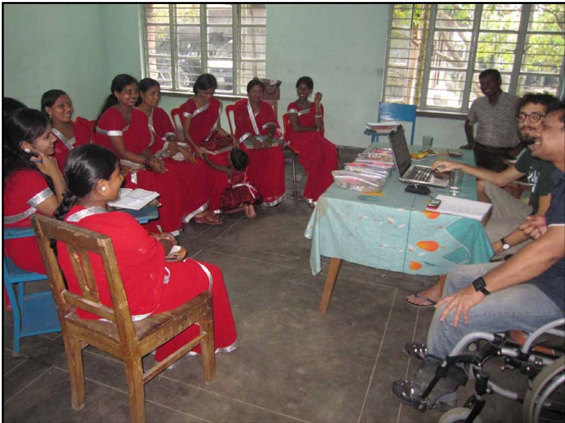
October Teacher's Meeting