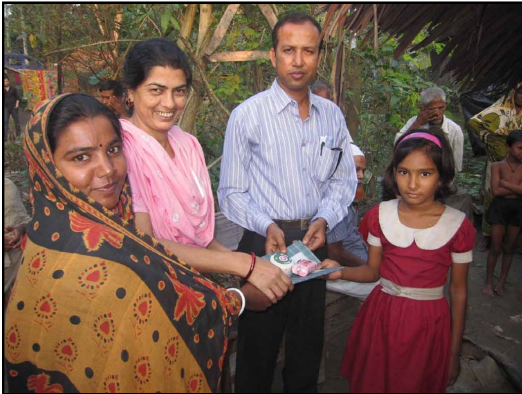
Fuli receiving educational material in Churamankati