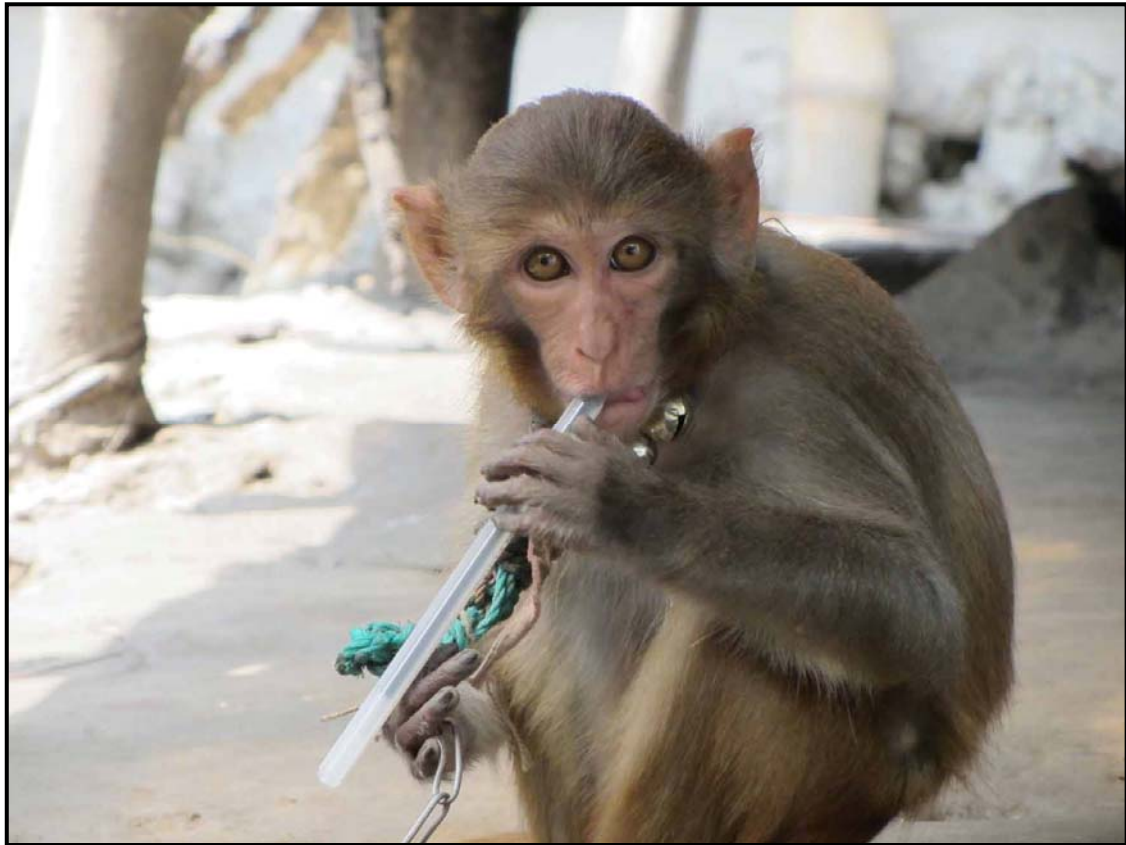
“Education for All”: we mean it!