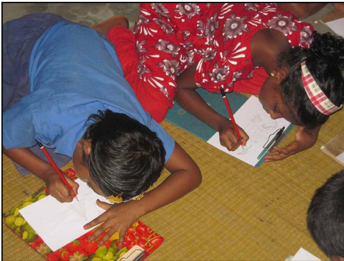
The Art Competition in Mohishati. Drawings are taking shapes..