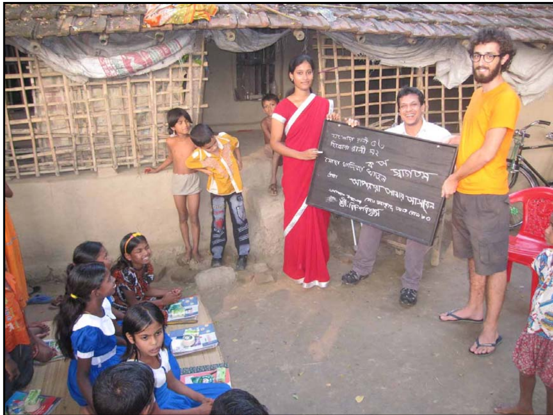
Distribution of the new blackboard in Sorupdaho