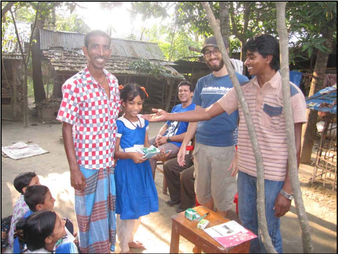
Boishaki receiving educational material in Lolitadaho