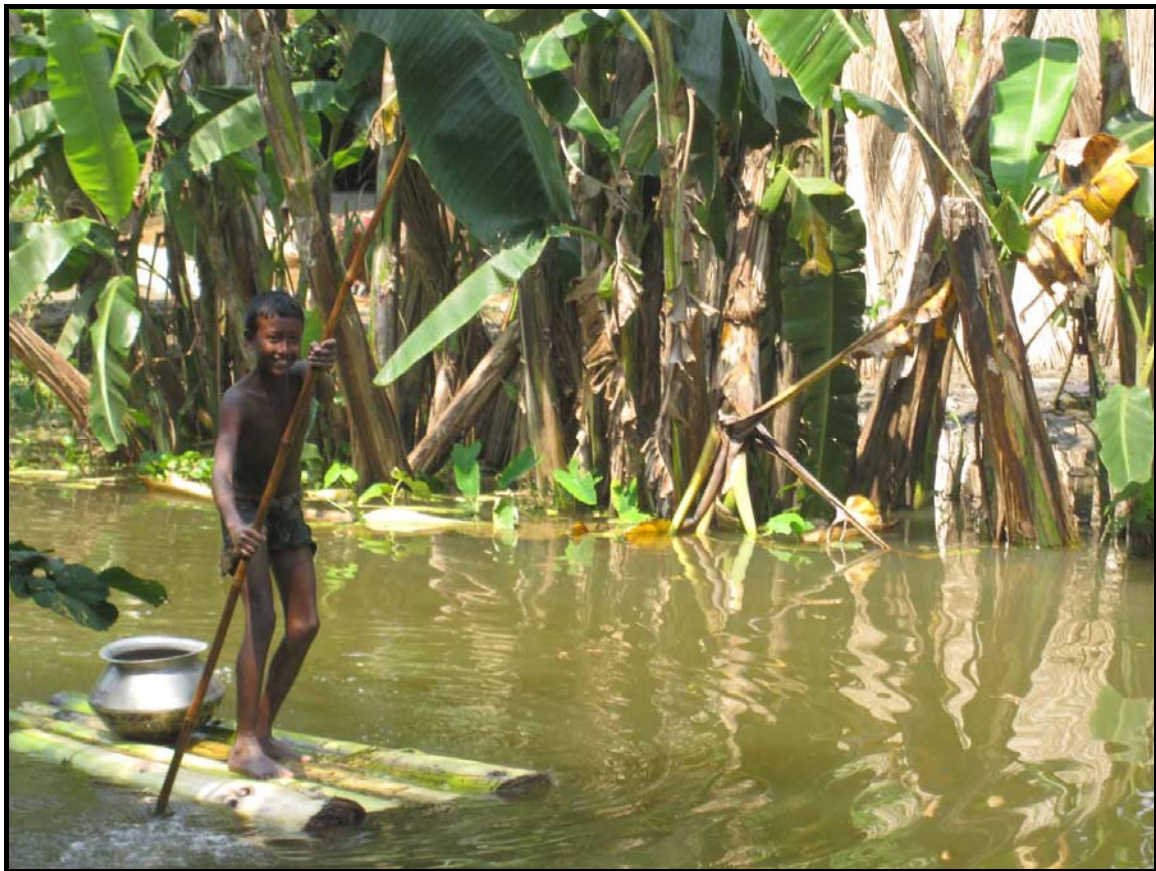
Playing in the Sorupdaho river