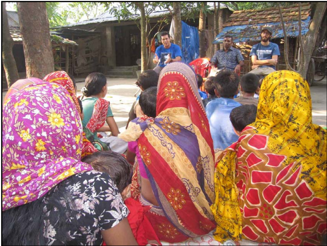
A moment of discussion in Lolitadaho