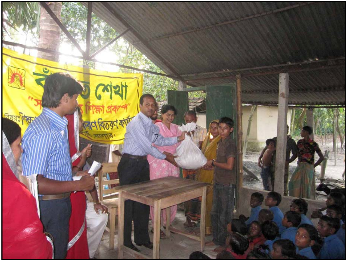
Jogahati Food Distribution