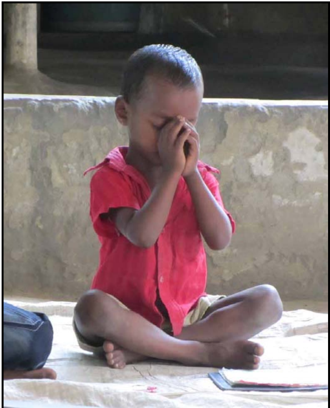
A moment of “praying” in Jogahati Pre School