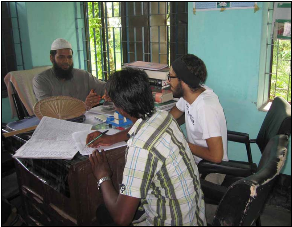
Community Motivator collecting datas in Shamnogor Girls School