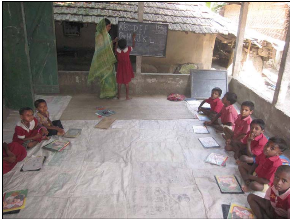
Jogahati Pre School