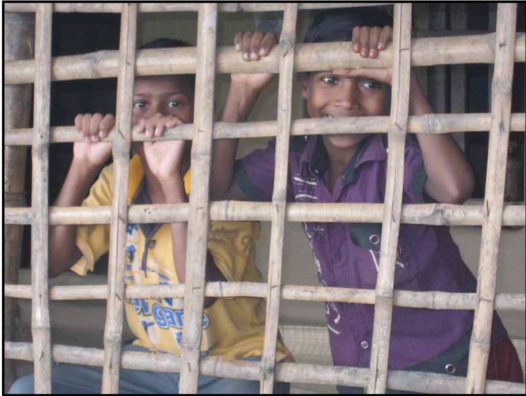
Waiting for the starting of Tuition Programme in Sorupdaho