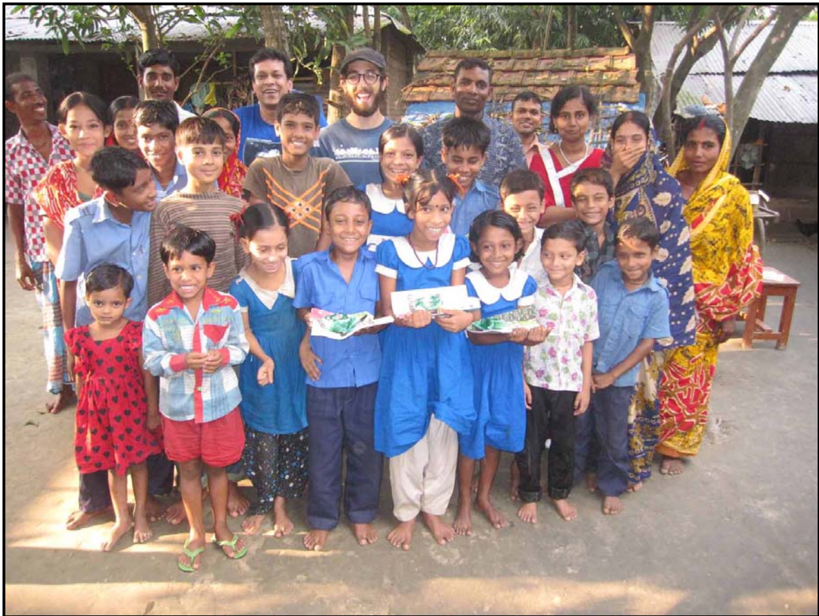
Students in Lolitadaho after material distribution