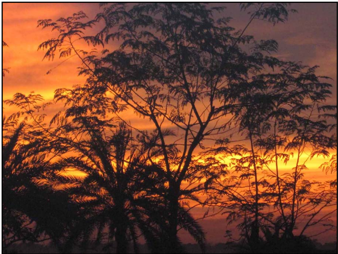
Breathtaking Sunset on the road to Jogahati