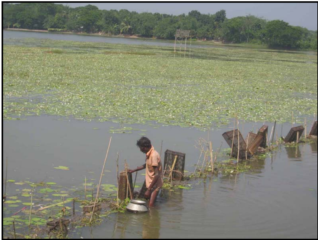
Fishing in the Jogahati water reserve