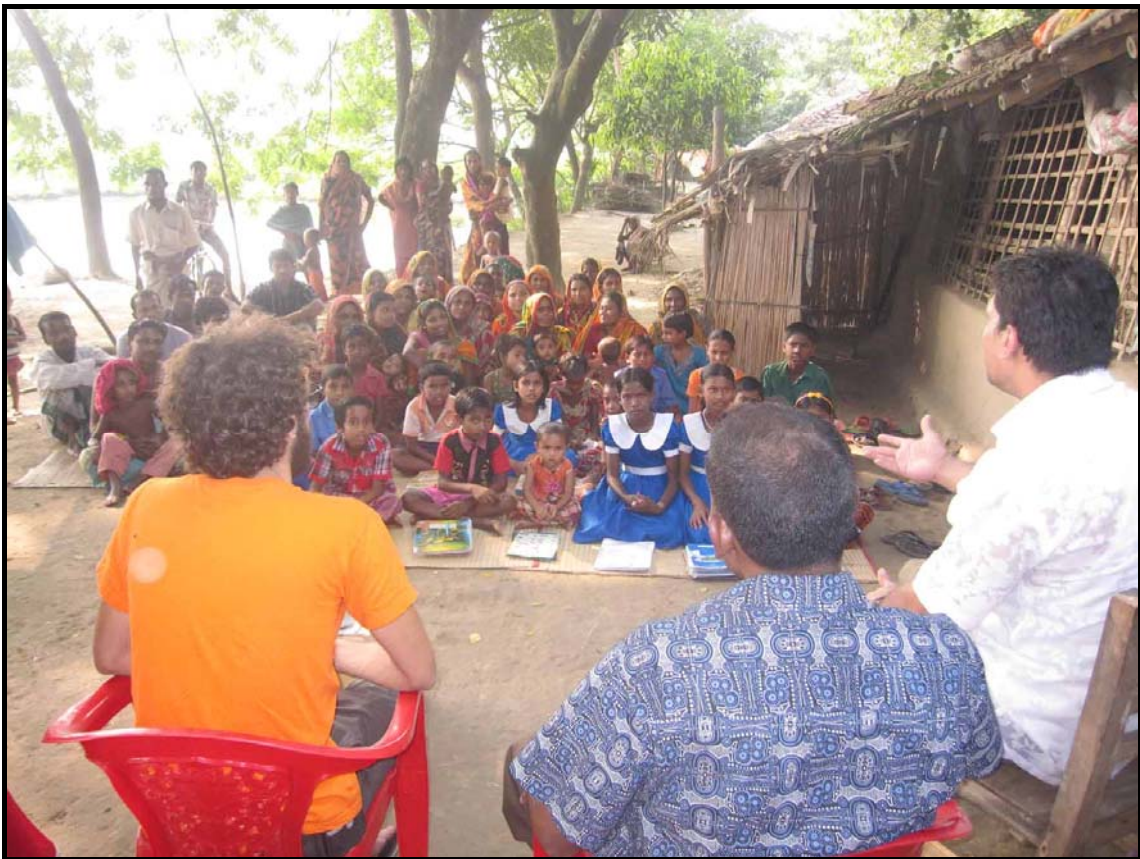
A project "debate" session at Shorupdao