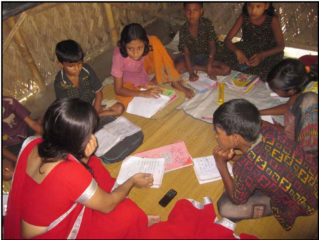
Churamankati Tuition Programme