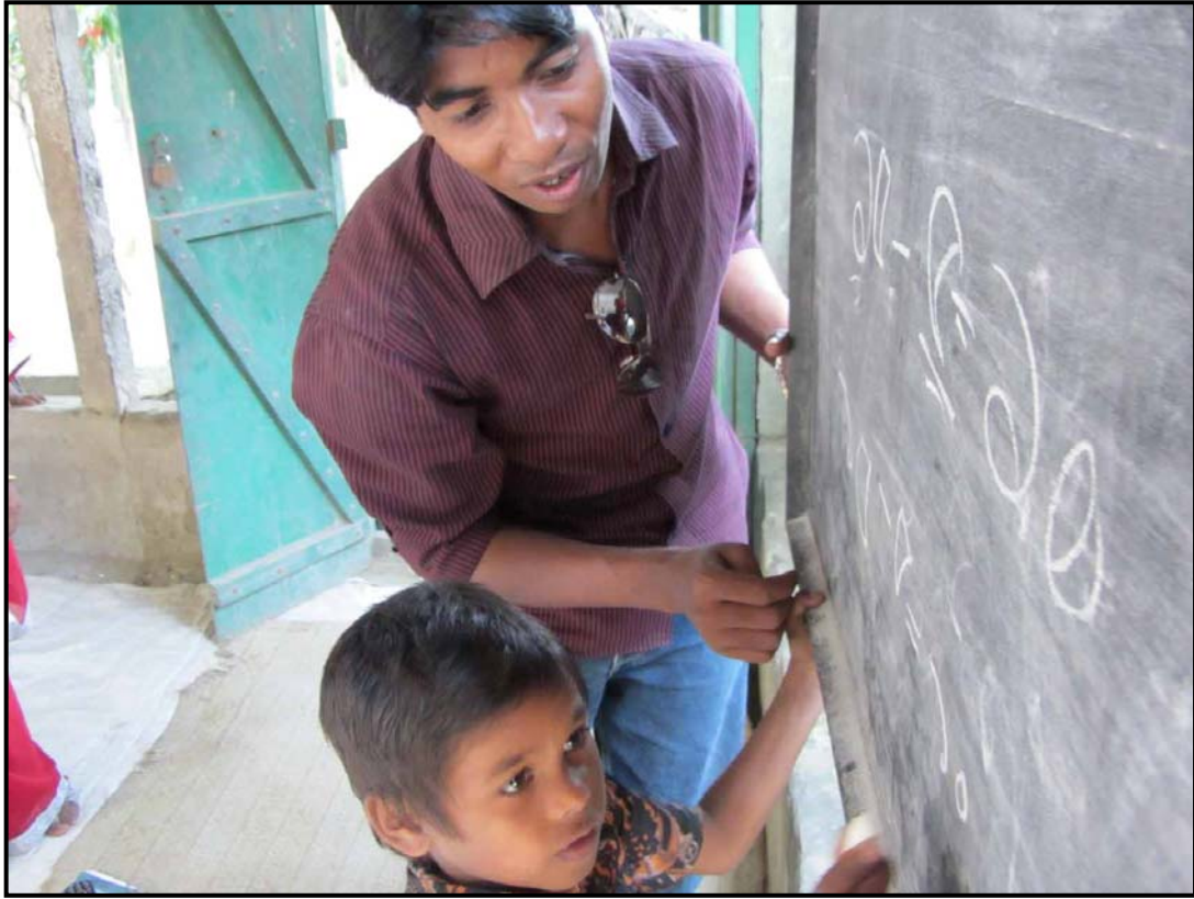
Community Motivator teaching Math in Jogahati Pre School