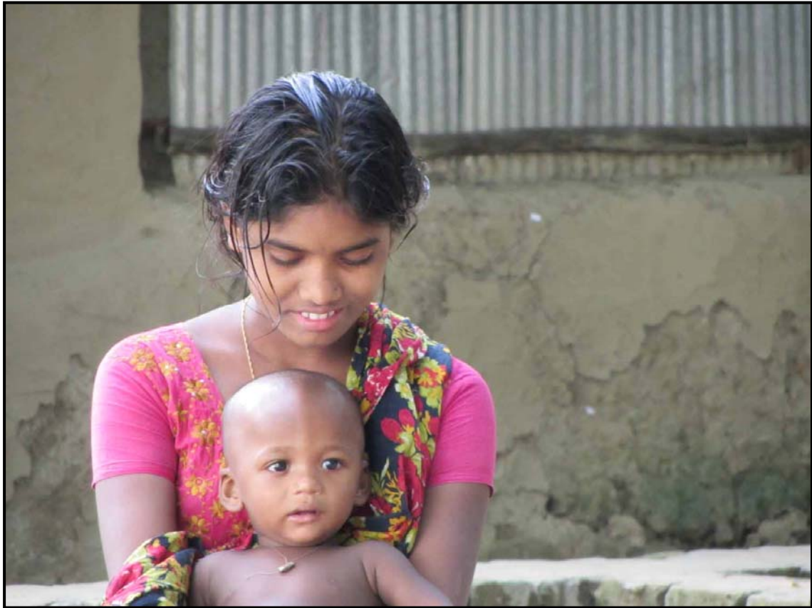
A young mom with her son in Sorupdaho