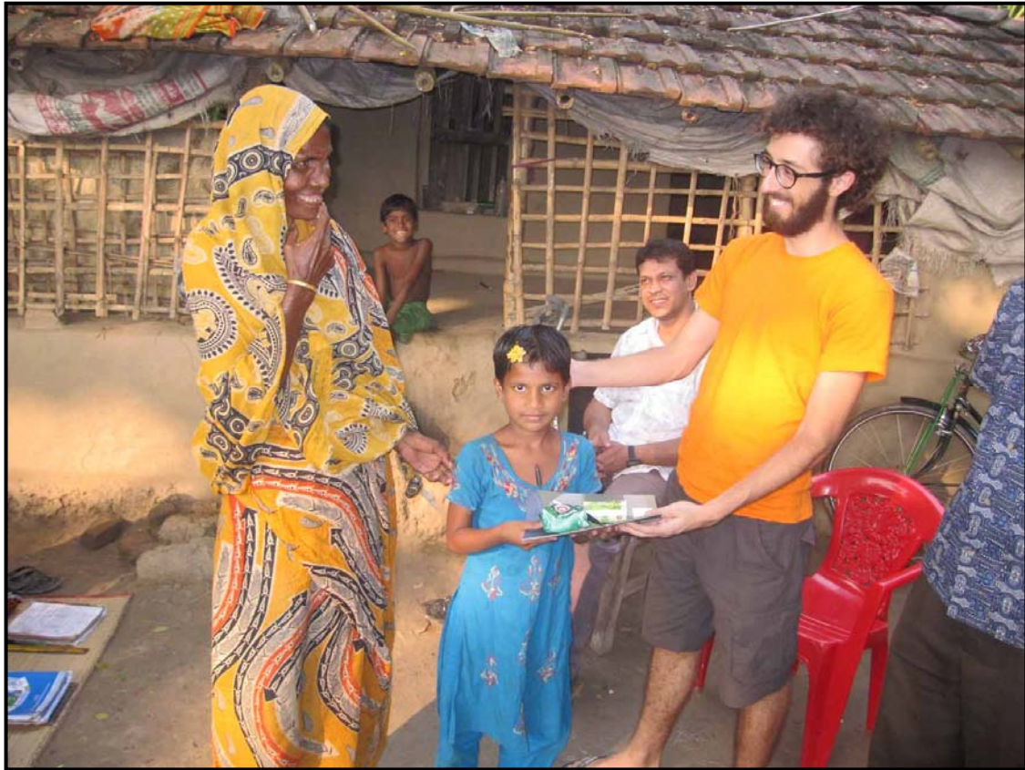
Hazera receiving materials in Sorupdaho